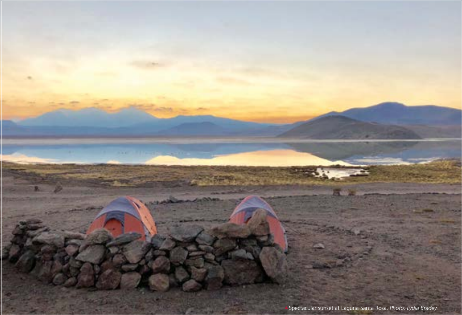
• Spectacular sunset at Laguna Santa Rosa.