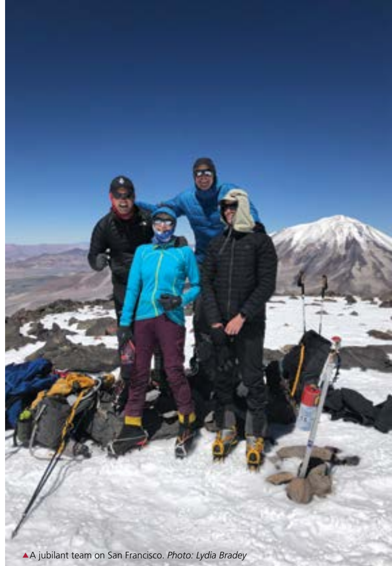
▲ A jubilant team on San Francisco.

your needs and how this will work in the group cooking situation. If your dietary requirements are especially strict, you are advised to bring a sufficient supply of your required food types with you to ensure you are provided for.