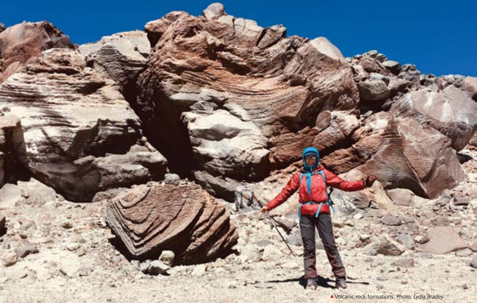
▲ Volcanic rock formations.