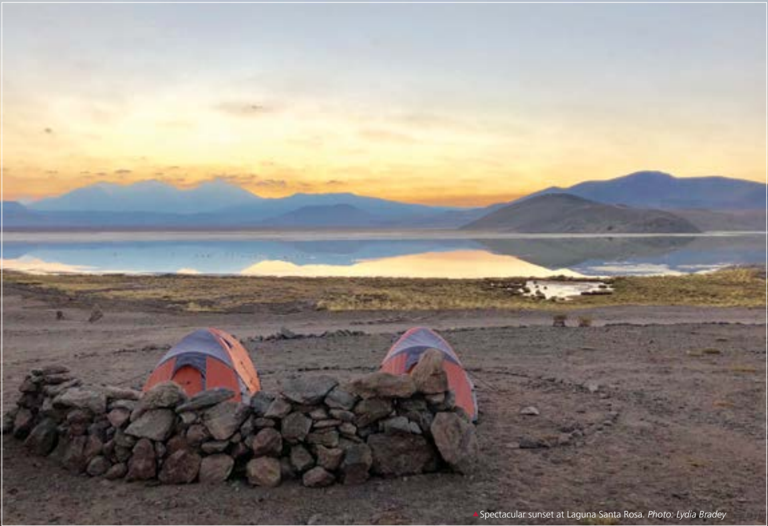
▲ Spectacular sunset at Laguna Santa Rosa.