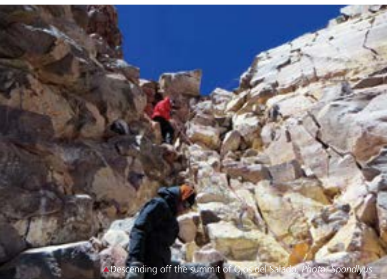
▲ Descending off the summit of Ojos del Salado.