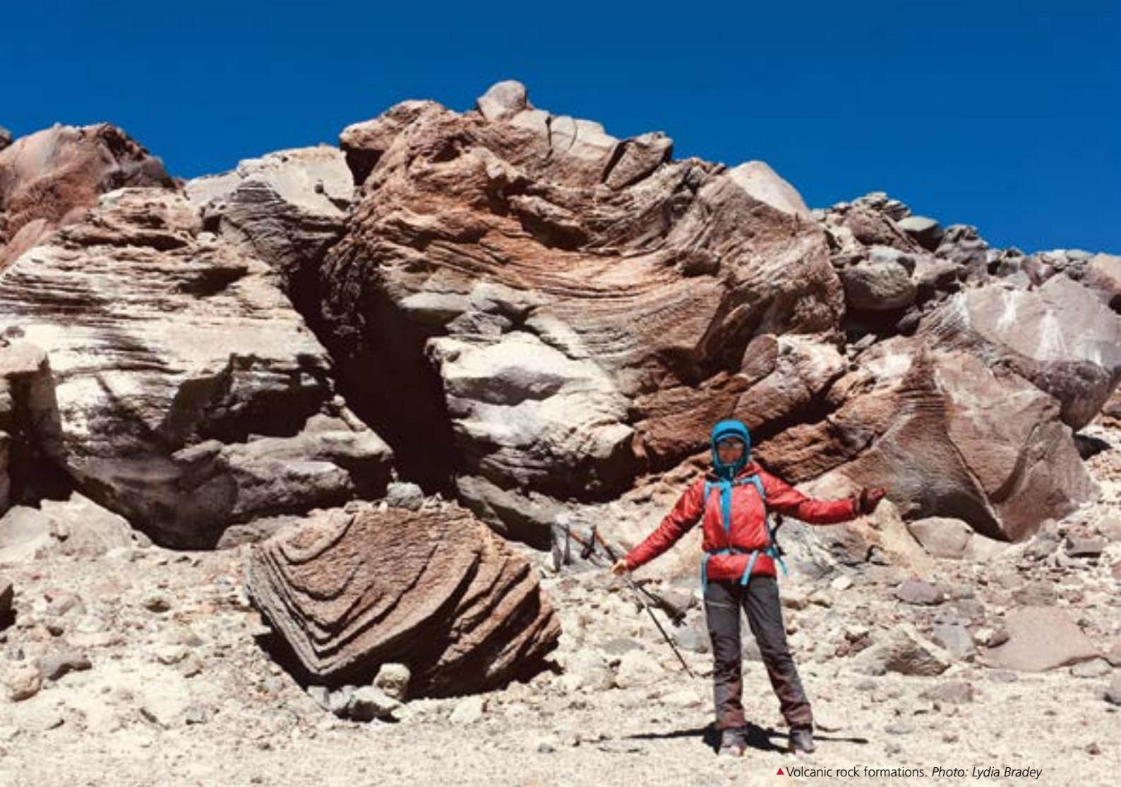
▲ Volcanic rock formations.