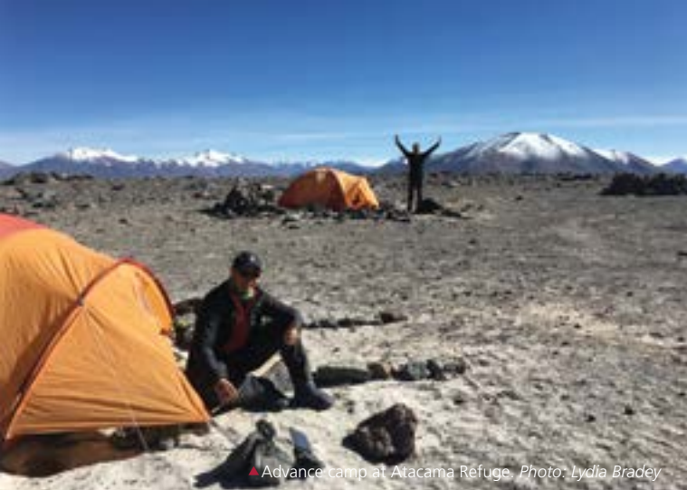
▲ Advance camp at Atacama Refuge.