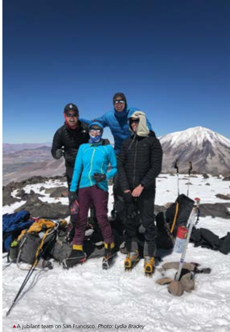
▲ A jubilant team on San Francisco.

your needs and how this will work in the group cooking situation. If your dietary requirements are especially strict, you are advised to bring a sufficient supply of your required food types with you to ensure you are provided for.