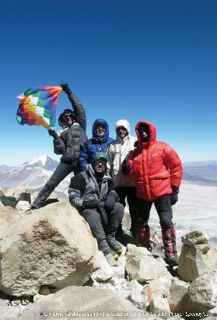
▲ Climbers celebrate summit success on Ojos del Salado.