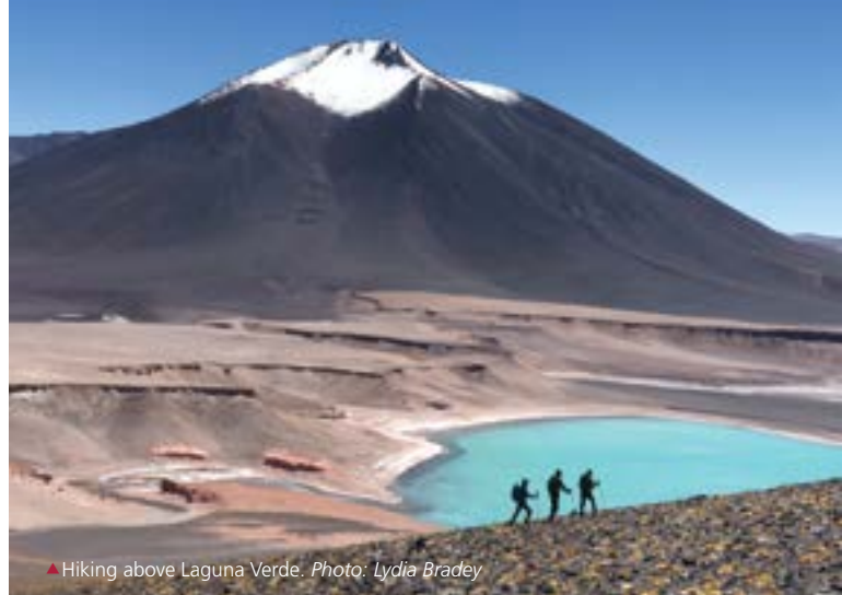
▲ Hiking above Laguna Verde.