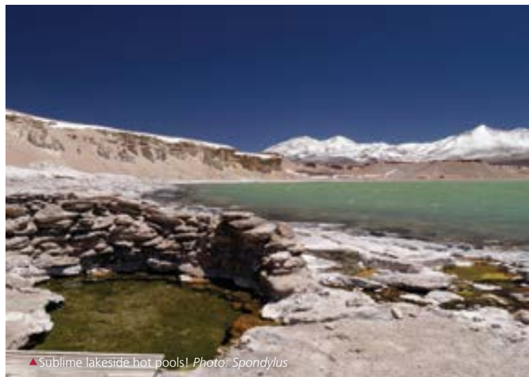
▲ Sublime lakeside hot pools!

expedition. Importantly, participants should have a positive frame of mind and be willing to operate as part of a team.