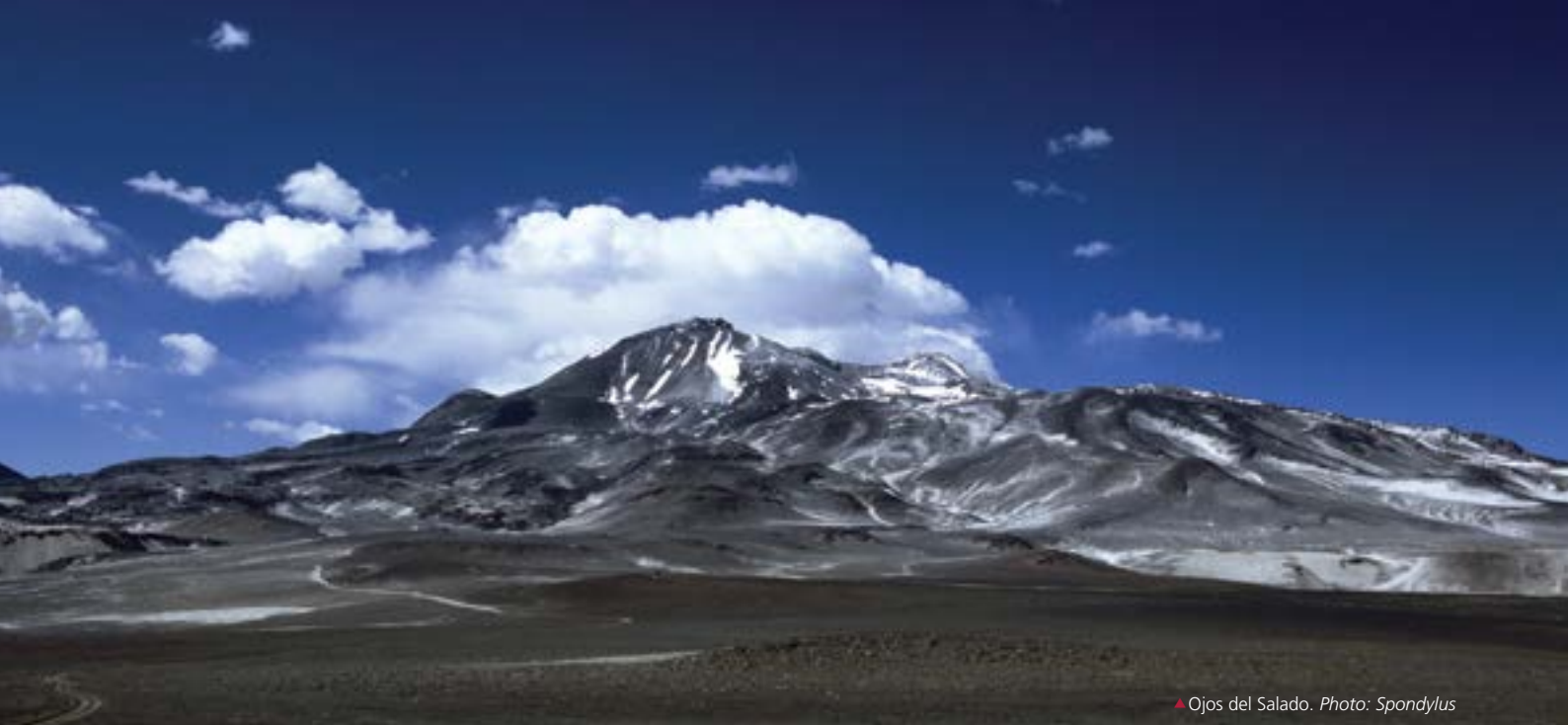
▲ Ojos del Salado.