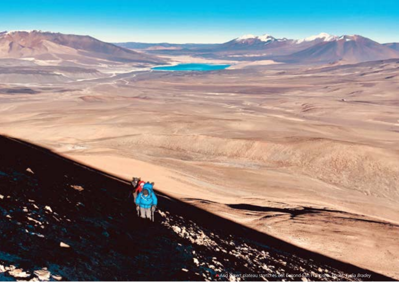
▲ Arid desert plateau stretches out beyond San Francisco.