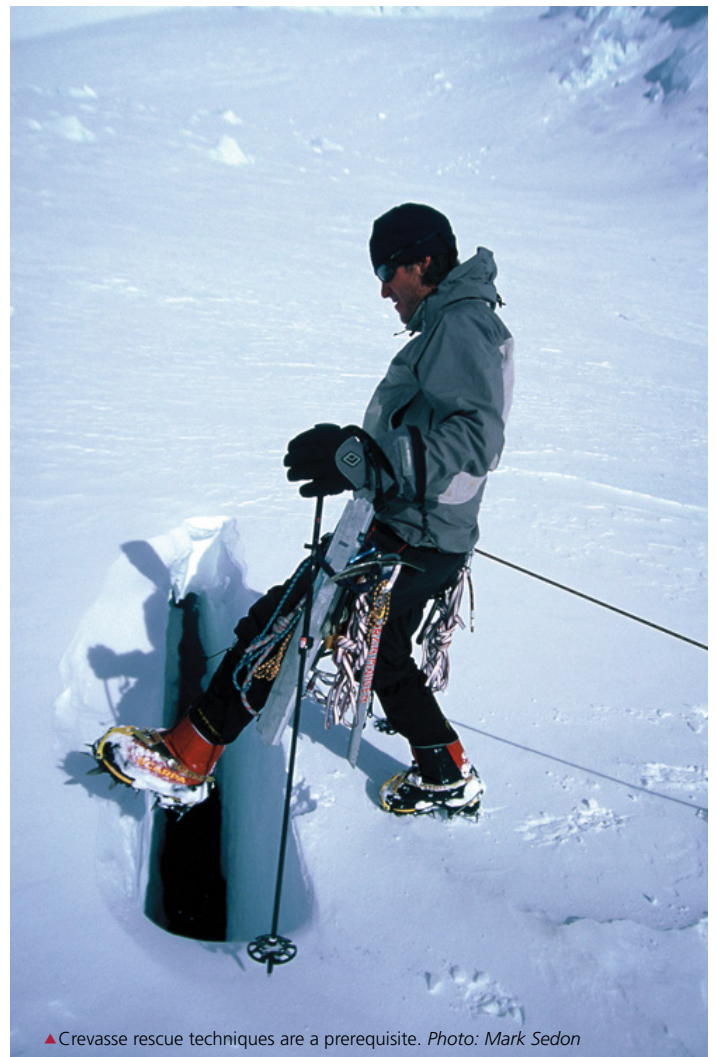
▲ Crevasse rescue techniques are a prerequisite.

Back carry the cache at 4,150m/13,600ft.