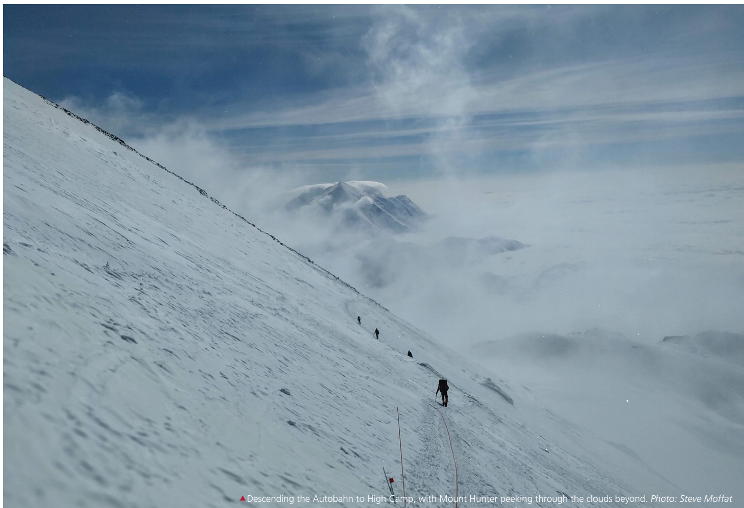
▲ Descending the Autobahn to High Camp, with Mount Hunter peeking through the clouds beyond.

Quick Stats: The descent from High Camp back to Base Camp will cover 22.5km/14mi and 3,000m/9,800ft of elevation loss. The last half-mile (800m) back to Base Camp is uphill (Heart Break Hill) and we will have to gain about 180m/600ft before reaching Base Camp.