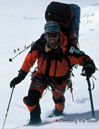
▲ Climbing the lower flanks of Denali's West Buttress Route.

Denali, "The High One", is the highest mountain in North America. Located in Alaska at latitude 63 degrees north, 630km/390mi from the Arctic Circle, the summit is at 6,190m/20,310ft. Denali is one of the much sought after "Seven Summits".