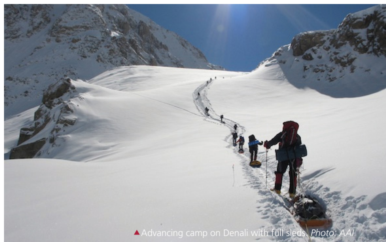
▲ Advancing camp on Denali with full sleds.

We need to be back at the landing strip by no later than 6 am on the morning of Day 21 of the trip.