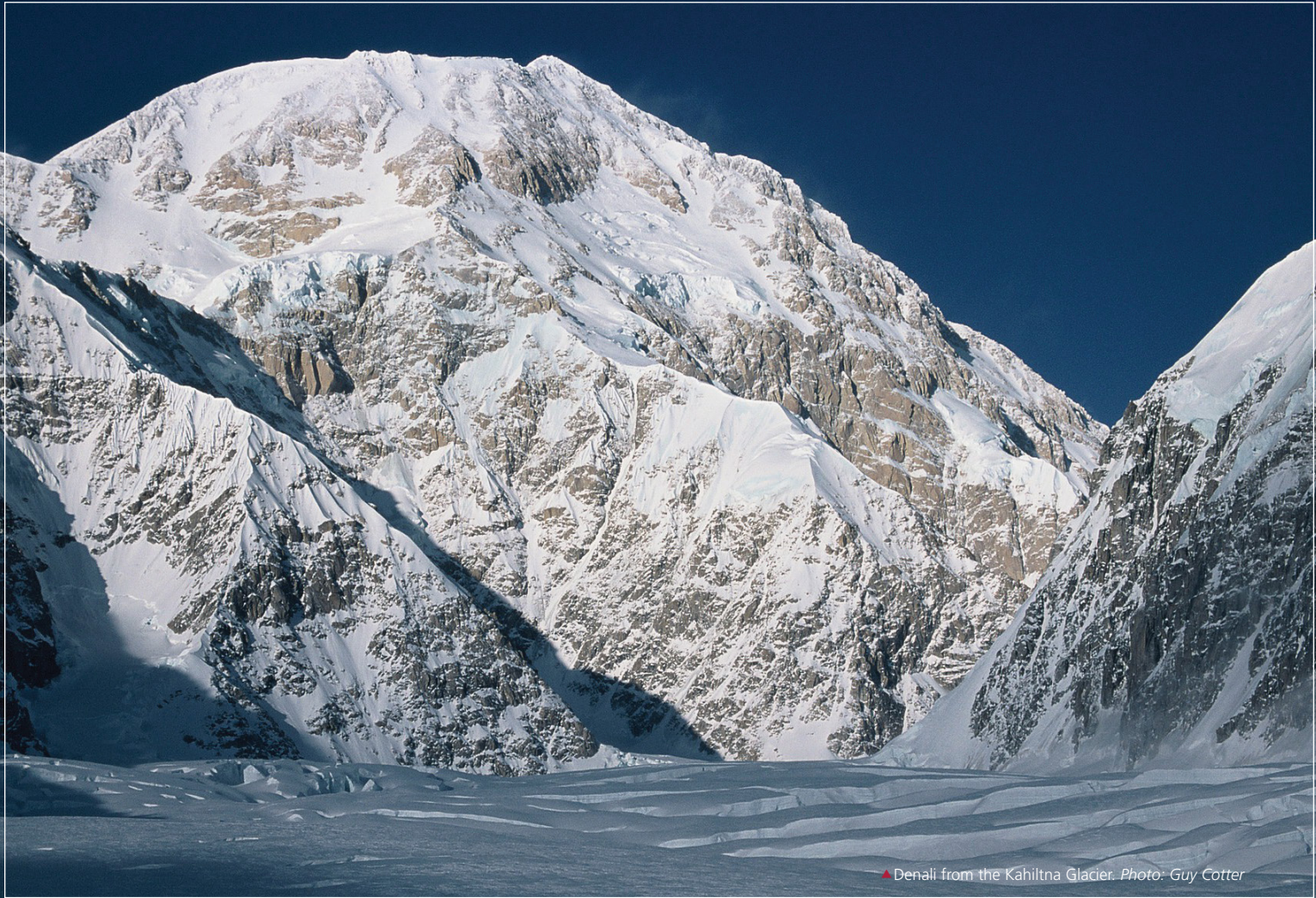
▲ Denali from the Kahiltna Glacier.