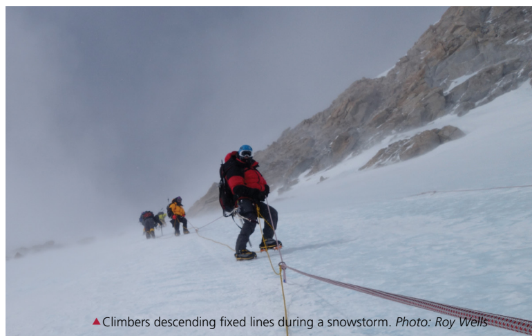
▲ Climbers descending fixed lines during a snowstorm.