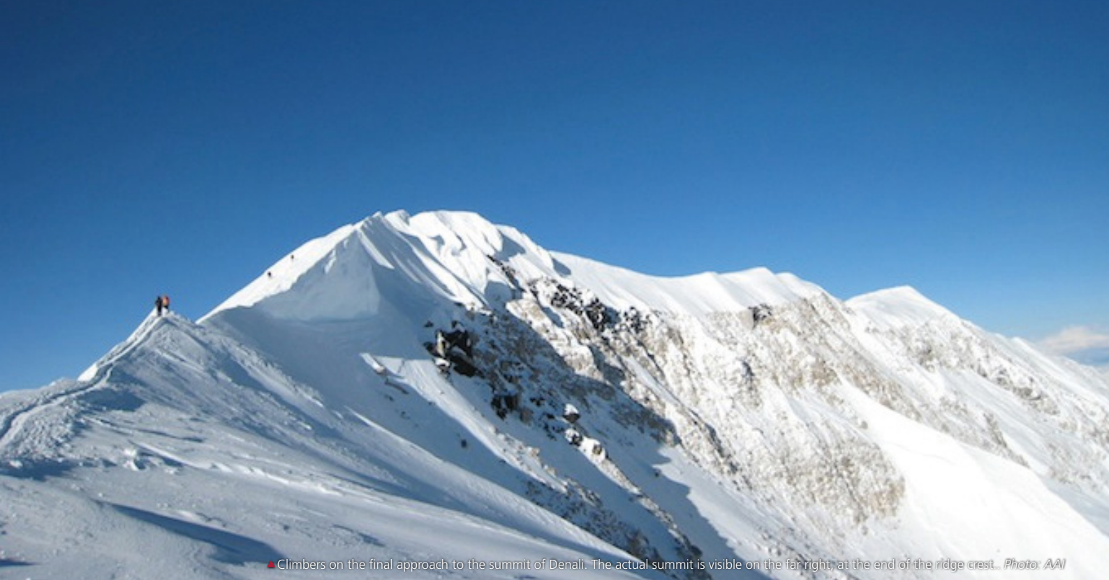
▲ Climbers on the final approach to the summit of Denali. The actual summit is visible on the far right, at the end of the ridge crest.

authorized concessionaire of Denali National Park and Preserve. All prices are subject to change without notice.