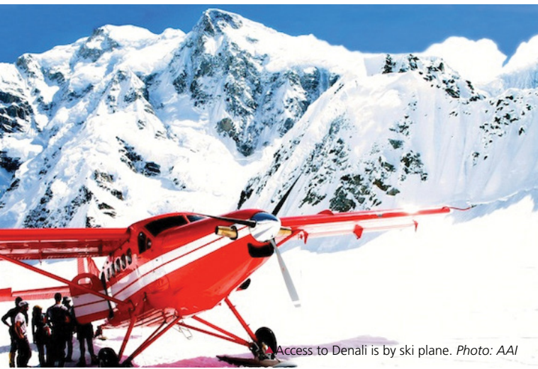
▲ Access to Denali is by ski plane.

Quick Stats: 6.4km/4mi, 1,100m/3,400ft of elevation gain.