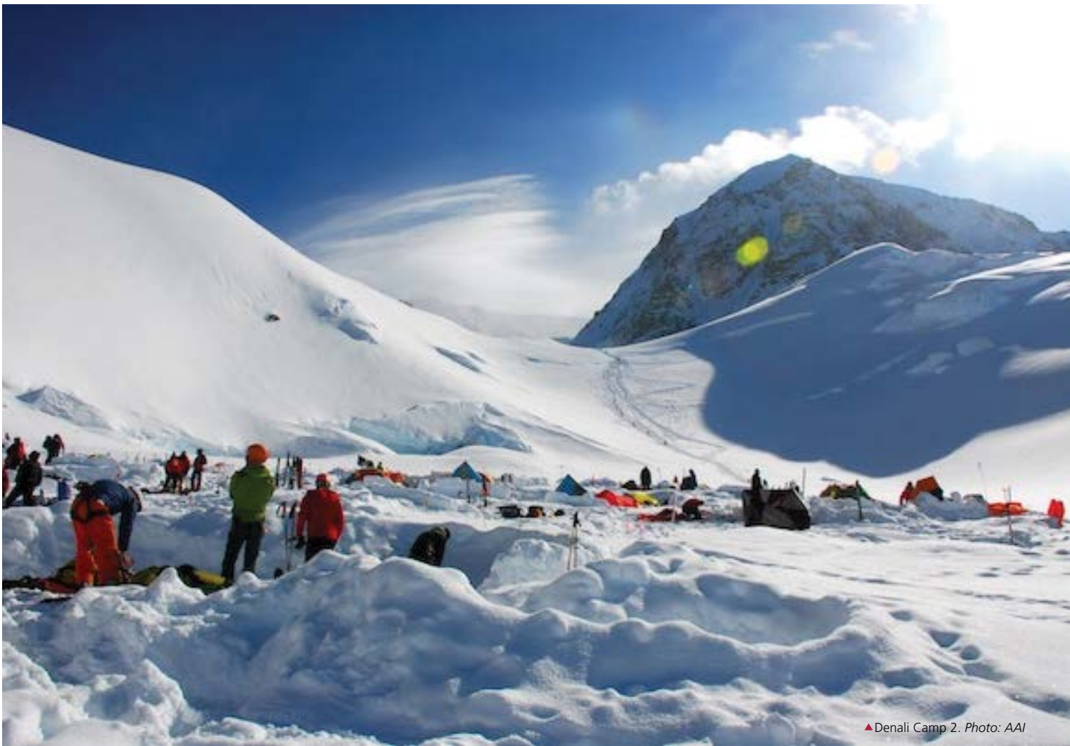
▲ Denali Camp 2.