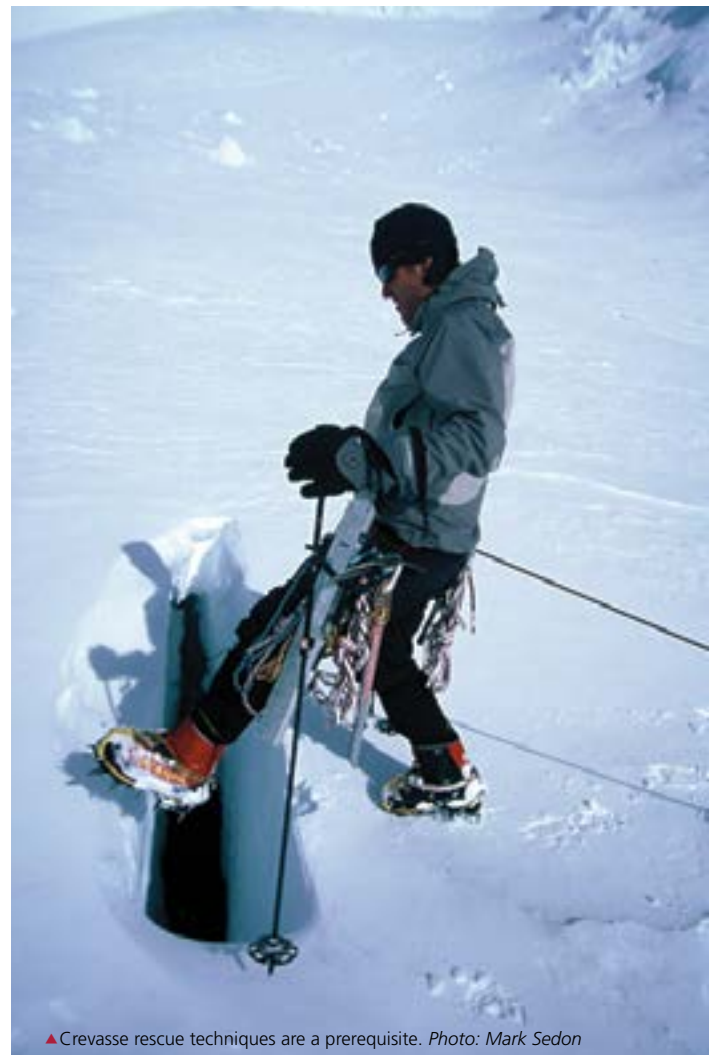
▲ Crevasse rescue techniques are a prerequisite.