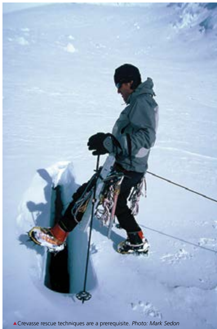
▲ Crevasse rescue techniques are a prerequisite.