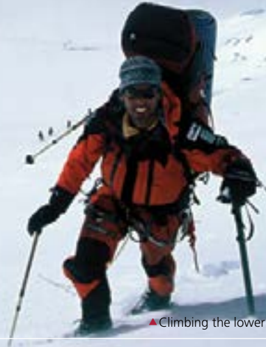
▲ Climbing the lower flanks of Denali's West Buttress Route.

Duration: 21 days Departure: Talkeetna, Alaska Price: US$11,995 per person