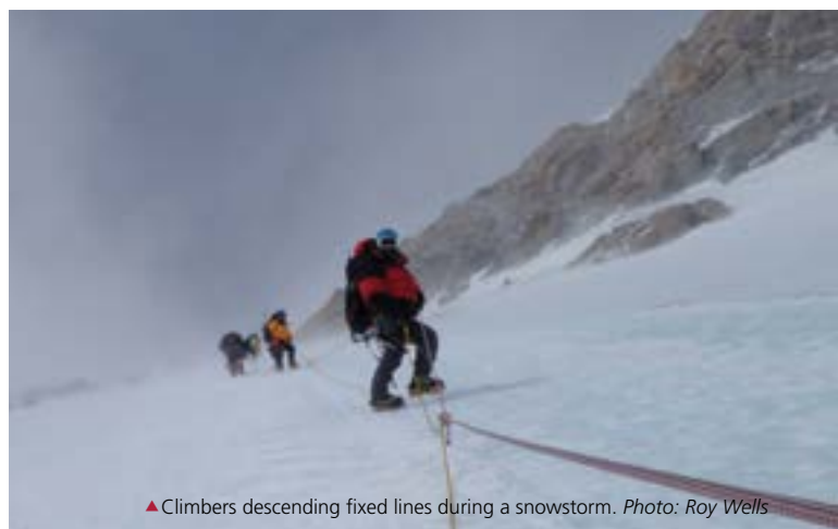
▲ Climbers descending fixed lines during a snowstorm.