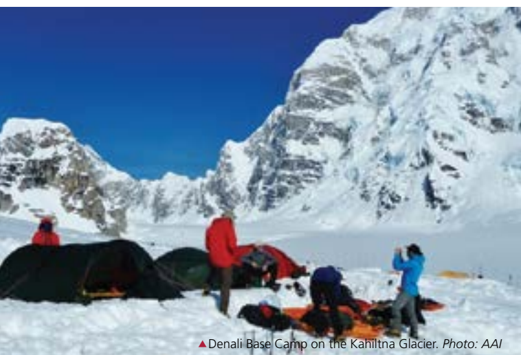
▲ Denali Base Camp on the Kahiltna Glacier.