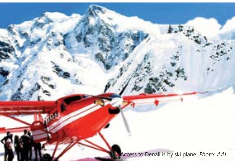
▲ Access to Denali is by ski plane.

Back carry the cache at 4,150m/13,600ft.