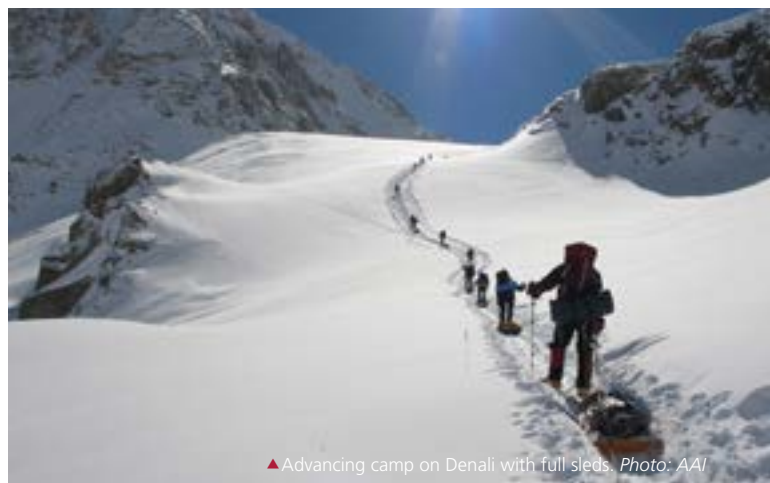
▲ Advancing camp on Denali with full sleds.

We need to be back at the landing strip by no later than 6 am on the morning of Day 21 of the trip.