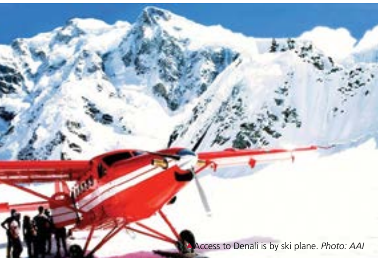
▲ Access to Denali is by ski plane.

Back carry the cache at 4,150m/13,600ft.