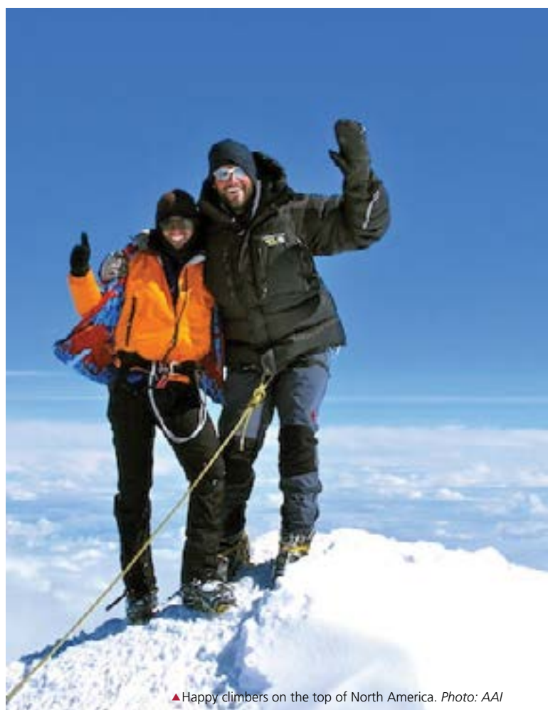
▲ Happy climbers on the top of North America.