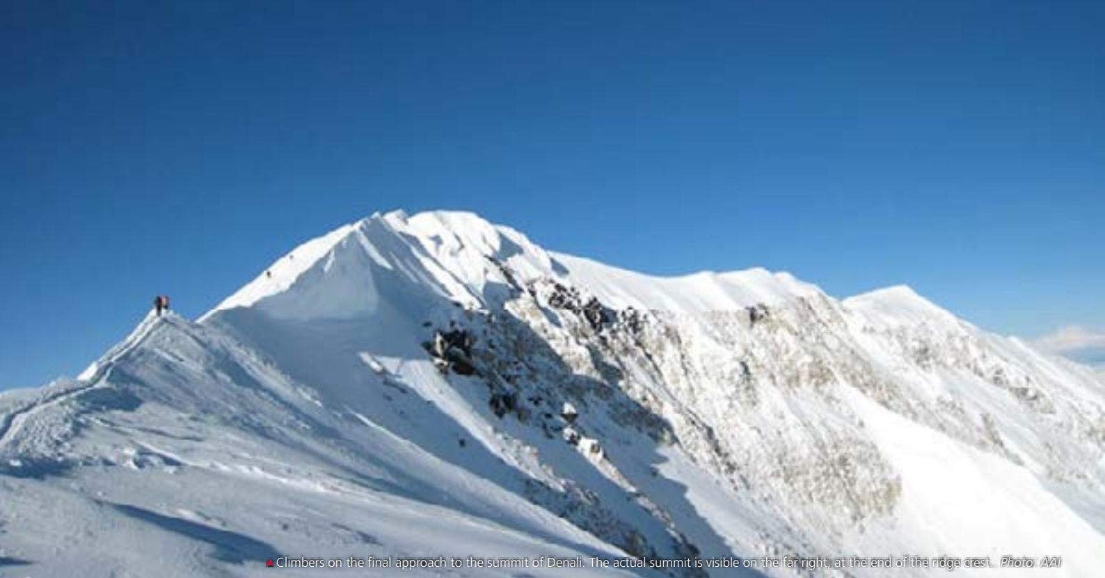
▲ Climbers on the final approach to the summit of Denali. The actual summit is visible on the far right, at the end of the ridge crest.

authorized concessionaire of Denali National Park and Preserve. All prices are subject to change without notice.