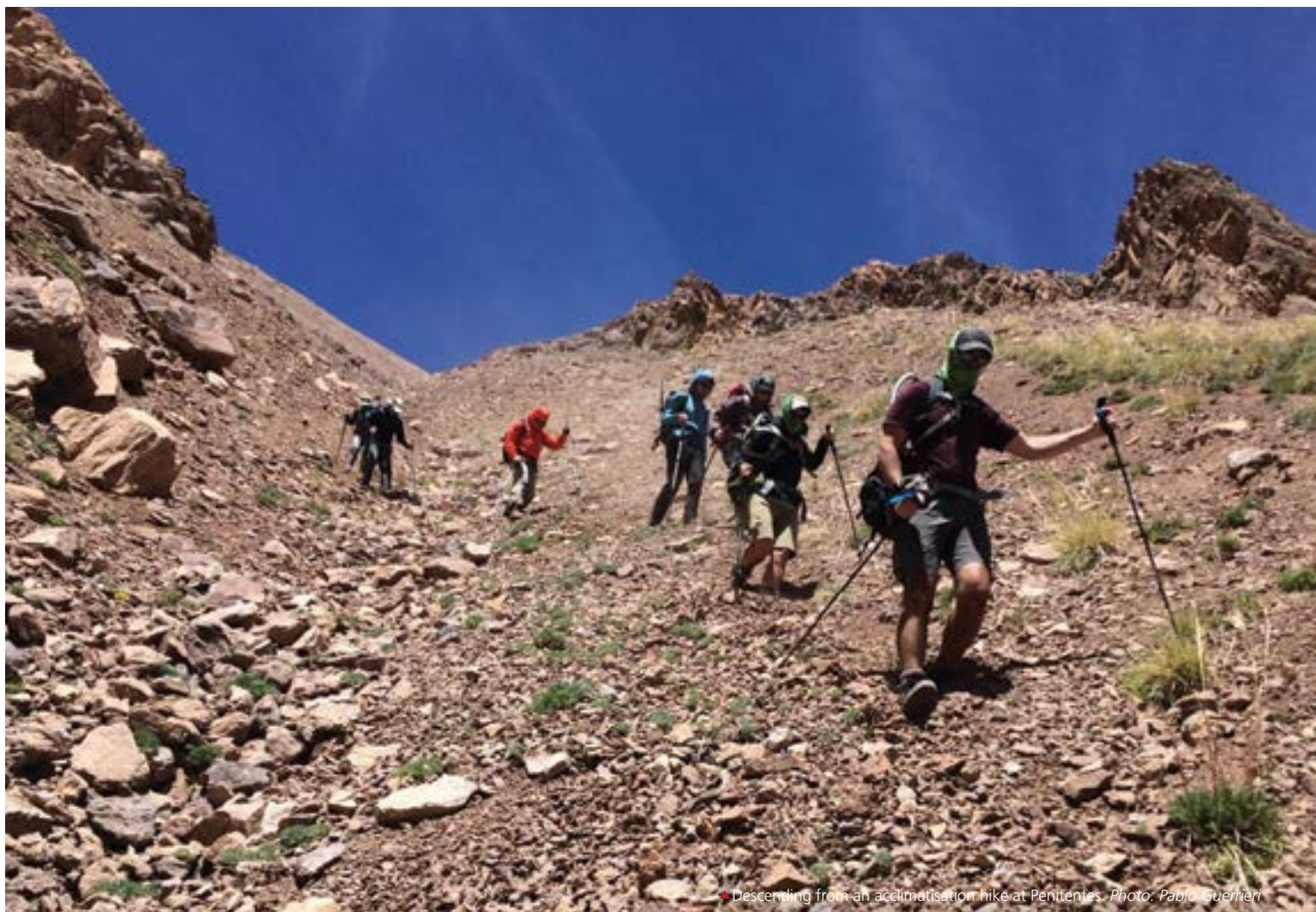
• Descending from an acclimatisation hike at Penitentes.

Upon arriving at Plaza Argentina Base Camp, our sleeping tents will be established in rock windbreaks on the moraine of the Relinchos Glacier. We utilise a large heated and insulated dining tent, complete with sturdy flooring, and have excellent catered meals whilst at Base Camp. After dinner, we can relax in the comfortable lounge area to read or socialise with other members. There is power for charging devices, Wi-Fi and hot showers available free of charge. A valuable acclimatisation and organisation day will occur before we begin carrying and caching equipment to Camp 1 (4,700m/15,400ft) the following morning. We continue to ascend in a lightweight expedition style progressively establishing three camps over a 7 to 10-day period. Camps on the mountain are as comfortable as the conditions allow; we have a dining tent at Camp 1 and Camp 2 where meals of 'real' (not dried) food are prepared by your guides, and at Camp 3 there is a large cook tent staffed by a dedicated guide who assists in preparing food and drinks and provides additional support to the group.