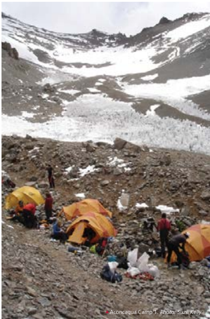
▲ Aconcagua Camp 1.