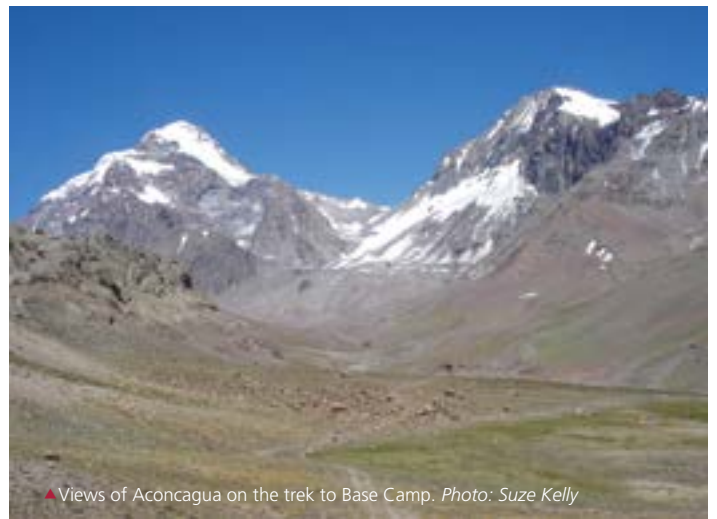
▲ Views of Aconcagua on the trek to Base Camp.