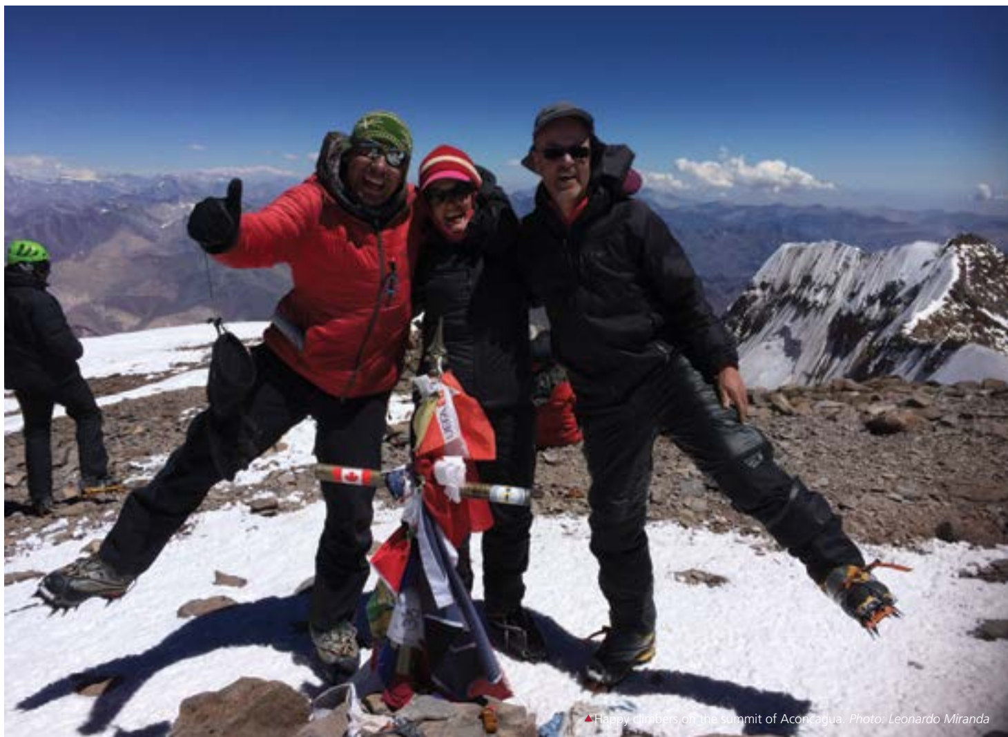
▲ Happy climbers on the summit of Aconcagua.

To maximise safety and summit opportunities our schedule allows several contingency days. We operate with small groups to ensure individualised attention and further enhance our efficiency and safety. We place special emphasis on ensuring the highest standards in accommodation, transport, food, equipment and guiding expertise.