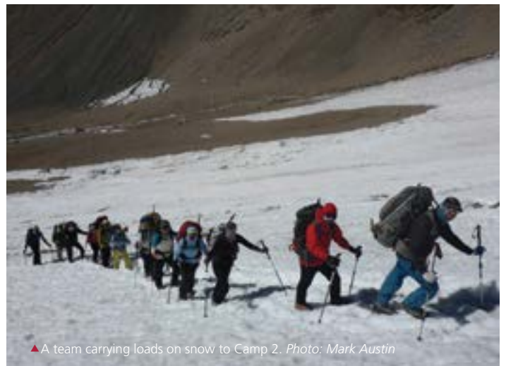
▲ A team carrying loads on snow to Camp 2.