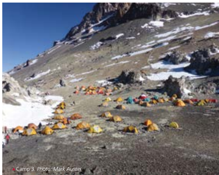
▲Camp 3.

The team will have a maximum size of 12 members and 3 guides. You will find the Adventure Consultants mountain guides strong and companionable Expedition Leaders with the capacity and willingness to see you achieve your goals. The number of guides is determined by the team size but the normal ratio of guides to members is 1:4 for the Vacas Valley route.