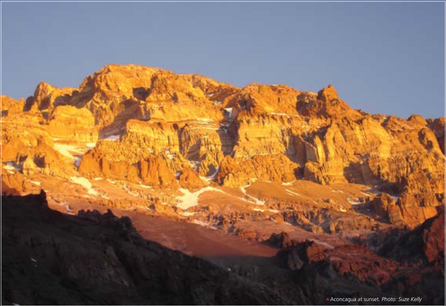
▲ Aconcagua at sunset.