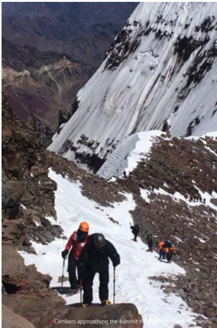
▲ Climbers approaching the summit ridge.