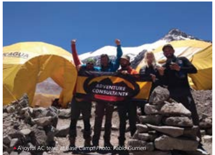
▲ A joyful AC team at Base Camp.