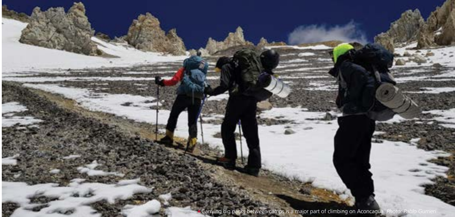
▲ Carrying big packs between camps is a major part of climbing on Aconcagua.