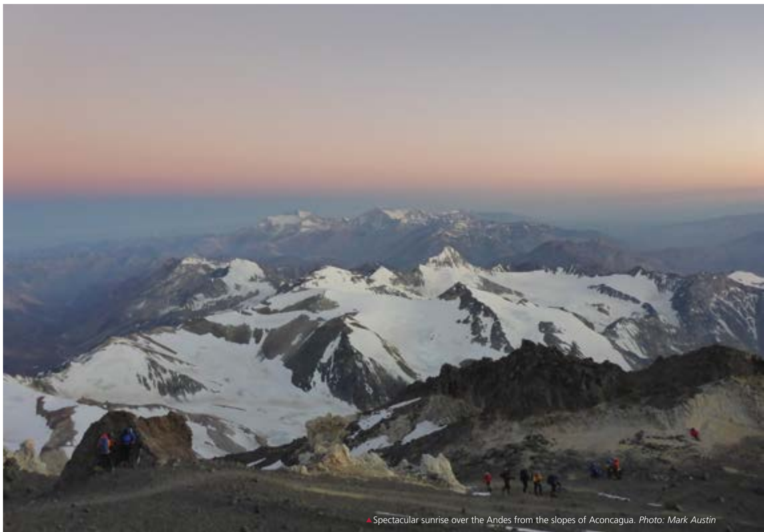
▲ Spectacular sunrise over the Andes from the slopes of Aconcagua.