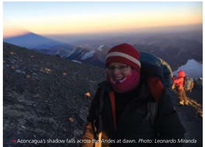
▲ Aconcagua's shadow falls across the Andes at dawn.