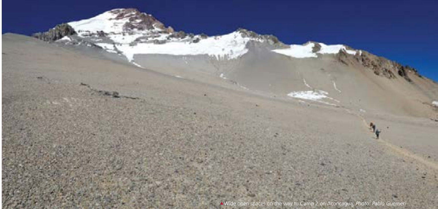
▲Wide open spaces on the way to Camp 2 on Aconcagua.

For those wishing to attempt the Polish Glacier, a higher base skill is required. Please contact us to see if you have the appropriate experience. The route requires technical snow/ice climbing above 6,000m/19,500ft.