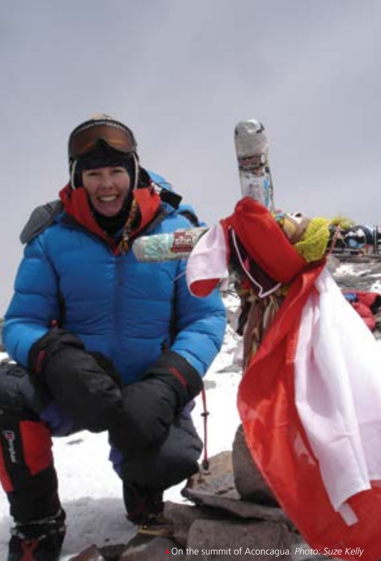
On the summit of Aconcagua.