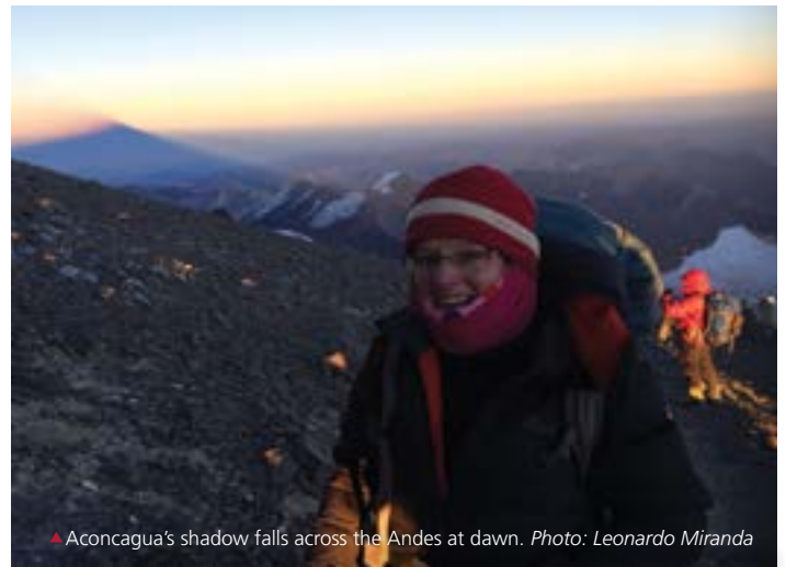
▲ Aconcagua's shadow falls across the Andes at dawn.