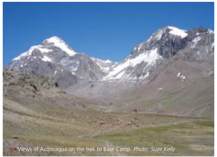
▲ Views of Aconcagua on the trek to Base Camp.