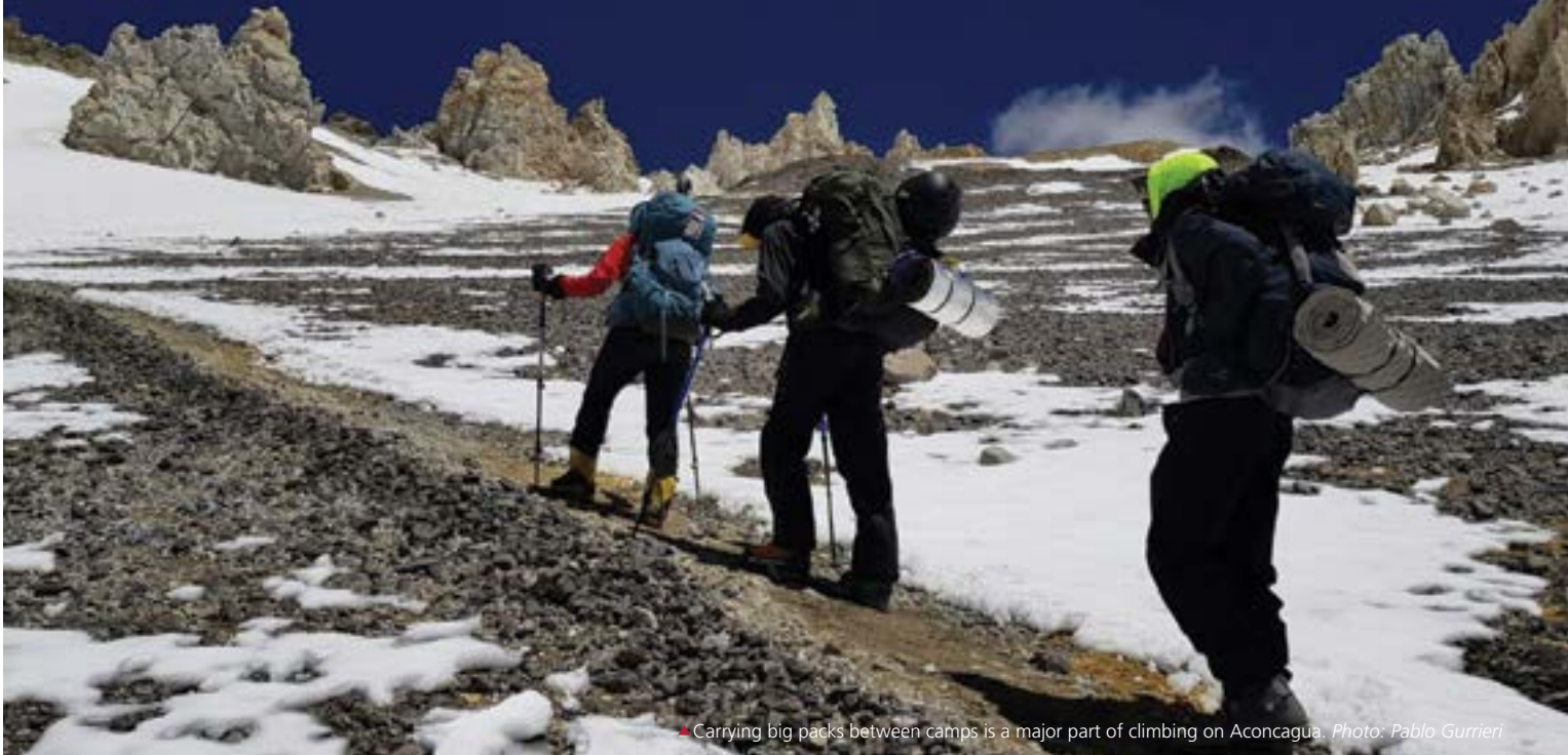
Carrying big packs between camps is a major part of climbing on Aconcagua.