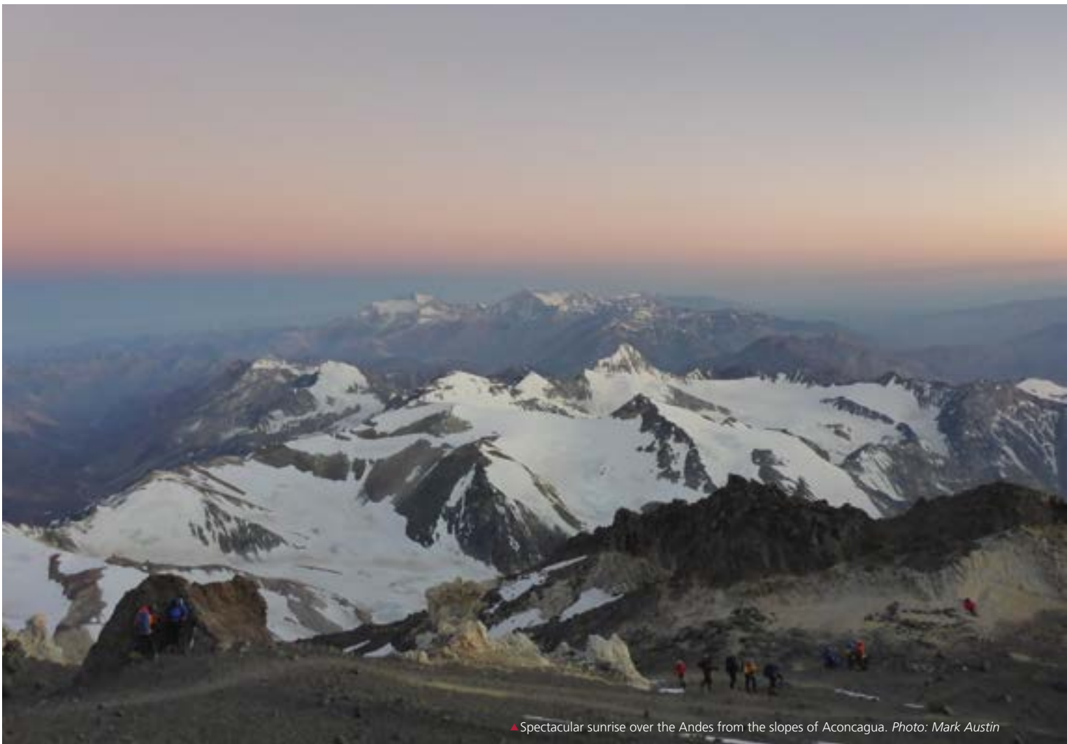
▲ Spectacular sunrise over the Andes from the slopes of Aconcagua.