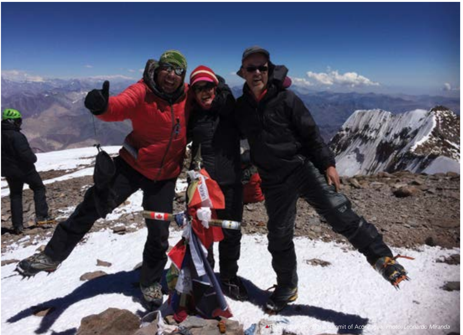
▲ Happy climbers on the summit of Aconcagua.

To maximise safety and summit opportunities our schedule allows several contingency days. We operate with small groups to ensure individualised attention and further enhance our efficiency and safety. We place special emphasis on ensuring the highest standards in accommodation, transport, food, equipment and guiding expertise.