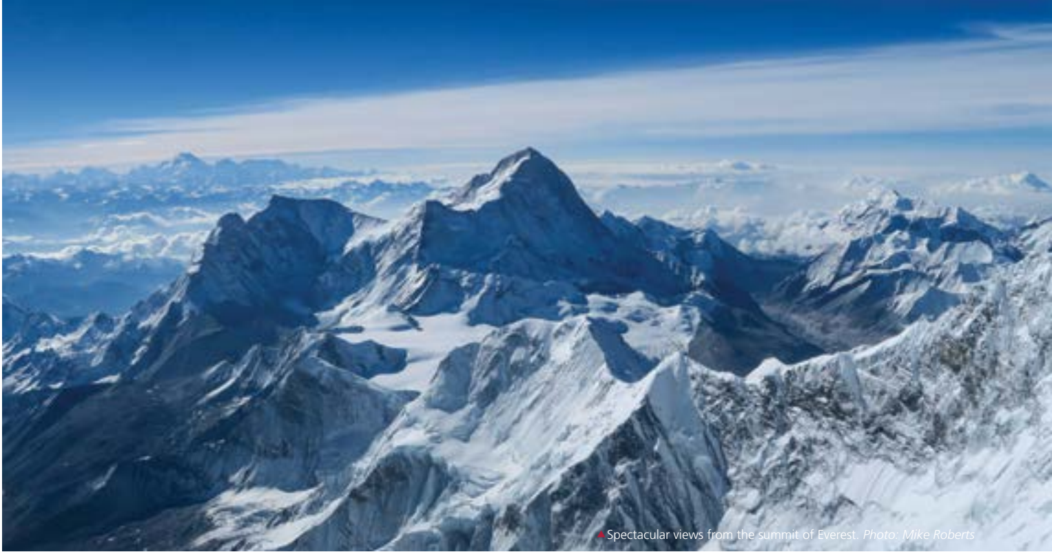
▲ Spectacular views from the summit of Everest.

Our cooking staff are very well known for the quality of the cuisine they produce and are coveted by other team leaders due to the reputation they have established. We have been developing the personnel within our Sherpa team for close to 30 years and they are an integral part of the Adventure Consultants Team.