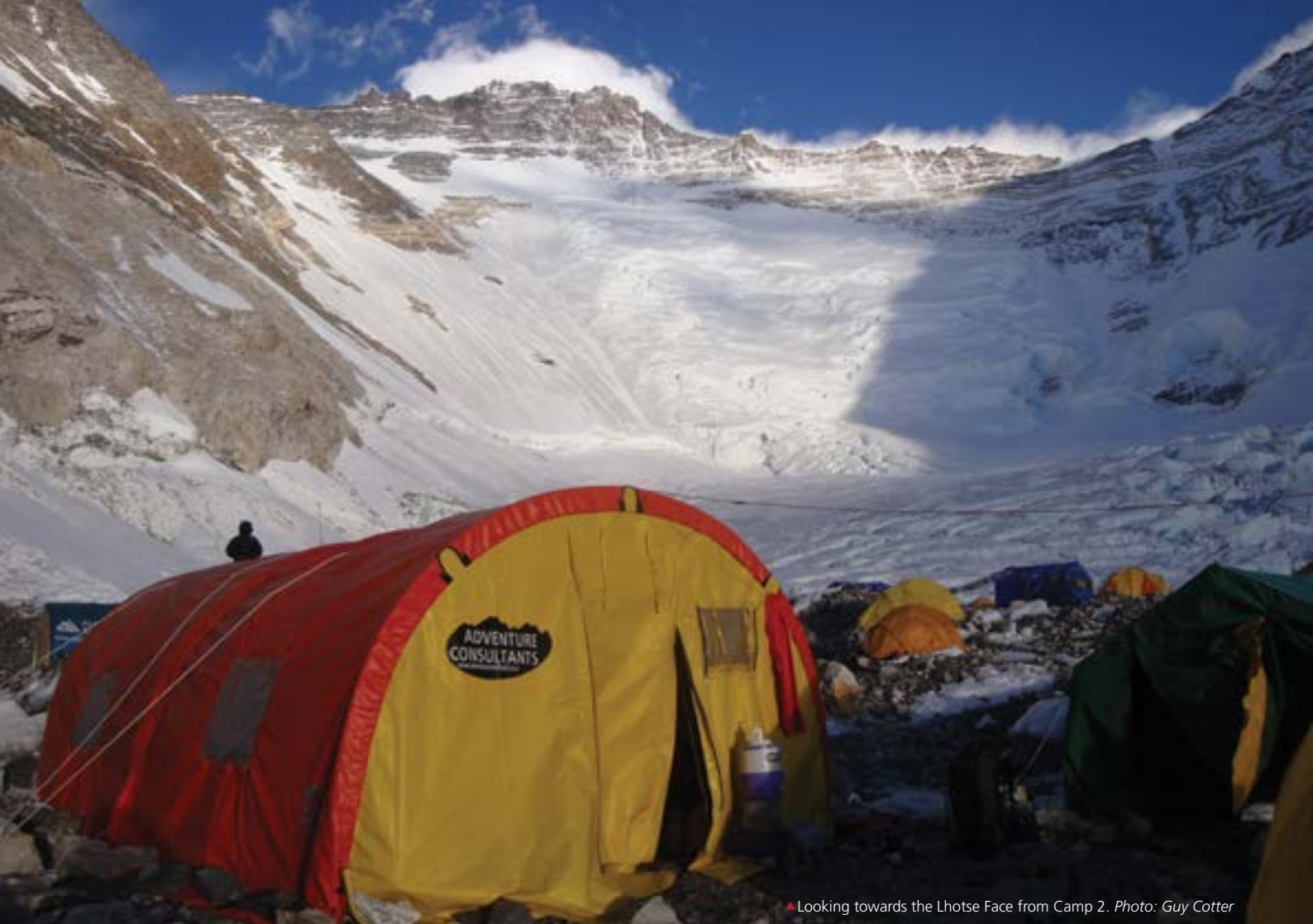
▲ Looking towards the Lhotse Face from Camp 2.

We strongly recommend you take out trip cancellation insurance via your travel agent if you wish to be covered against cancellation due to medical or personal reasons.