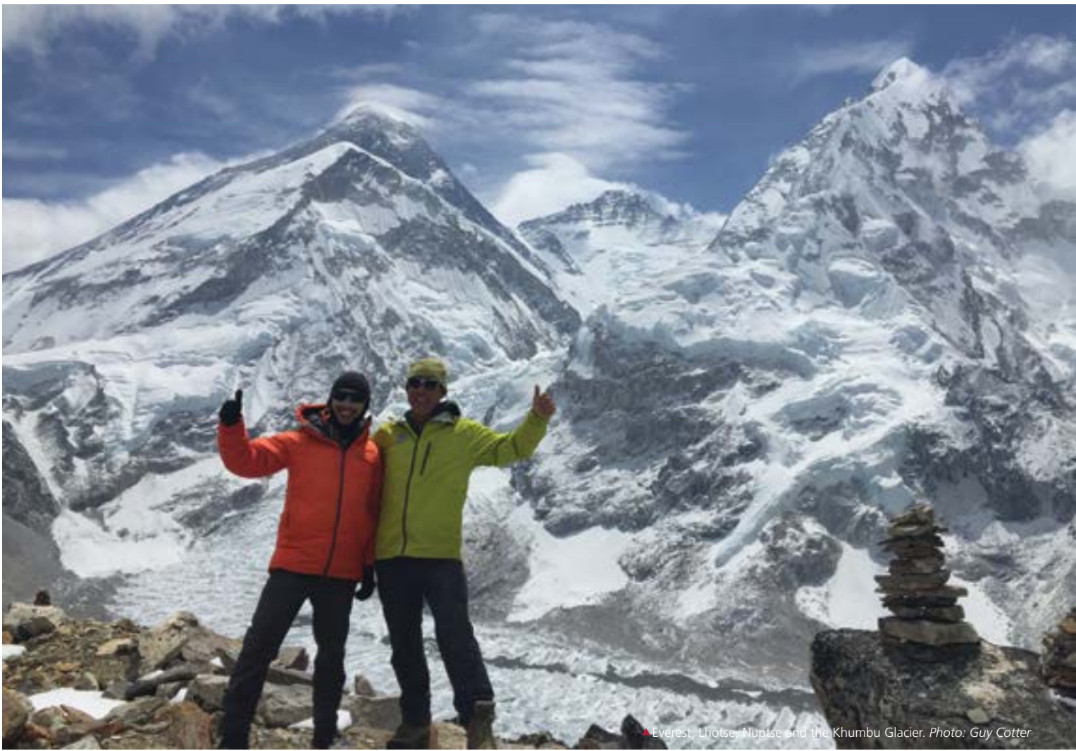
▲ Everest, Lhotse, Nuptse and the Khumbu Glacier.

Cho Oyu and of course our ultimate goal, the Triple Crown peaks of Everest, Lhotse and Nuptse.