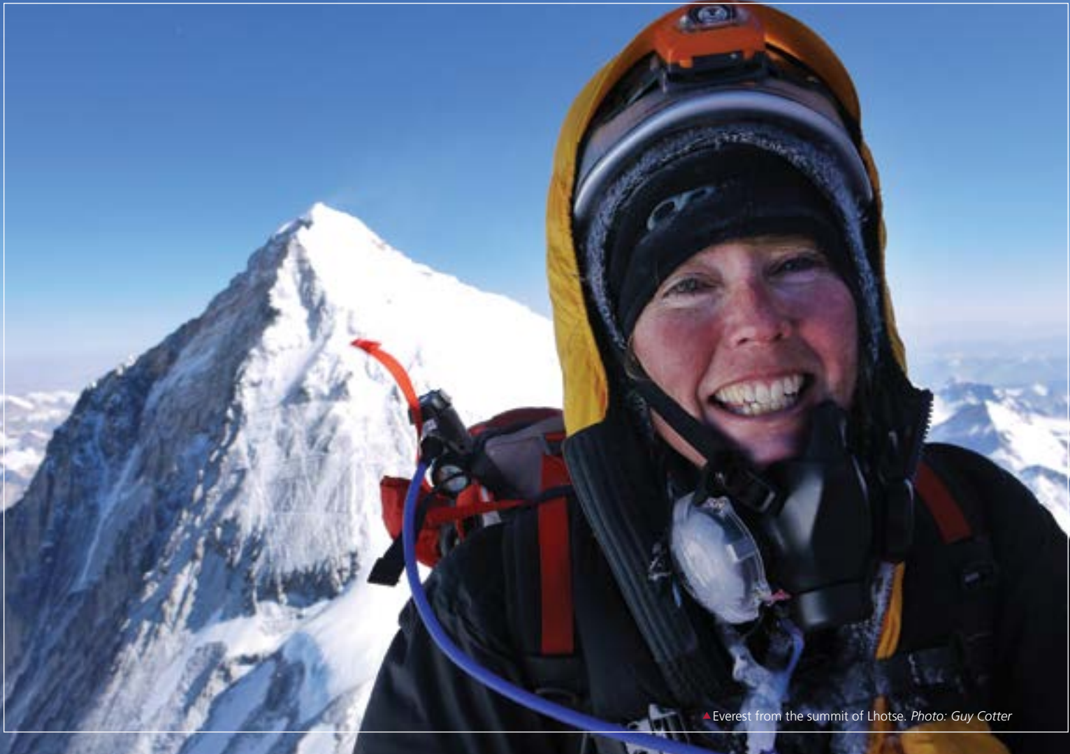
▲ Everest from the summit of Lhotse.