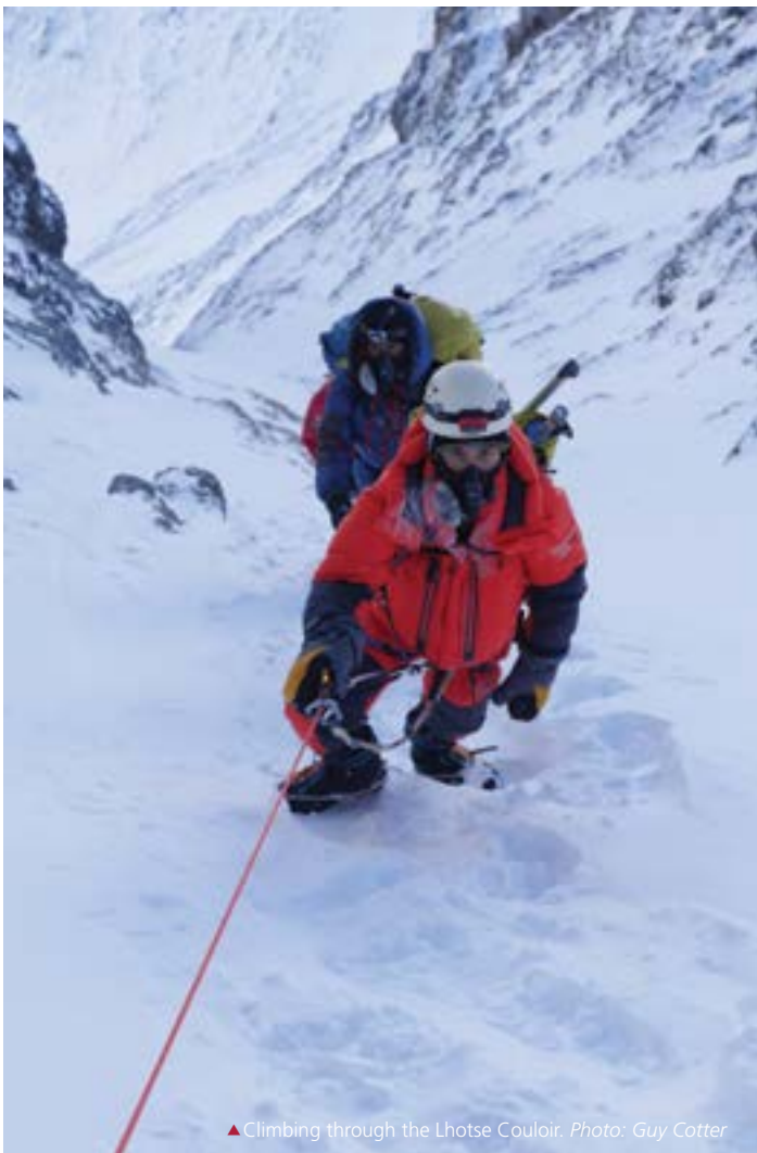
▲ Climbing through the Lhotse Couloir.