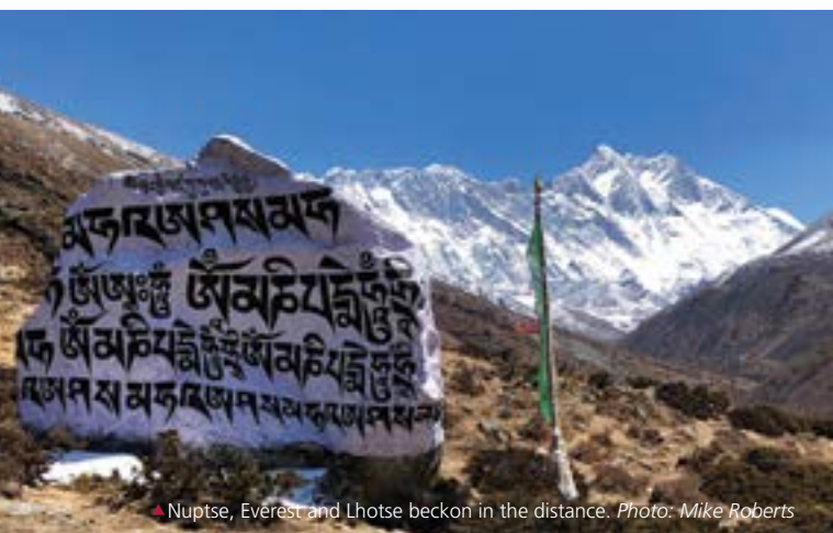
▲ Nuptse, Everest and Lhotse beckon in the distance.