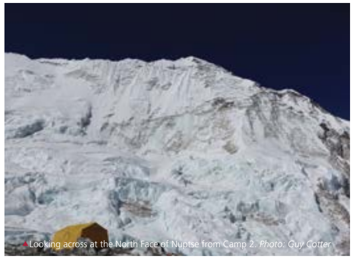
▲ Looking across at the North Face of Nuptse from Camp 2.