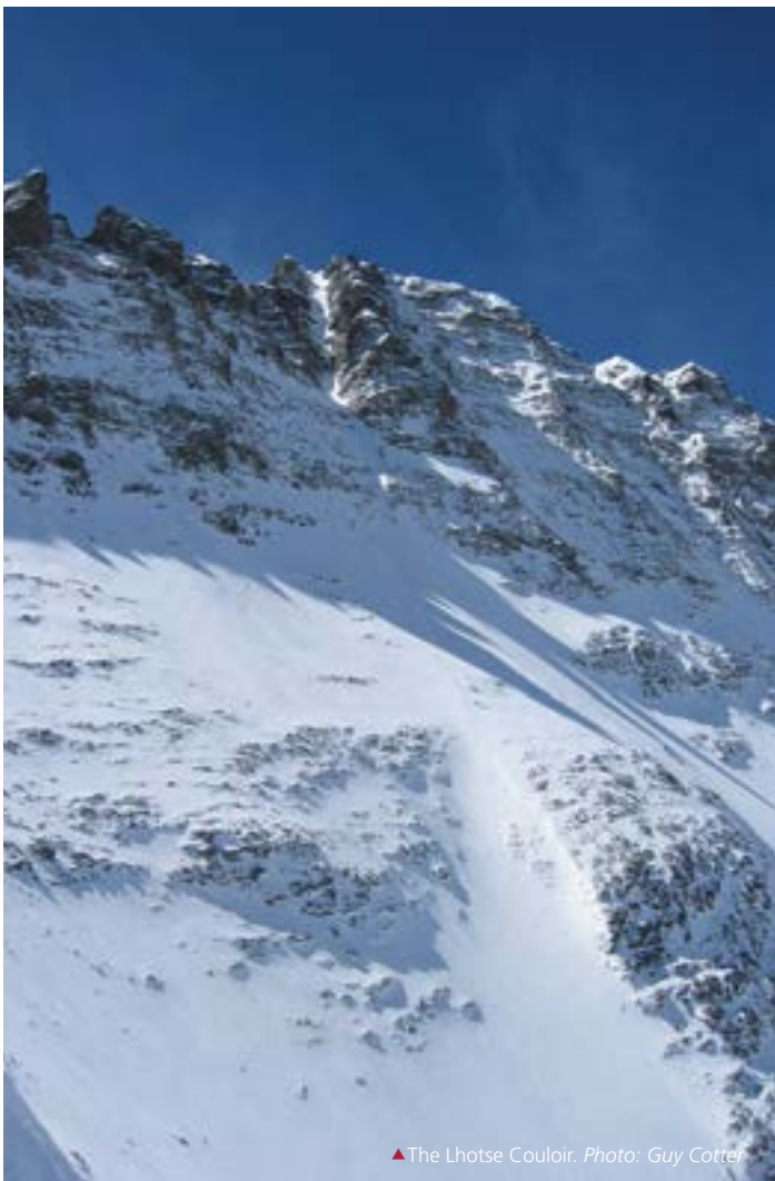
▲ The Lhotse Couloir.