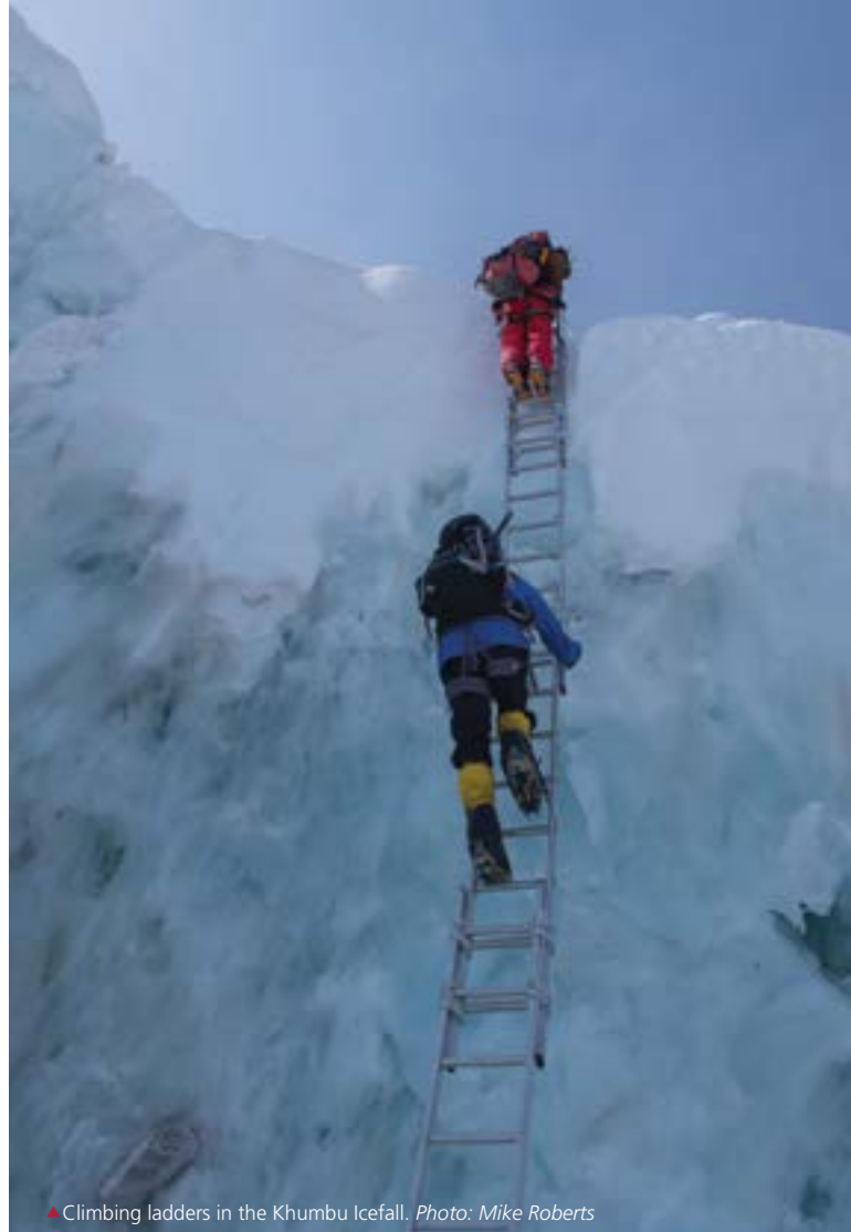
▲ Climbing ladders in the Khumbu Icefall.

Account Number: 1000-594771-0000 Account Type: US Dollars Swift Address: BKNZNZ22