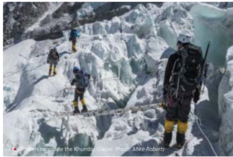
▲ Climbers negotiate the Khumbu Glacier.