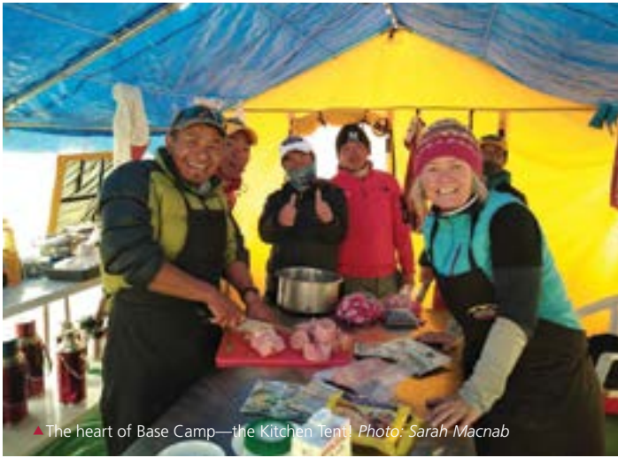
▲ The heart of Base Camp—the Kitchen Tent!