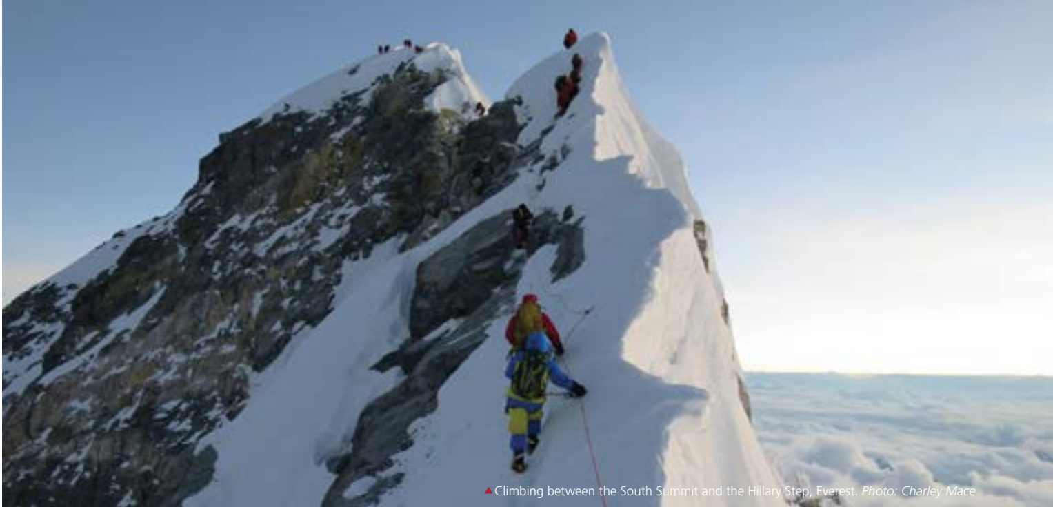
▲ Climbing between the South Summit and the Hillary Step, Everest.

The climbing is very direct from Camp 4 with 200m/656ft of climbing snow slopes, before entering the narrow confines of the summit couloir that we ascend directly to the summit itself. The timing of the ascent will be dependent on the snow conditions and weather at the time, but in general this will take around 8–10 hours from top camp and around 3 hours to descend. We continue descending through to Camp 2 for the night, and returning to Base Camp the following day.