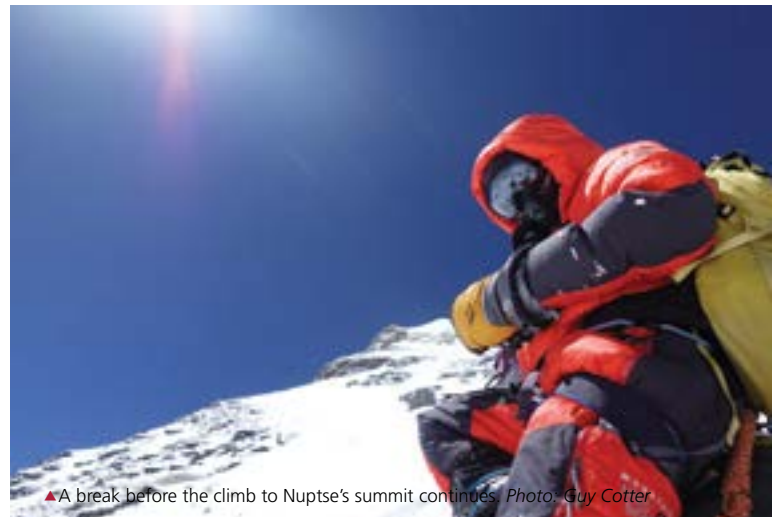
▲ A break before the climb to Nuptse's summit continues.

Days 40–48 Everest (8,850m/29,035ft) and Lhotse (8,516m/27,939ft) summit climbs