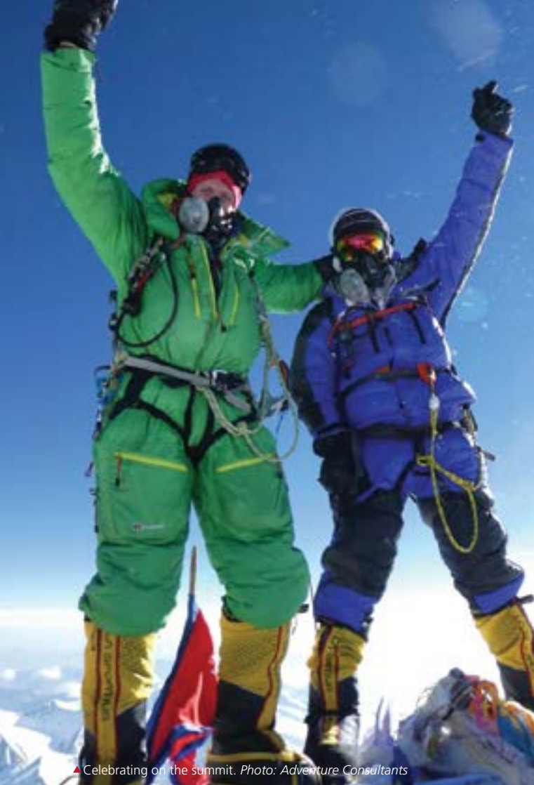
▲ Celebrating on the summit.

programme. Experience tells us that this rest cycle is very therapeutic; both physically and psychologically, prior to the final summit push.