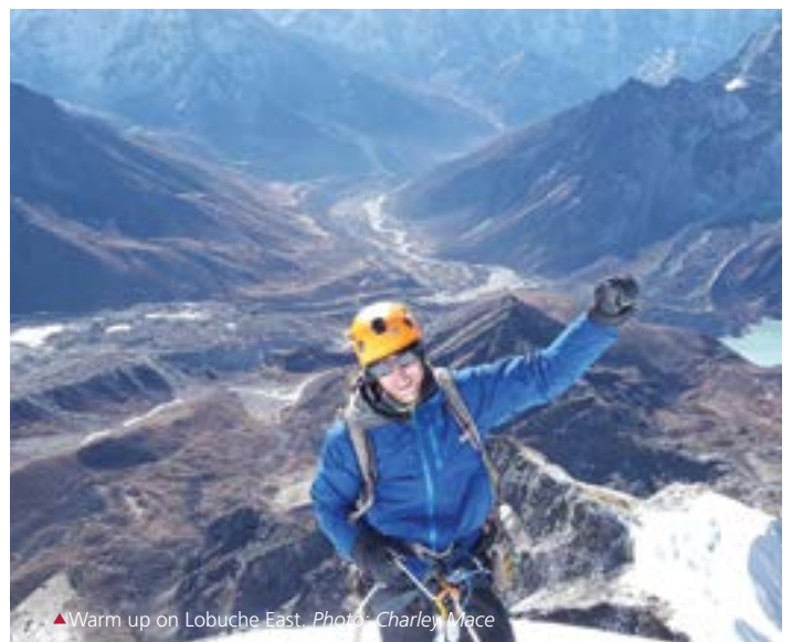
▲ Warm up on Lobuche East.

After a few hours rest and re-hydration, it's back to the action as we head out again, this time for the summit of Lhotse. From the South Col, it's a two-hour traverse around the Geneva Spur to take you to Lhotse Camp 4 from where you will stage the Lhotse summit attempt. Depending on the weather conditions and your health and energy levels following the Everest summit climb, your guide may elect for you to sleep overnight at Lhotse Camp 4 or continue directly on to the summit. The camp is situated on the upper part of the Lhotse Face on steep snow slopes at the base of the couloir that leads directly to the summit. Tent platforms will be cut into the slope but there will be little room to move about.