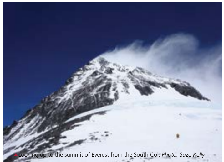
▲ Looking up to the summit of Everest from the South Col.

Senior International Guides who will have first-hand knowledge of the climbs.