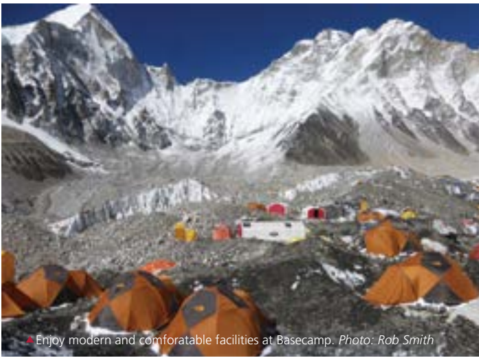
▲ Enjoy modern and comfortable facilities at Basecamp.