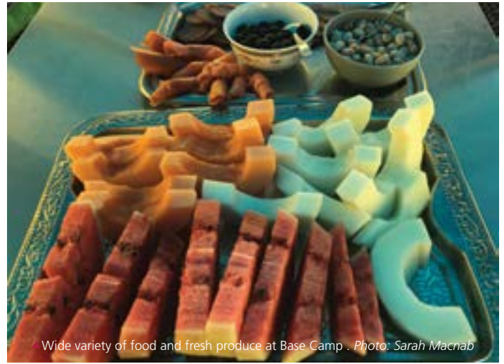
▲ Wide variety of food and fresh produce at Base Camp.