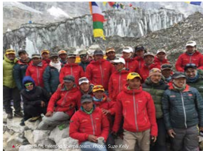
▲ Some of AC's talented Sherpa team.

Every step of the way, our head office staff will be there to answer your questions. If they can't, they will be happy to put you in touch with one of our