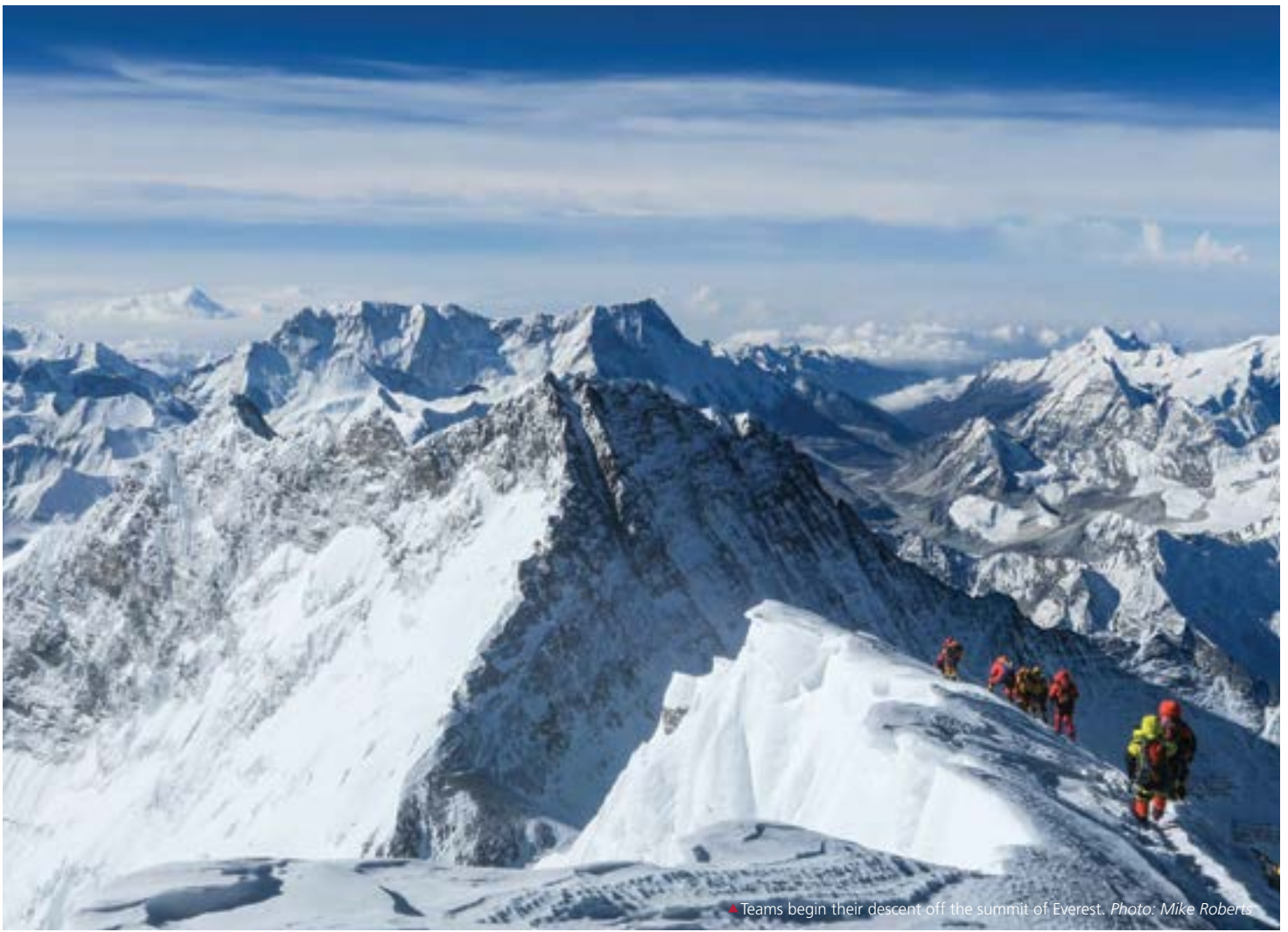
Teams begin their descent off the summit of Everest.