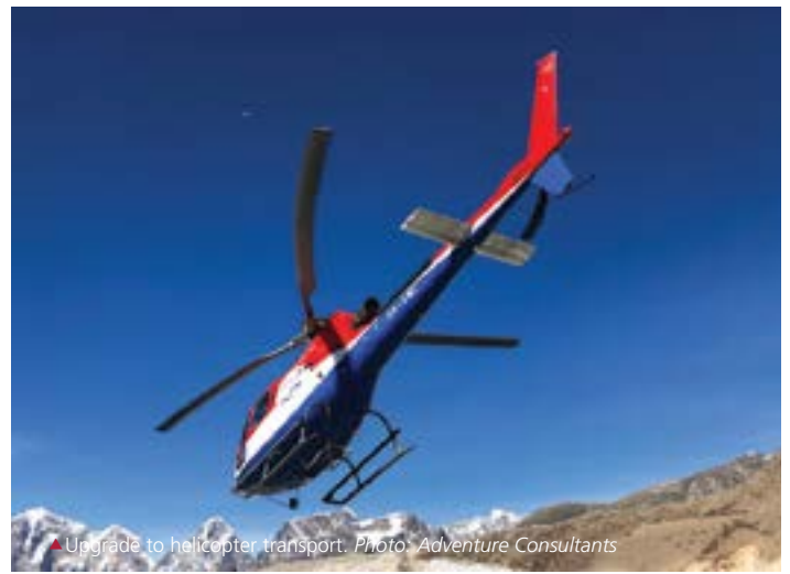
▲ Upgrade to helicopter transport.