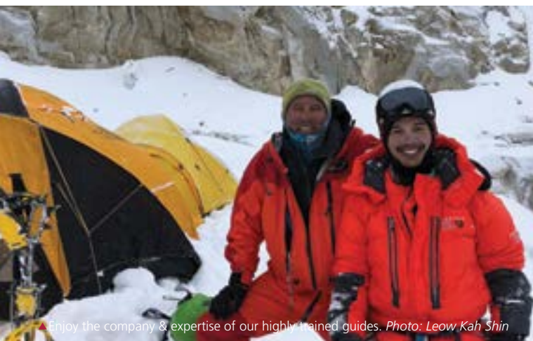
▲ Enjoy the company & expertise of our highly trained guides.

on arrival at Kathmandu Airport. Visa application forms can be completed online. You will need to get a 90-day visa which costs US$125.