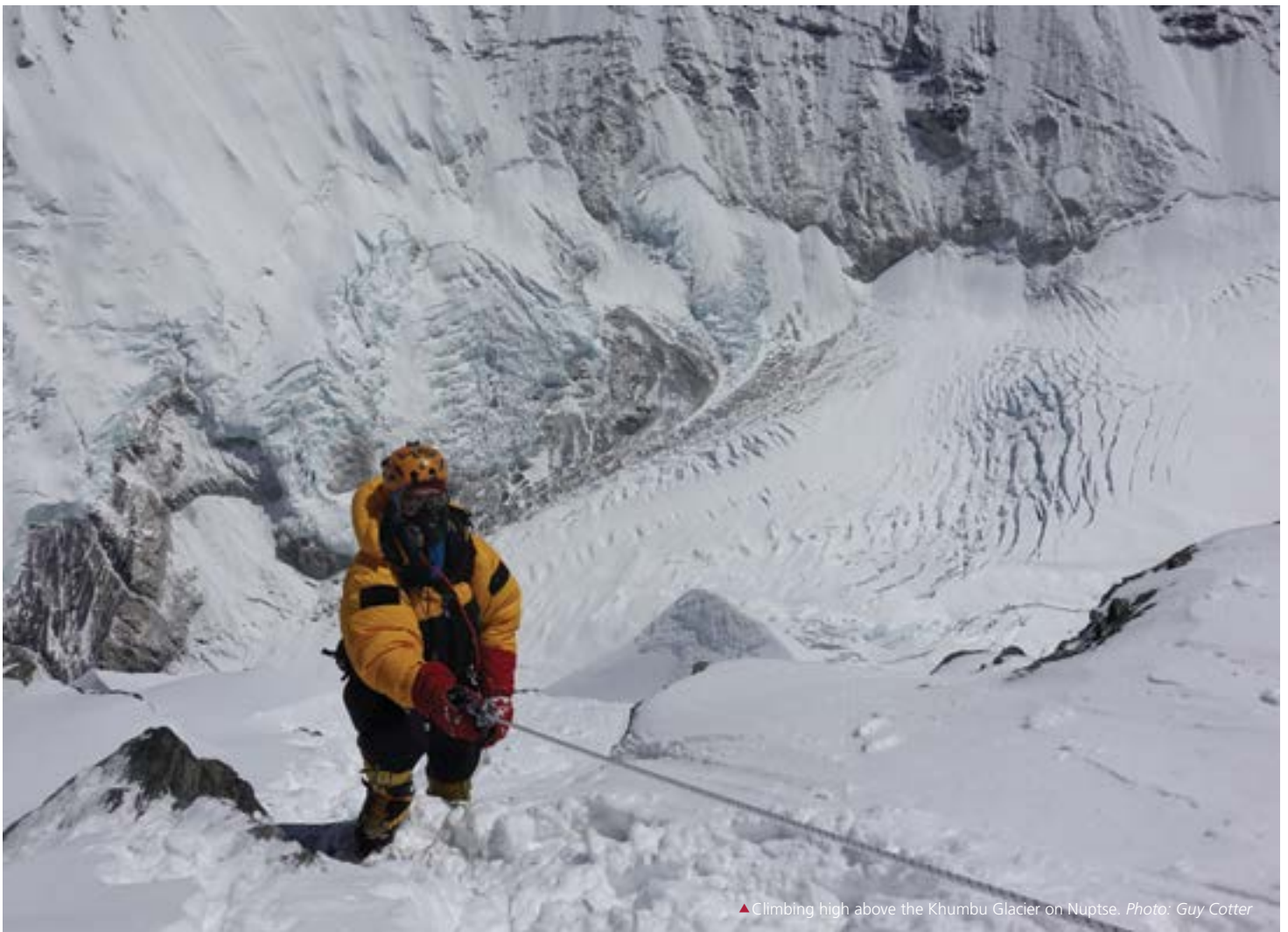
▲ Climbing high above the Khumbu Glacier on Nuptse.