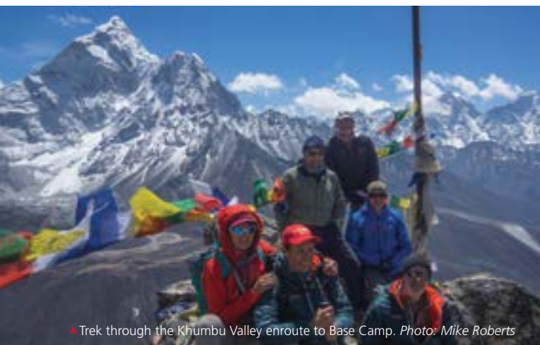
▲ Trek through the Khumbu Valley enroute to Base Camp.