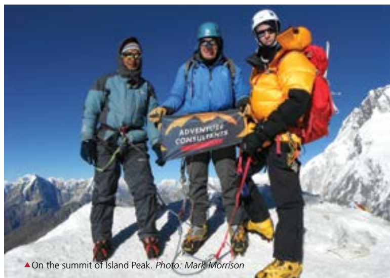
▲ On the summit of Island Peak.

After the ascent of Lobuche East, we spend a day resting and preparing for our trek across the spectacular Kongma La to Pokalde High Camp, located near the top of the pass. We watch the sun dip below the horizon and feel the allure of a down jacket and warm sleeping bag! In the morning we will pack up and head off to climb Pokalde just on sunrise.