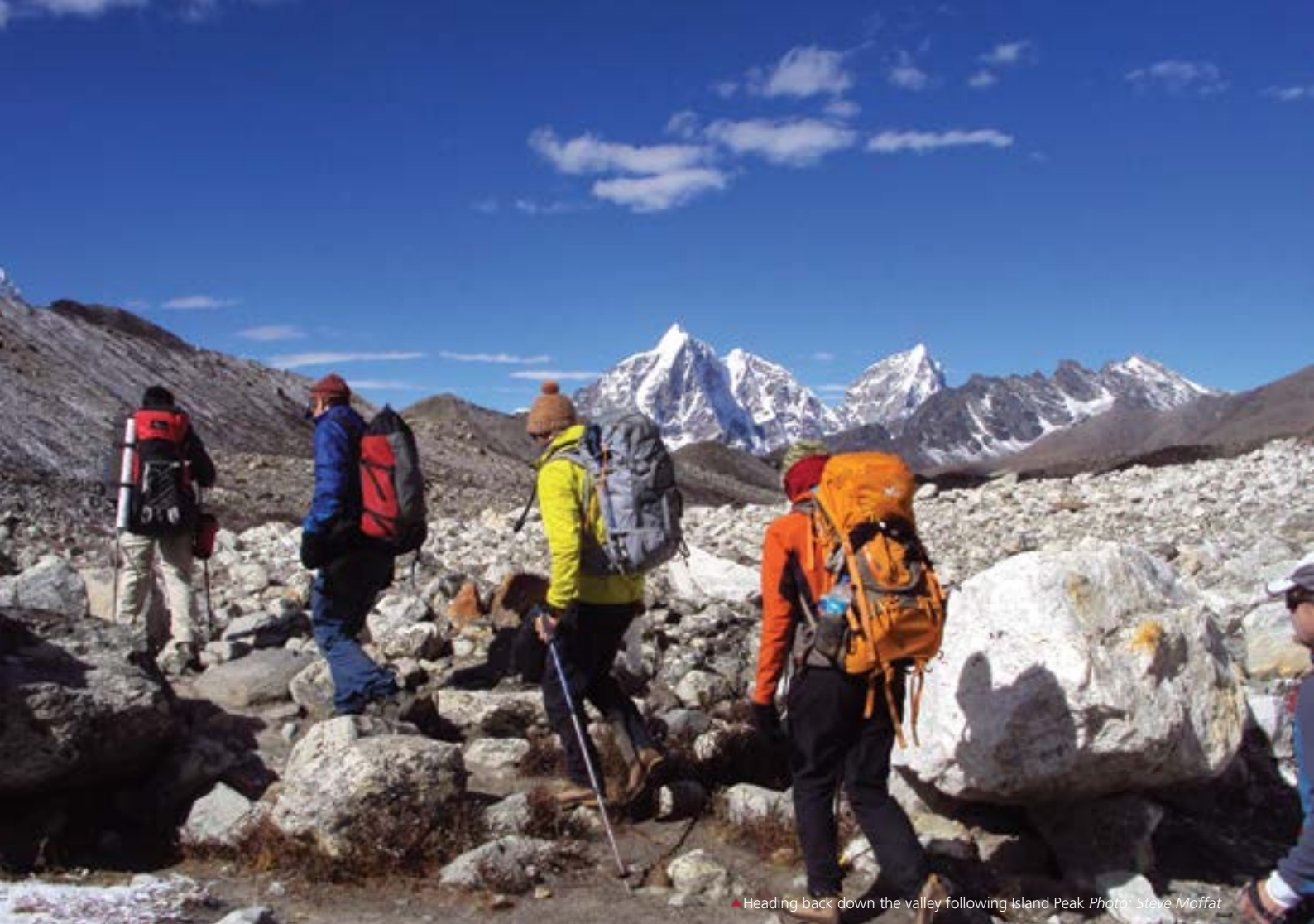
Heading back down the valley following Island Peak