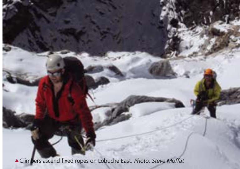
▲ Climbers ascend fixed ropes on Lobuche East.