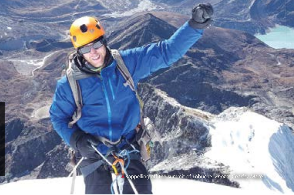
▲ Rappelling off the summit of Lobuche.

During the post monsoon season of 2025, Adventure Consultants will operate an expedition to climb three of Nepal's most popular trekking peaks; Lobuche East (6,119m/20,075ft), Pokalde (5,806m/19,049ft) and Island Peak (6,189m/20,305ft). The Three Peaks Nepal expedition visits Everest Base Camp, crosses the high Kongma La Pass between peaks and completes a fabulous circuit of the upper Khumbu tributaries, before returning to Namche Bazaar and back to Lukla.