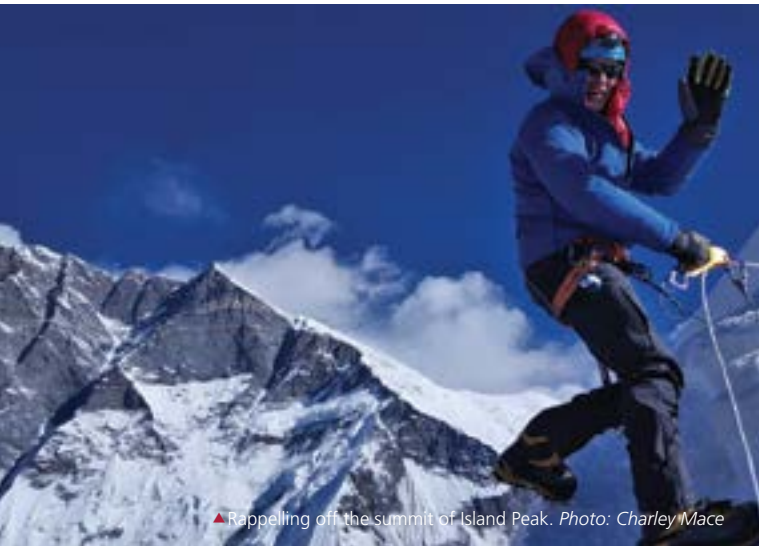
▲ Rappelling off the summit of Island Peak.