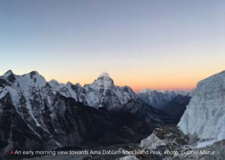
▲ An early morning view towards Ama Dablam from Island Peak.