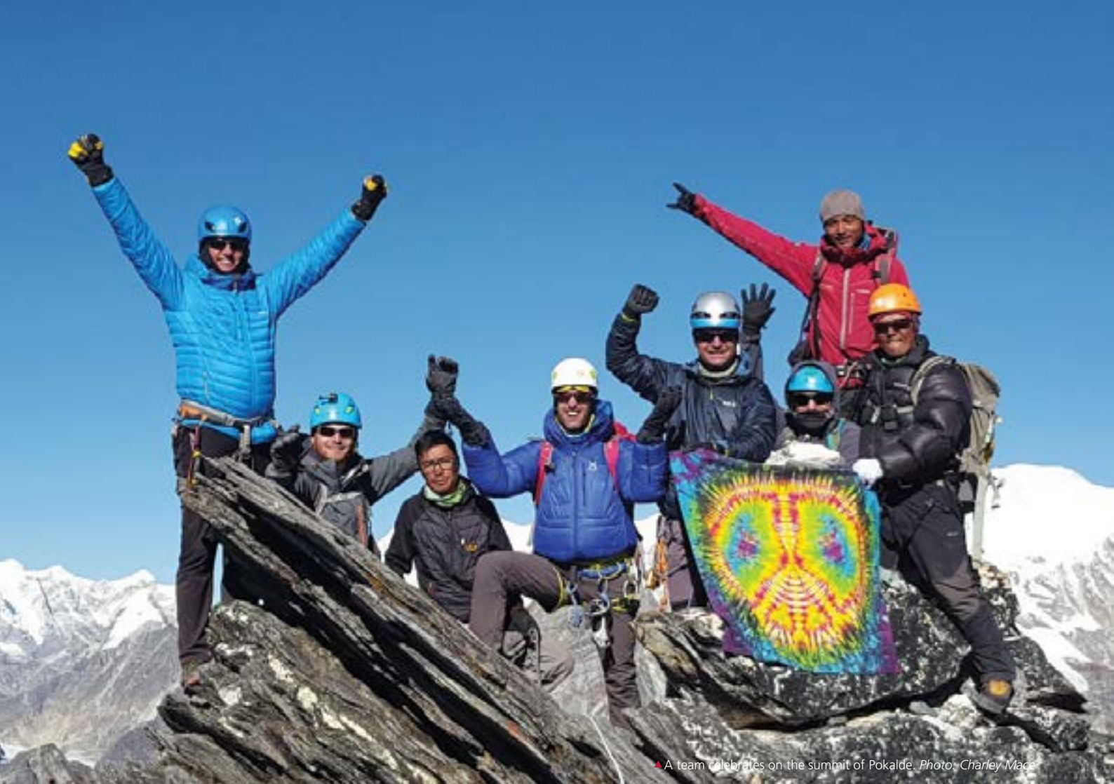
• A team celebrates on the summit of Pokalde.