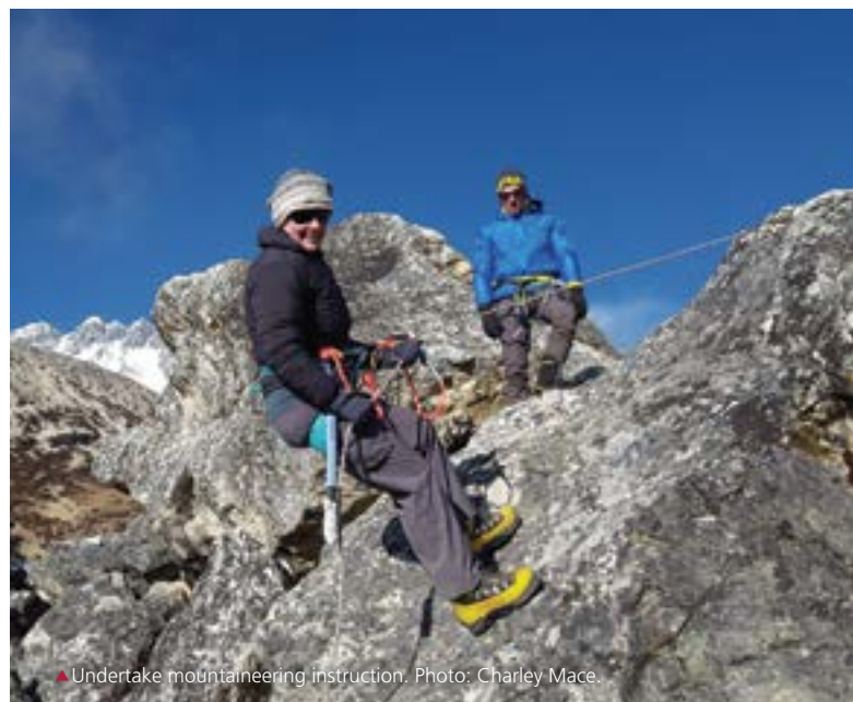
▲ Undertake mountaineering instruction.

Our early start, around 2.30am, sees us climbing the South East Ridge, which is a mixture of snow and ice. Where necessary, we fix ropes along the route and steady climbing will bring us to the far eastern summit. From the top, we are well rewarded with superb views across to Ama Dablam, Makalu, Lhotse, Everest, Nuptse, Changtse, Pumori, Gyachung Kang and Cho Oyu. Then it's time for our descent, all the way back to our Base Camp to celebrate our first ascent!