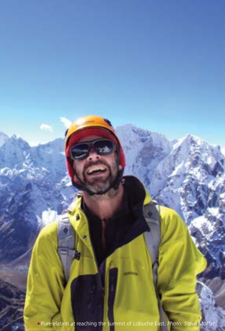
▲ Pure elation at reaching the summit of Lobuche East.