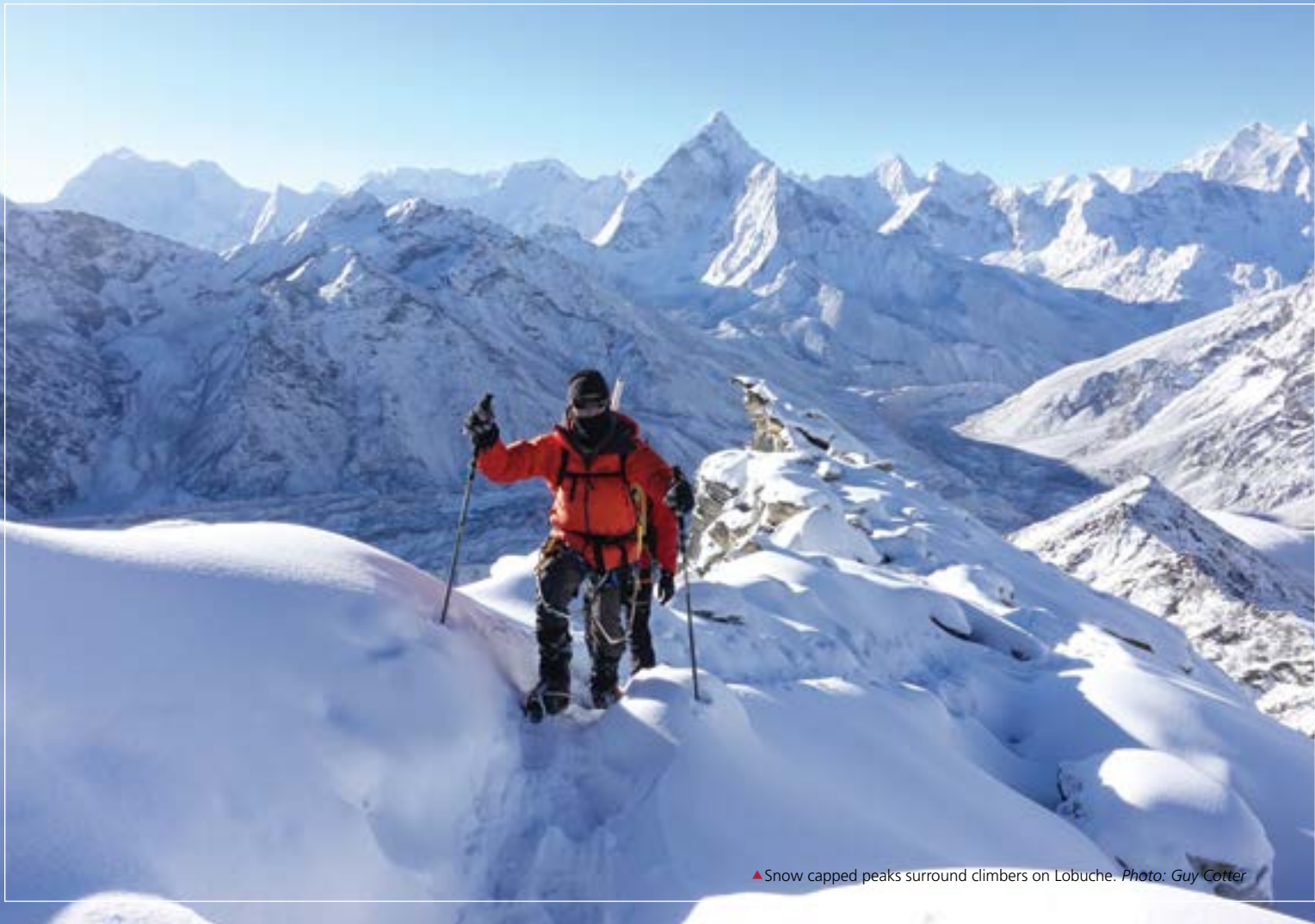
▲ Snow capped peaks surround climbers on Lobuche.