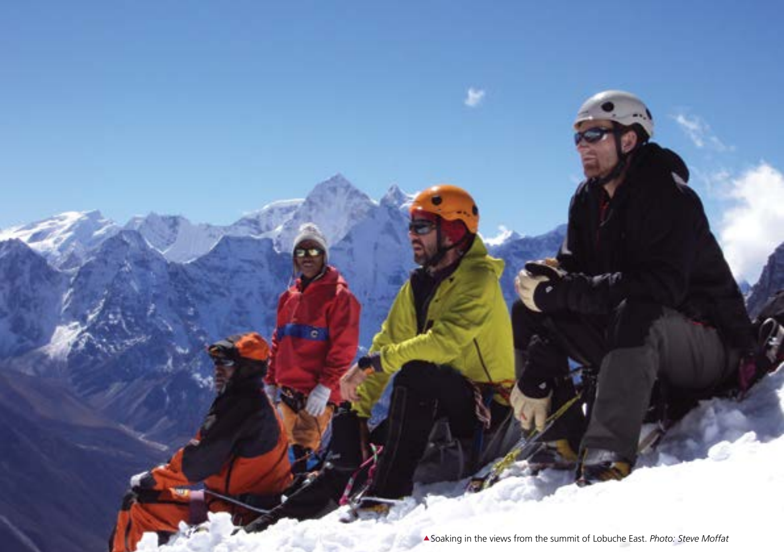
▲ Soaking in the views from the summit of Lobuche East.