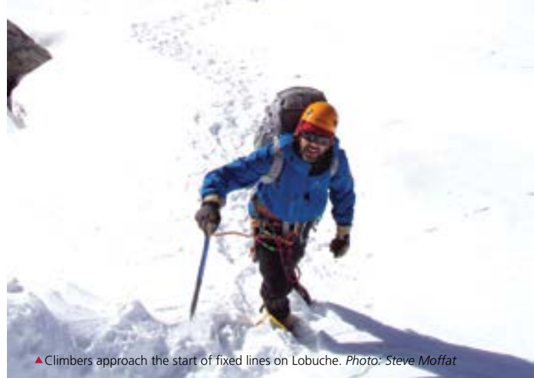
▲ Climbers approach the start of fixed lines on Lobuche.