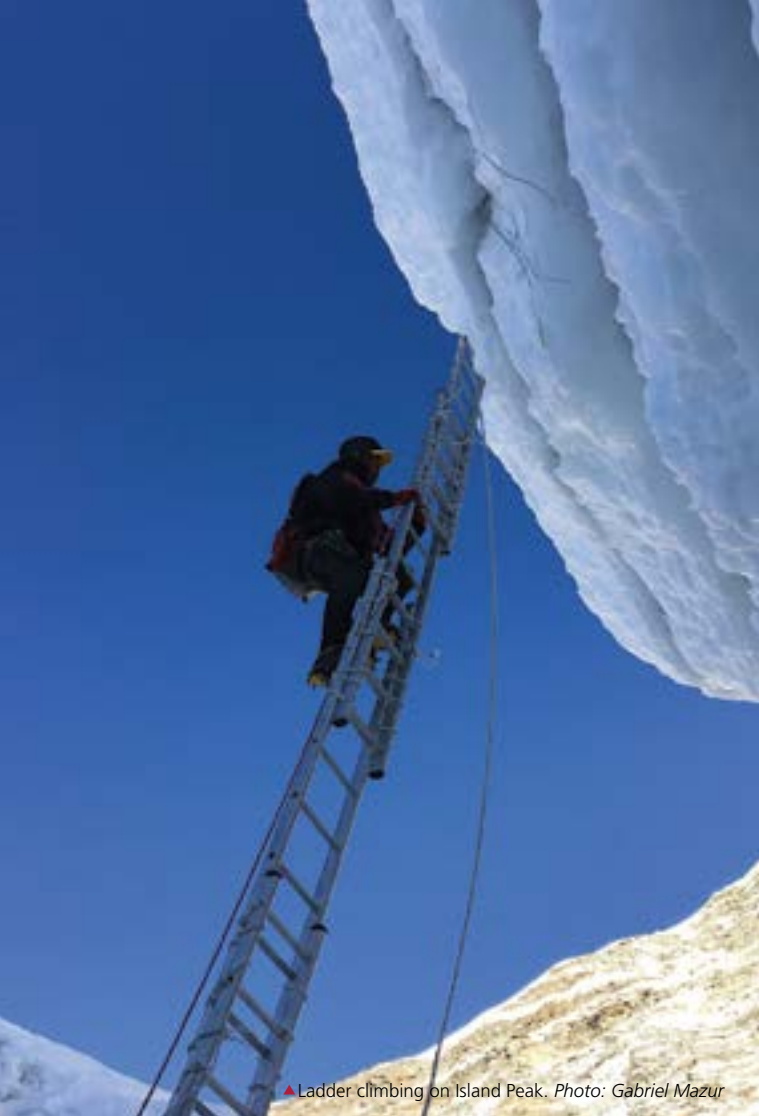
▲ Ladder climbing on Island Peak.