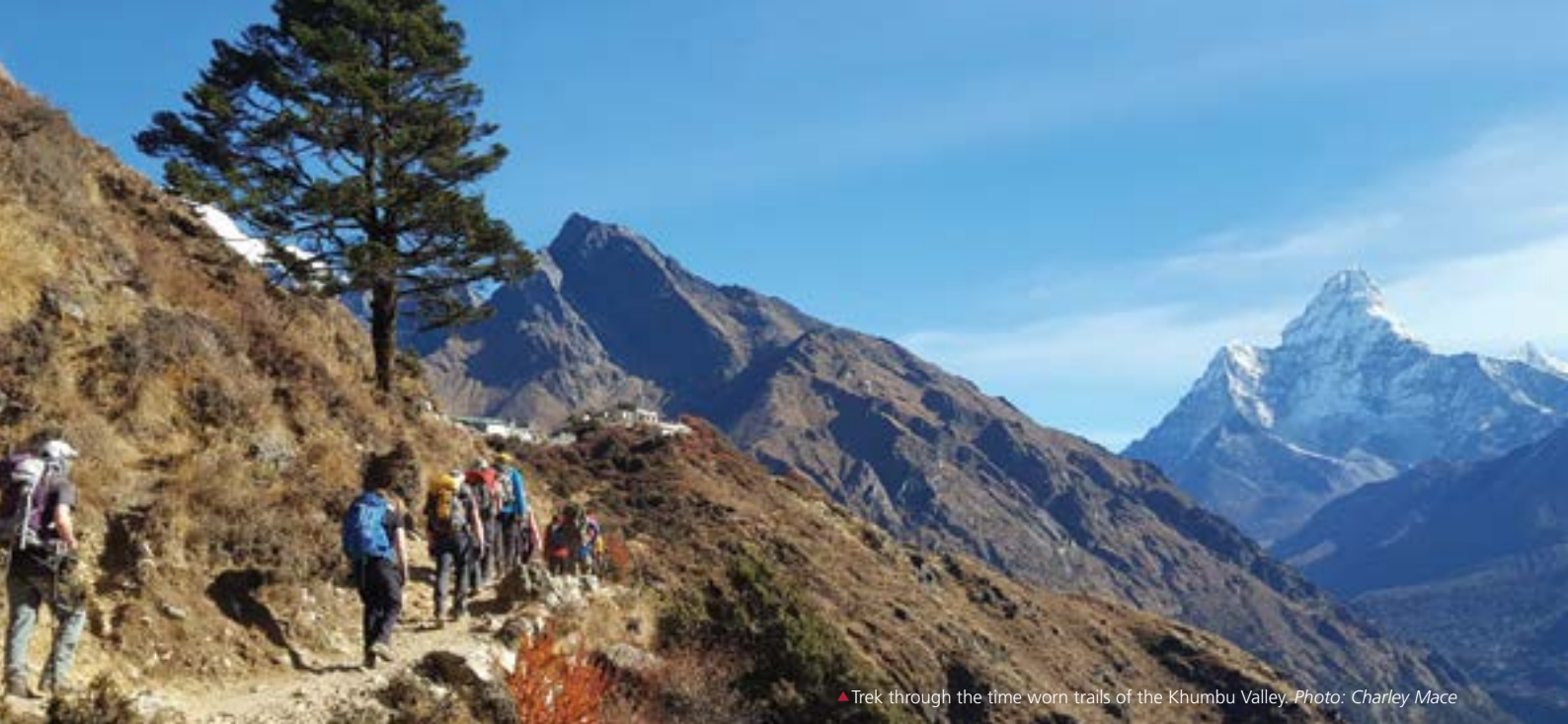
▲ Trek through the time worn trails of the Khumbu Valley.

Island Peak, the highest of the Three Peaks at 6,189m/20,305ft, is referred to by the local Sherpa people as Imja Tse—an ‘Island in a Glacial Sea’. An ideal mountain on which to finish the trilogy, Island Peak crosses more technical terrain than the previous two climbs and involves slightly more exposure, including the use of ladders on the glaciated lower sections of the climb and fixed ropes on the upper snow and ice sloped sections. It is an exciting and popular peak, with views from the summit towards Ama Dablam and the south wall of Nuptse/Lhotse that are awe-inspiring. Each of these are very doable climbs for anyone in good shape and with a desire for high adventure.