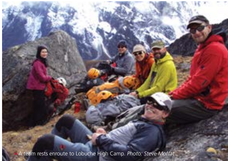
▲ A team rests enroute to Lobuche High Camp.

Many of our expedition members come to us because they have seen us in action on a previous trip and decide to opt for our level of service and proven experience. Others return because they know we do our very best to make expeditions safe and successful.