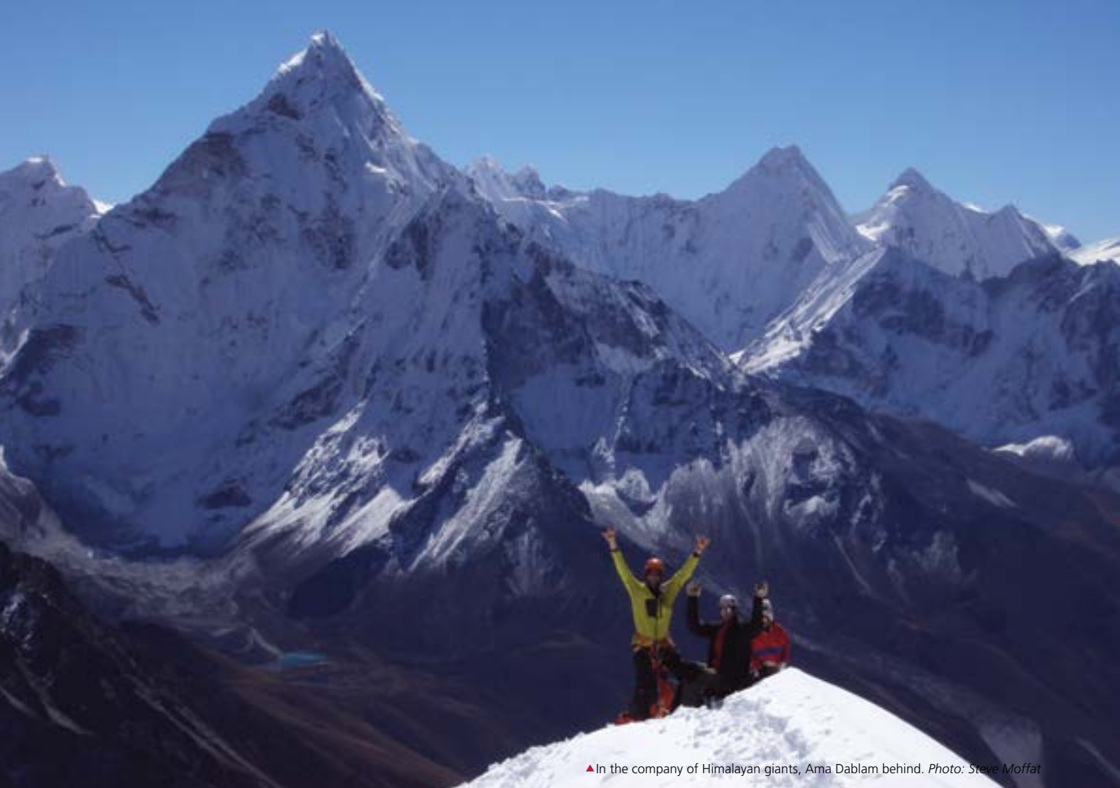
▲ In the company of Himalayan giants, Ama Dablam behind.