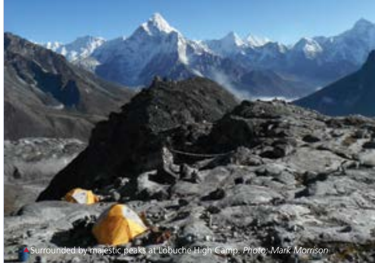
▲ Surrounded by majestic peaks at Lobuche High Camp.