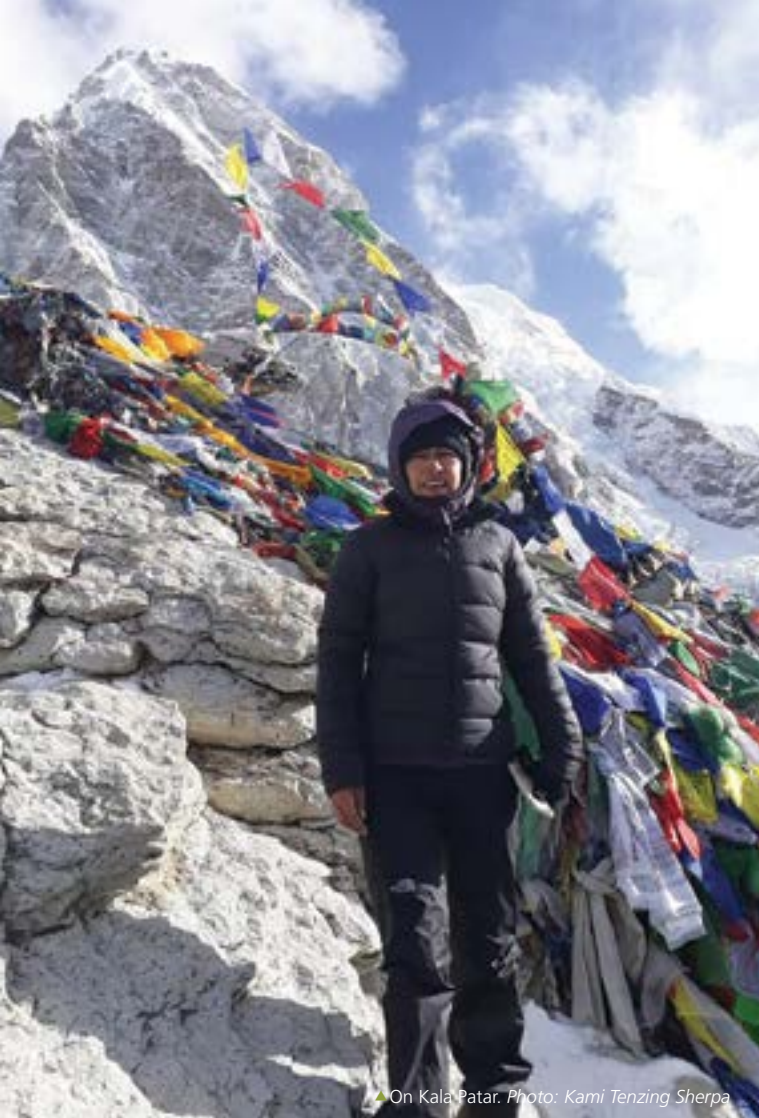
▲ On Kala Patar.