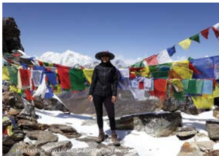
▲ High on the Renjo La.

Namche Bazaar is the centre of trade for the Sherpa people as it has been for hundreds of years. There are many sights to delight in Namche Bazaar and there is always a level of hubbub with all the traders offering bargains from their stalls, shops selling every imaginable piece of copied climbing equipment, as well as the legitimate. There are bakeries, cafes, bars and much more. It is as if one has transcended back to the days of old and there is an honest magic and charm about the busy streets. When you can catch your breath and lift your eyes up from the bustling throngs, you can enjoy a reality check by viewing the dramatic views across the valley to Mt Kwonde, a wonderful backdrop to the unique Sherpa architecture of the houses and lodges here.