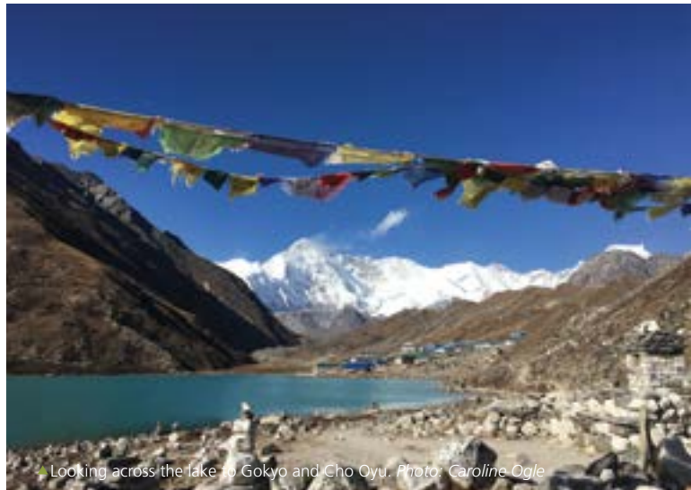
▲ Looking across the lake to Gokyo and Cho Oyu.