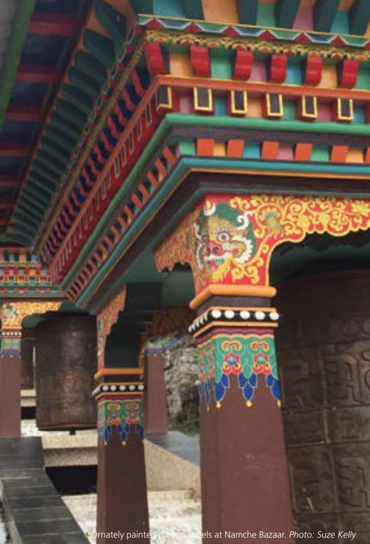
▲ Ornately painted prayer wheels at Namche Bazaar.