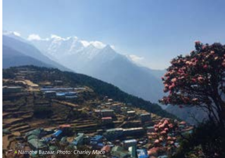
▲ Namche Bazaar.