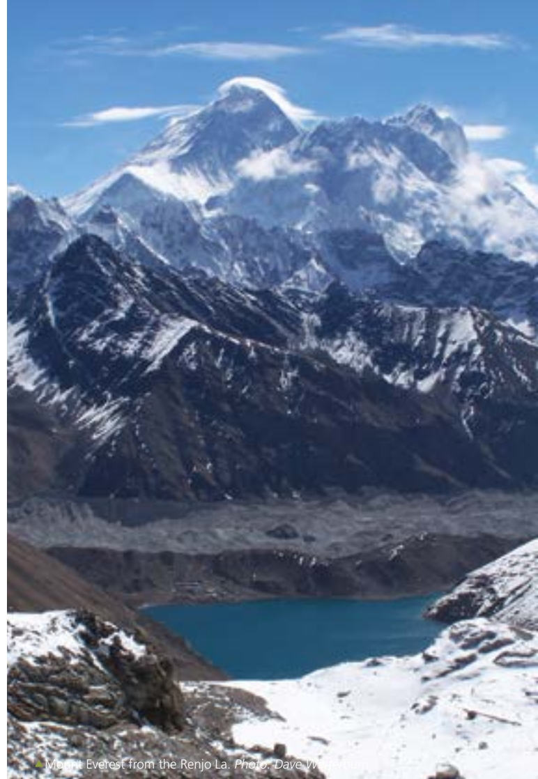
▲ Mount Everest from the Renjo La.