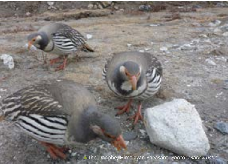
▲ The Danphe, Himalayan Pheasant.