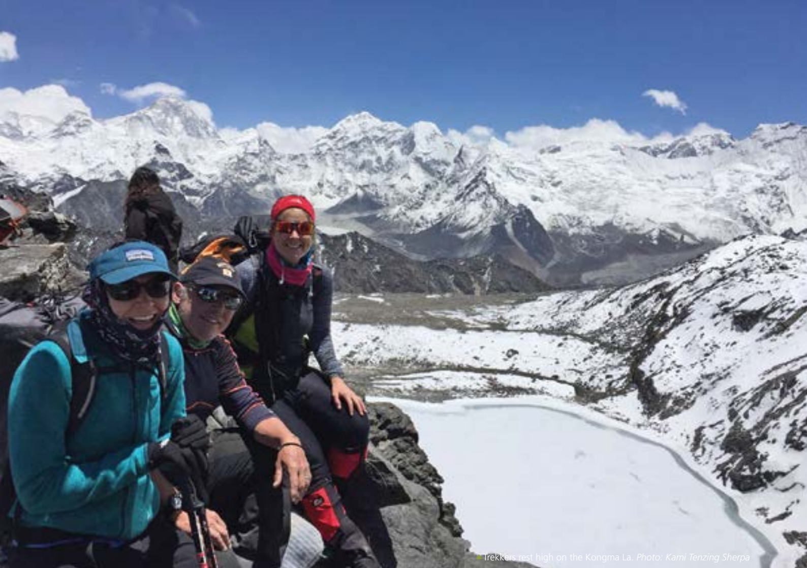
Trekkers rest high on the Kongma La.

Day 22 Thame to Namche Bazaar, 8.5km/5mi