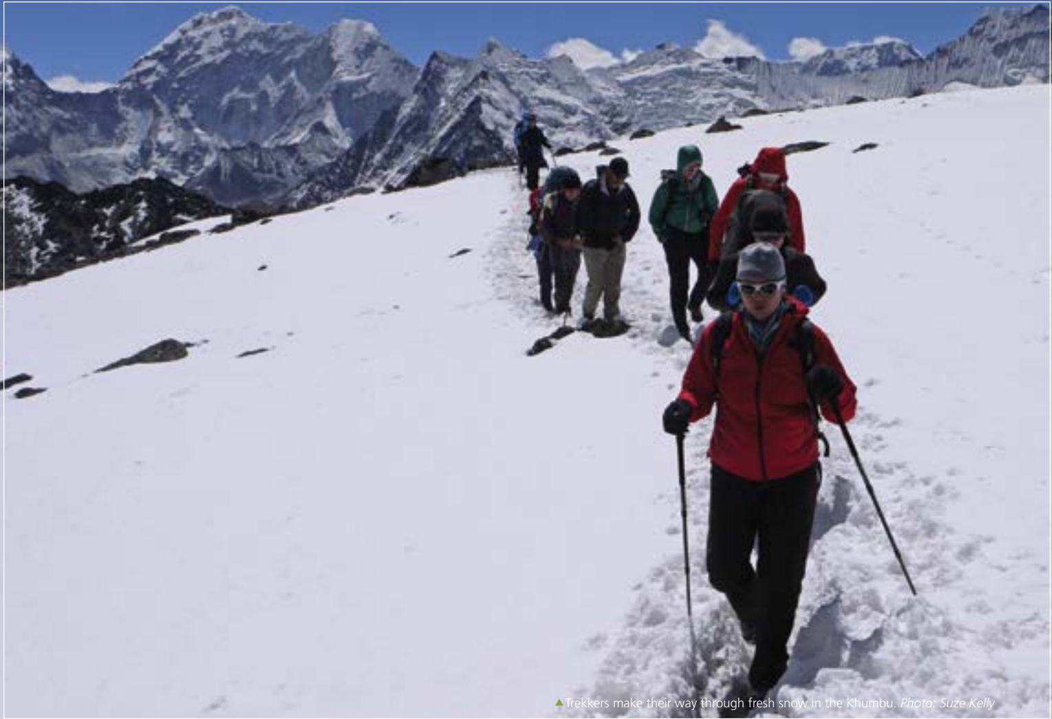
▲ Trekkers make their way through fresh snow in the Khumbu.