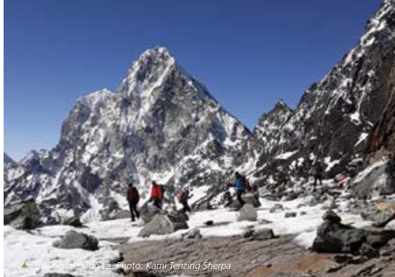
▲ Crossing the Cho La.