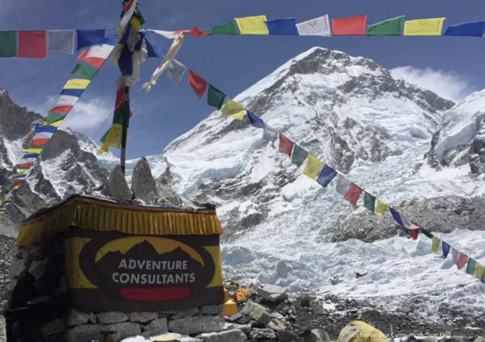
Visit Everest Base Camp.

beneath towering, rugged peaks sometimes dusted in snow. A day is set aside to make a side trip up Gokyo Ri. The one and a half hour climb up Gokyo Ri takes us above the village and the Gokyo Lakes, and is well worth the effort for an unsurpassed panoramic Himalayan view. In clear weather there are good views across to the 8,000m/26,245ft peaks of Mount Everest, Lhotse, Makalu and close by, Cho Oyu. If possible, we may time our visit for the sunset.