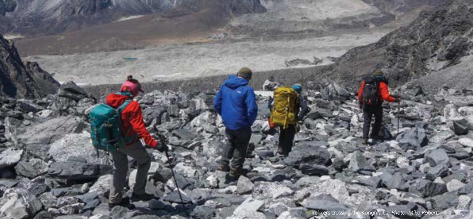
Trekkers crossing the Kongma La.

The trail continues into the ancient village of Pangboche where we may visit the monastery in upper Pangboche, reportedly the very first monastery in the region built by Lamas after they moved into the region from Tibet some 900 years ago. Above Pangboche we say goodbye to the trees as we continue through to Pheriche or Dingboche and open mountainous country. Small stone walled fields protect potato crops that provide the staple diet for the regions people while Yaks wander and graze at will on meagre forage. Small lodges and huts provide reference to the arid landscape giving scale to the backdrop of massive peaks behind. A rest day is had here to aid acclimatisation and gentle walks can be done to stretch the legs.