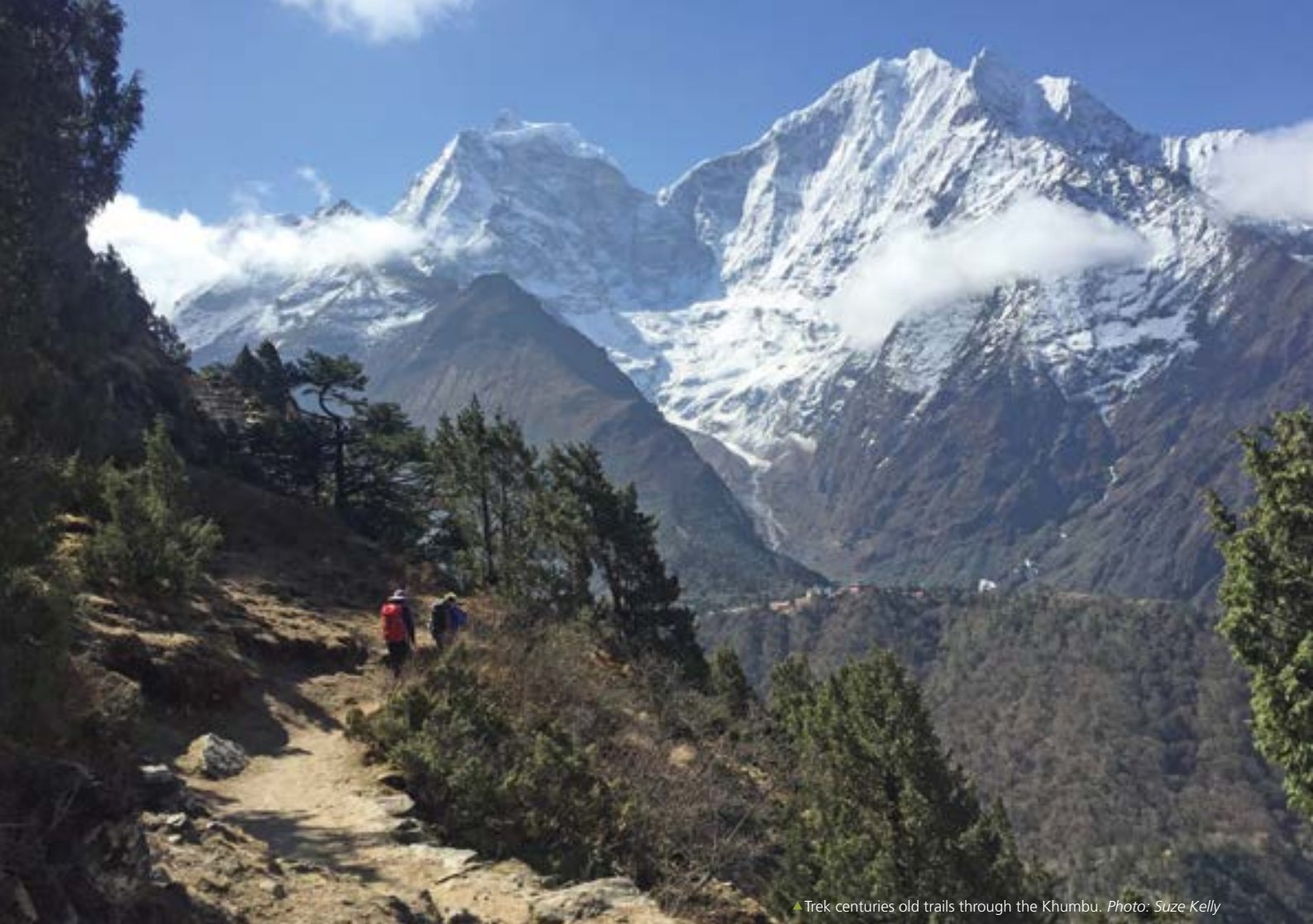
▲ Trek centuries old trails through the Khumbu.