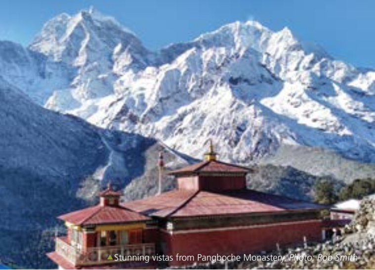
▲ Stunning vistas from Pangboche Monastery.