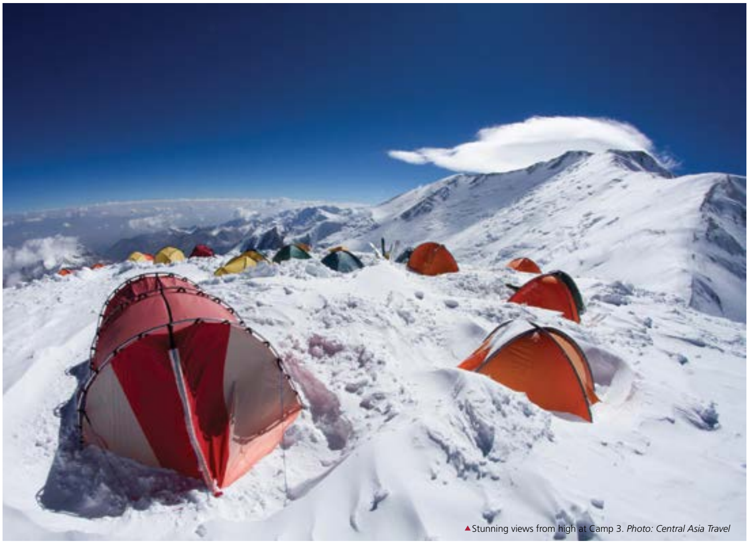
▲ Stunning views from high at Camp 3.