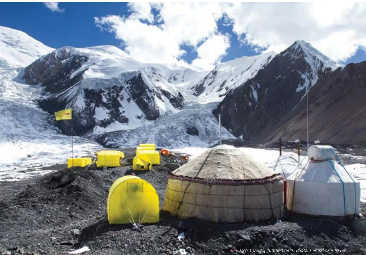
▲ Camp 1 Dining Yurt and tents.

Climbers must be prepared to encounter extreme weather conditions including cold temperatures and high winds, as well as the effects of extreme altitude.