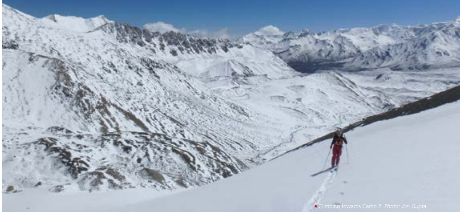
▲ Climbing towards Camp 2.