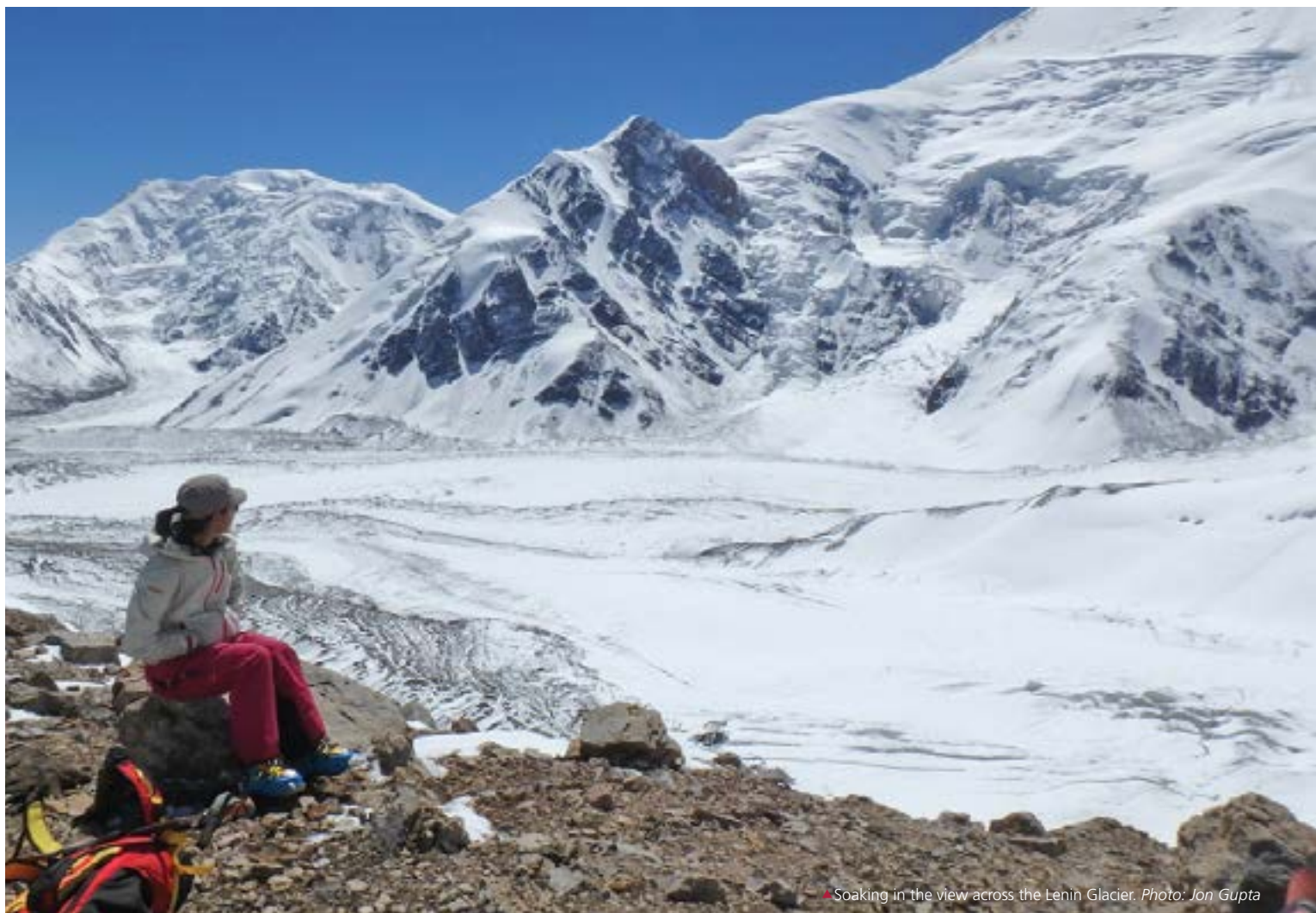
Soaking in the view across the Lenin Glacier.