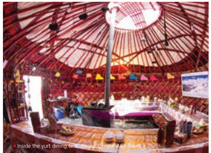
▲ Inside the yurt dining tent.