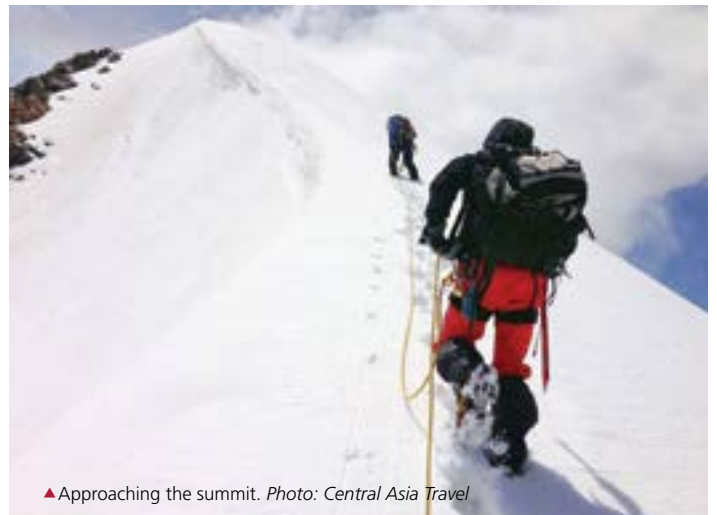
▲ Approaching the summit.