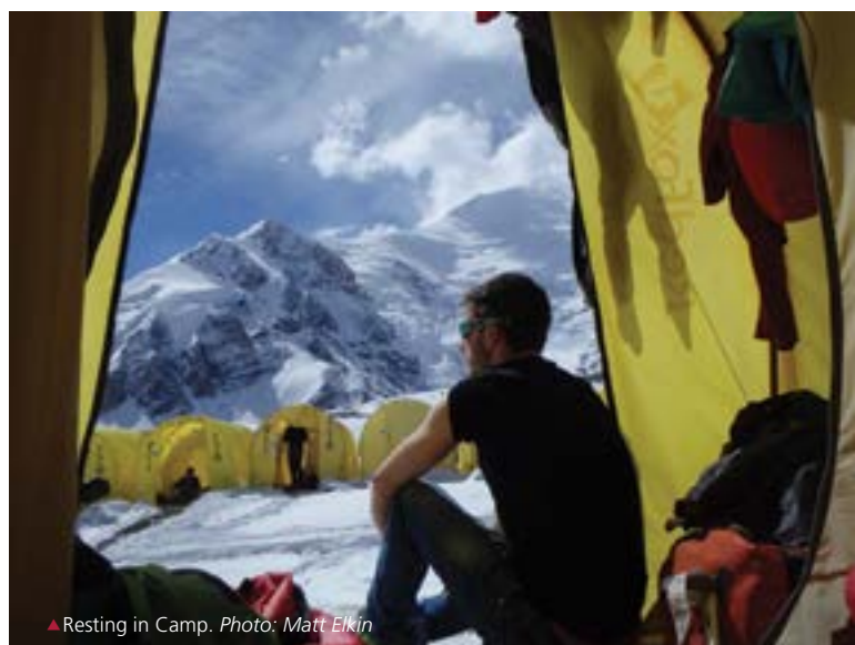
▲ Resting in Camp.

We provide comprehensive pre-trip support once you book onto our expedition. You will be assigned an