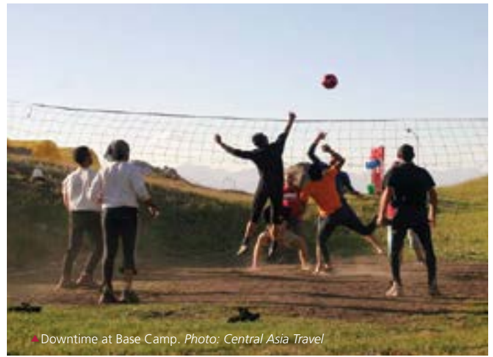
▲ Downtime at Base Camp.