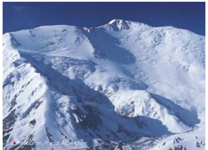
▲ Peak Lenin.