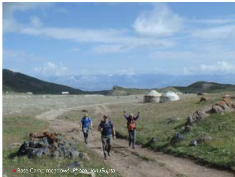
▲ Base Camp meadows.

We arise in the morning to stunning views of snow-clad XIX Party Conference Peak, pointed Petrovskogo Peak and, of course, the inimitable Peak Lenin. Despite being a rest day, we will take an acclimatisation hike towards the 4,910m/16,109ft Petrovskogo Peak. This is an easy and enjoyable climb achieved in a long day from Base Camp and offering rewarding views of Peak Lenin and other surrounding peaks.