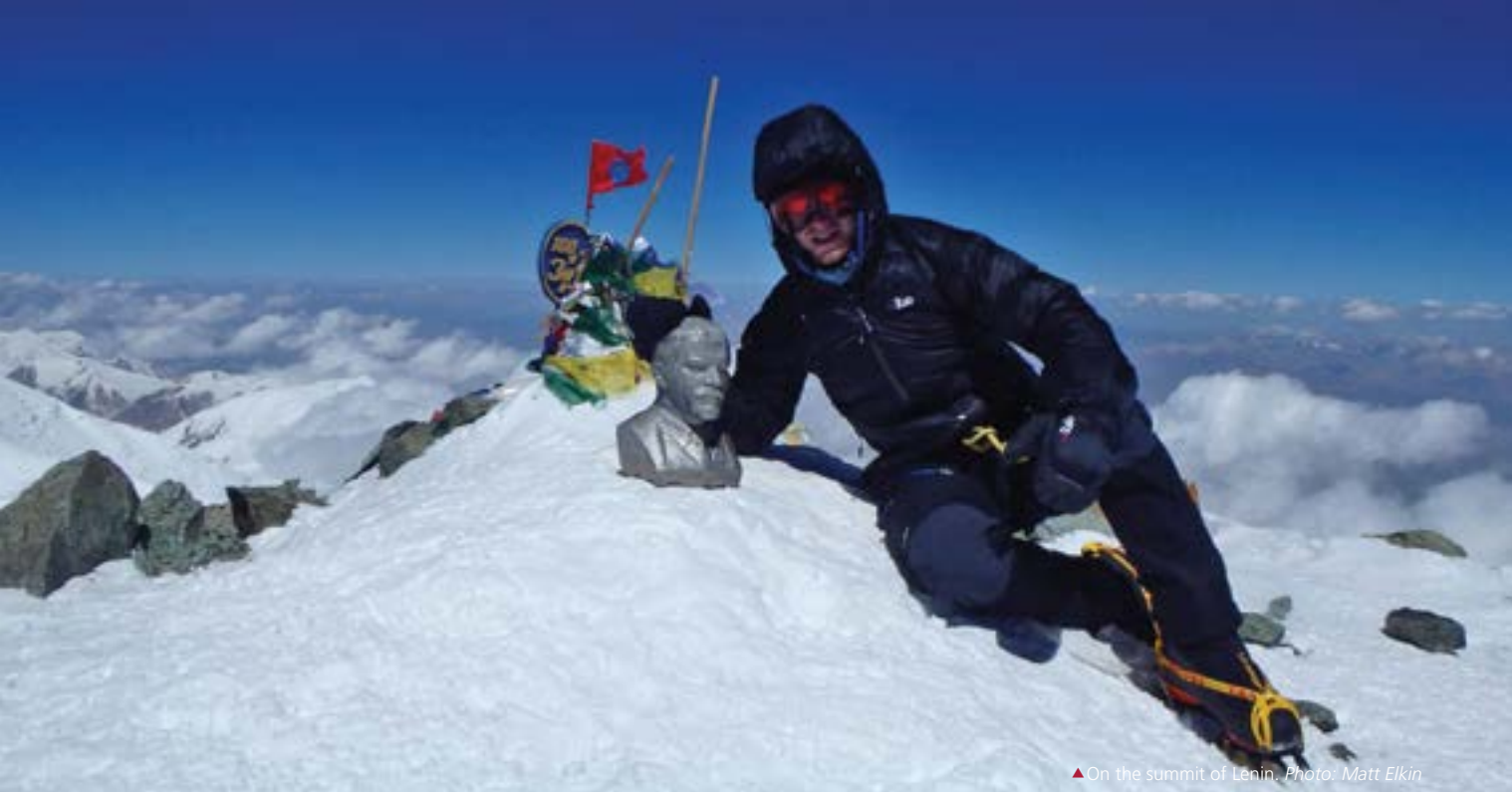
▲ On the summit of Lenin.

Expedition Liaison to assist with your pre-trip planning and we provide an array of extensive travel advice, from visa details to insurance and training tips.