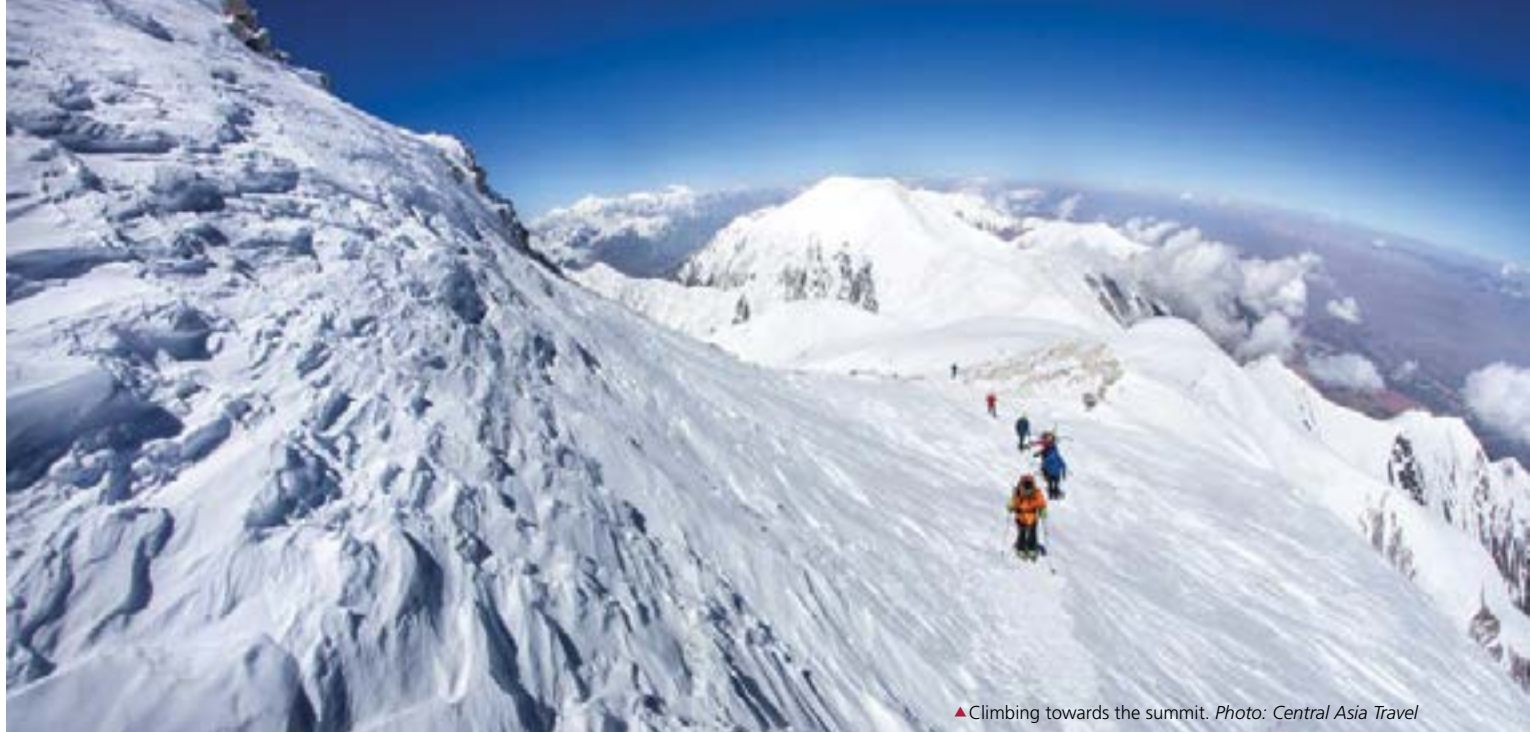
▲ Climbing towards the summit.