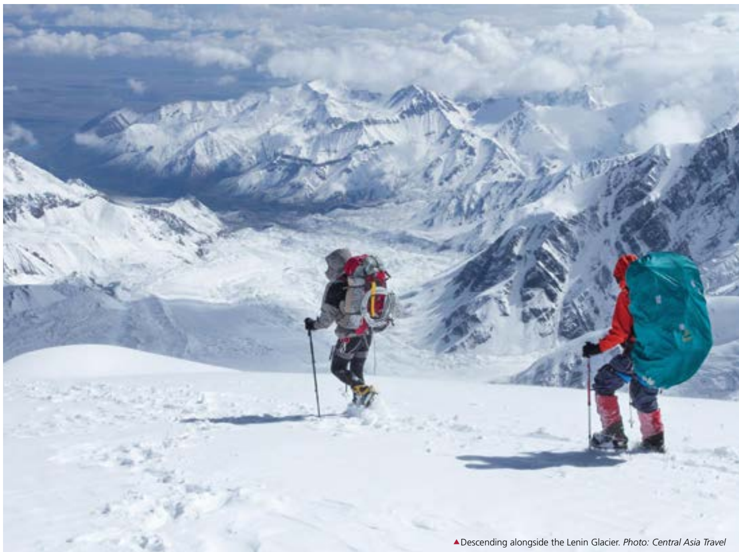
▲Descending alongside the Lenin Glacier.