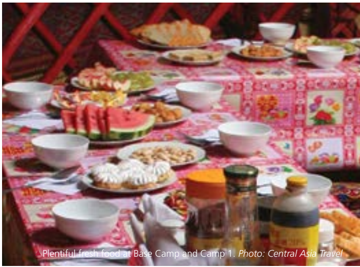
▲ Plentiful fresh food at Base Camp and Camp 1.