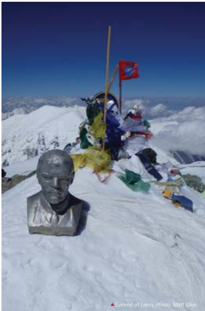
▲ Summit of Lenin.