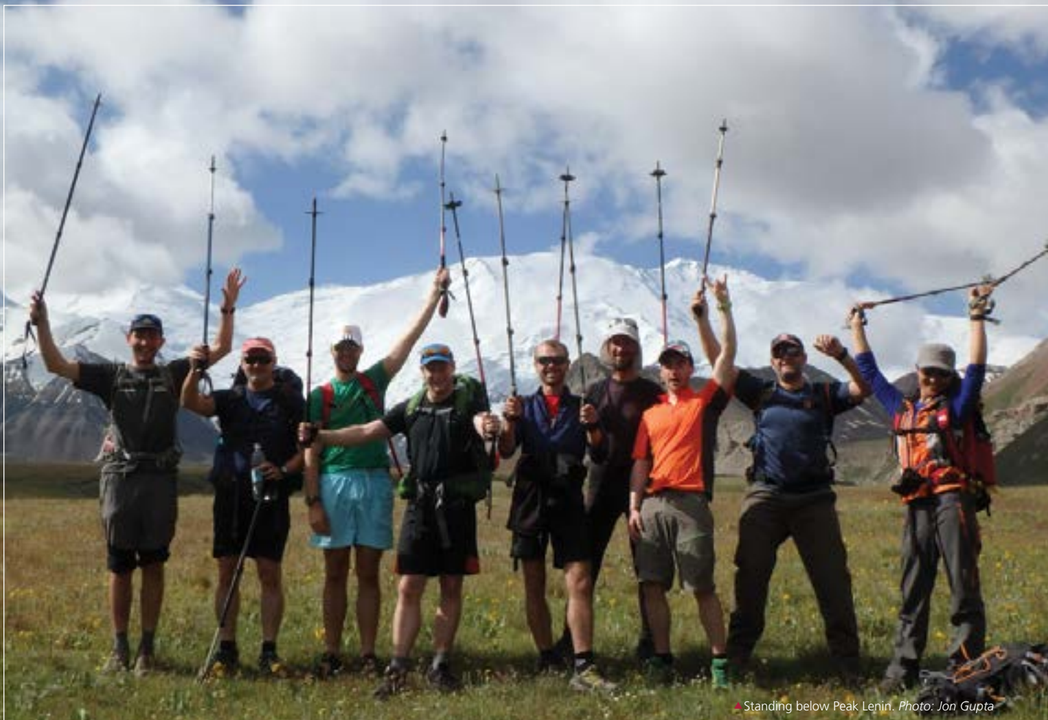
▲ Standing below Peak Lenin.