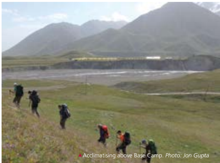
▲ Acclimatising above Base Camp.