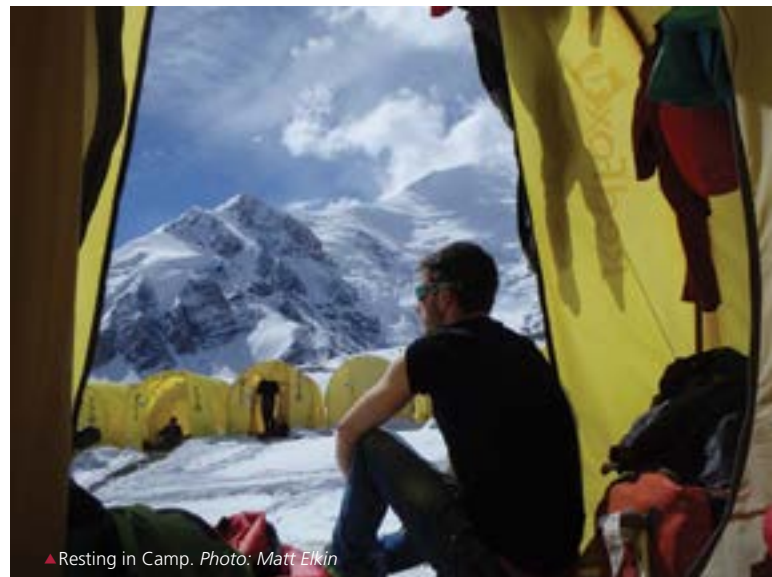
▲ Resting in Camp.

Expedition members will be provided with a medical questionnaire by the expedition doctor and asked to visit their family physician to receive a full medical