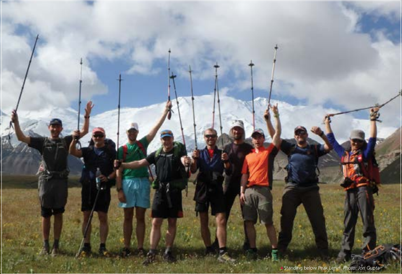
▲ Standing below Peak Lenin.