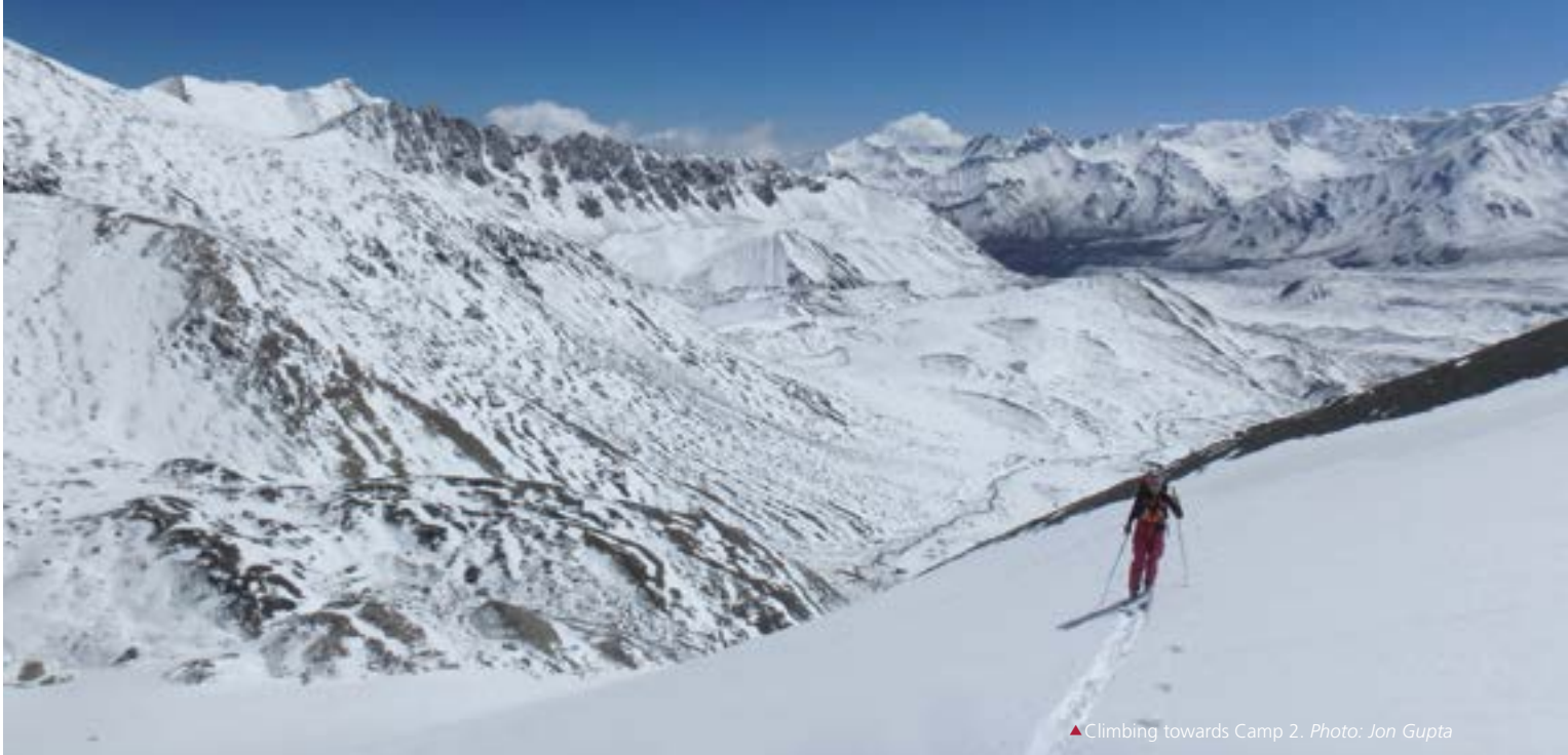
▲ Climbing towards Camp 2.