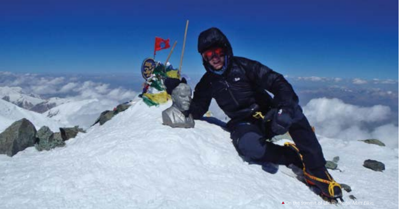
▲ On the summit of Lenin.

examination. This information will be sighted only by our medical adviser and the Expedition Leader and treated with full confidentiality. Advice on immunisations will be provided at this time. We also require members to obtain rescue insurance and we will consult with individual team members regarding your insurance needs and solutions for coverage.