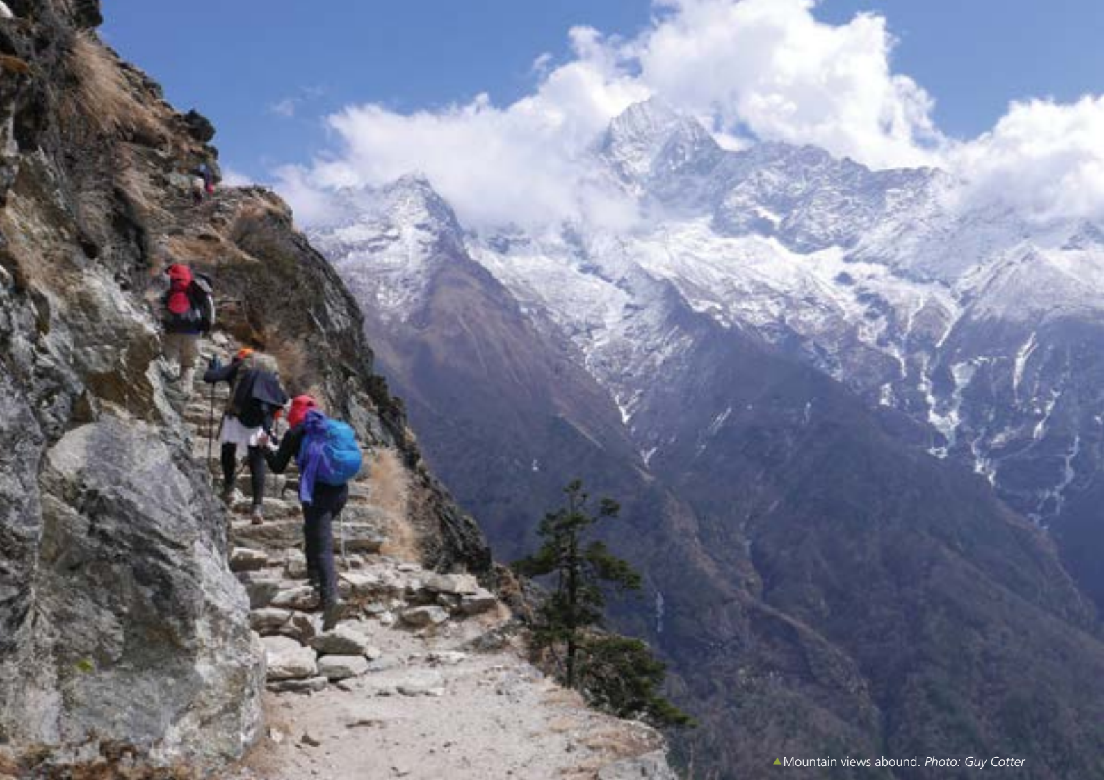
▲Mountain views abound.

NOTE: All bank transfer charges are for the remitter's account.