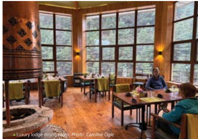
▲ Luxury lodge dining room.