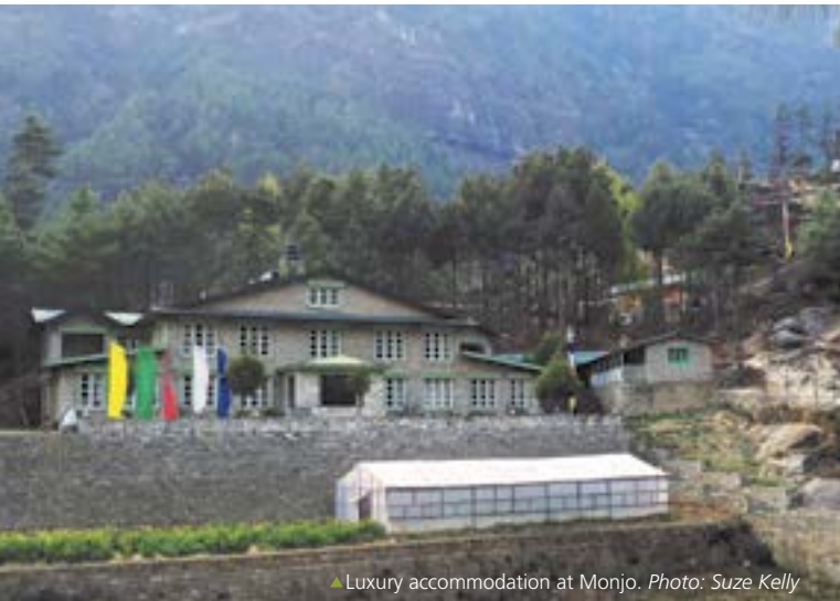
▲ Luxury accommodation at Monjo.