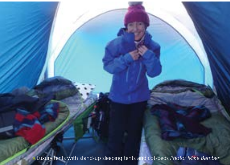
▲ Luxury tents with stand-up sleeping tents and cot-beds