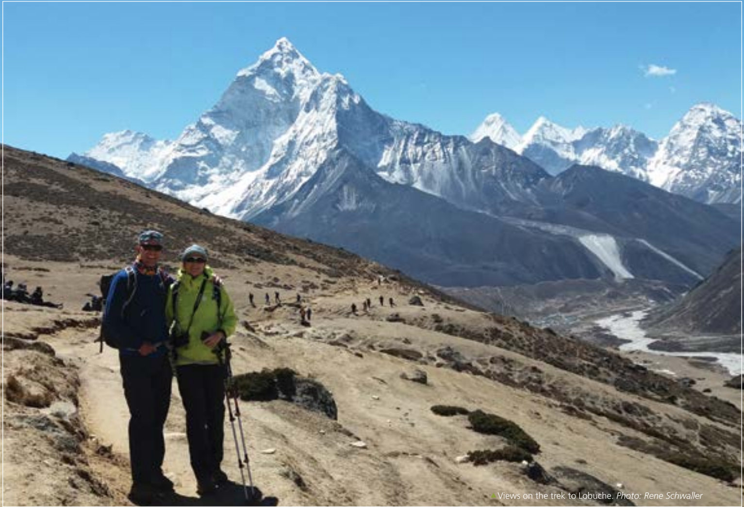
▲ Views on the trek to Lobuche.