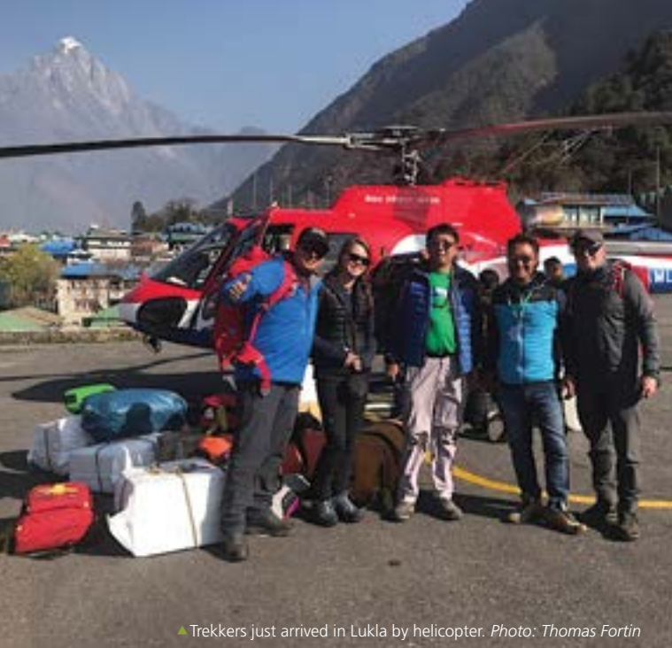
▲ Trekkers just arrived in Lukla by helicopter.