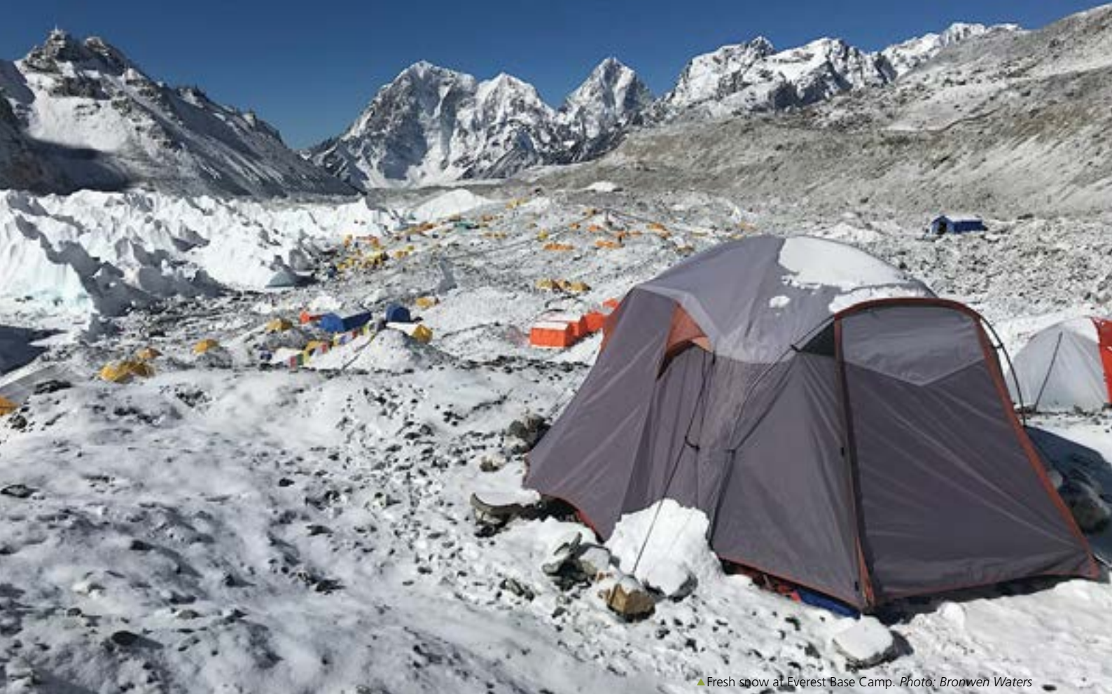
▲ Fresh snow at Everest Base Camp.