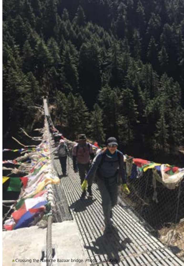
▲ Crossing the Namche Bazaar bridge.