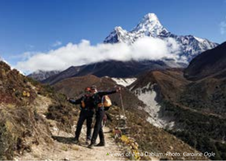
▲ Views of Ama Dablam.