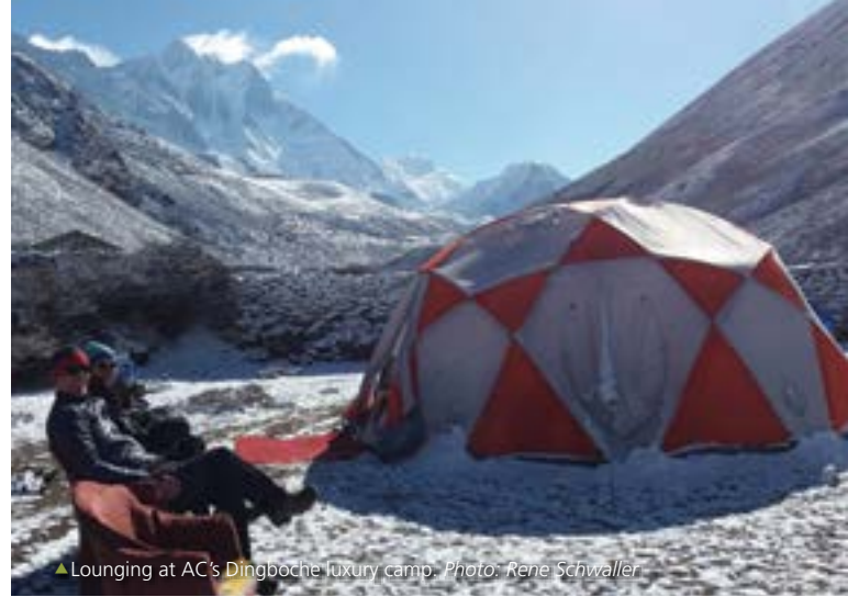
▲ Lounging at AC's Dingboche luxury camp.