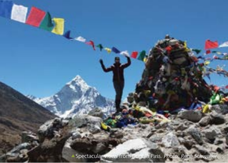
▲ Spectacular views from Dughla Pass.