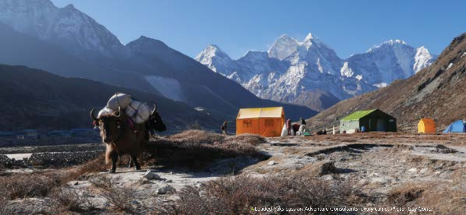
Loaded Yaks pass an Adventure Consultants luxury camp.

views of Everest can be magical, and we hope to enjoy a photographic session with you there! We spend a final night in Gorak Shep before our spectacular scenic helicopter flight back to Kathmandu.