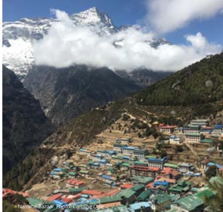
▲ Namche Bazaar.

There is the issue of altitude to contend with which is incorporated into our trekking itinerary. We have included rest days at the relevant elevations to allow our bodies to adjust to the thin air and we carry sufficient medication to deal with most altitude related problems. Experience has shown us that good hydration, rest days at significant elevations and good base fitness help avoid any significant problems during this trek.