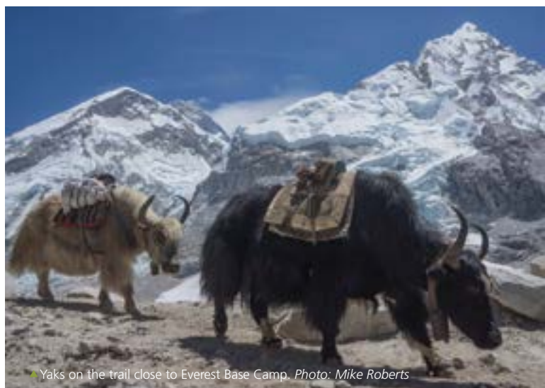
▲ Yaks on the trail close to Everest Base Camp.

The trek fee does not include the following: