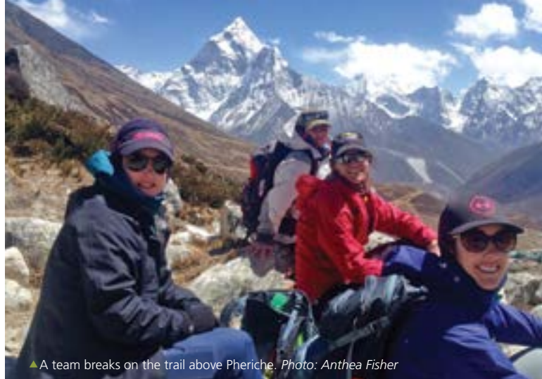
▲ A team breaks on the trail above Pheriche.