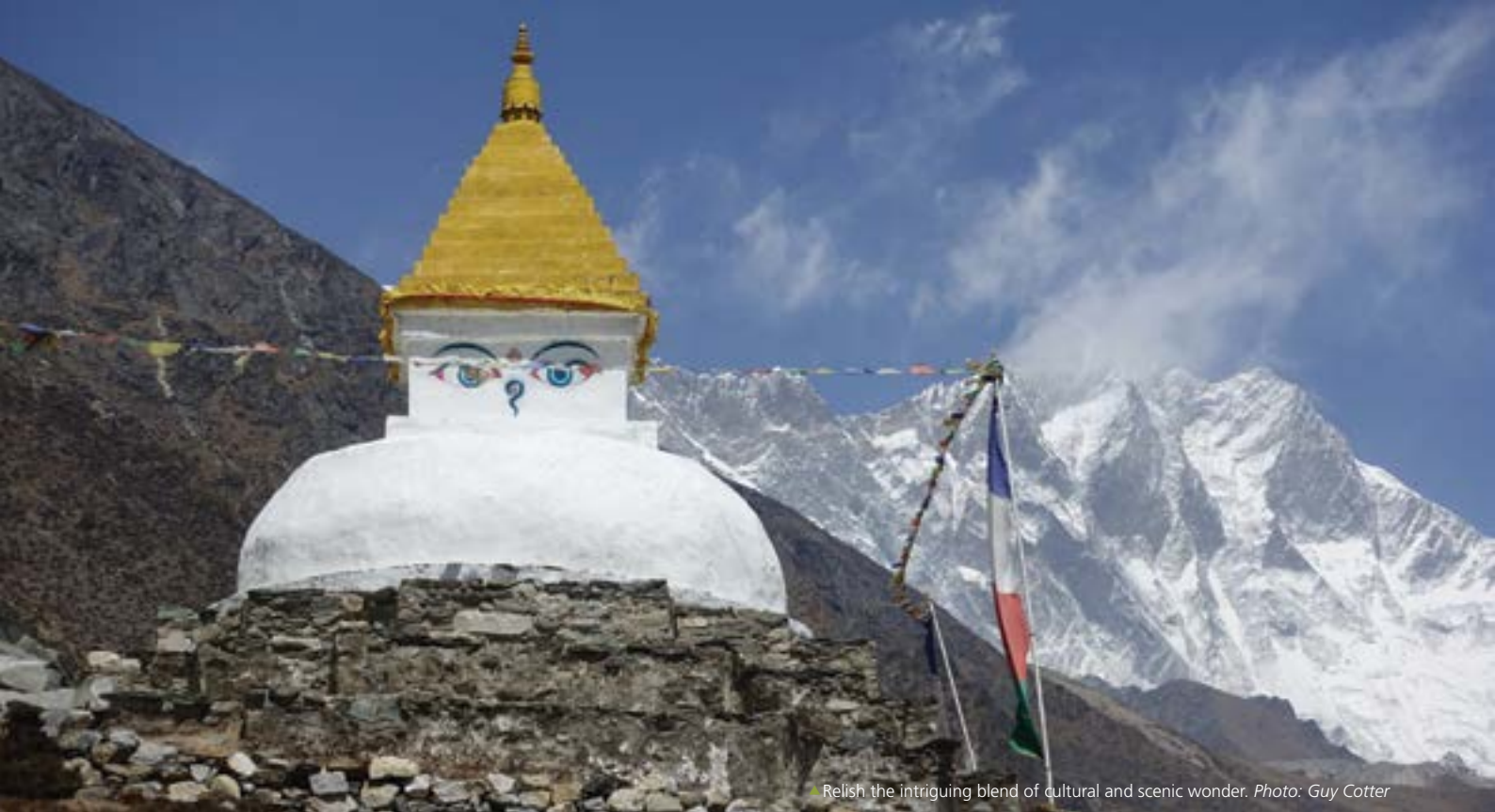
Relish the intriguing blend of cultural and scenic wonder.