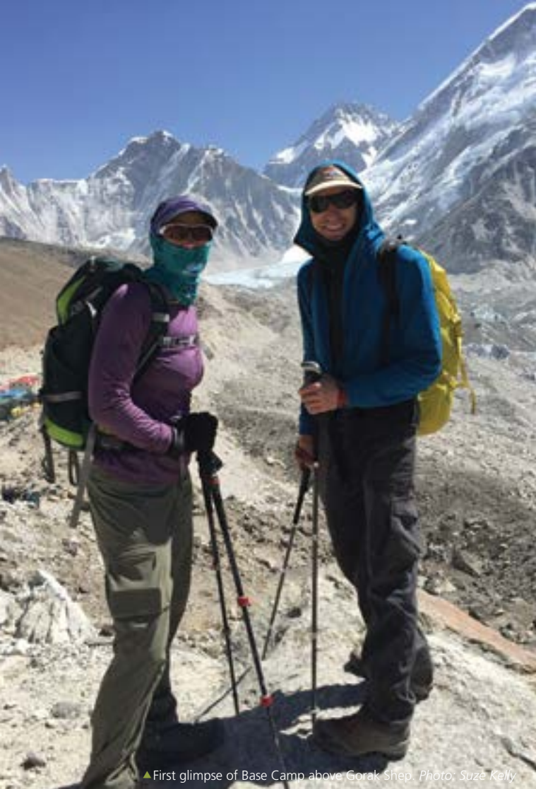
▲ First glimpse of Base Camp above Gorak Shep.