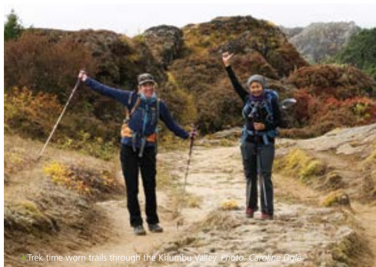
▲ Trek time worn trails through the Khumbu Valley.

There is also the option to extend the trip by including a side trip to the Gokyo Valley.