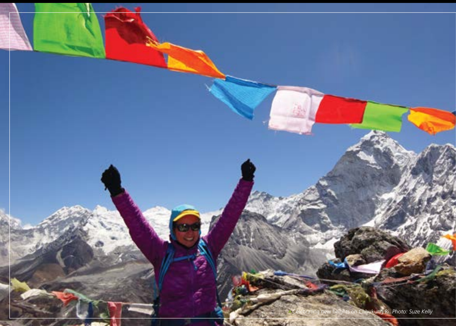
Celebrating new heights on Chhukung Ri.