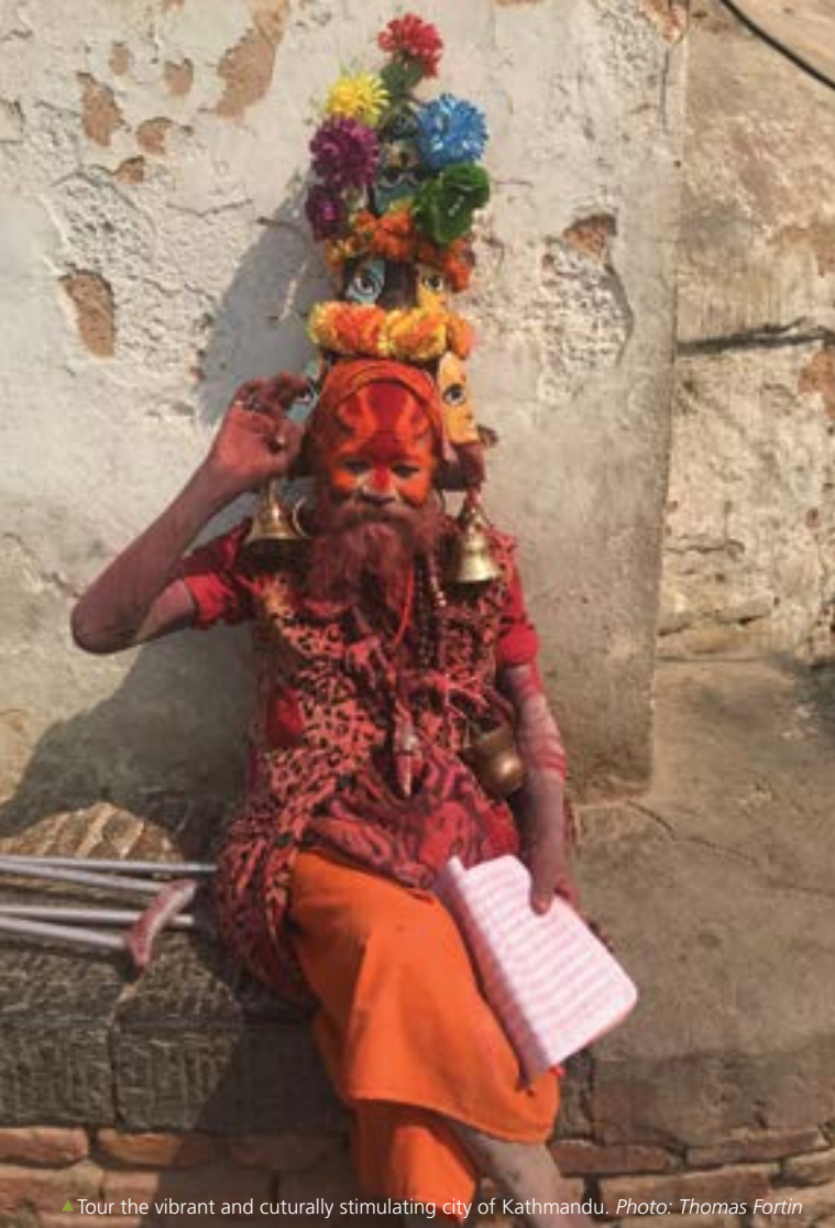
▲ Tour the vibrant and culturally stimulating city of Kathmandu.