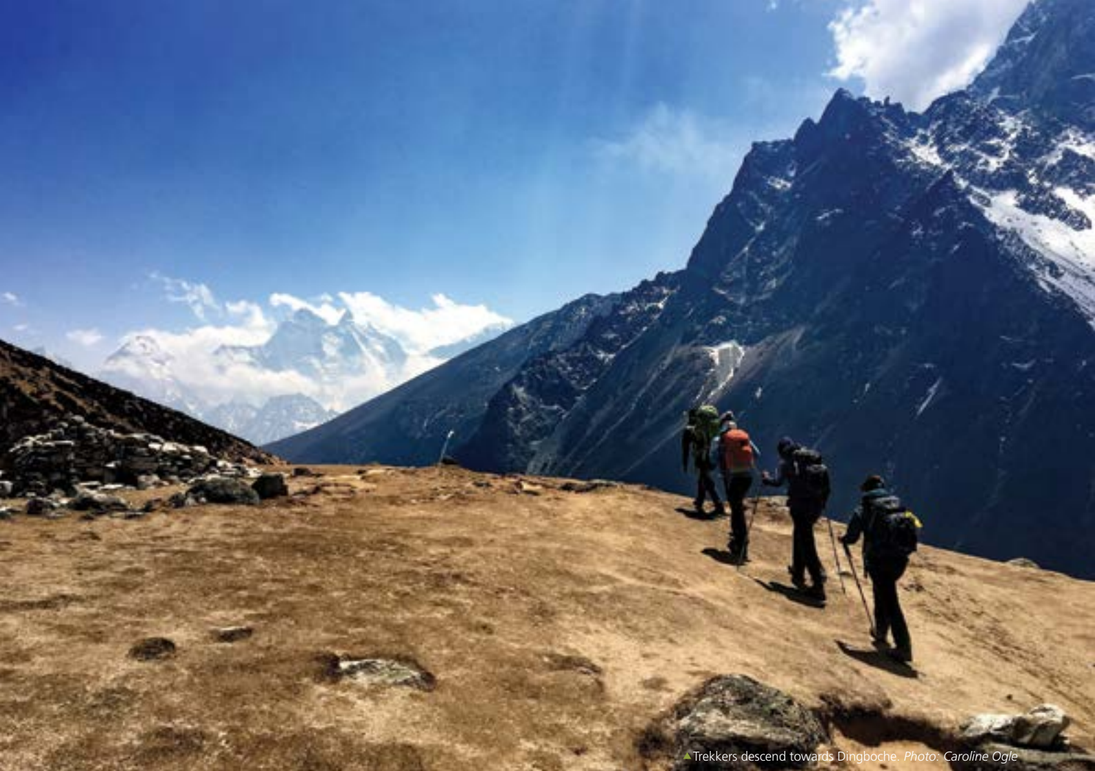
▲ Trekkers descend towards Dingboche.

A trek member may then cancel their participation on the following basis: