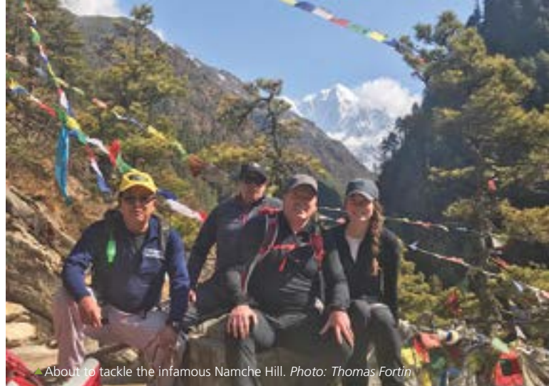
▲ About to tackle the infamous Namche Hill.