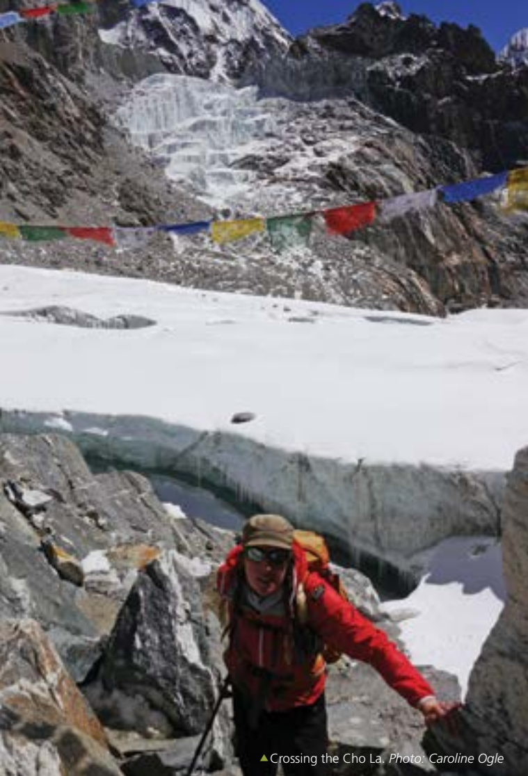
▲ Crossing the Cho La.