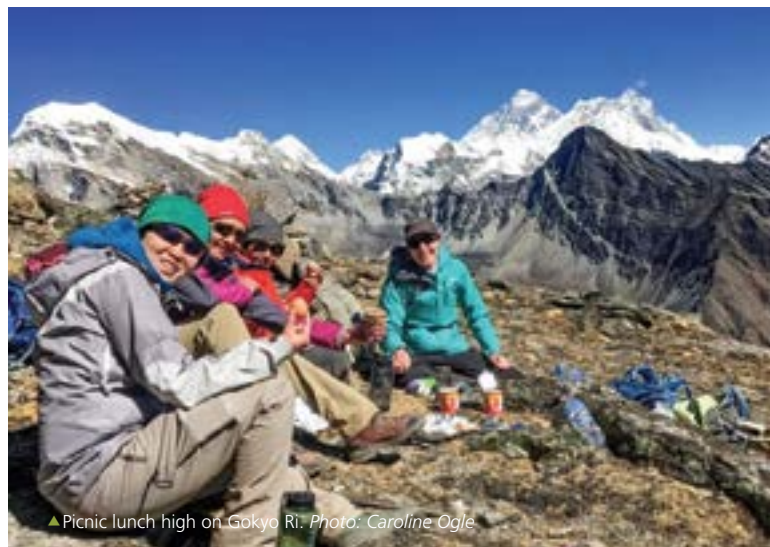
▲ Picnic lunch high on Gokyo Ri.