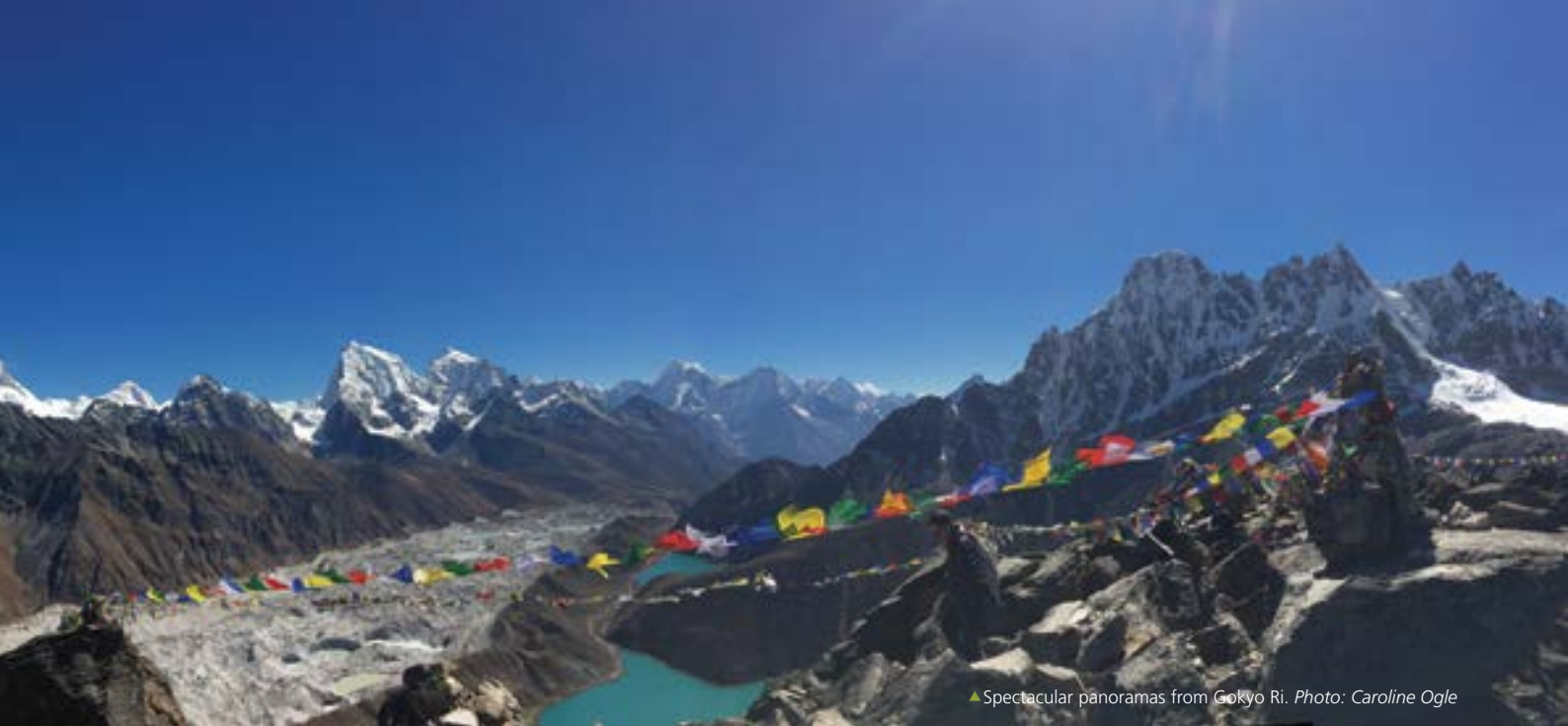
▲ Spectacular panoramas from Gokyo Ri.