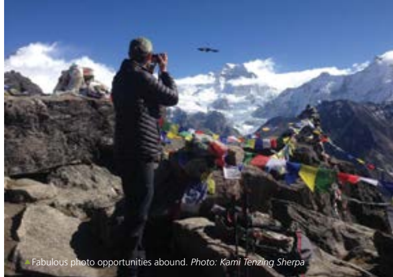
▲ Fabulous photo opportunities abound.