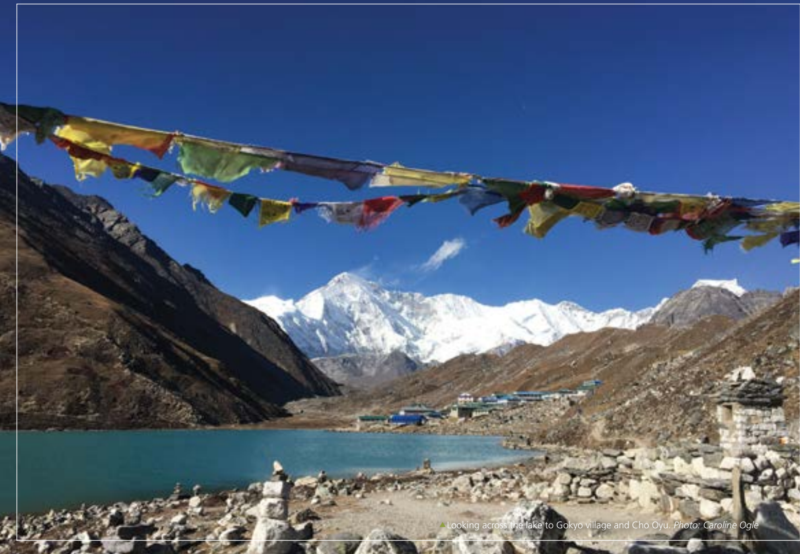
▲ Looking across the lake to Gokyo village and Cho Oyu.