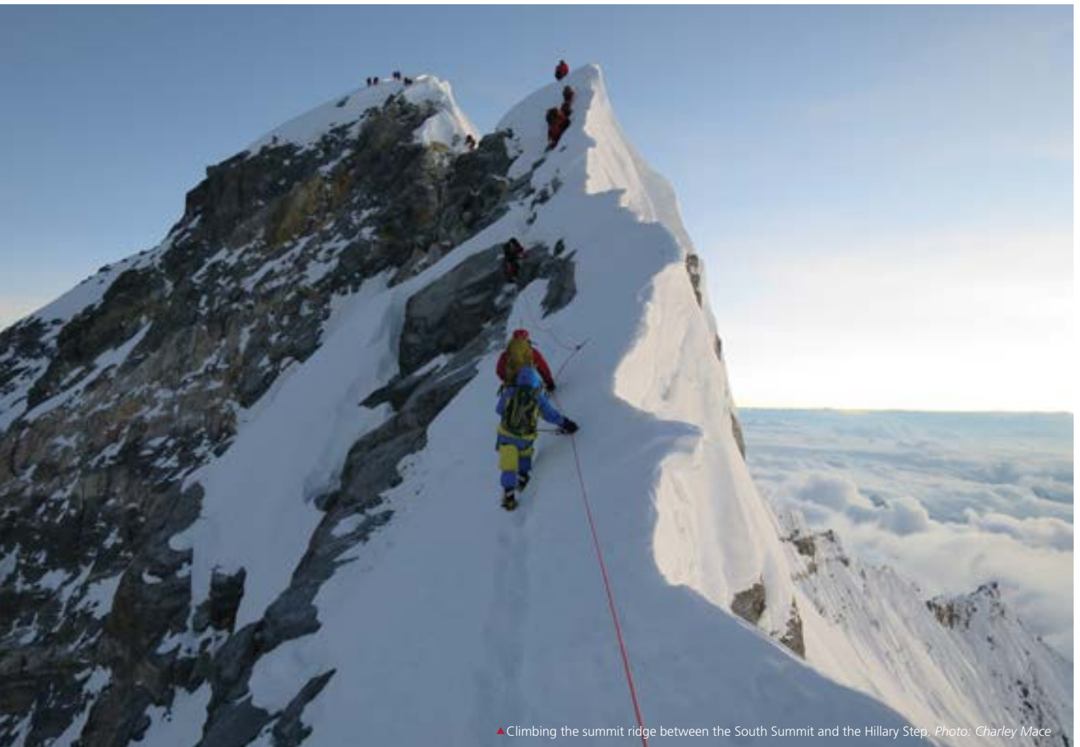
▲ Climbing the summit ridge between the South Summit and the Hillary Step.