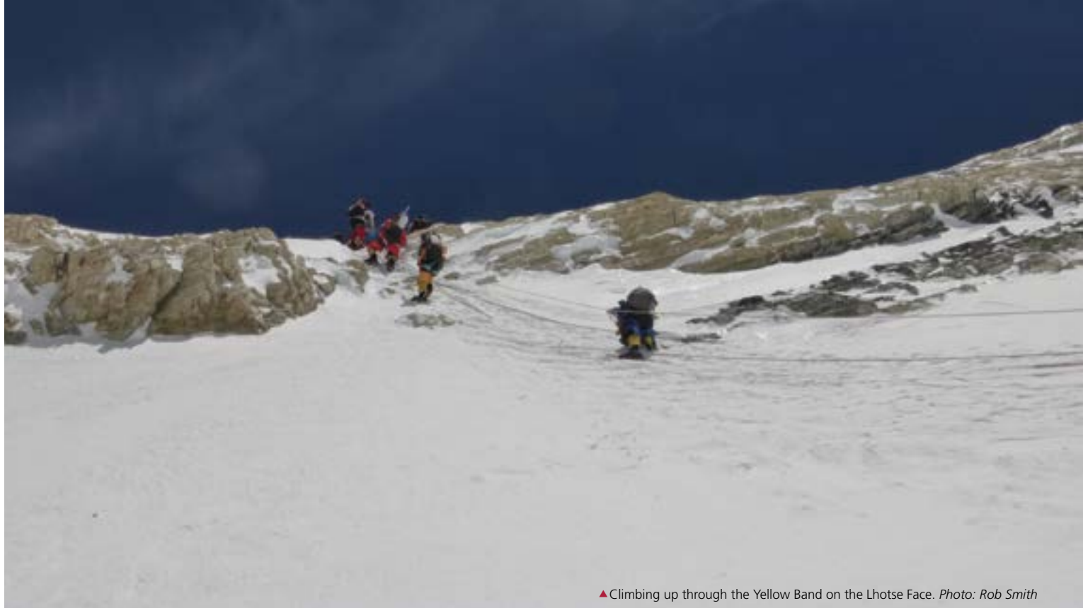
▲ Climbing up through the Yellow Band on the Lhotse Face.