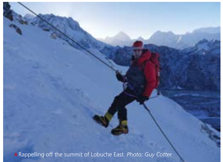
▲ Rappelling off the summit of Lobuche East.