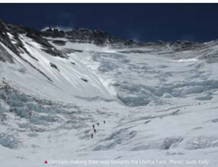
▲Climbers making their way towards the Lhotse Face.

There is no definite measure for assessing the required skill level to climb Mount Everest, so we do like to discuss