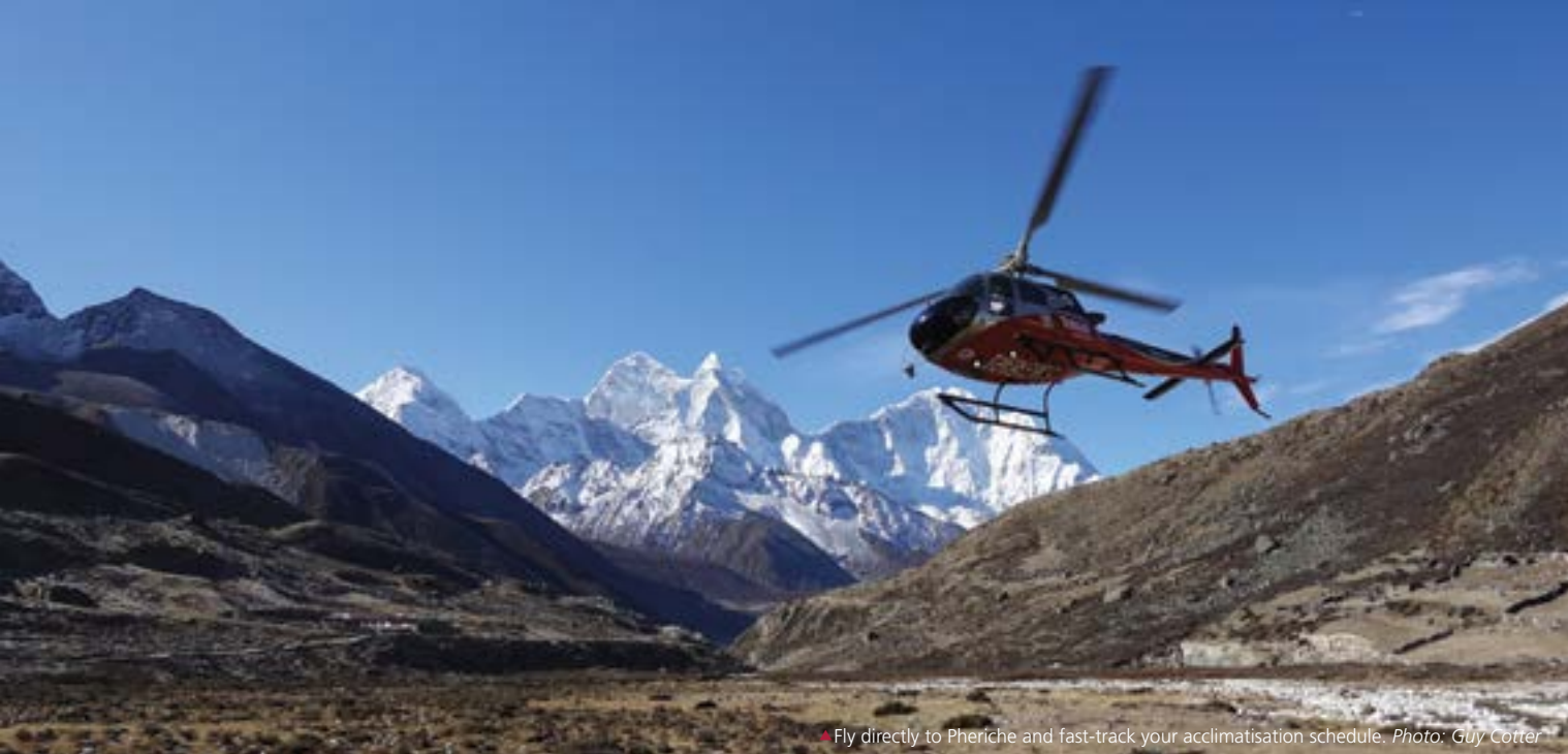
▲ Fly directly to Pheriche and fast-track your acclimatisation schedule.

Route' some non-Everest climbers have termed it. However, it is imperative that expedition members are well versed in the latest techniques and have experience in the high mountain environment.