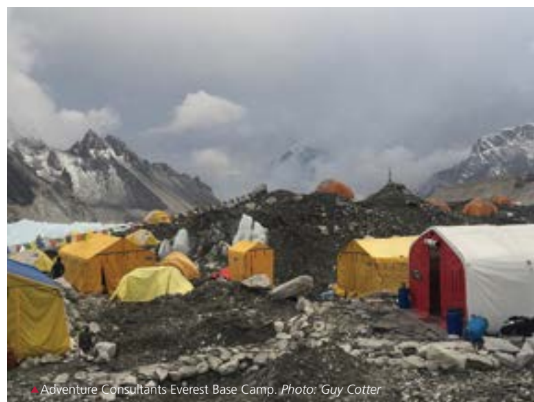
▲ Adventure Consultants Everest Base Camp.

Many have found this critical to their success on Everest and we have seen our summit rate increase dramatically