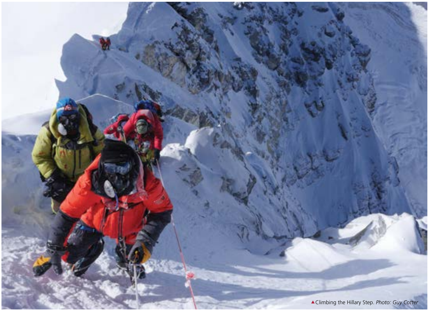
▲ Climbing the Hillary Step.