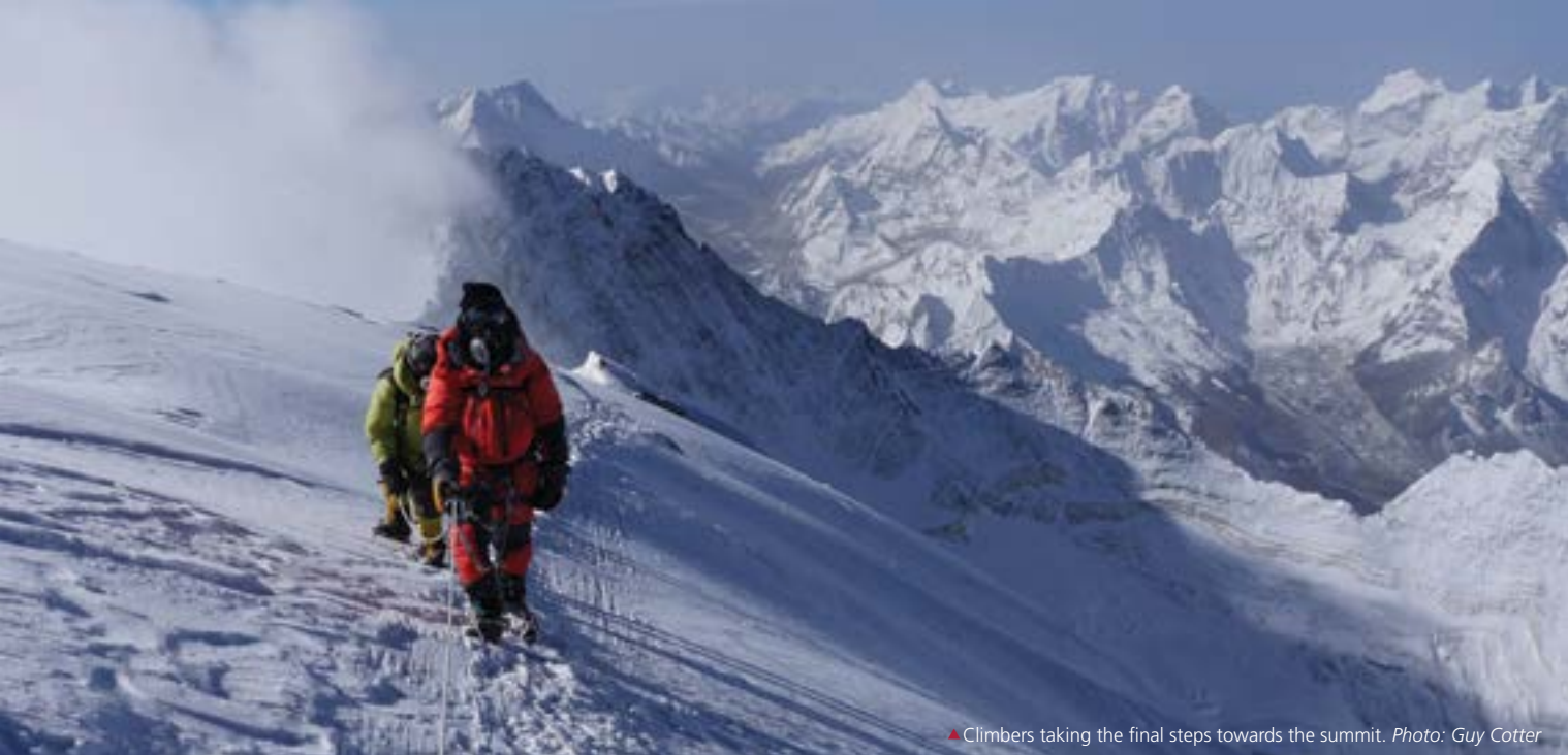
▲ Climbers taking the final steps towards the summit.