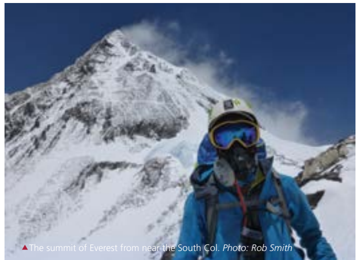
▲ The summit of Everest from near the South Col.