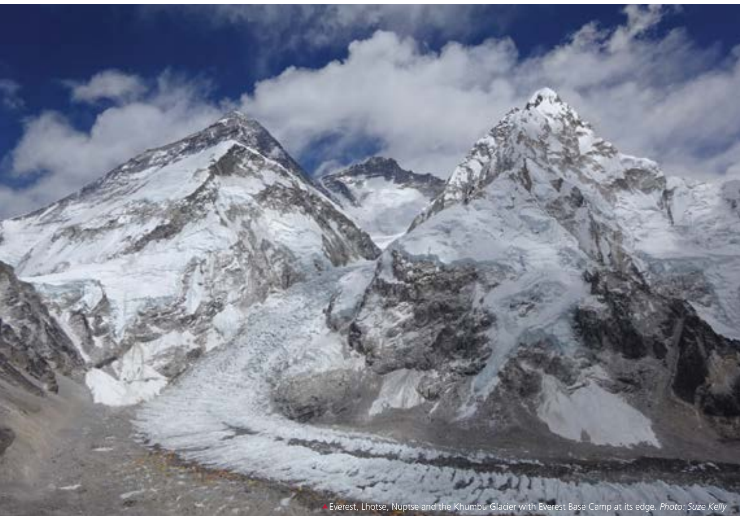
• Everest, Lhotse, Nuptse and the Khumbu Glacier with Everest Base Camp at its edge.

the obligatory summit photo and is a time to reflect on the journey thus far. For many, it is one of the most poignant moments of a lifetime.