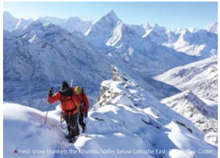
▲ Fresh snow blankets the Khumbu Valley below Lobuche East.