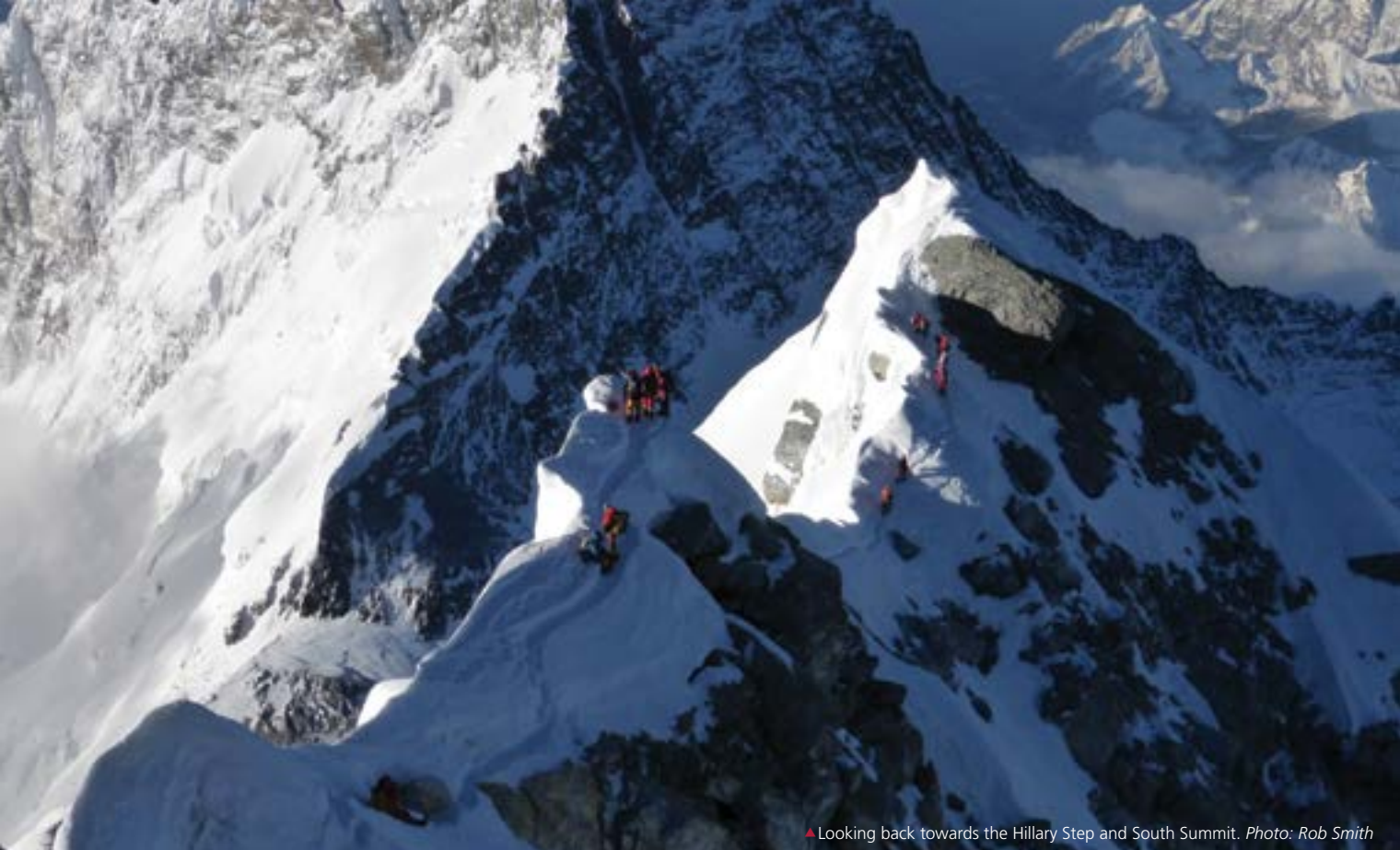
▲ Looking back towards the Hillary Step and South Summit.

Ample resources will be on call to support every climber, not just the first team or fittest members. Remember, this is an expedition led by guides who have already climbed Everest and whose job it is to look after your interests. This should not be confused with a 'professionally led' expedition, where often you may be buying a place in a team with fewer support services and led by climbers who are attempting the summit primarily for themselves. There are also 'Sherpa led' expeditions where you are placed in the hands of a Sherpa for the climb. This can seem alluring, especially when some expedition operators will encourage you to join so they can fill their available spaces, but all too often these are expeditions with over 20 members! The Sherpas are not trained in medical techniques and are often reluctant to act effectively in situations requiring urgency. This is where the skills and experience of your Western Guide become invaluable. Too often expedition members find out the deficiencies of their guides/operators when things begin to go wrong and that is usually too late.