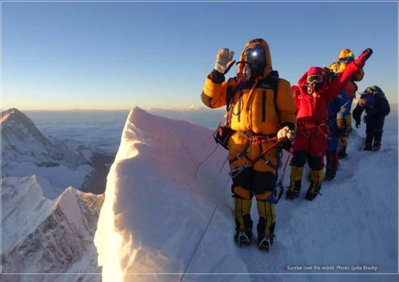
▲ Sunrise over the world.