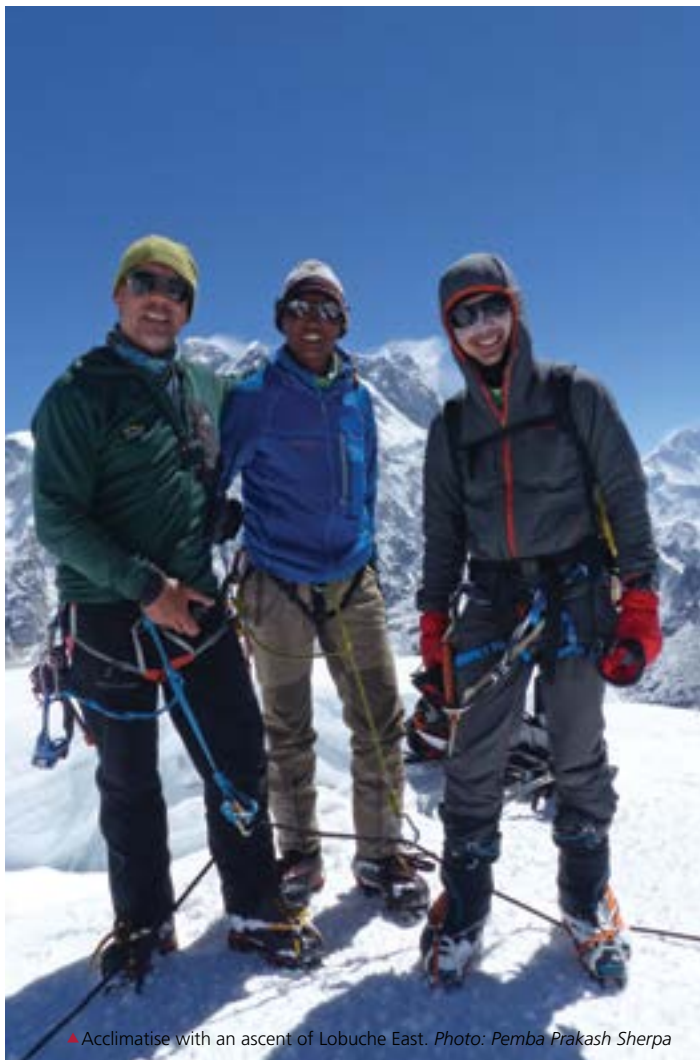
▲ Acclimatise with an ascent of Lobuche East.