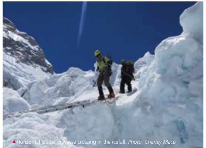
▲ Horizontal ladder crevasse crossing in the icefall.

people who are focused on reaching the summit in good style with the highest level of support and safety standards, as can be provided by a guiding service on Mount Everest accompanied by the best standards of food and equipment that is attainable.