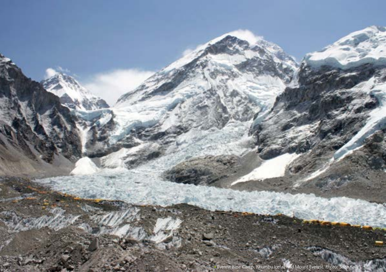
▲ Everest Base Camp, Khumbu Icefall and Mount Everest.