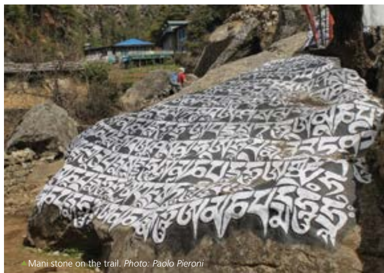
▲ Mani stone on the trail.

There are many sights to delight in Namche Bazaar with dramatic views across the valley to Mount Kwonde, a wonderful backdrop to the unique Sherpa architecture of the houses and lodges here. On our rest day, we explore the local Sherpa Museum and bustling Namche markets, or for those feeling energetic there is the possibility of a hike to visit to Sir Edmund Hillary's first hospital in Nepal, which is situated in the village of Kunde and sample high altitude croissants at the bakery in Khumjung.