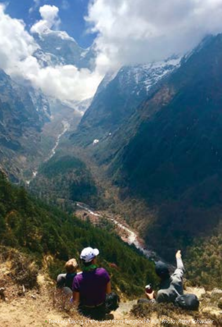
▲ Trekkers taking in the view from Tengboché Hill.