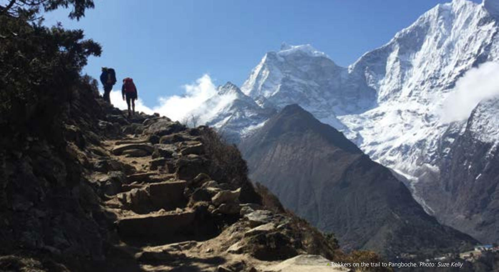
▲ Trekkers on the trail to Pangboche.

If you are travelling alone or if there are just 2–3 of you, then you will need to join our main departures from Kathmandu on March 30, April 8 or October 6 or, alternatively, one of our Luxury Everest Base Camp Trek departures.