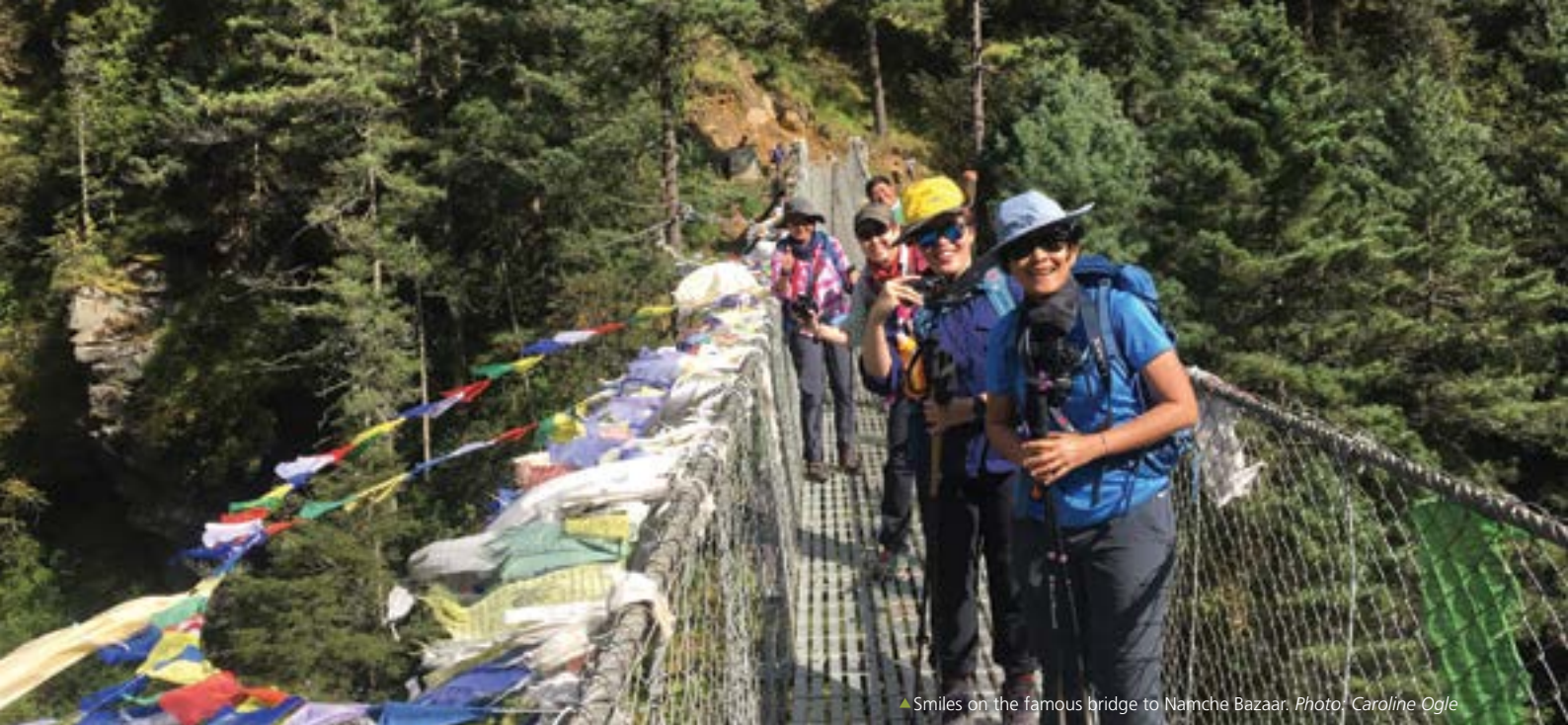
▲ Smiles on the famous bridge to Namche Bazaar.