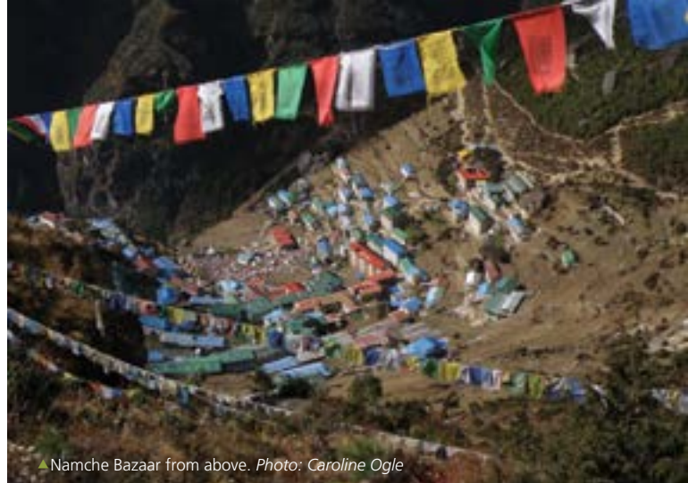
▲ Namche Bazaar from above.