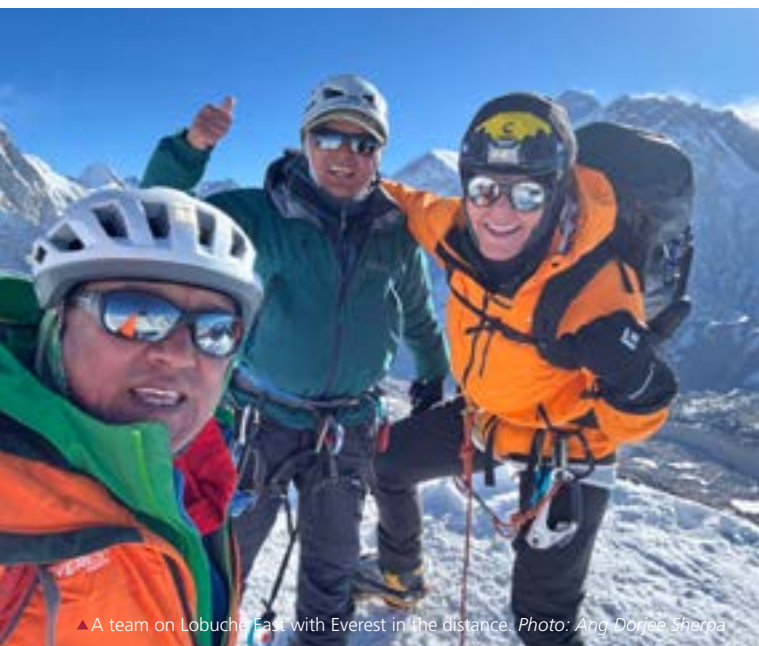
▲ A team on Lobuche East, with Everest in the distance.

By the time you first arrive at Base Camp, a route will already be established with ropes and ladders through to Camp 1. Our strong Sherpa team will be busily involved in ferrying loads of equipment up the mountain. After a few days acclimatisation and training at Base Camp, descend down valley, where we will spend our first rotation acclimatising and sleeping high on Lobuche East (6,119m/20,075ft).