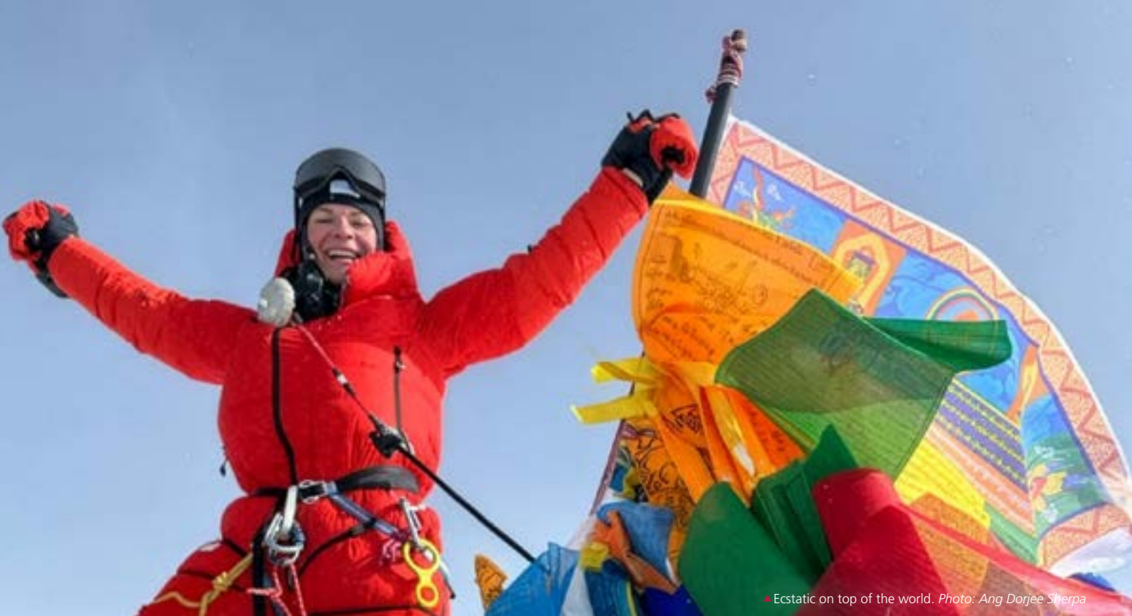
▲ Ecstatic on top of the world.