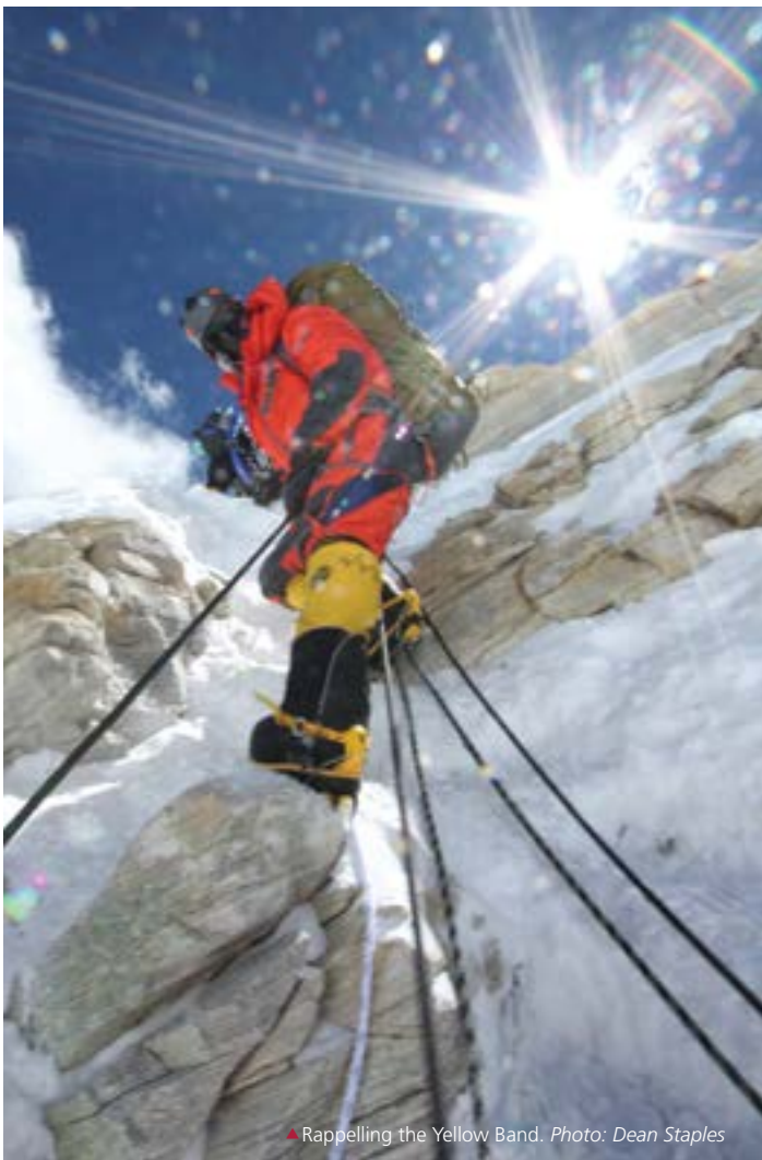
▲ Rappelling the Yellow Band.