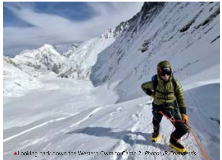
▲ Looking back down the Western Cwm to Camp 2.