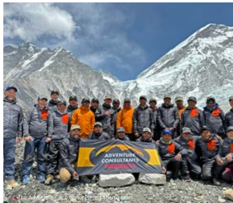
▲ The Adventure Consultants Everest Sherpa team.

We recognise that no amount of finely tuned organisation will guarantee anyone the summit of Mount Everest. However, we do believe that our experience, combined with your enthusiasm and determination, will provide you with the best possible chance of standing on top of the world. Our track record on Everest is unmatched with 419 summits to date!