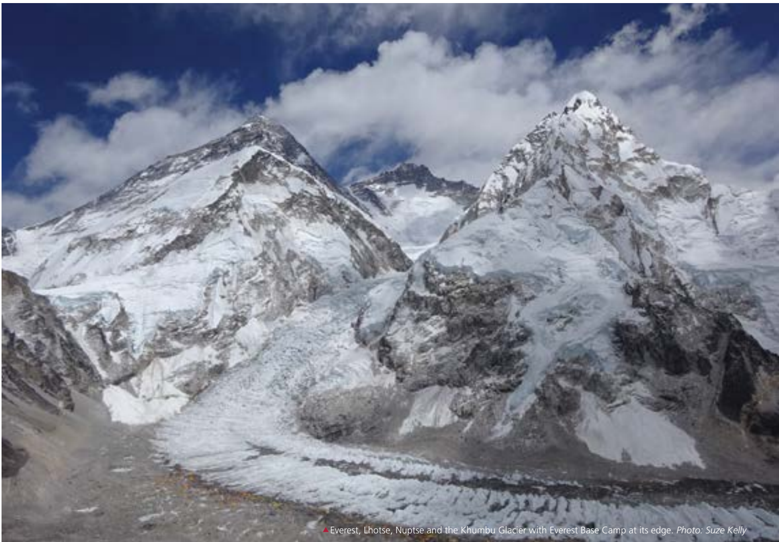
▲ Everest, Lhotse, Nuptse and the Khumbu Glacier with Everest Base Camp at its edge.

the while, being impressed by the spectacular scenery of the incredible peaks of the lower Khumbu.