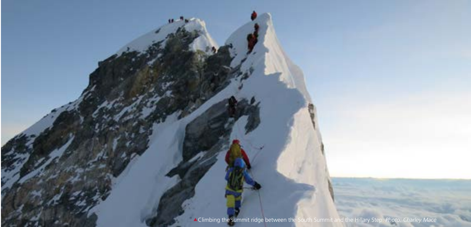
▲ Climbing the summit ridge between the South Summit and the Hillary Step.