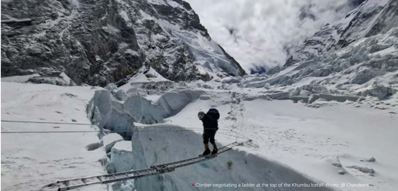
▲ Climber negotiating a ladder at the top of the Khumbu Icefall.

They will be familiar with crevasse rescue and glacier travel techniques and have a good overall standard of fitness. There will ideally be a broad set of climbing skills from basic rock climbing to advanced cramponing on snow and ice, and strong rope skills such as rappelling and rope ascending.