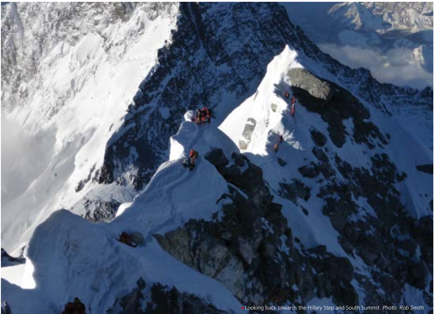
▲ Looking back towards the Hillary Step and South Summit.