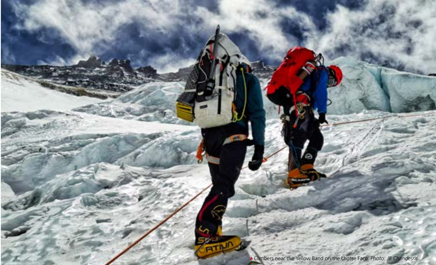
▲ Climbers near the Yellow Band on the Lhotse Face.