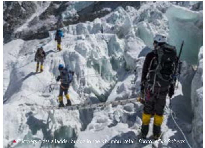
▲ Climbers cross a ladder bridge in the Khumbu icefall.