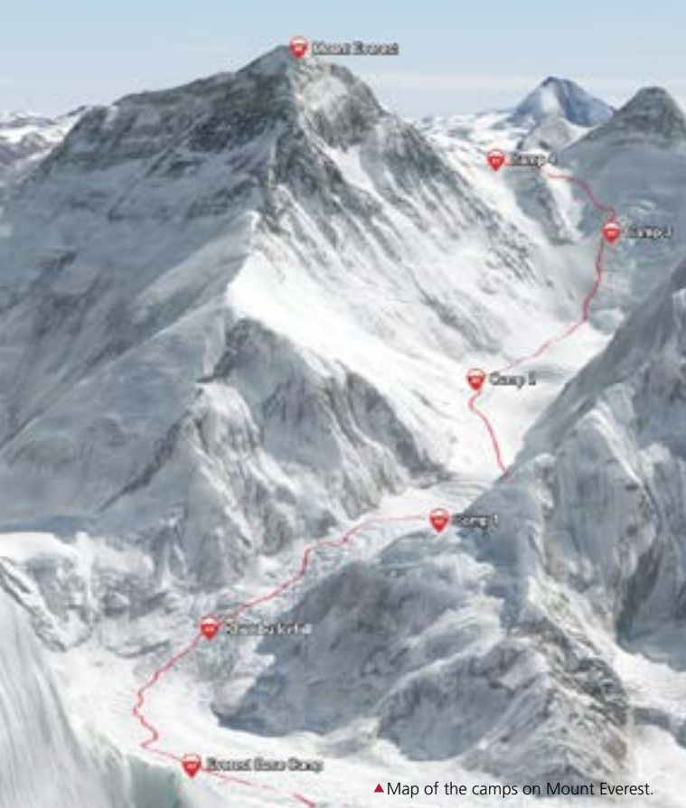
▲ Map of the camps on Mount Everest.