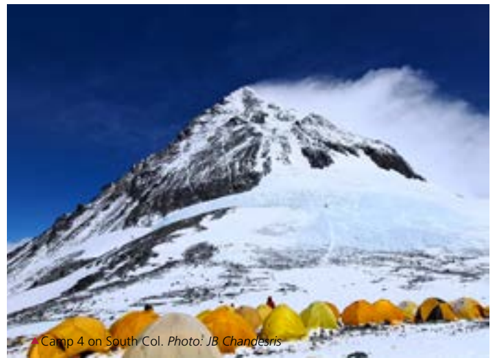
▲ Camp 4 on South Col.