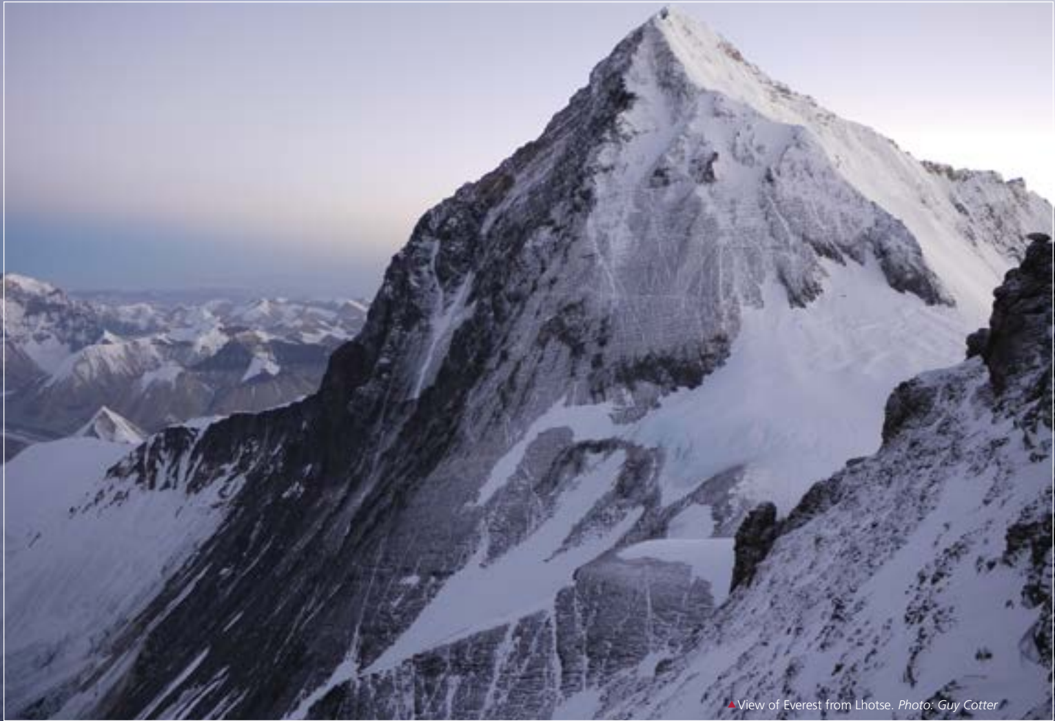
▲ View of Everest from Lhotse.