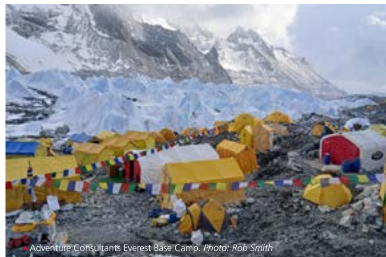
▲ Adventure Consultants Everest Base Camp.