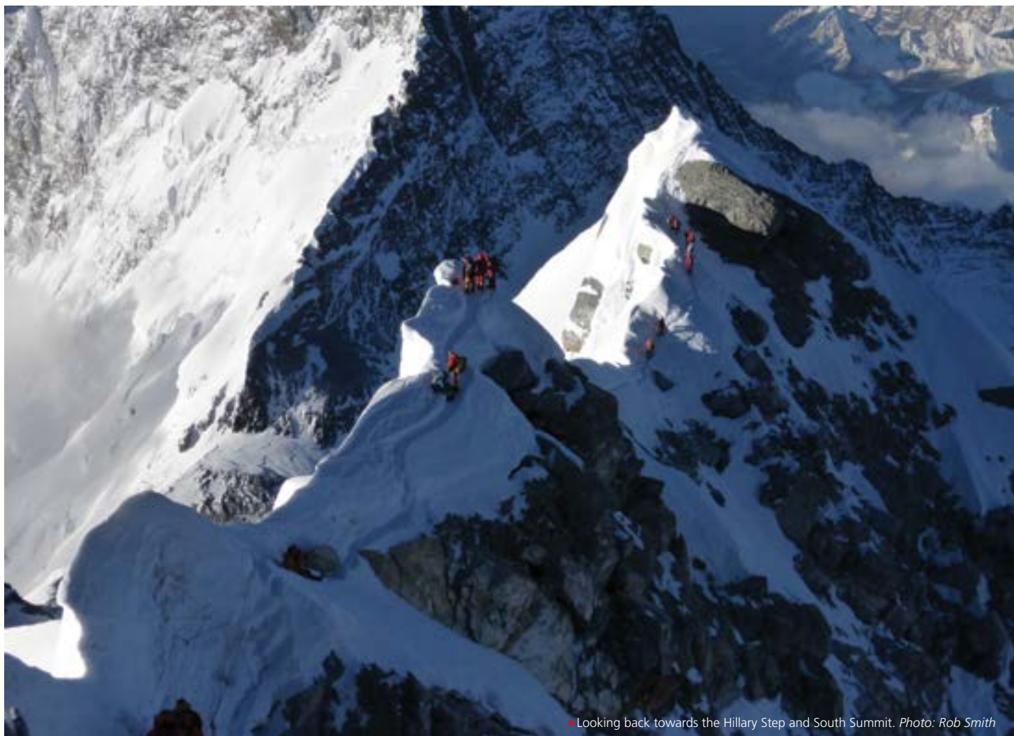
▲ Looking back towards the Hillary Step and South Summit.