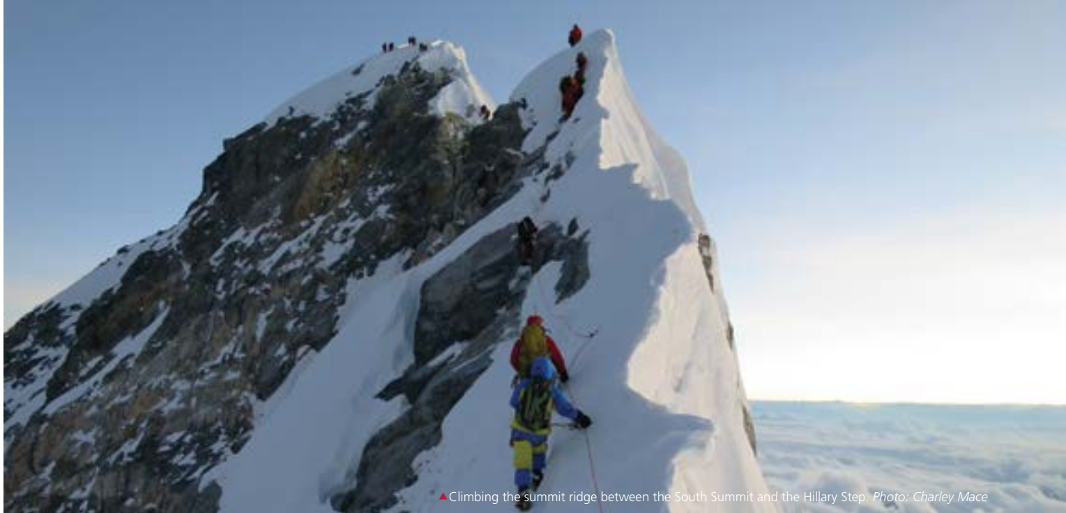
▲ Climbing the summit ridge between the South Summit and the Hillary Step.

Our cooking staff are very well known for the quality of the cuisine they produce and are coveted by other team leaders due to the reputation they have established. We have been developing the personnel within our Sherpa team for 30 years and they are an integral part of the Adventure Consultants Everest Team.