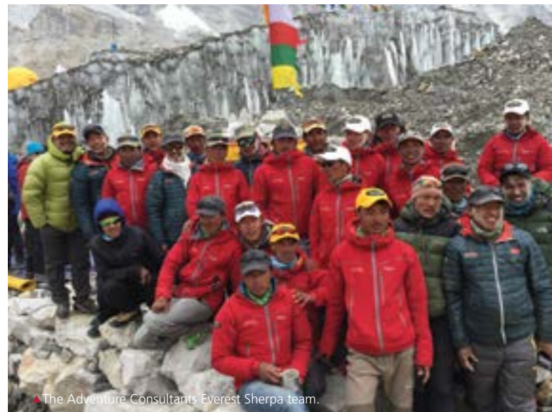
▲ The Adventure Consultants Everest Sherpa team.

Every step of the way, our head office staff will be there to answer your questions. If they can’t, they will be happy to put you in touch with one of our Senior International Guides who will have first-hand knowledge of the climb.