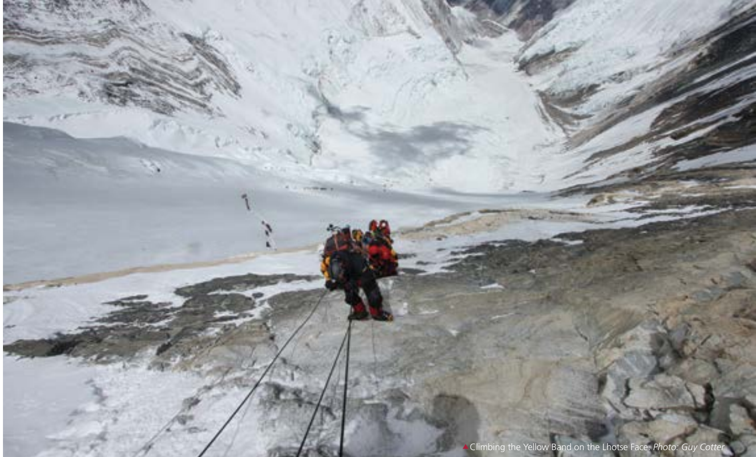
▲ Climbing the Yellow Band on the Lhotse Face.