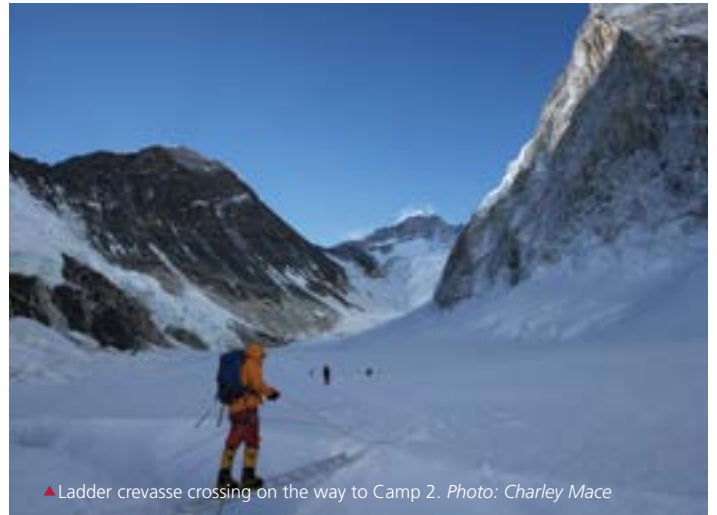
▲ Ladder crevasse crossing on the way to Camp 2.

We recognise that no amount of finely tuned organisation will guarantee anyone the summit of Mount Everest. However, we do believe that our experience, combined with your enthusiasm and determination, will provide you with the best possible chance of standing on top of the world. Our track record on Everest is unmatched with 391 summits to date!