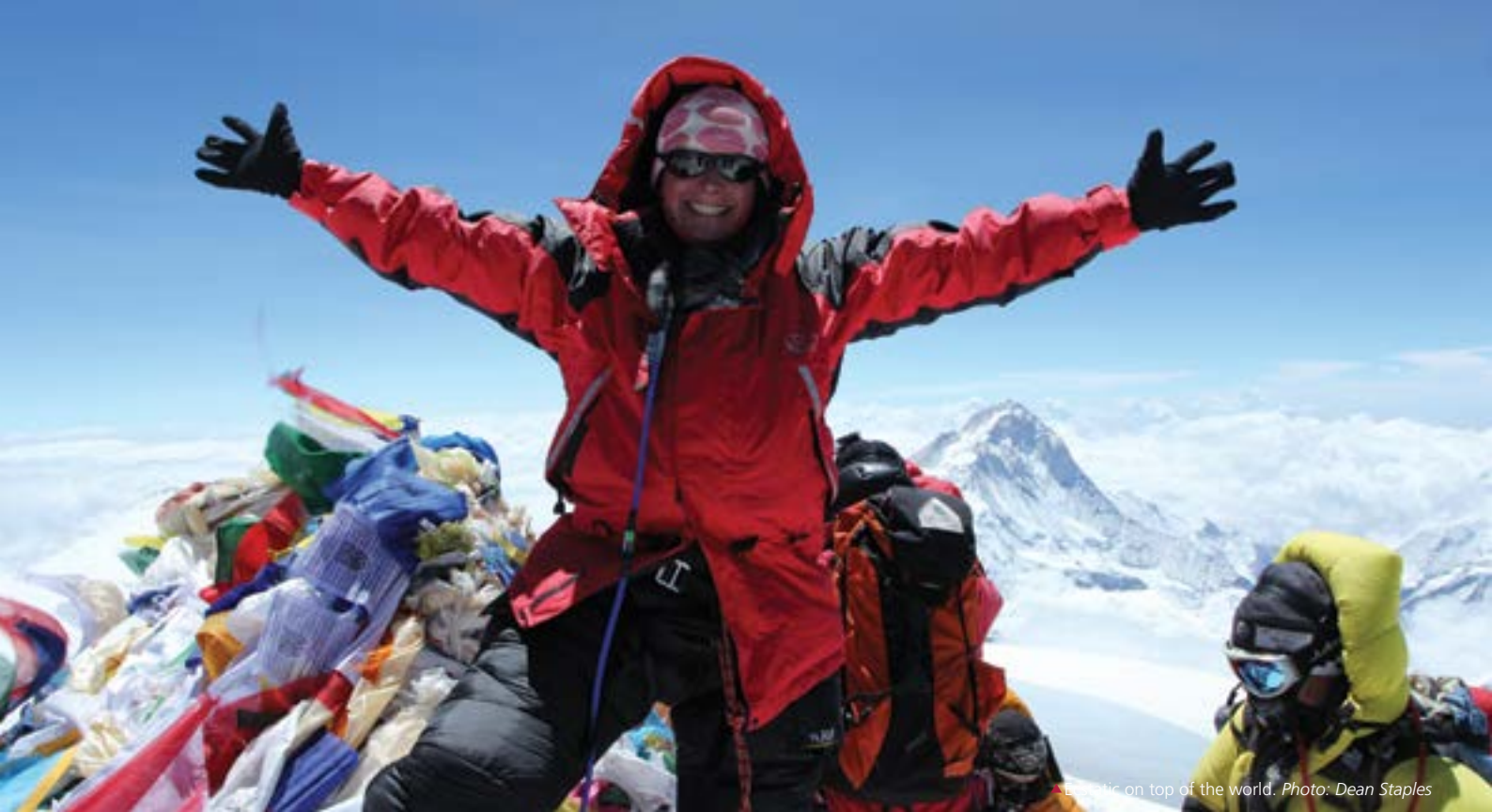
Everest on top of the world.