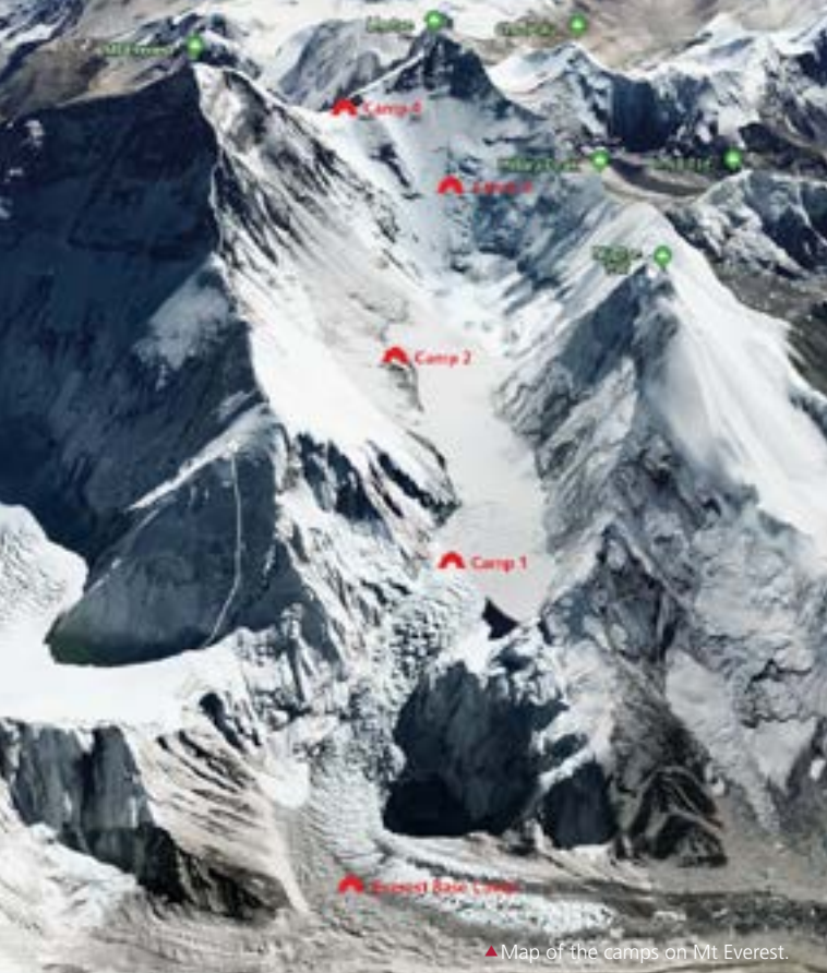
▲Map of the camps on Mt Everest.

acclimatisation, before returning to Base Camp for a rest period. In a perfect scenario, weather and health would remain constant, and these two trips up the mountain would take around 3 weeks. In reality, factors such as weather can add several days to the acclimatisation process.