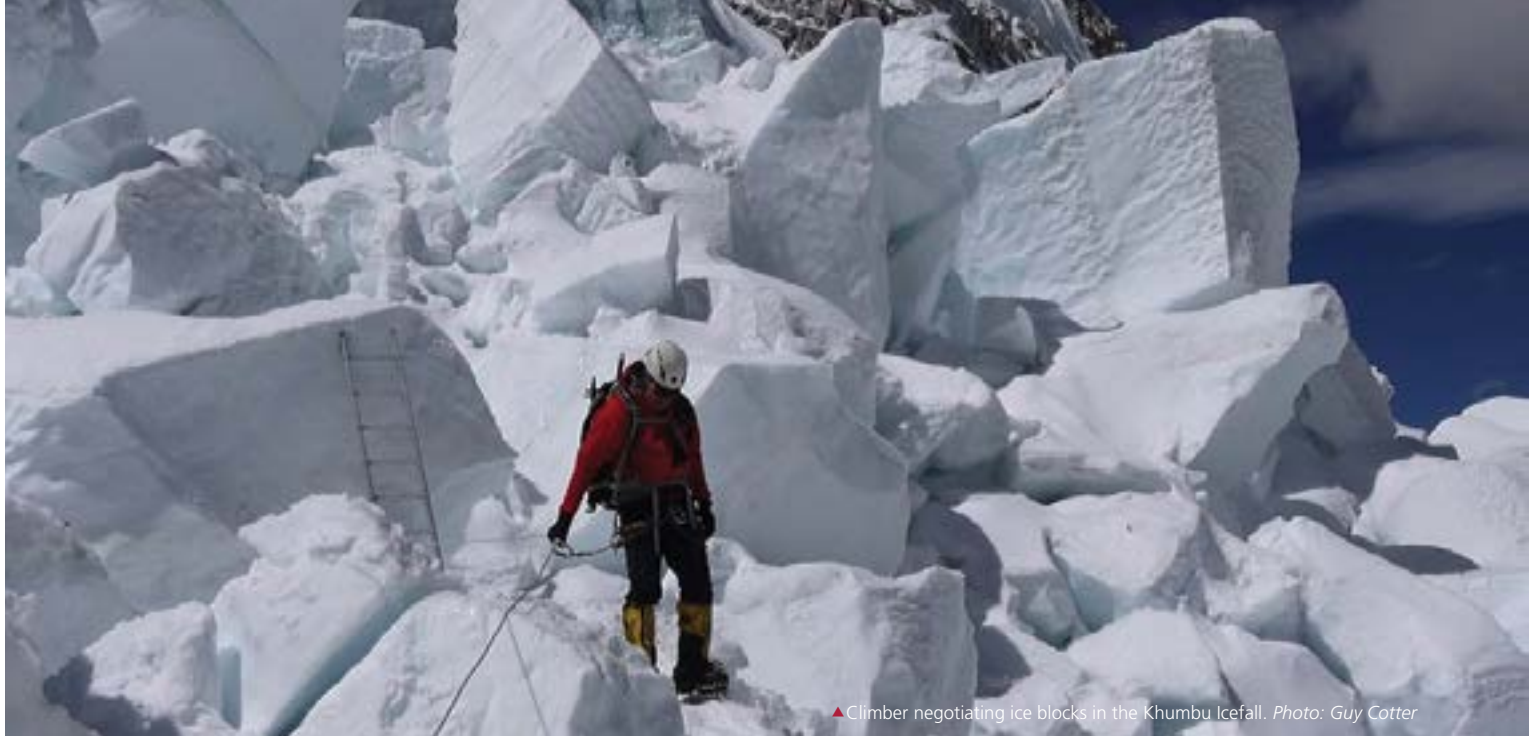
▲ Climber negotiating ice blocks in the Khumbu Icefall.