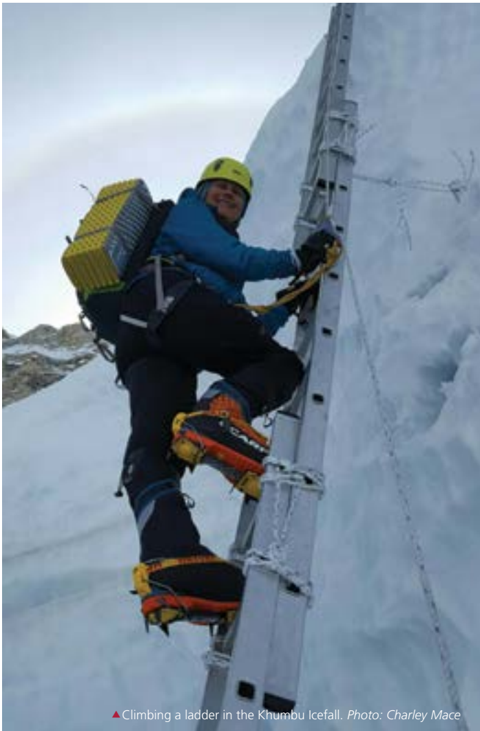
▲ Climbing a ladder in the Khumbu Icefall.