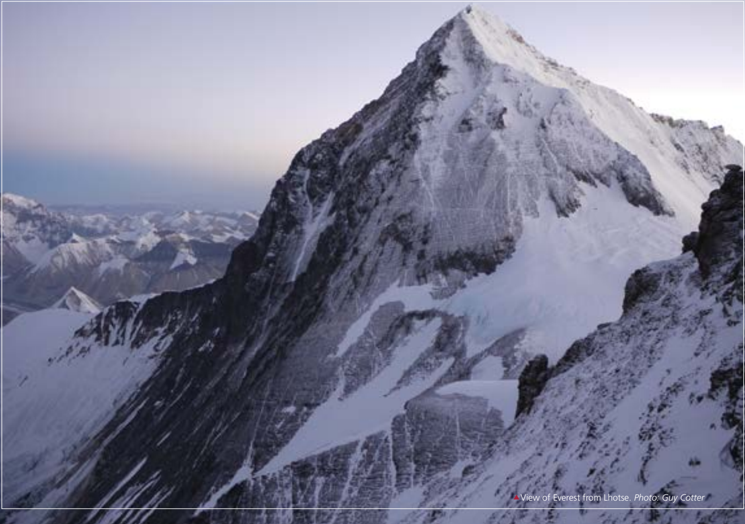
▲ View of Everest from Lhotse.