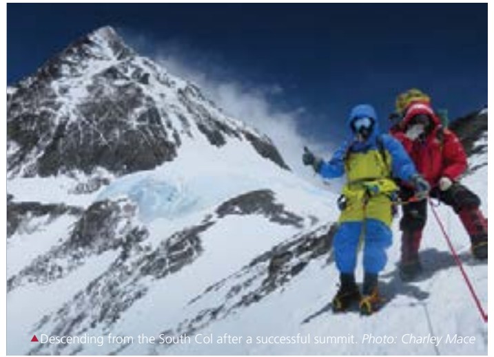
▲ Descending from the South Col after a successful summit.