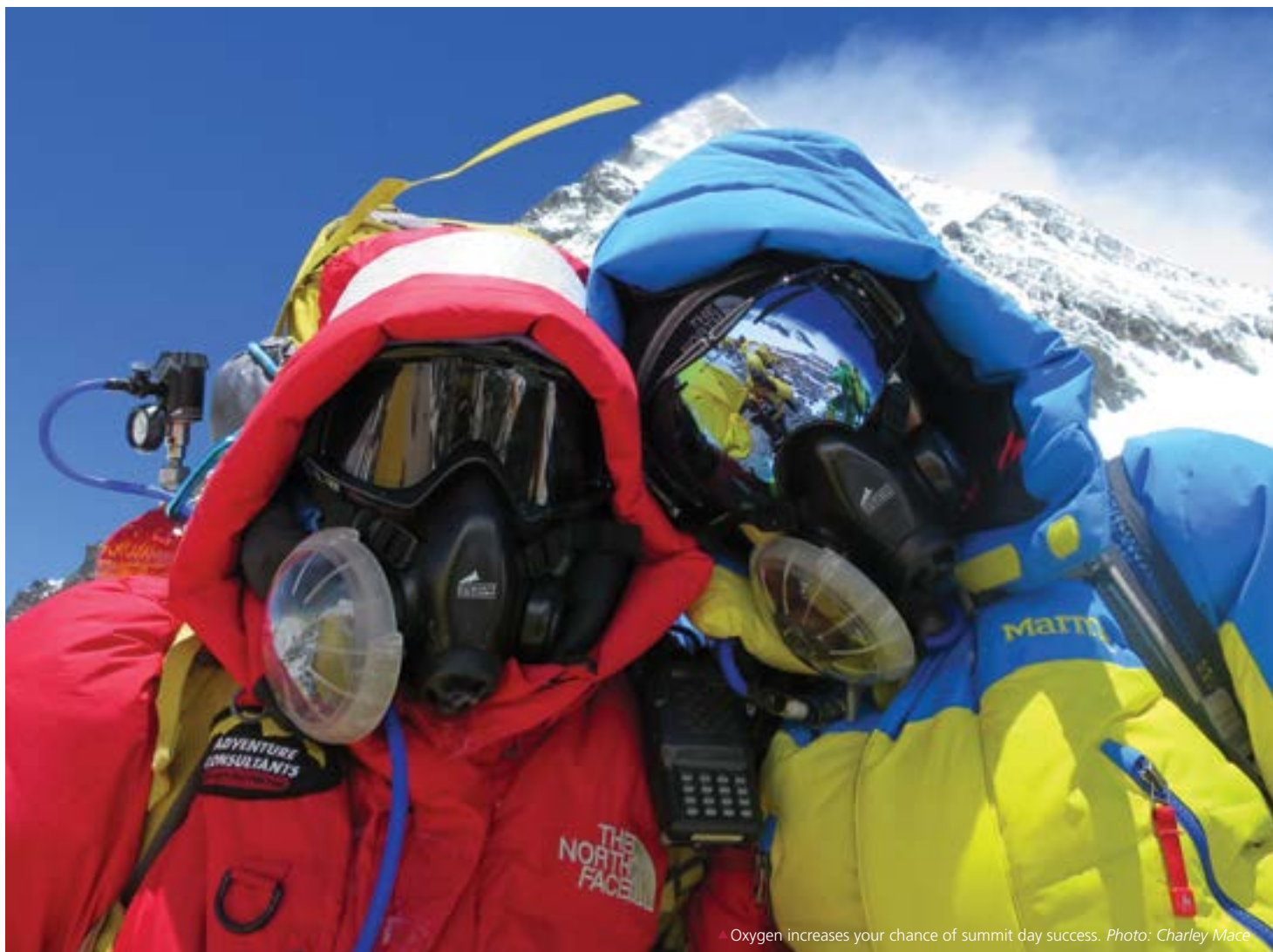
▲ Oxygen increases your chance of summit day success.

We also ensure we have enough oxygen to wait a day at the South Col and Camp 4, before attempting the summit. Our experiences show that for those who really want to maximise their chance of success, then these high oxygen flow rates allow the best option for ensuring you only need to attempt Mount Everest one time!