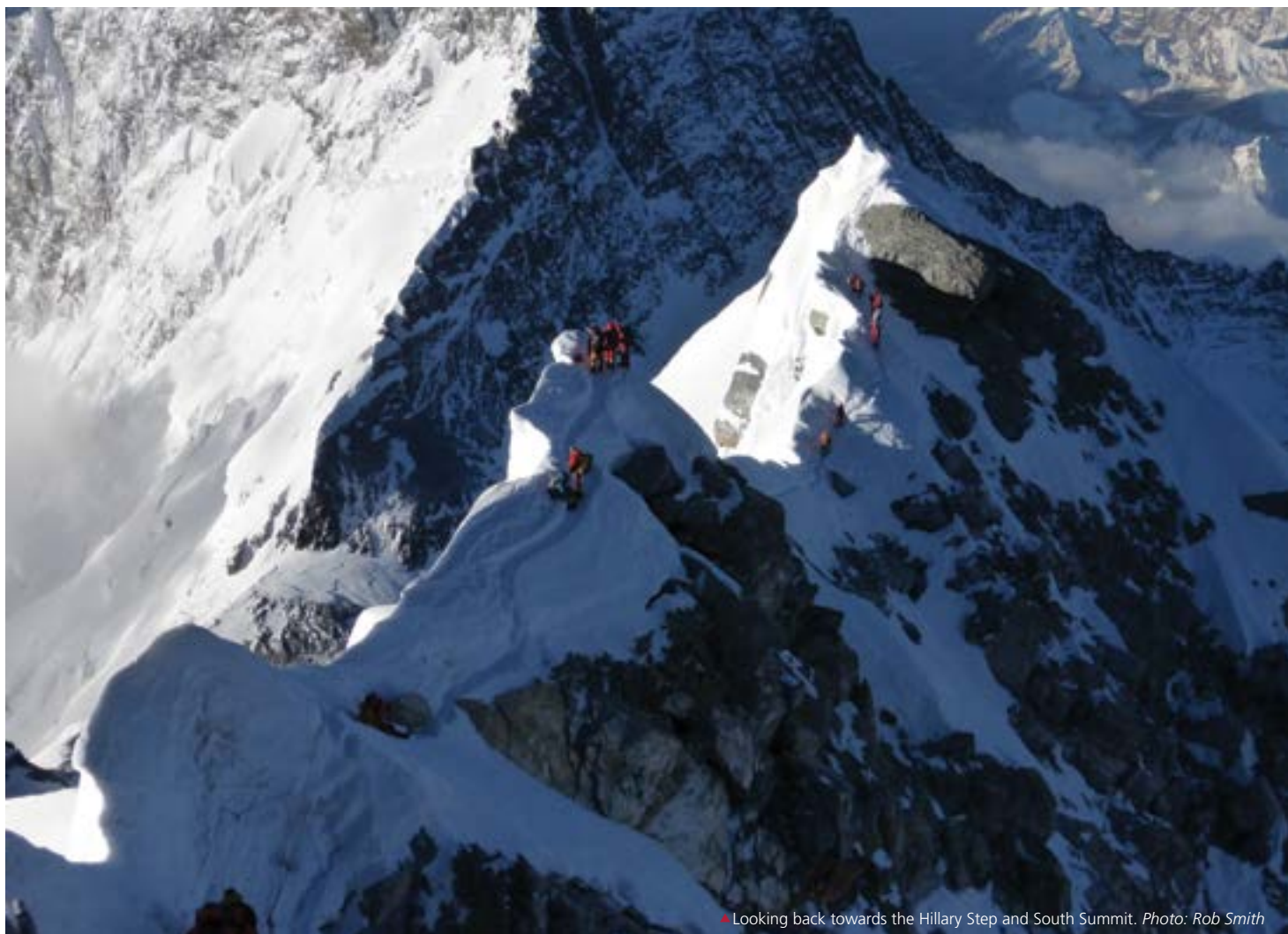
▲ Looking back towards the Hillary Step and South Summit.