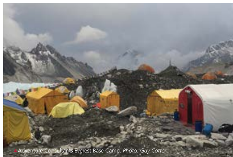
▲ Adventure Consultants Everest Base Camp.

Many have found this critical to their success on Everest and we have seen our summit rate increase dramatically with its use. The response from our team members has also been phenomenally positive. Climbers have reported having better energy levels, a better appetite, more warmth, a higher degree of strength and greater enjoyment on summit day.