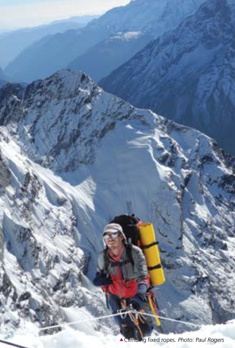
▲ Climbing fixed ropes.

NOTE: Factors such as weather, team member health and logistics etc. will no doubt create some change in the actual dates of the program.