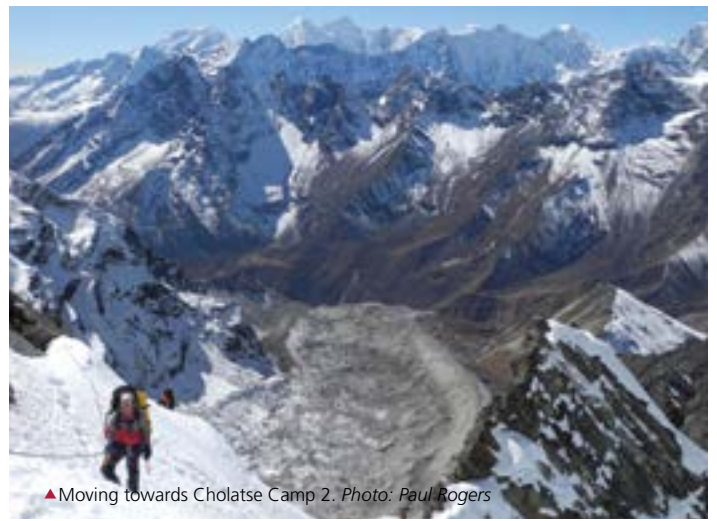
▲ Moving towards Cholatse Camp 2.