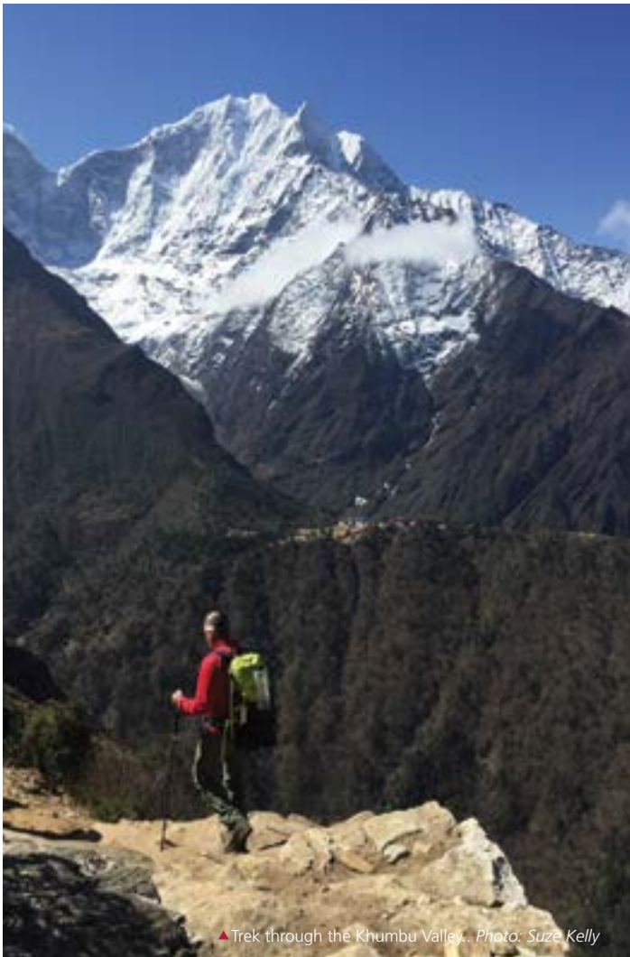
▲ Trek through the Khumbu Valley..