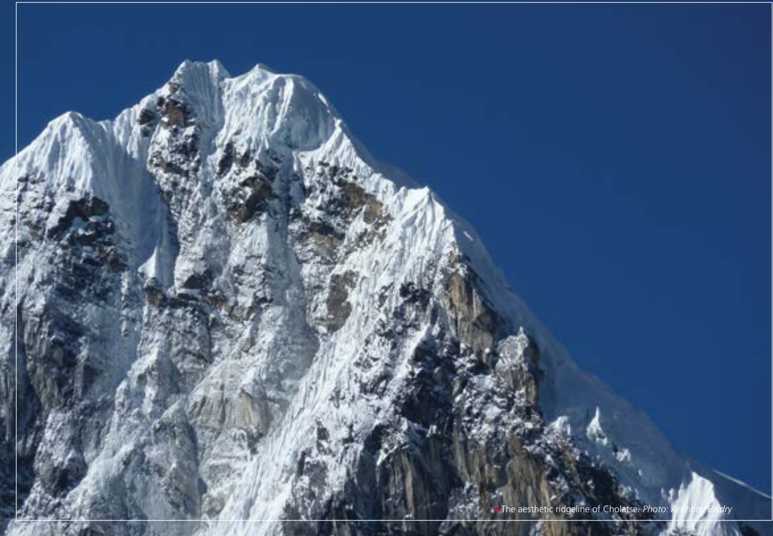
• The aesthetic ridgeline of Cholatse.