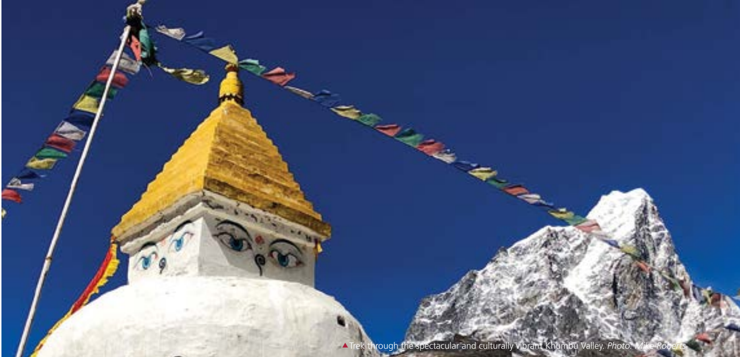
▲ Trek through the spectacular and culturally vibrant Khumbu Valley.