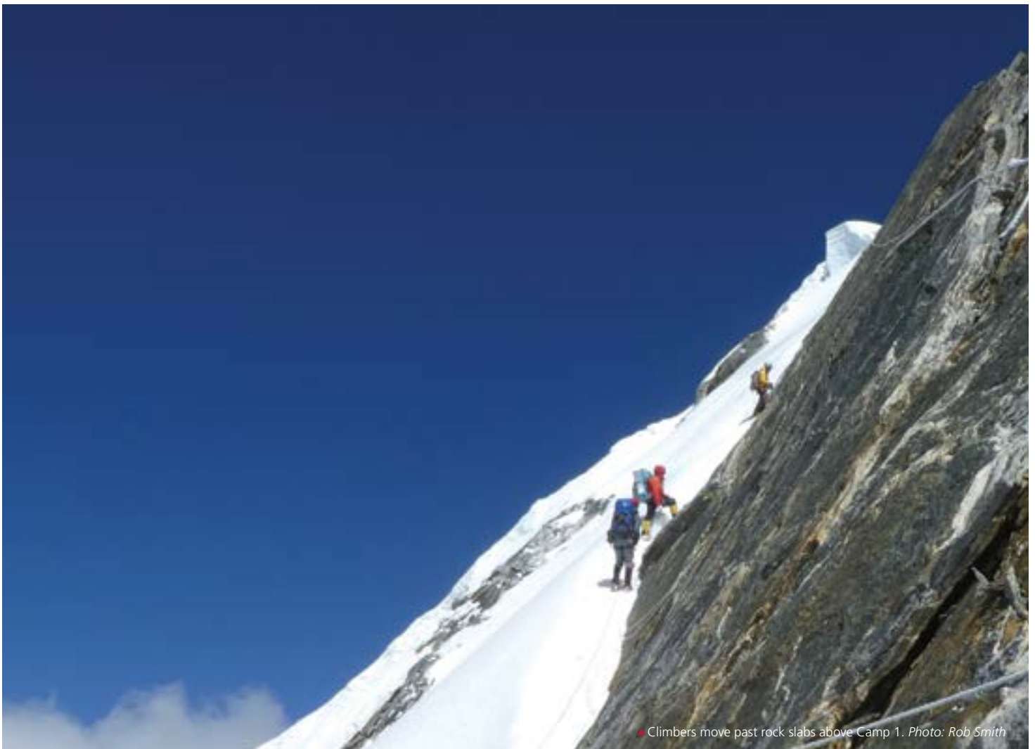
▲ Climbers move past rock slabs above Camp 1.