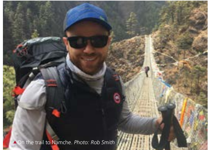
▲ On the trail to Namche.

The expedition fee does not include the following: