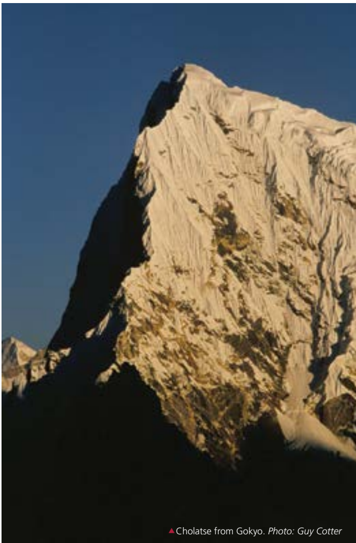
▲ Cholatse from Gokyo.