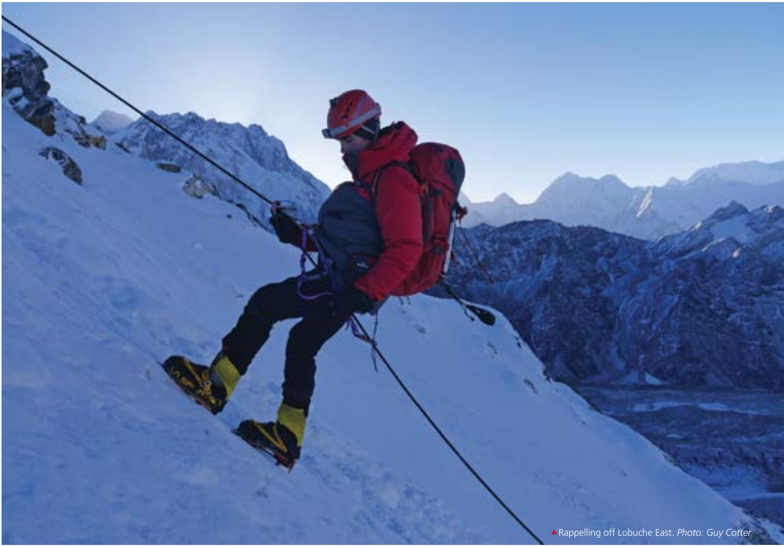
▲ Rappelling off Lobuche East.