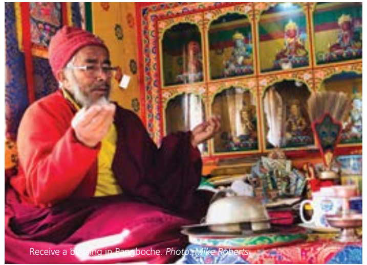
Receive a blessing in Pangboche.