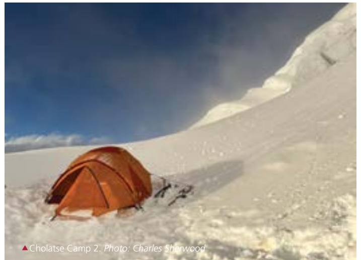
▲ Cholatse Camp 2.

Our early start (around 2.30am), sees us climbing the South East Ridge, which is a mixture of snow and ice. Where necessary, we will fix ropes along the route. Steady climbing will bring us to the far eastern summit.