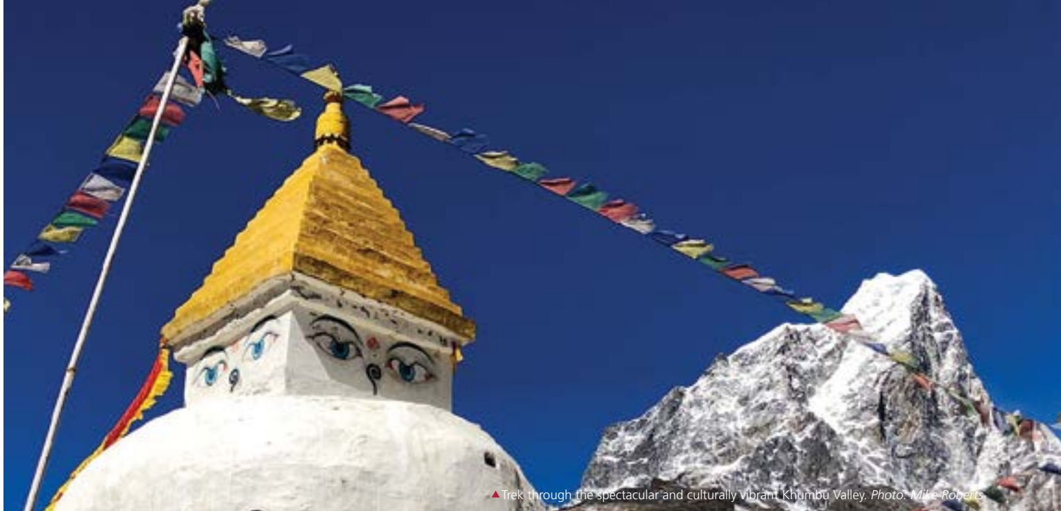
▲ Trek through the spectacular and culturally vibrant Khumbu Valley.