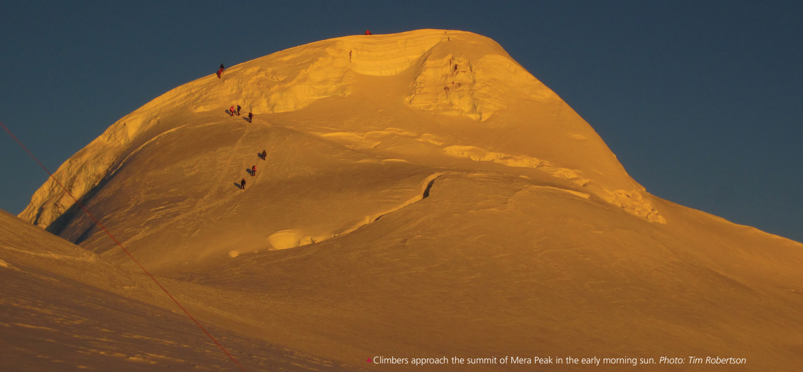
• Climbers approach the summit of Mera Peak in the early morning sun.