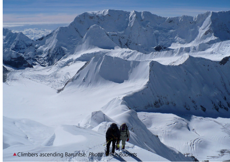
▲ Climbers ascending Baruntse.