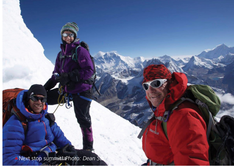
• Next stop summit!