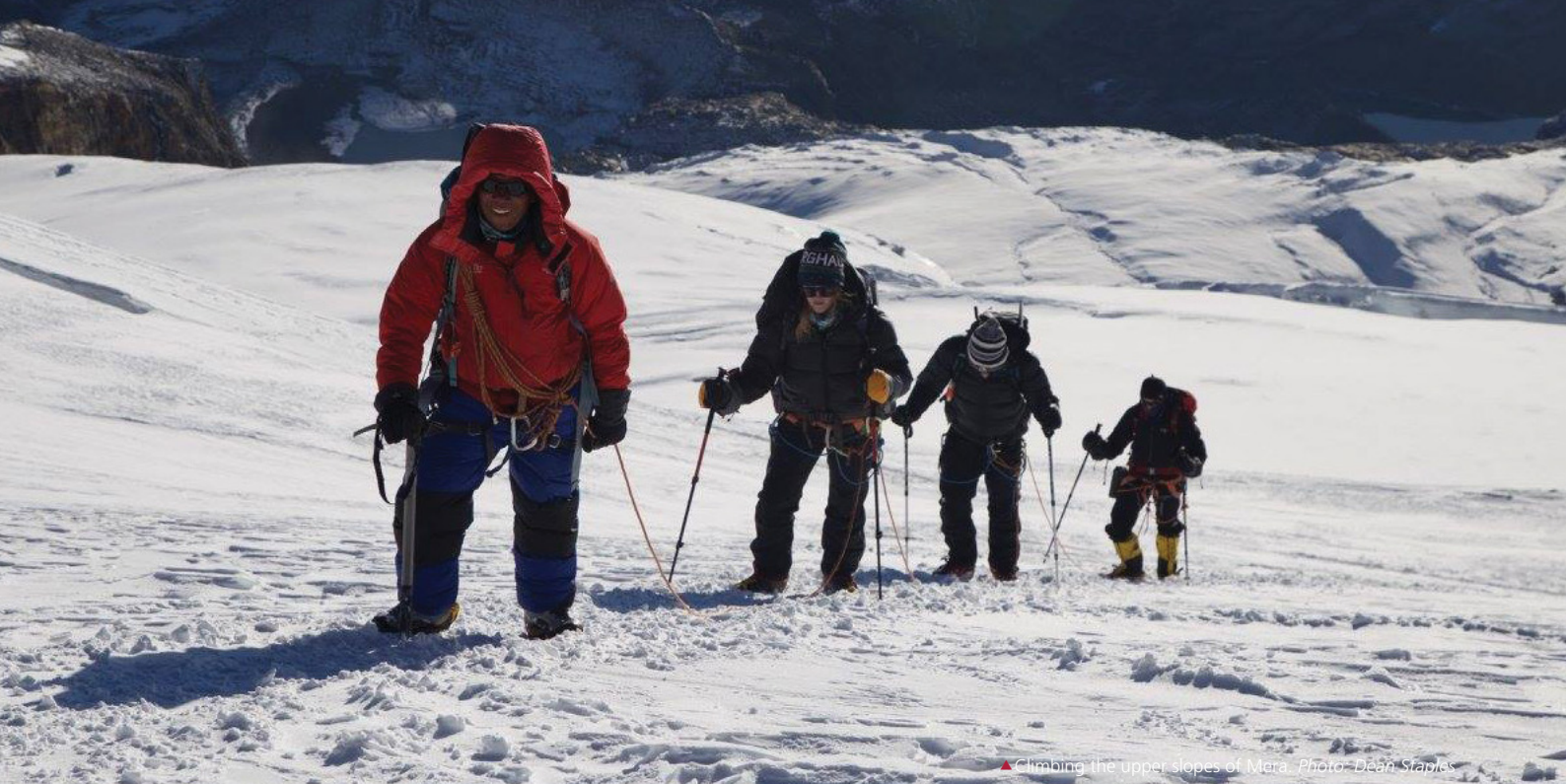
▲ Climbing the upper slopes of Mera.