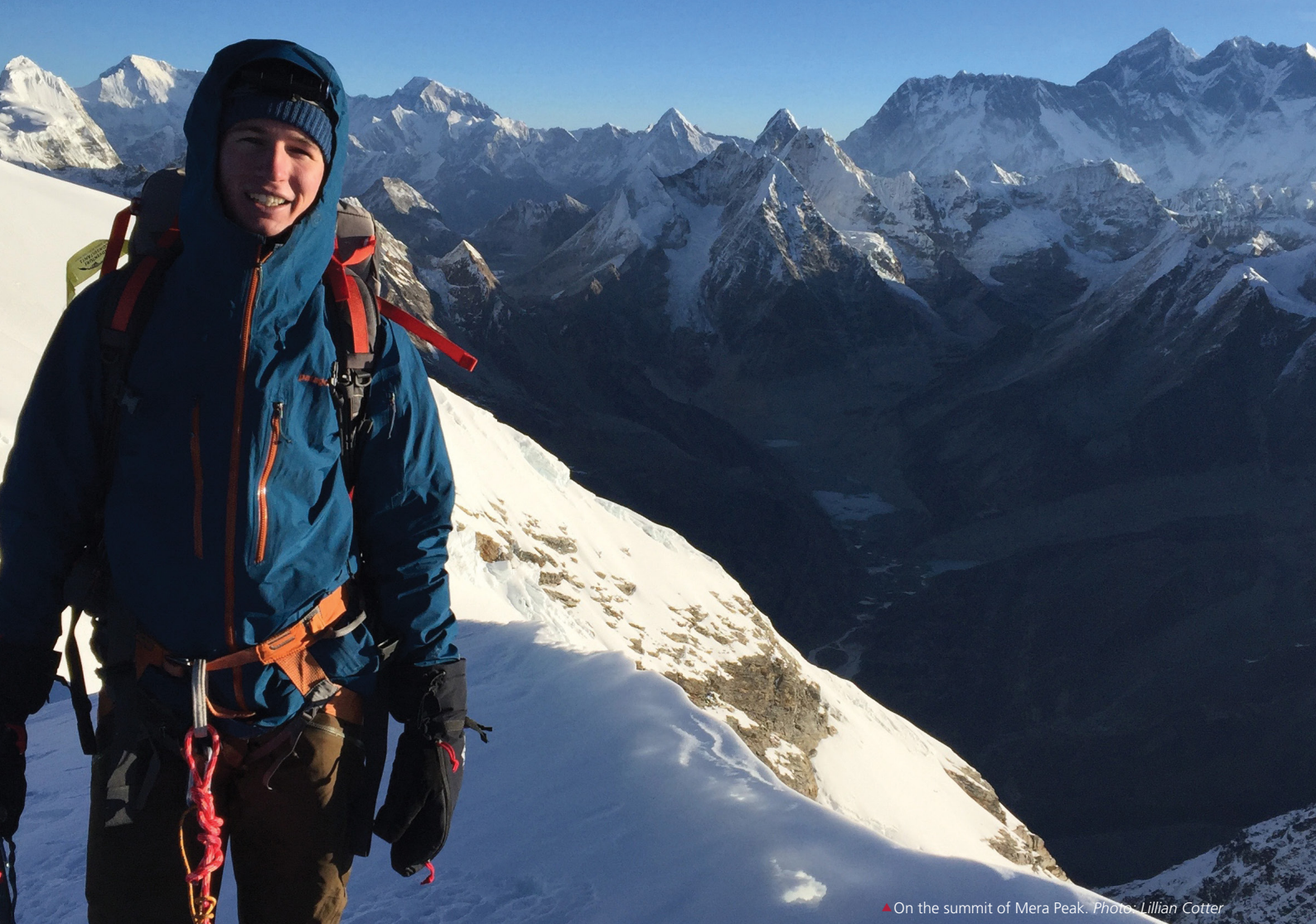
▲ On the summit of Mera Peak.