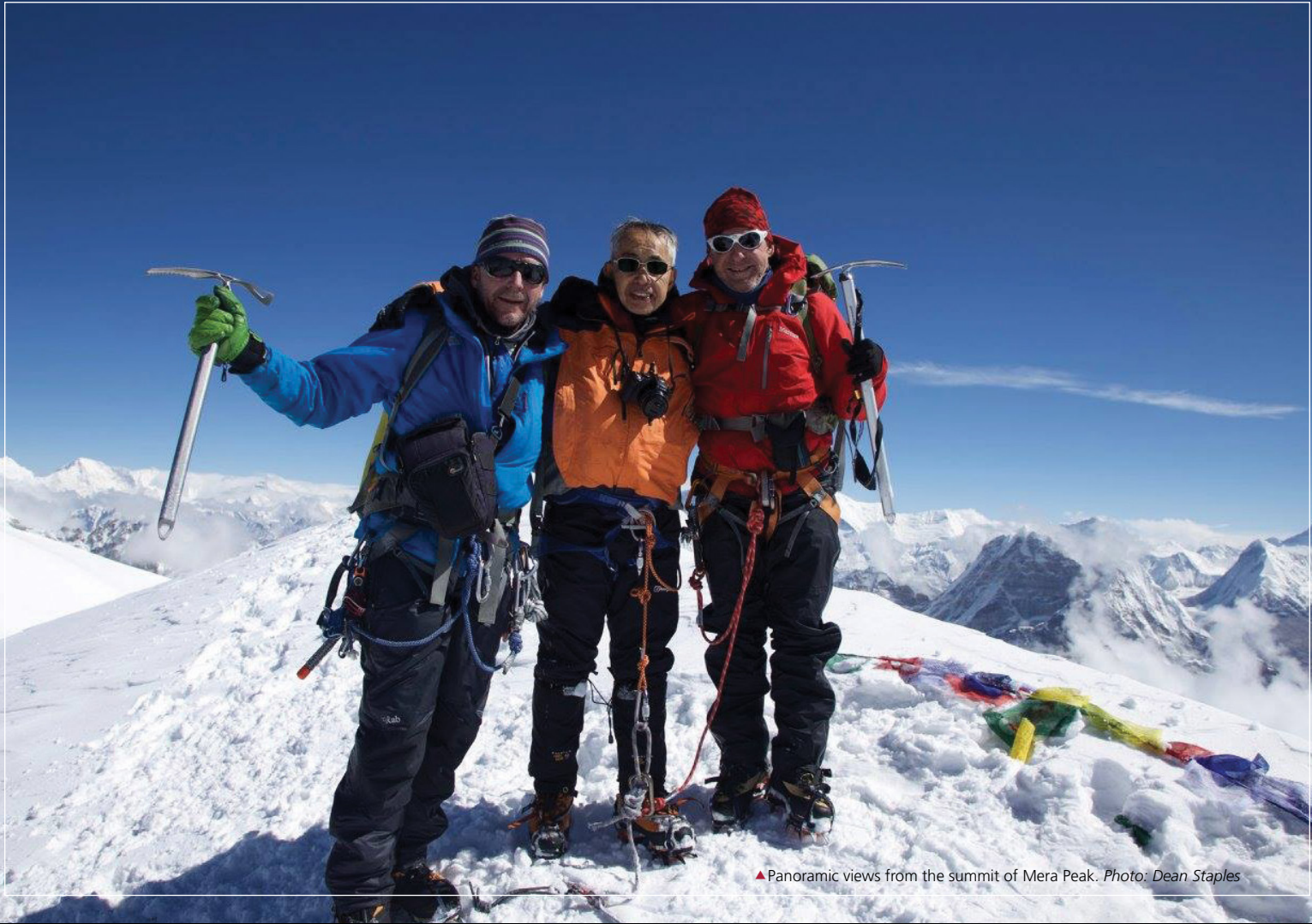
▲ Panoramic views from the summit of Mera Peak.