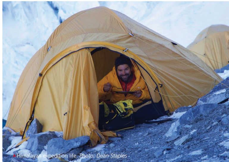
• Himalayan expedition life.

base of the South Ridge. This camp sets the stage for summit day.