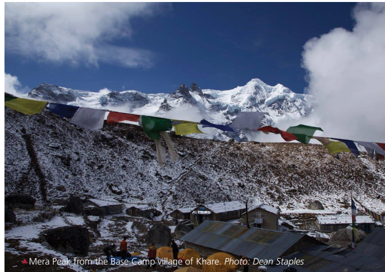
▲ Mera Peak from the Base Camp village of Khare.

The expedition fee does not include the following: