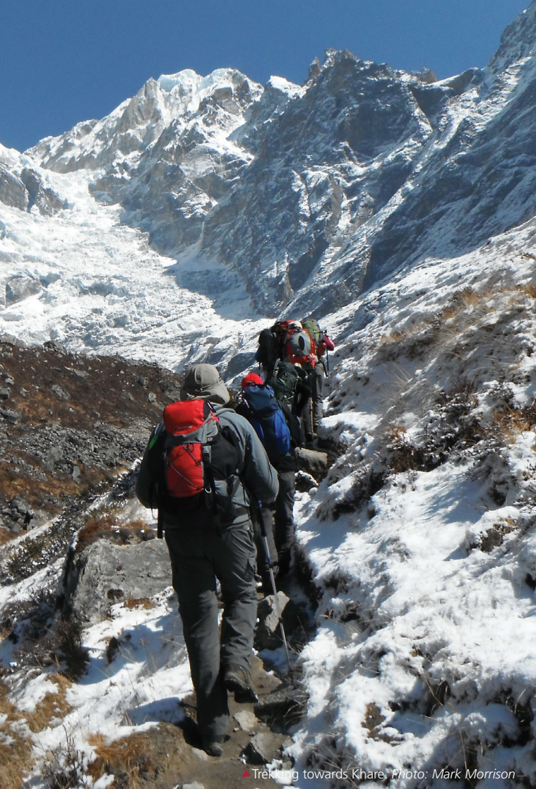
• Trekking towards Khare.