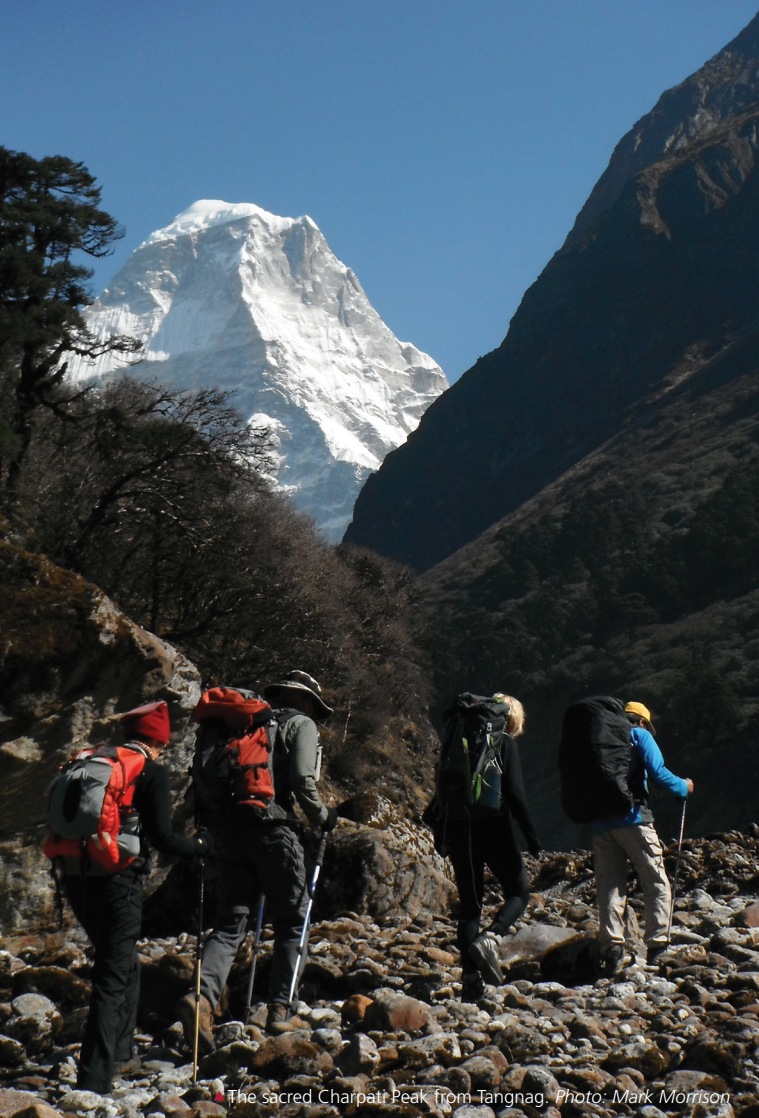
▲ The sacred Charpatti Peak from Tangnag.