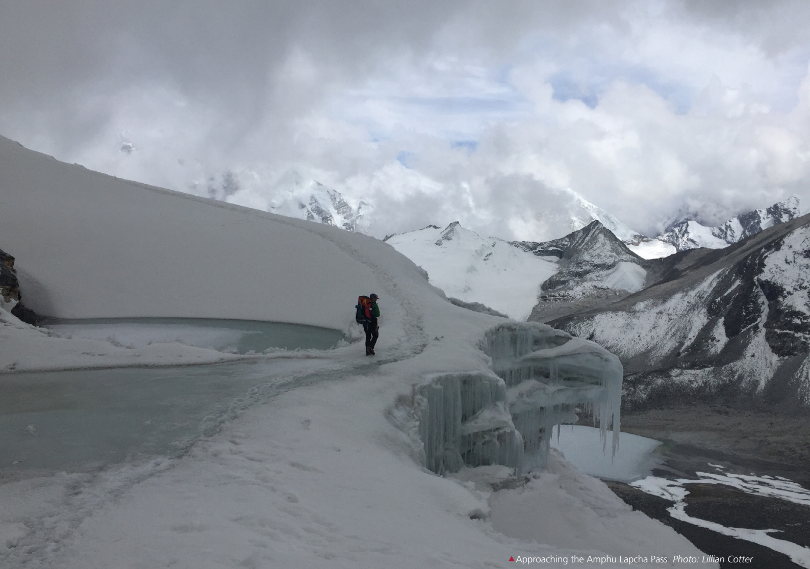
▲ Approaching the Amphu Lapcha Pass.

Khumbu Valley and Everest region to Paiyu and Panggom. Now we can enjoy the isolated, rarely visited villages before crossing the Panggom La and heading down through the rhododendron jungle.