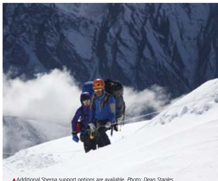
▲Additional Sherpa support options are available.

The expedition will be equipped with portable Thuraya satellite phone systems for the duration of the expedition. Limited satellite phone time can be purchased for reliable email and voice communication for business, media or personal use at the rate of US$3.00 per minute.