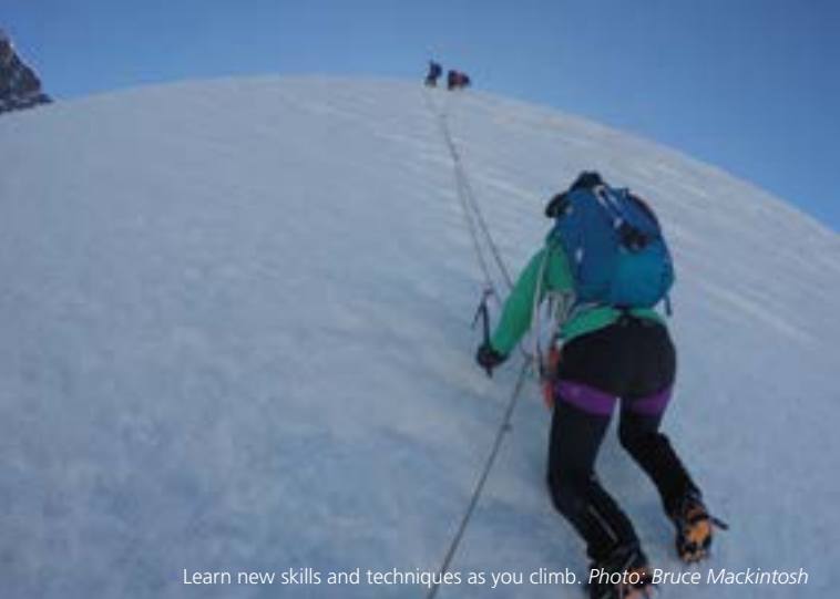
Learn new skills and techniques as you climb.