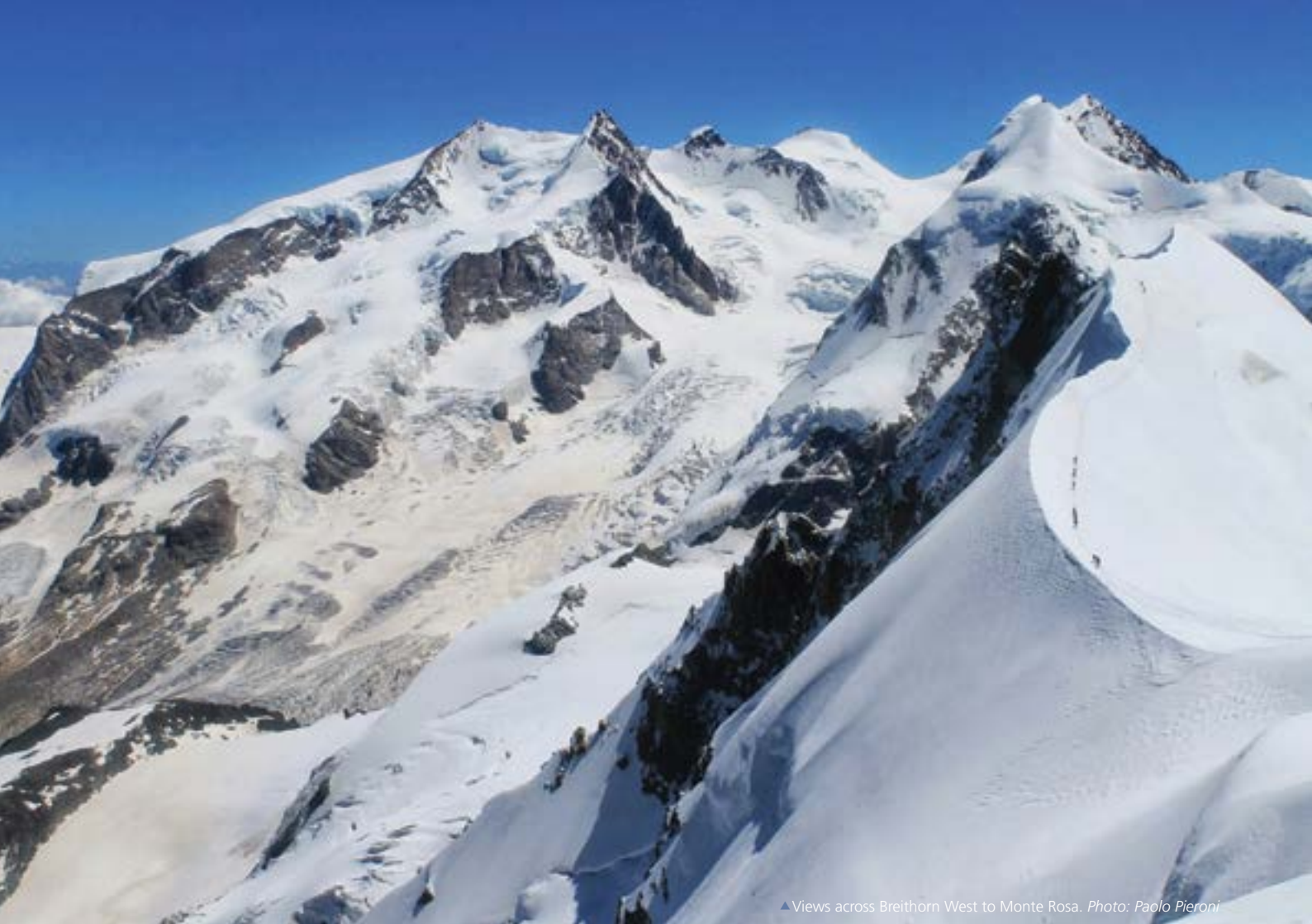
▲ Views across Breithorn West to Monte Rosa.

to Courmayeur, Italy. We take the Monte Bianco Skyway and spend some time learning or refreshing basic mountaineering skills and techniques. We then traverse the Aiguilles Marbrées, the rocky spires that border Italy and France before overnighting at a Courmayeur Hotel.