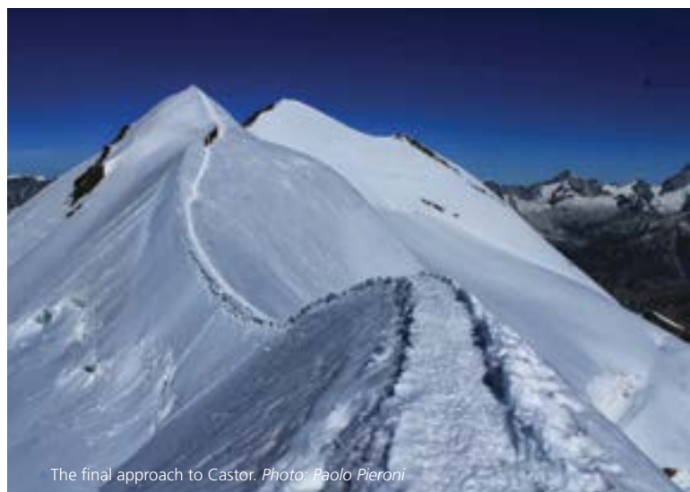
The final approach to Castor.

costs at the time of booking as this option must be reserved in advance.