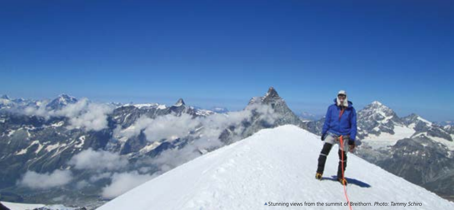
▲ Stunning views from the summit of Breithorn.