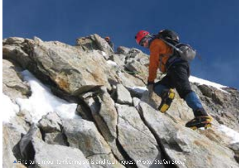
▲ Fine tune mountaineering skills and techniques.