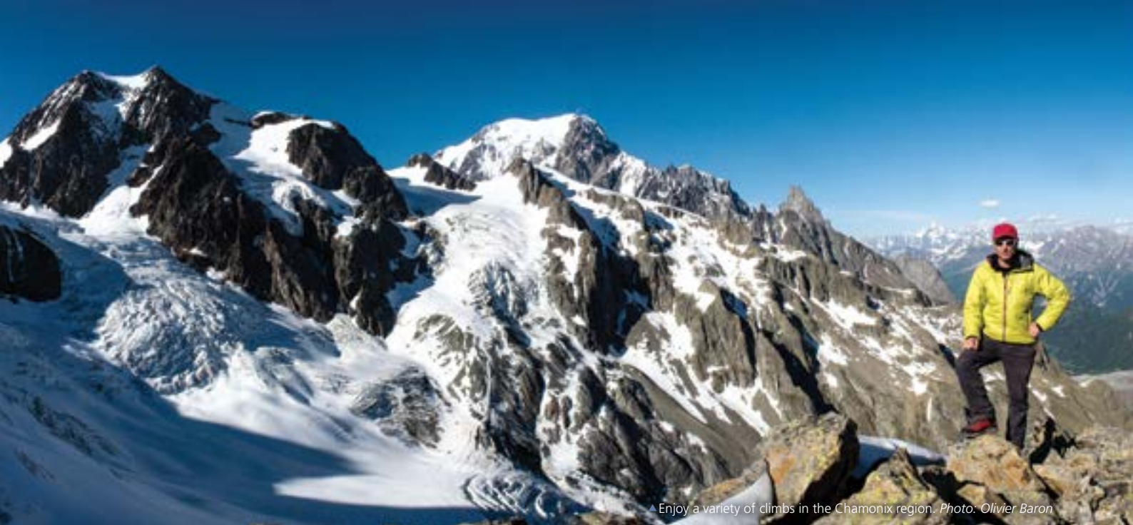
▲ Enjoy a variety of climbs in the Chamonix region.