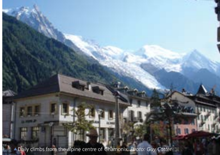
▲ Daily climbs from the alpine centre of Chamonix.