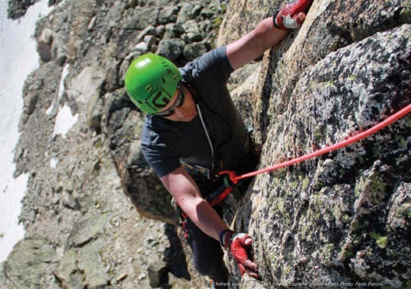
Refresh essential skills prior to your course or guided ascent.