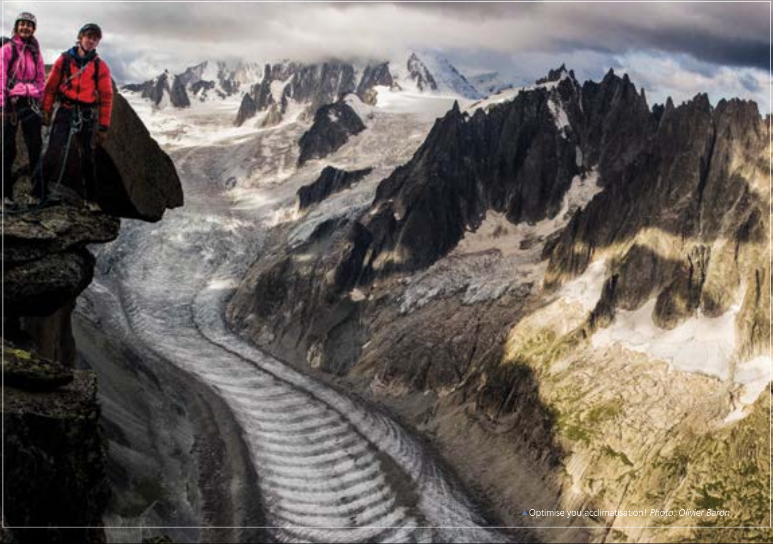
▲ Optimise your acclimatisation!