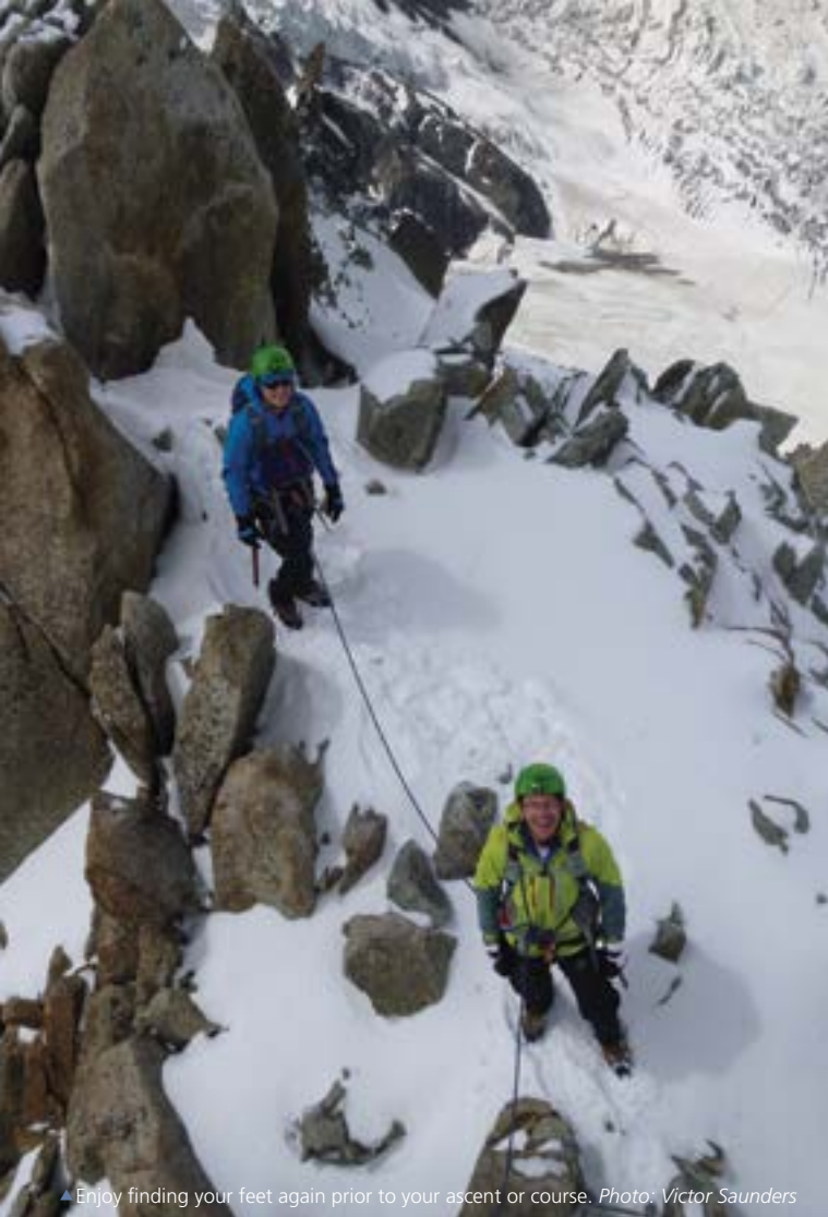
▲ Enjoy finding your feet again prior to your ascent or course.