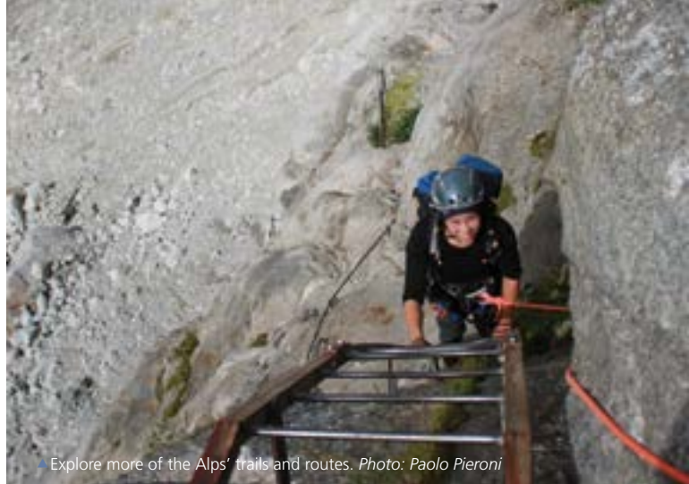
▲ Explore more of the Alps' trails and routes.