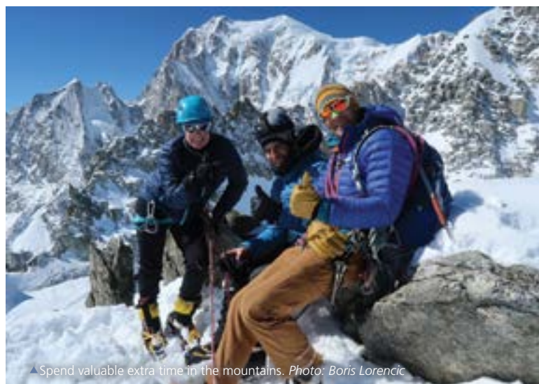
▲ Spend valuable extra time in the mountains.