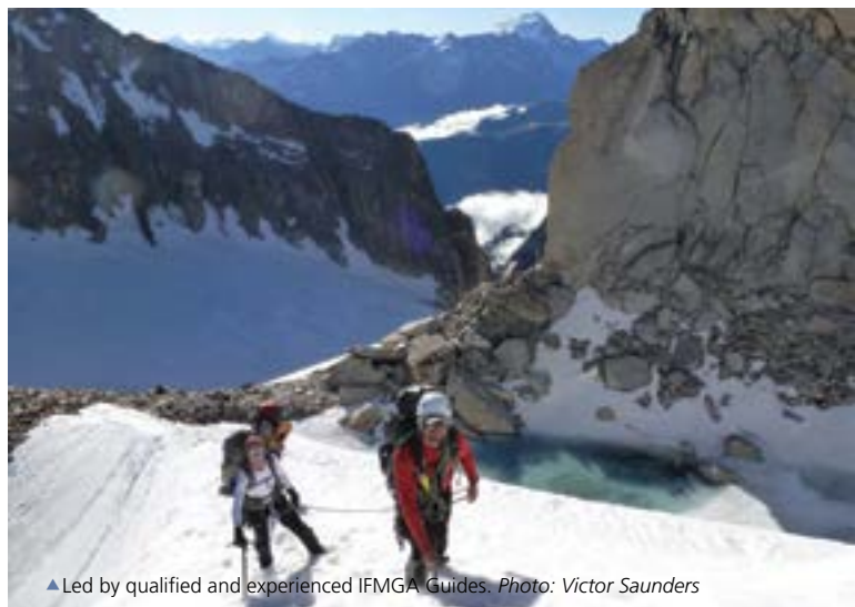
▲ Led by qualified and experienced IFMGA Guides.

For the account of Adventure Consultants Limited