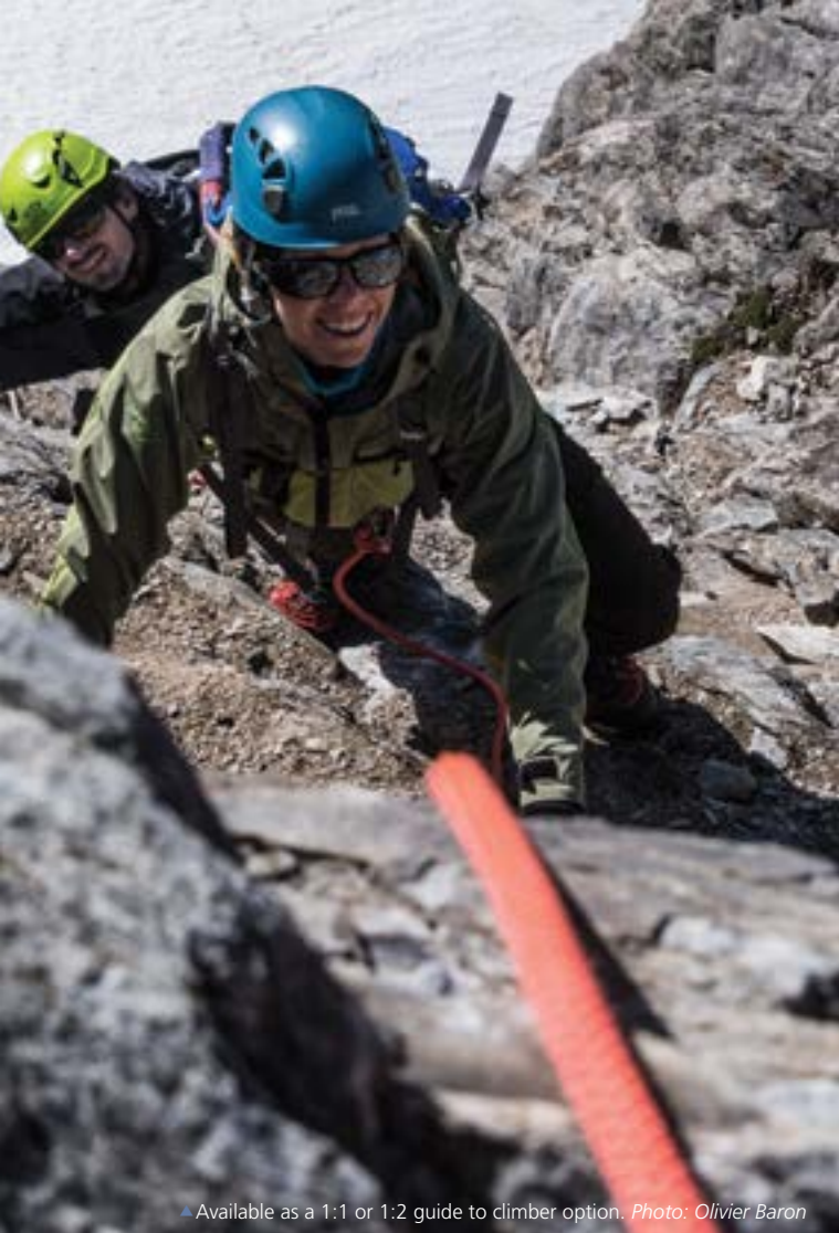
▲ Available as a 1:1 or 1:2 guide to climber option.