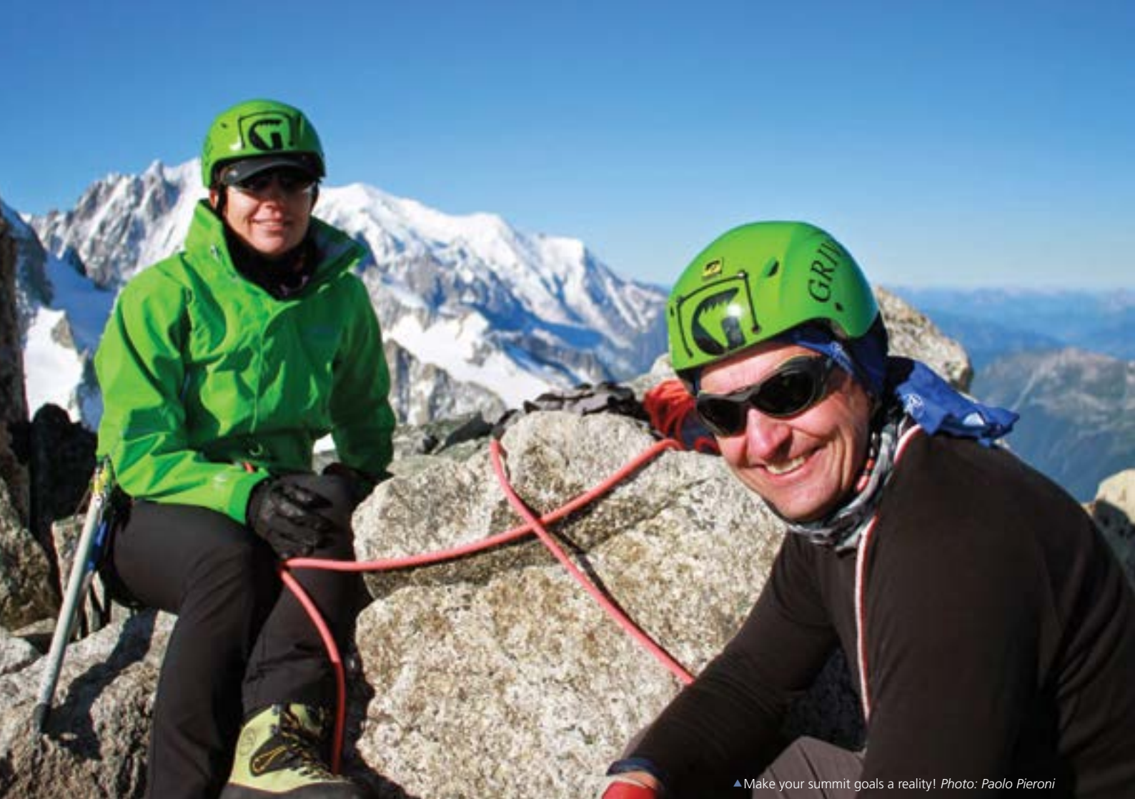
▲ Make your summit goals a reality!