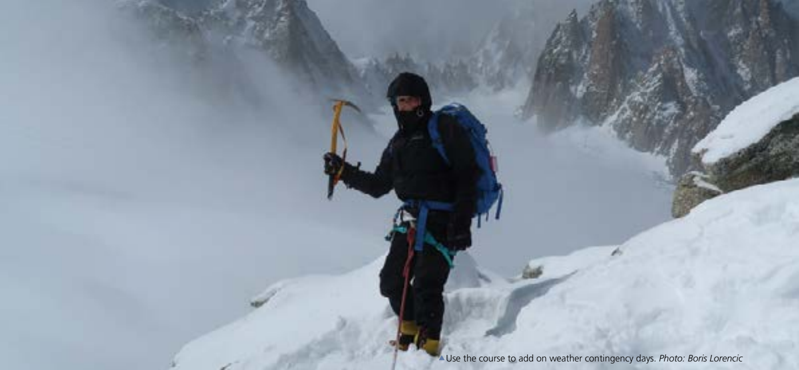
▲ Use the course to add on weather contingency days.