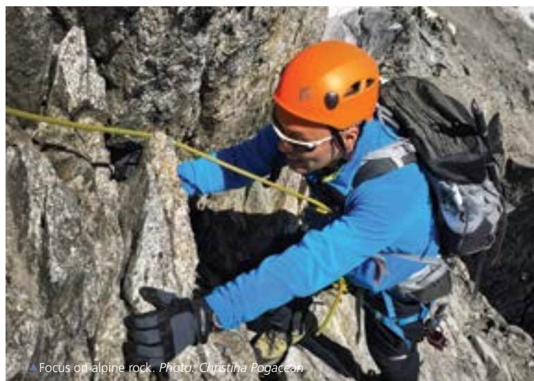
▲ Focus on alpine rock.