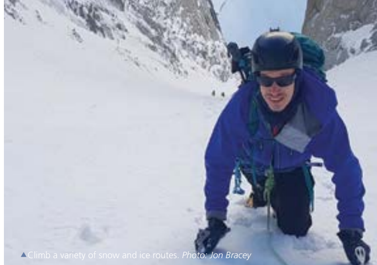
▲ Climb a variety of snow and ice routes.