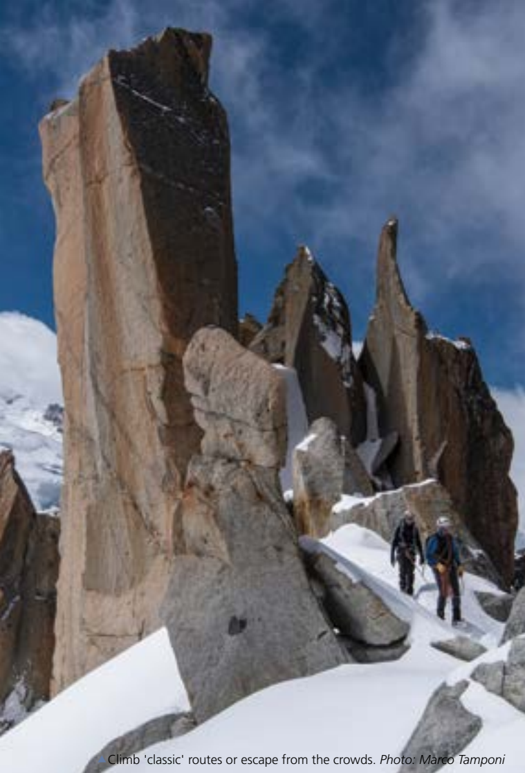
▲ Climb 'classic' routes or escape from the crowds.