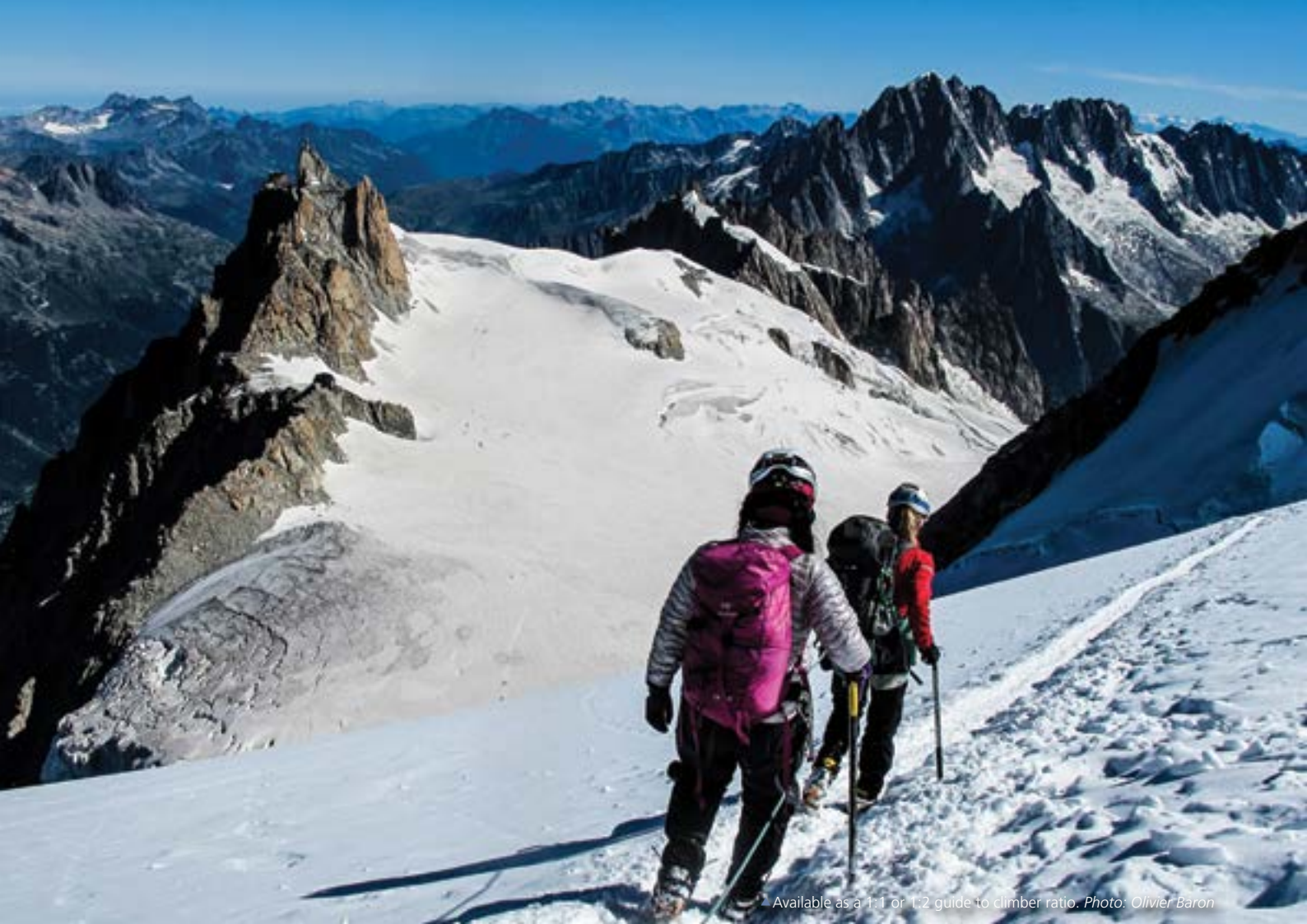
Available as a 1:1 or 1:2 guide to climber ratio.