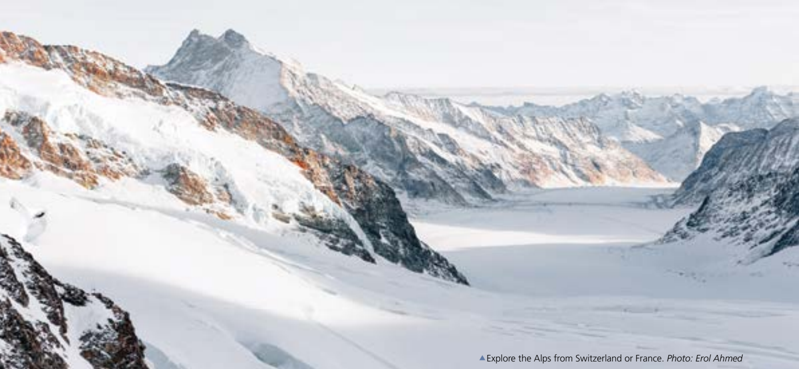
▲ Explore the Alps from Switzerland or France.