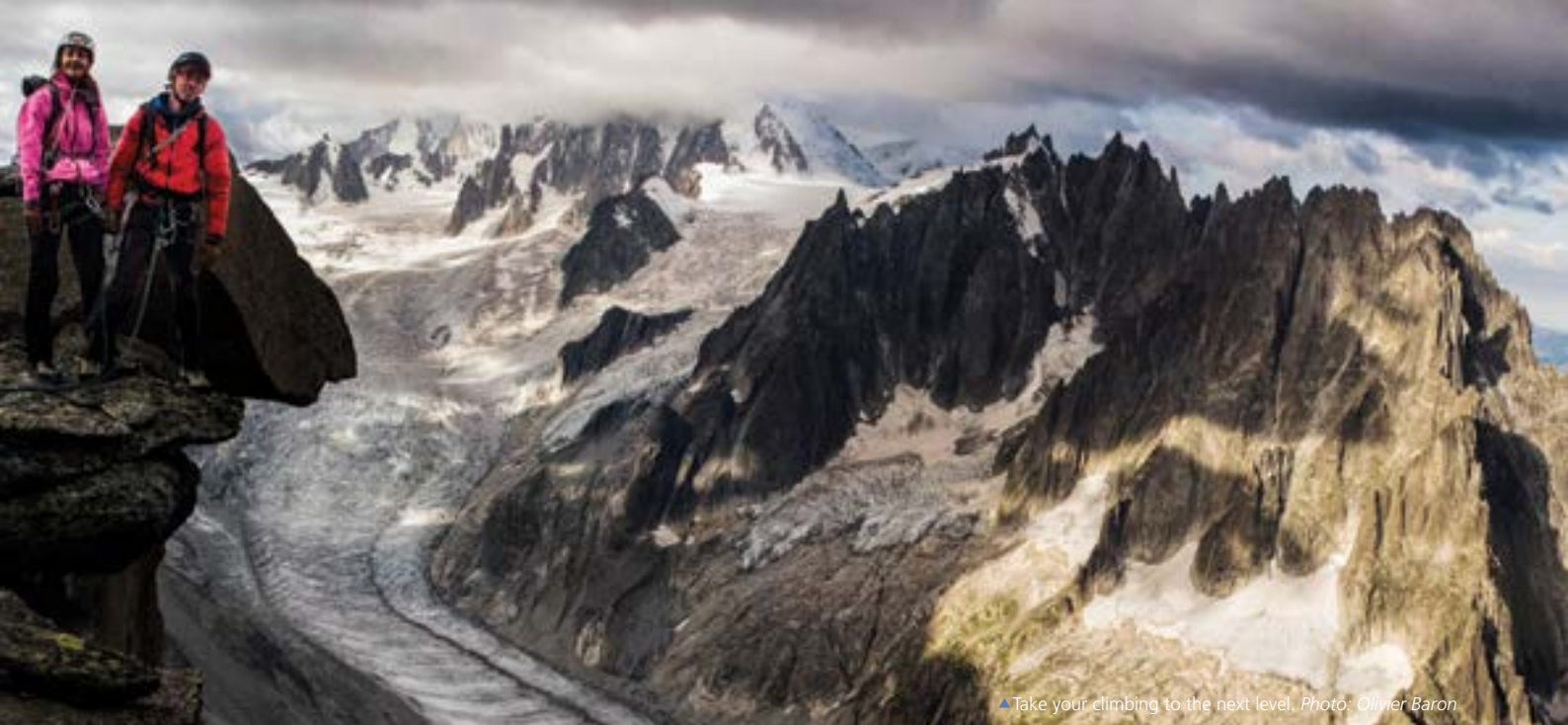
▲ Take your climbing to the next level.