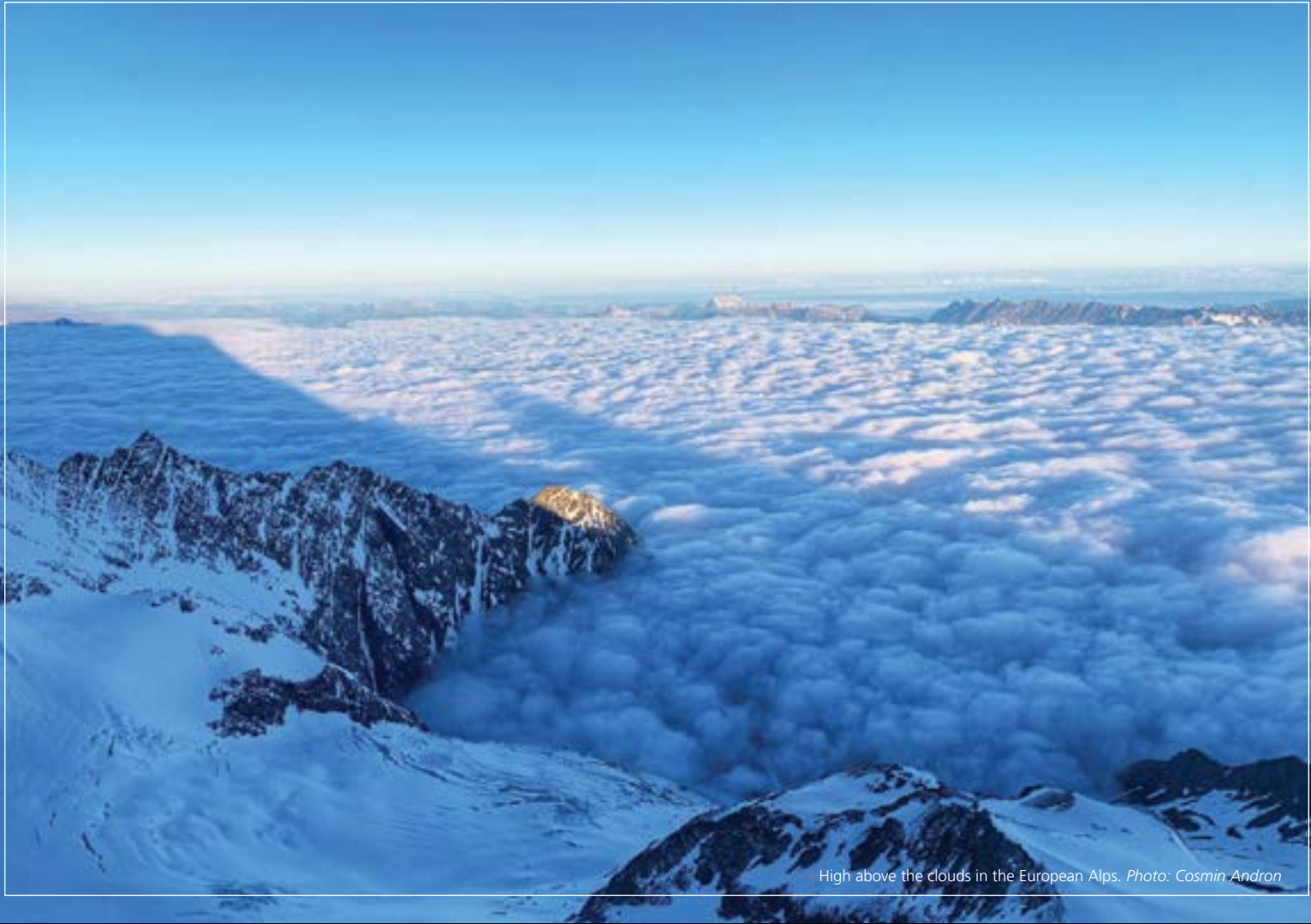
High above the clouds in the European Alps.