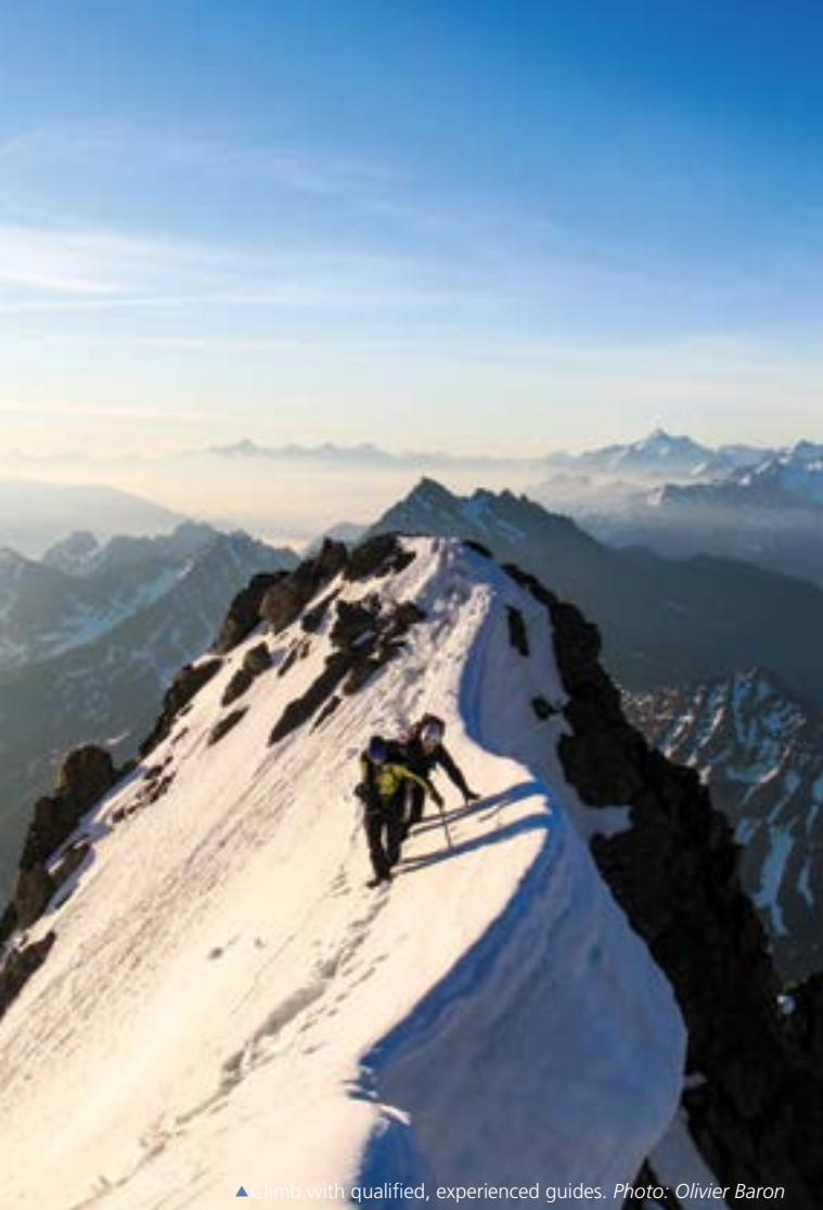
▲ Climb with qualified, experienced guides.

Our registration form requests that you advise us of any medical problems you may have and of any medication you may be taking. Any information you supply will be treated as confidential.