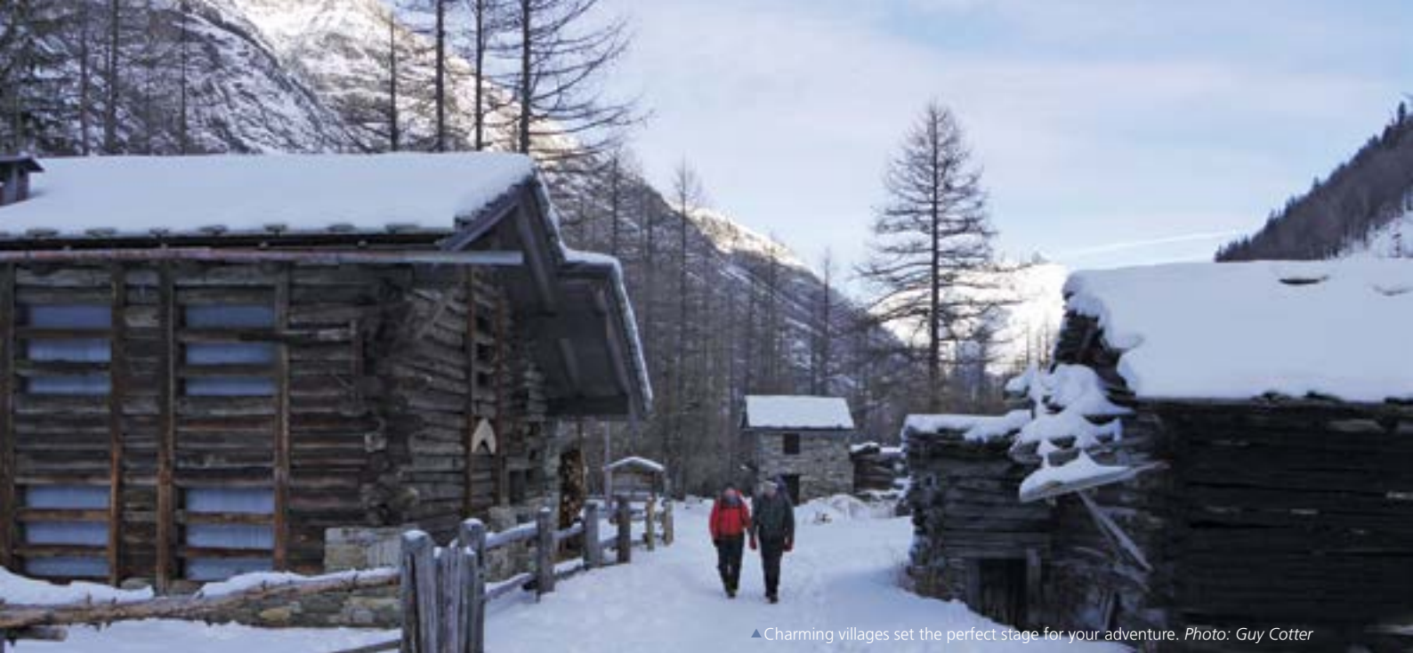
▲ Charming villages set the perfect stage for your adventure.