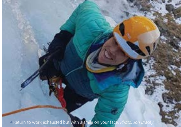
▲ Return to work exhausted but with a smile on your face.