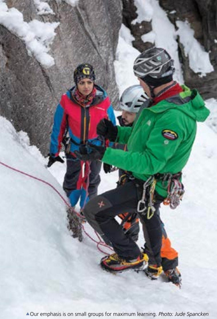
▲ Our emphasis is on small groups for maximum learning.