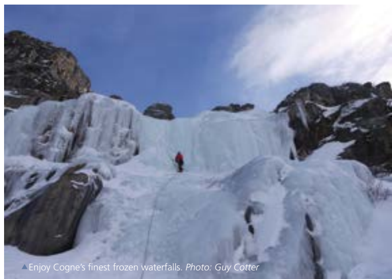
▲ Enjoy Cogne's finest frozen waterfalls.

hotel and take you back to the airport. The shuttle transfers are at your own cost but we can arrange this for you.