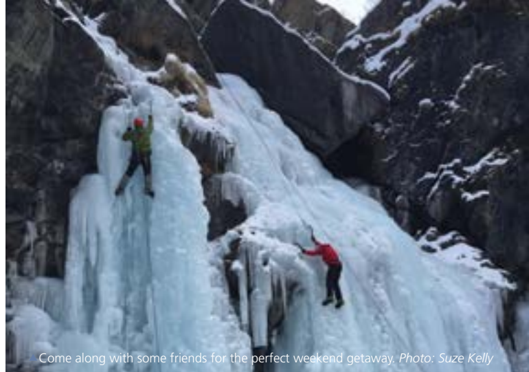
Come along with some friends for the perfect weekend getaway.