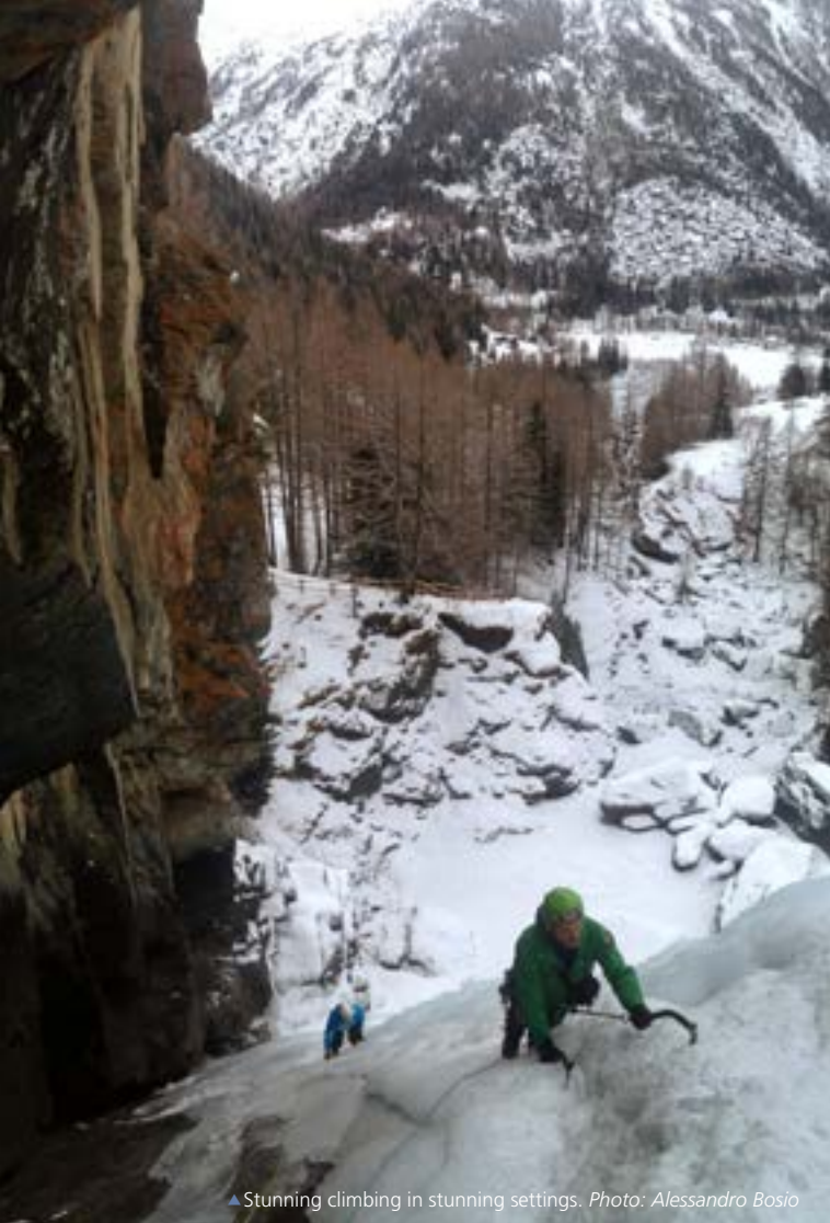
▲ Stunning climbing in stunning settings.