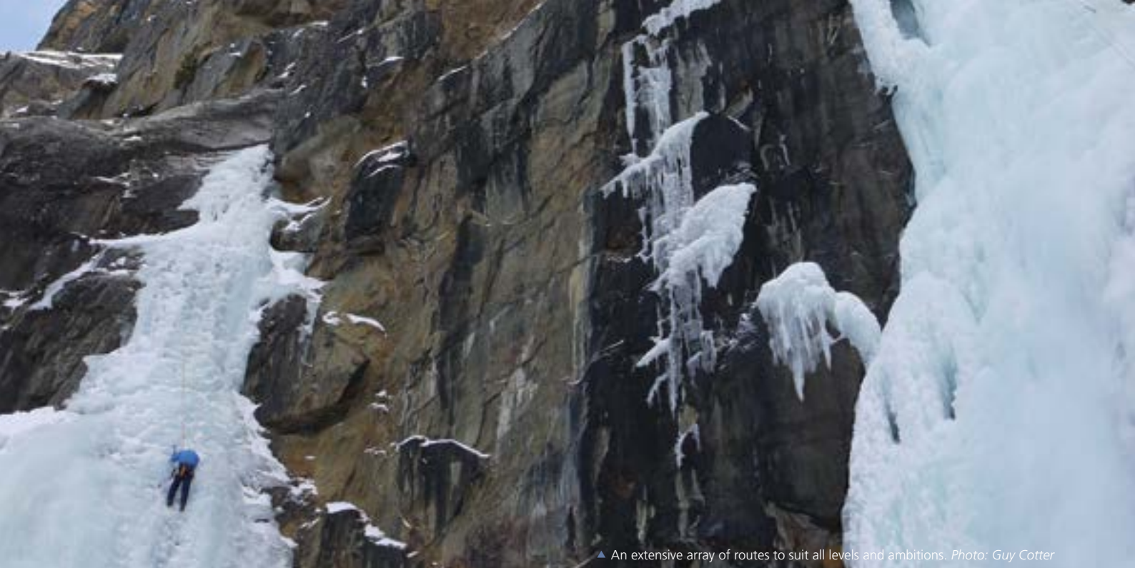
▲ An extensive array of routes to suit all levels and ambitions.

Being a technically proficient climber alone is not enough to work with us; our standards demand that trip leaders are great guides with good people skills as well. You will find your guide friendly, approachable and focused on providing a safe and enjoyable trip in line with your objectives and comfort level.