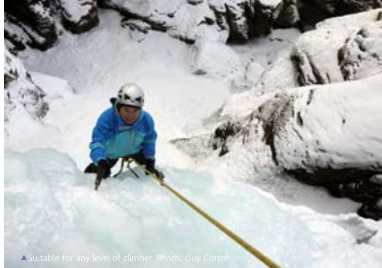
▲ Suitable for any level of climber.