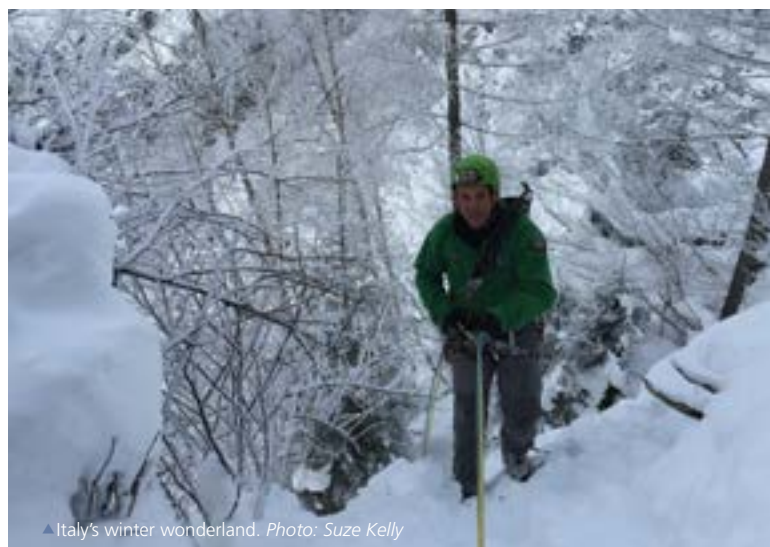
▲ Italy's winter wonderland.