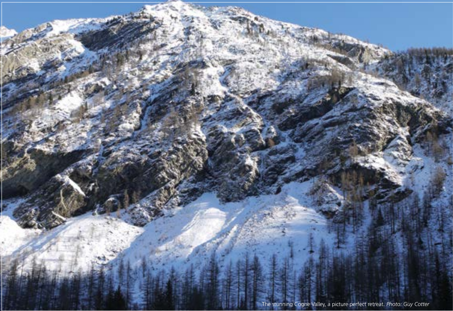
The stunning Cogne Valley, a picture perfect retreat.