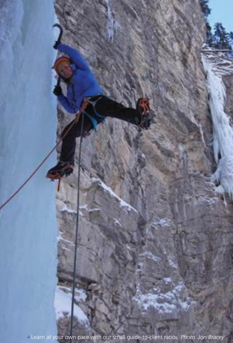
▲ Learn at your own pace with our small guide-to-client ratios.