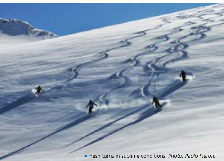
▲ Fresh turns in sublime conditions.