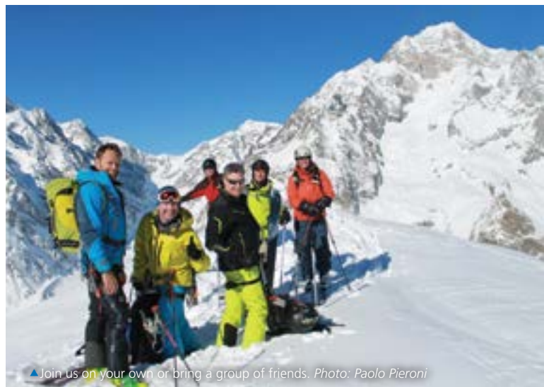
▲ Join us on your own or bring a group of friends.