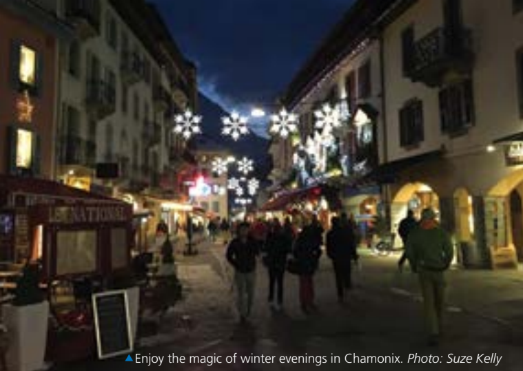
▲ Enjoy the magic of winter evenings in Chamonix.