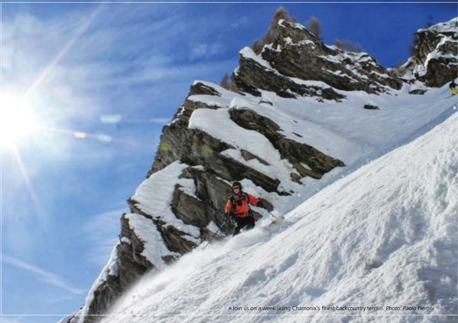
▲ Join us on a week skiing Chamonix's finest backcountry terrain.