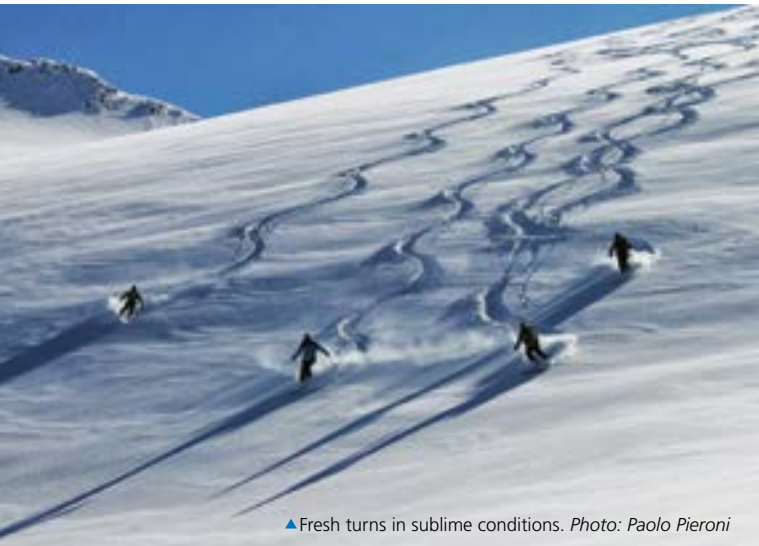
▲ Fresh turns in sublime conditions.