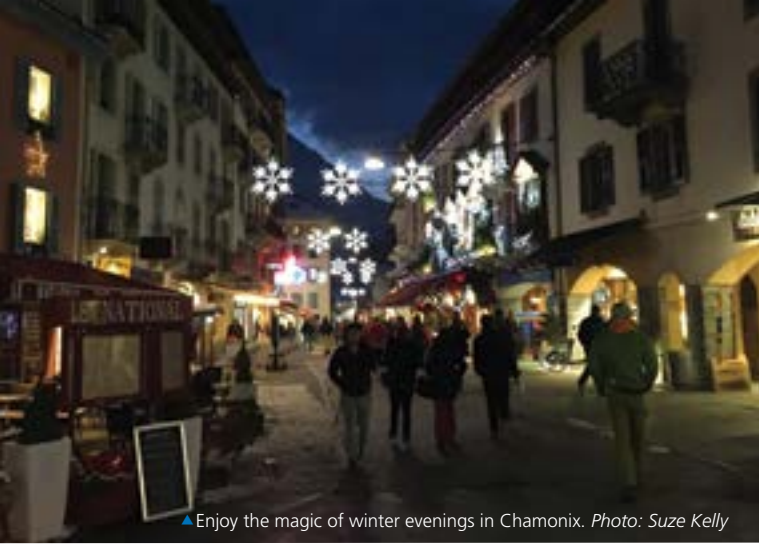
▲ Enjoy the magic of winter evenings in Chamonix.