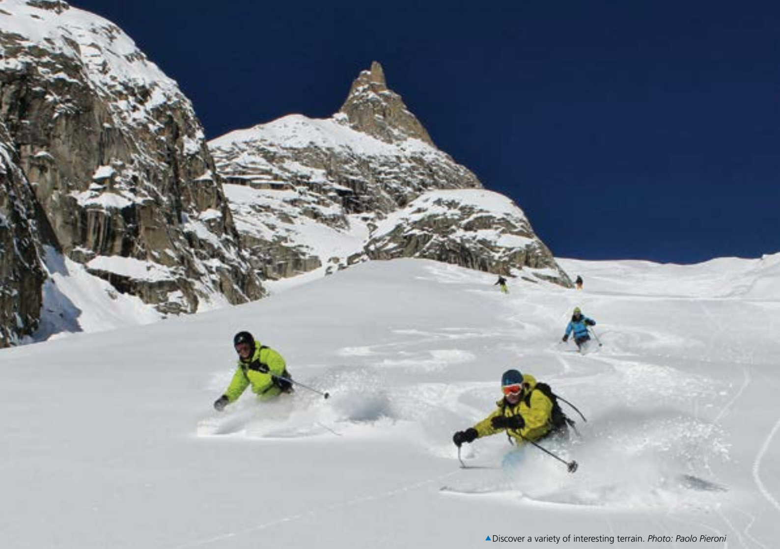
▲ Discover a variety of interesting terrain.

skins on and climbing for 2 hours up to the Col d'Entrèves on the Italian border. Now it is time for our final run down the majestic Vallée Blanche before heading back to Chamonix for a celebratory beer.