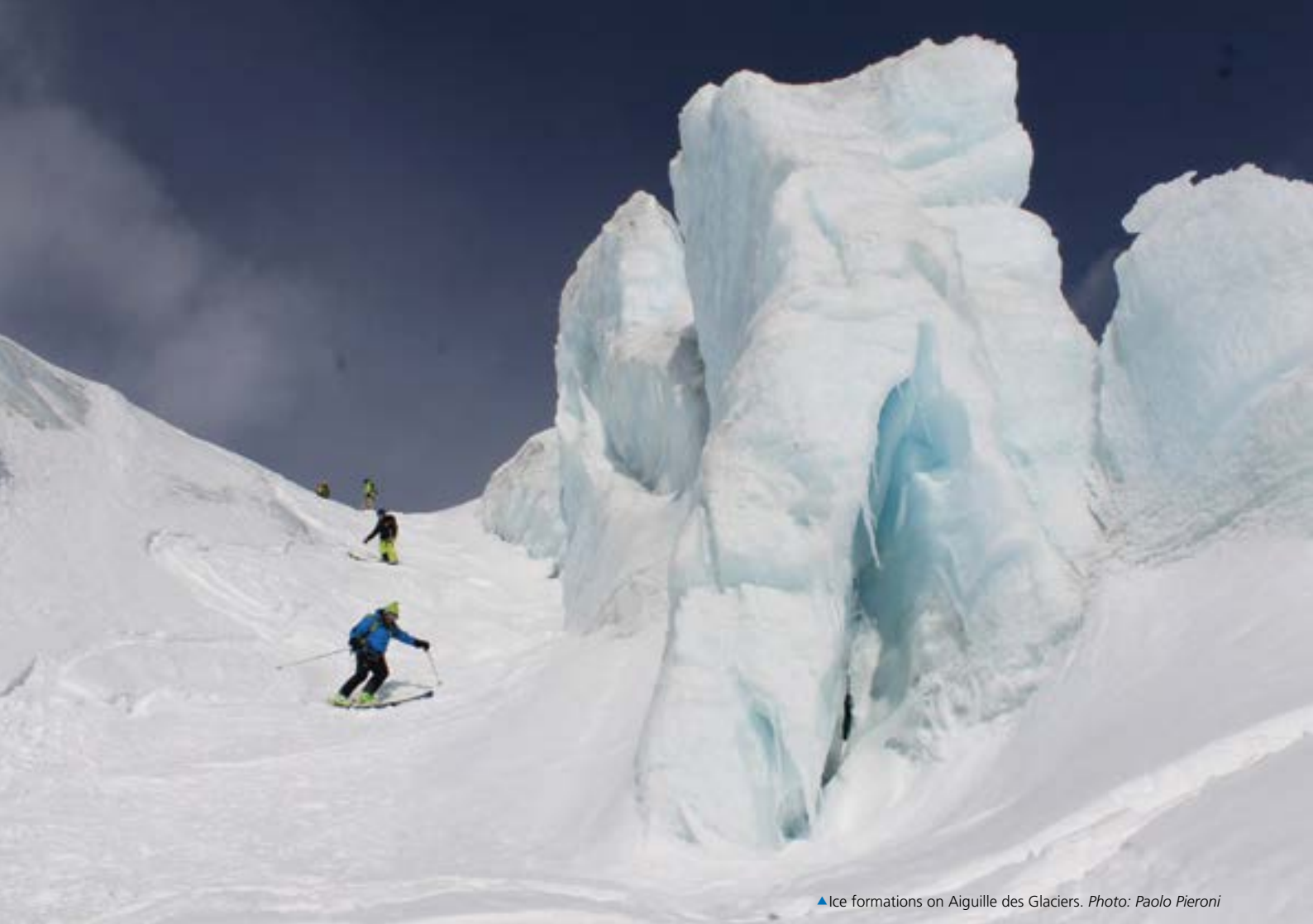
▲ Ice formations on Aiguille des Glaciers.