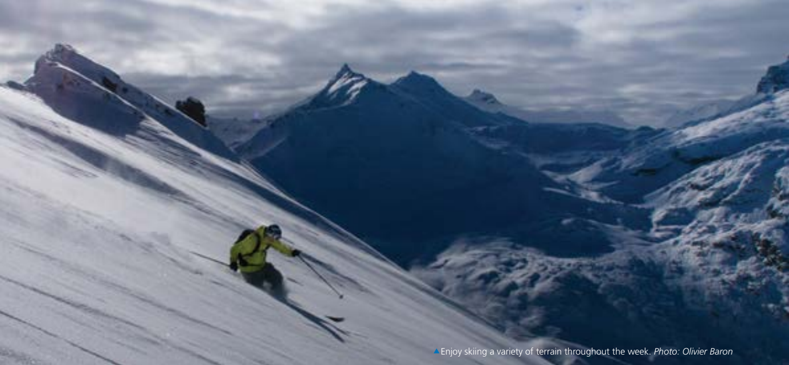
▲ Enjoy skiing a variety of terrain throughout the week.