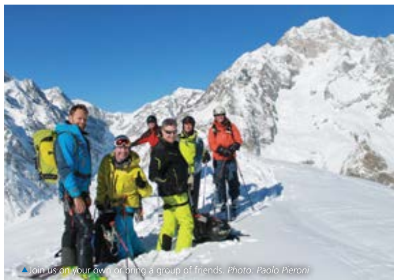
▲ Join us on your own or bring a group of friends.