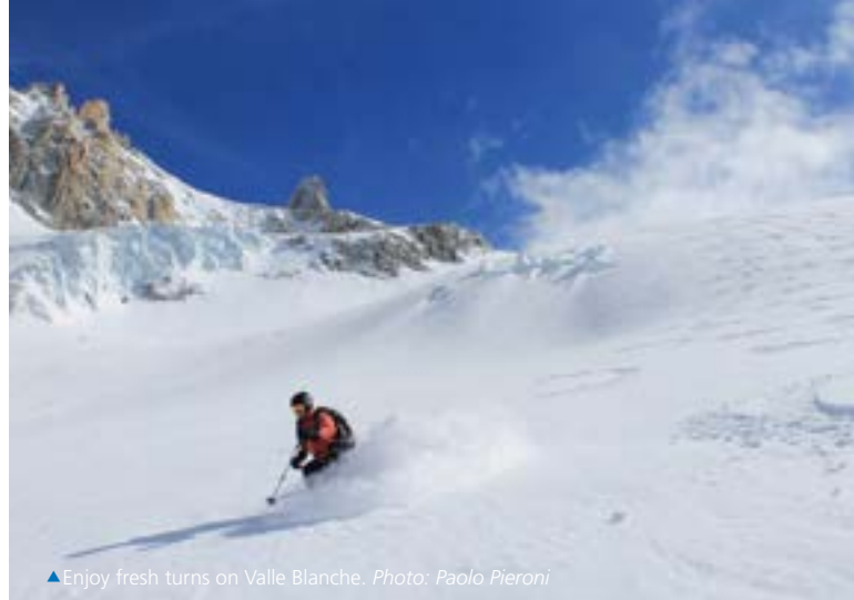
▲ Enjoy fresh turns on Valle Blanche.