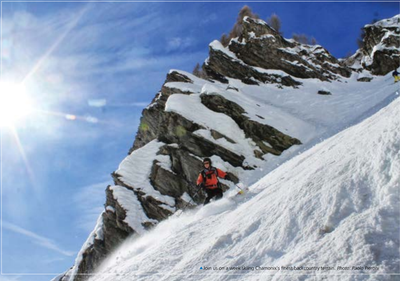
▲ Join us on a week skiing Chamonix's finest backcountry terrain.