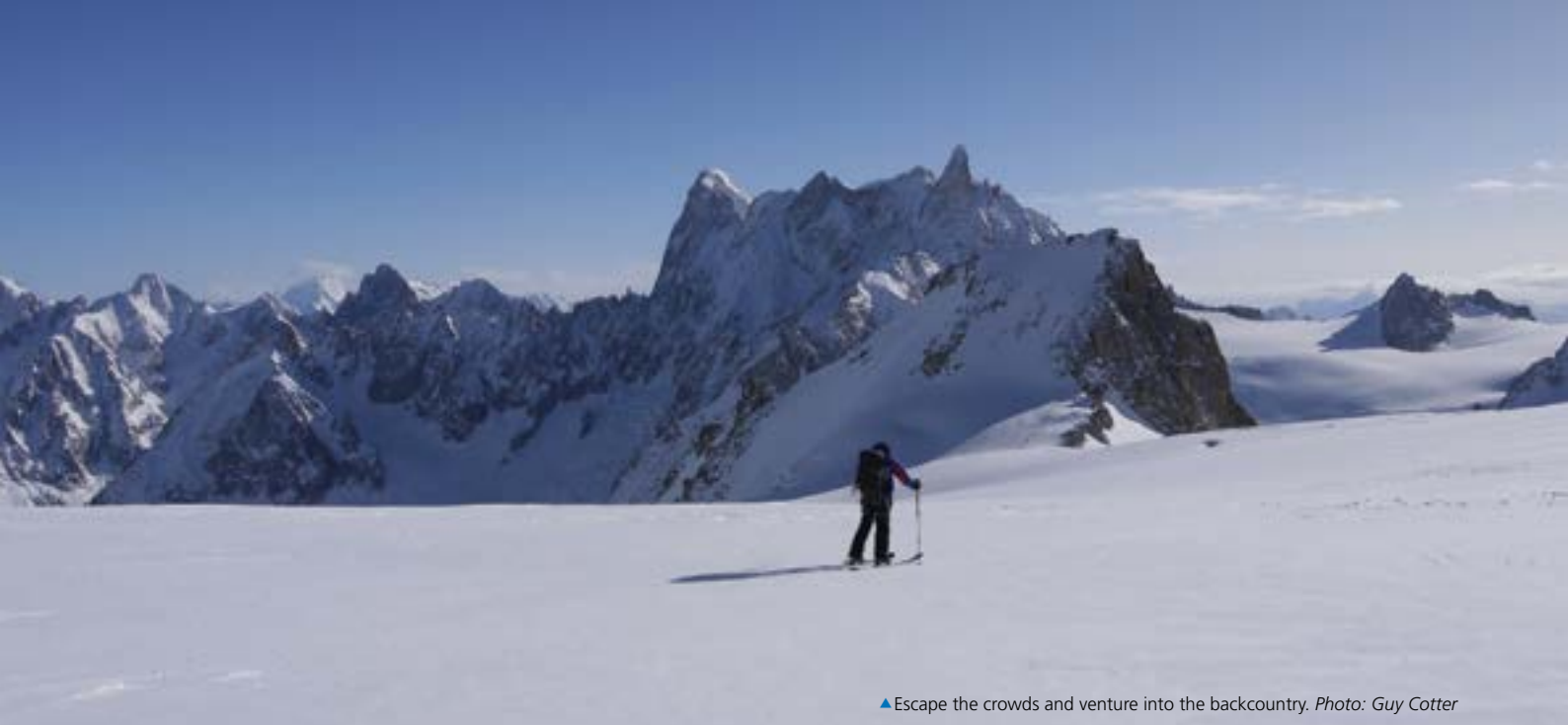
▲ Escape the crowds and venture into the backcountry.

guides. They are professional mountaineers and operate to the highest industry standards.