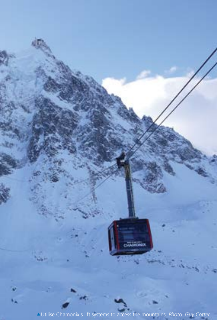
▲ Utilise Chamonix's lift systems to access the mountains.