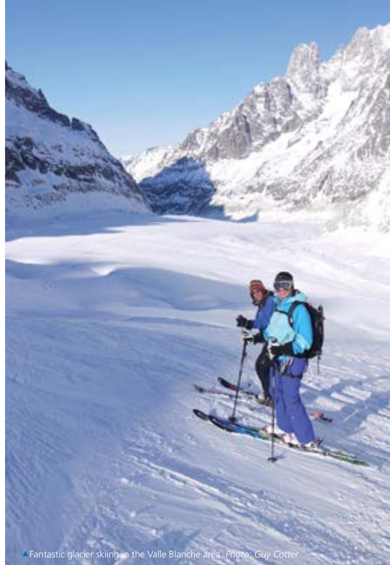
▲ Fantastic glacier skiing in the Valle Blanche area.