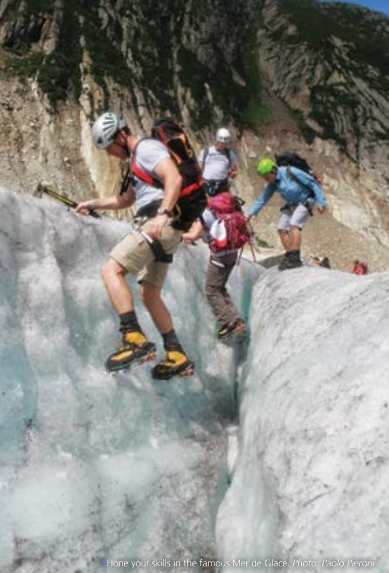
▲ Hone your skills in the famous Mer de Glace.