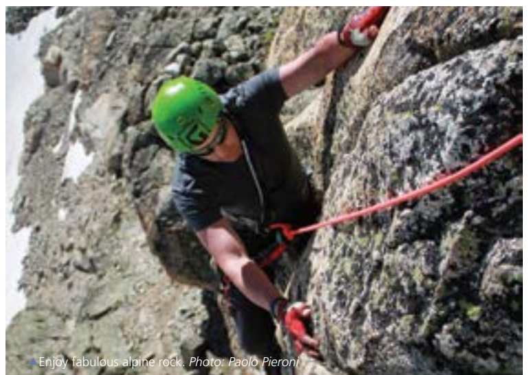
▲ Enjoy fabulous alpine rock.