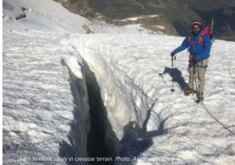
▲ Learn to move safely in crevasse terrain.