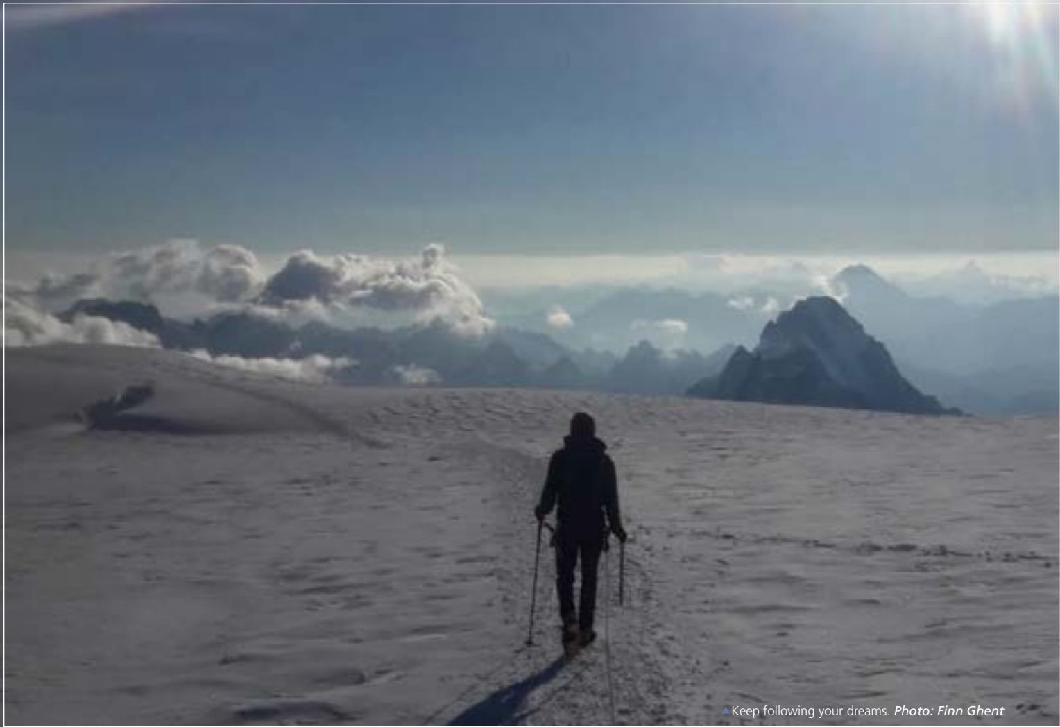
▲ Keep following your dreams.