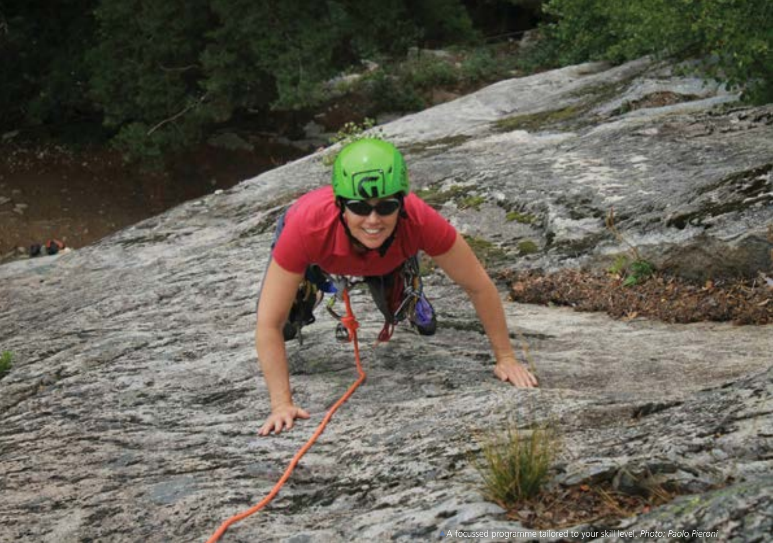
A focussed programme tailored to your skill level.