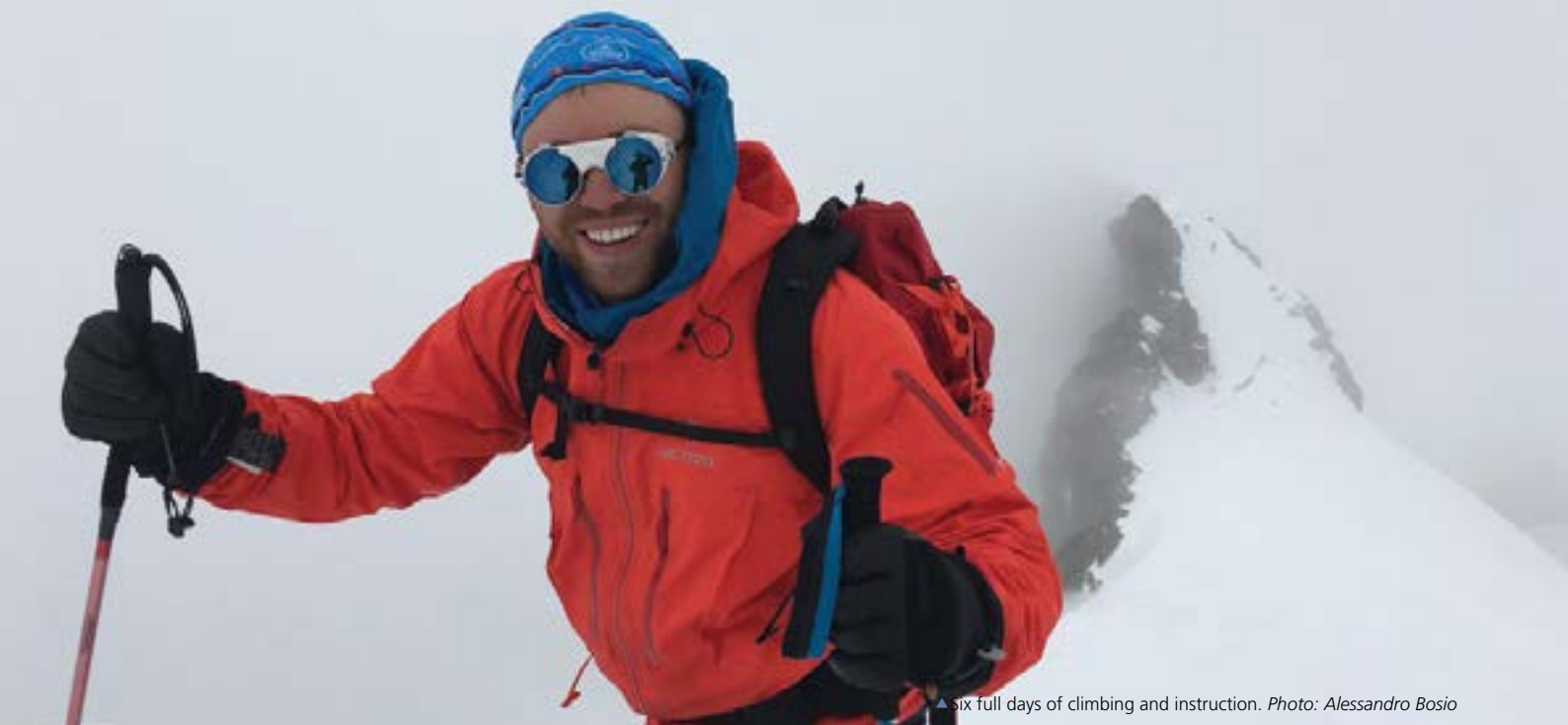
▲ six full days of climbing and instruction.