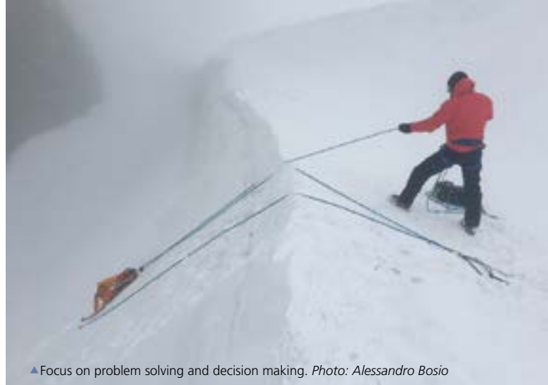
▲Focus on problem solving and decision making.