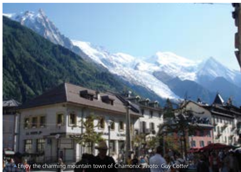
▲Enjoy the charming mountain town of Chamonix.