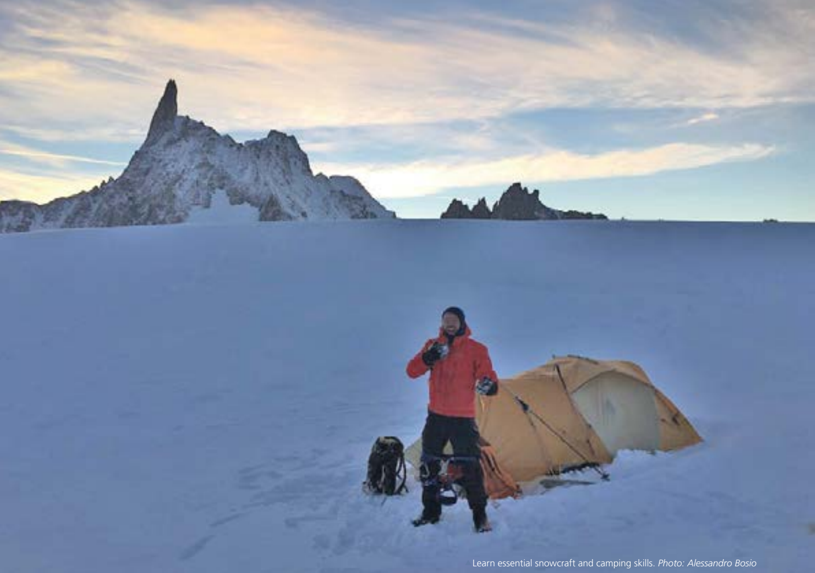
Learn essential snowcraft and camping skills.

programme begins, you experience more enjoyment from the climbs and enjoy a greater success rate.