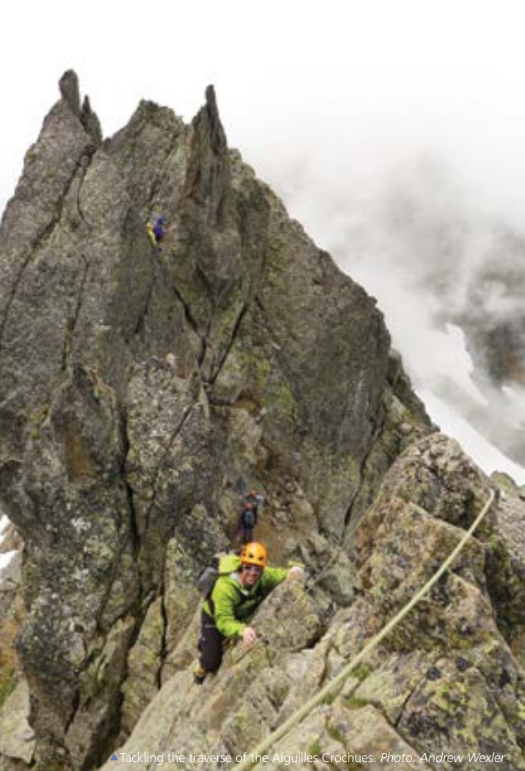
▲Tackling the traverse of the Aiguilles Crochues.