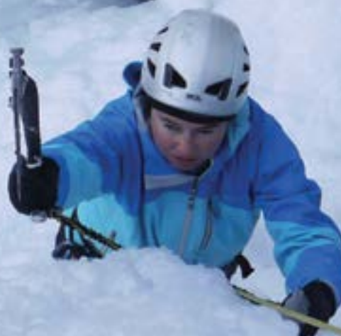
▲ Push your limits ice climbing in Chamonix and Cogne.

You will enjoy some of the best ice climbing venues on earth when you participate in our Chamonix and Cogne Ice Climbing Week. Envisage staying in charming local hotels with numerous ice venues of all levels just outside the door!