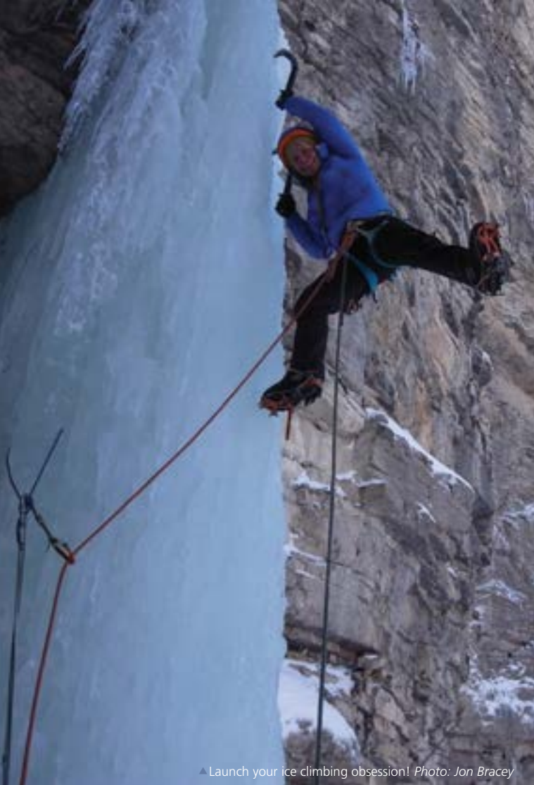
▲ Launch your ice climbing obsession!