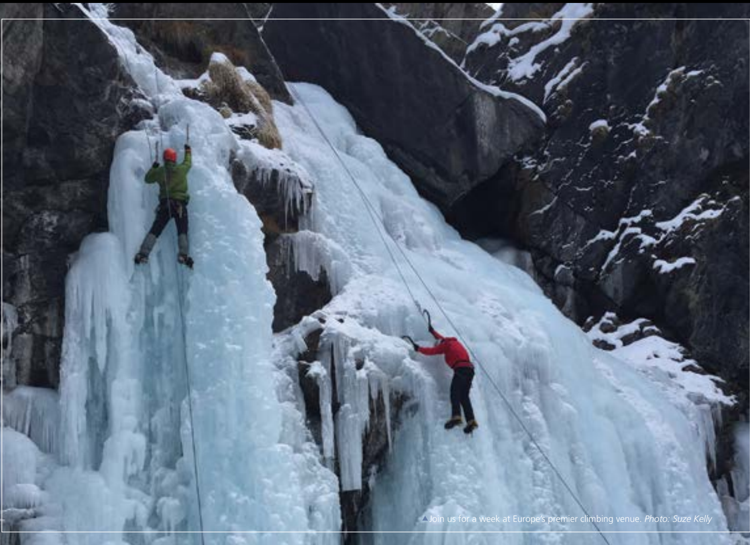
▲ Join us for a week at Europe's premier climbing venue.