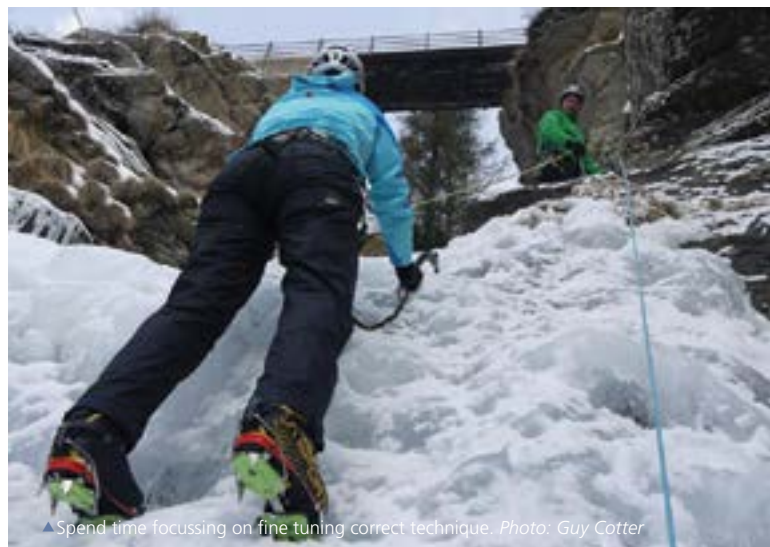
▲ Spend time focussing on fine tuning correct technique.

changes will be actioned only after you have been consulted by your guide)