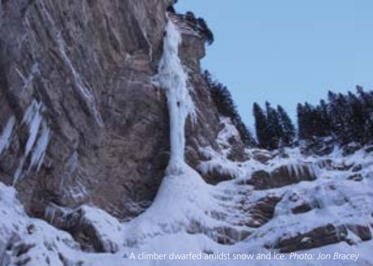
▲ A climber dwarfed amidst snow and ice.