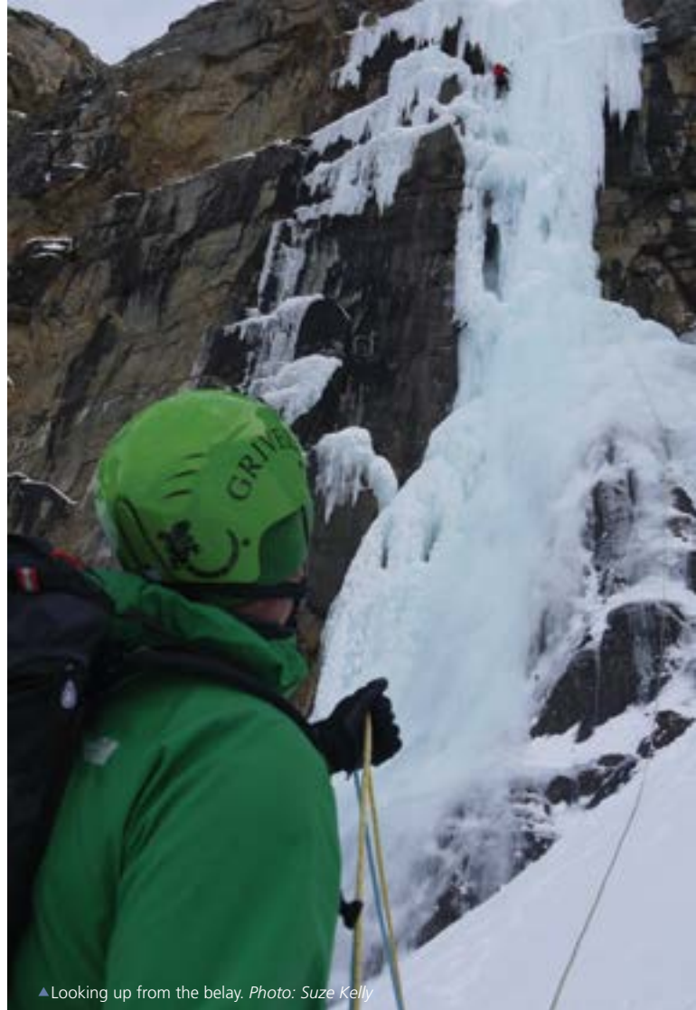
▲ Looking up from the belay.