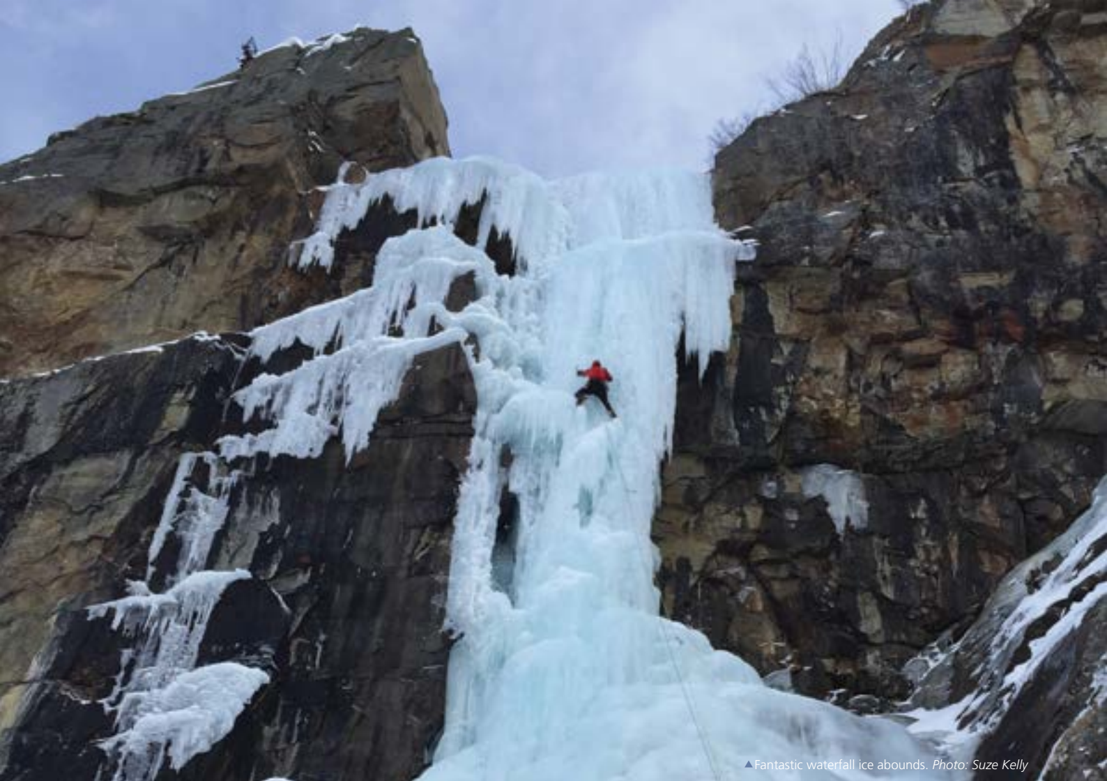
▲ Fantastic waterfall ice abounds.