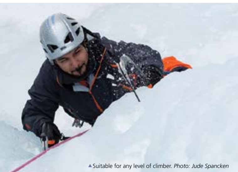
▲ Suitable for any level of climber.