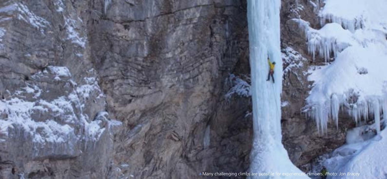
▲ Many challenging climbs are possible for experienced climbers.

You can also book any dates that suit you during the climbing season (from December to April) depending on guide availability.