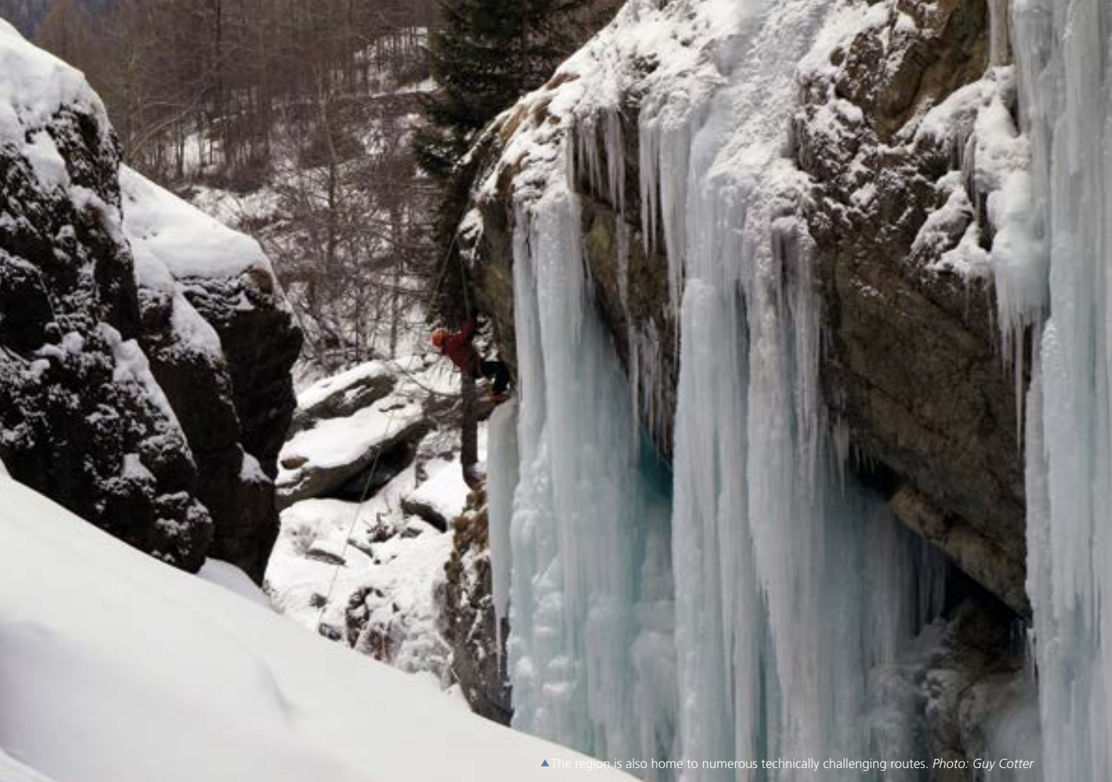
▲ The region is also home to numerous technically challenging routes.