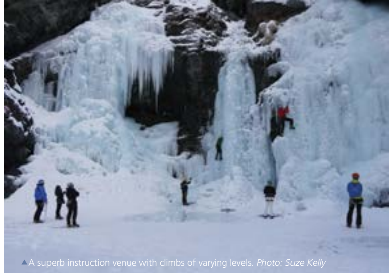
▲ A superb instruction venue with climbs of varying levels.