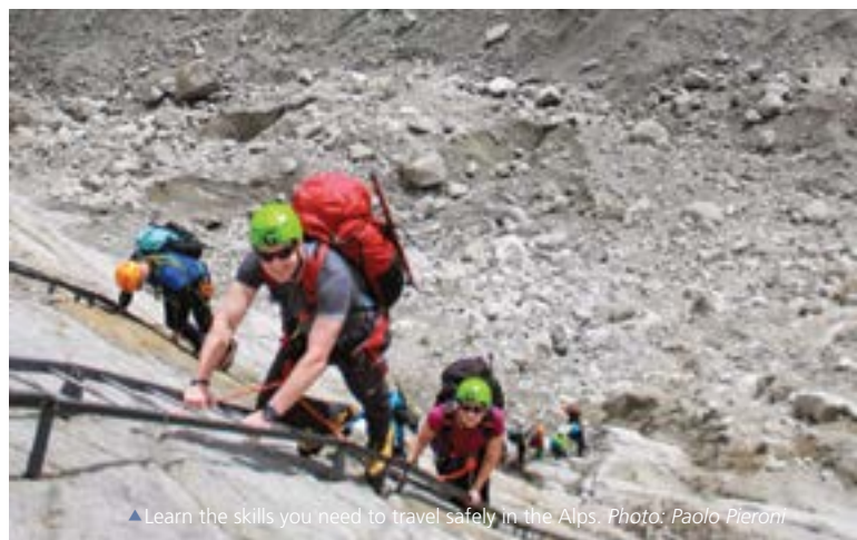
▲ Learn the skills you need to travel safely in the Alps.