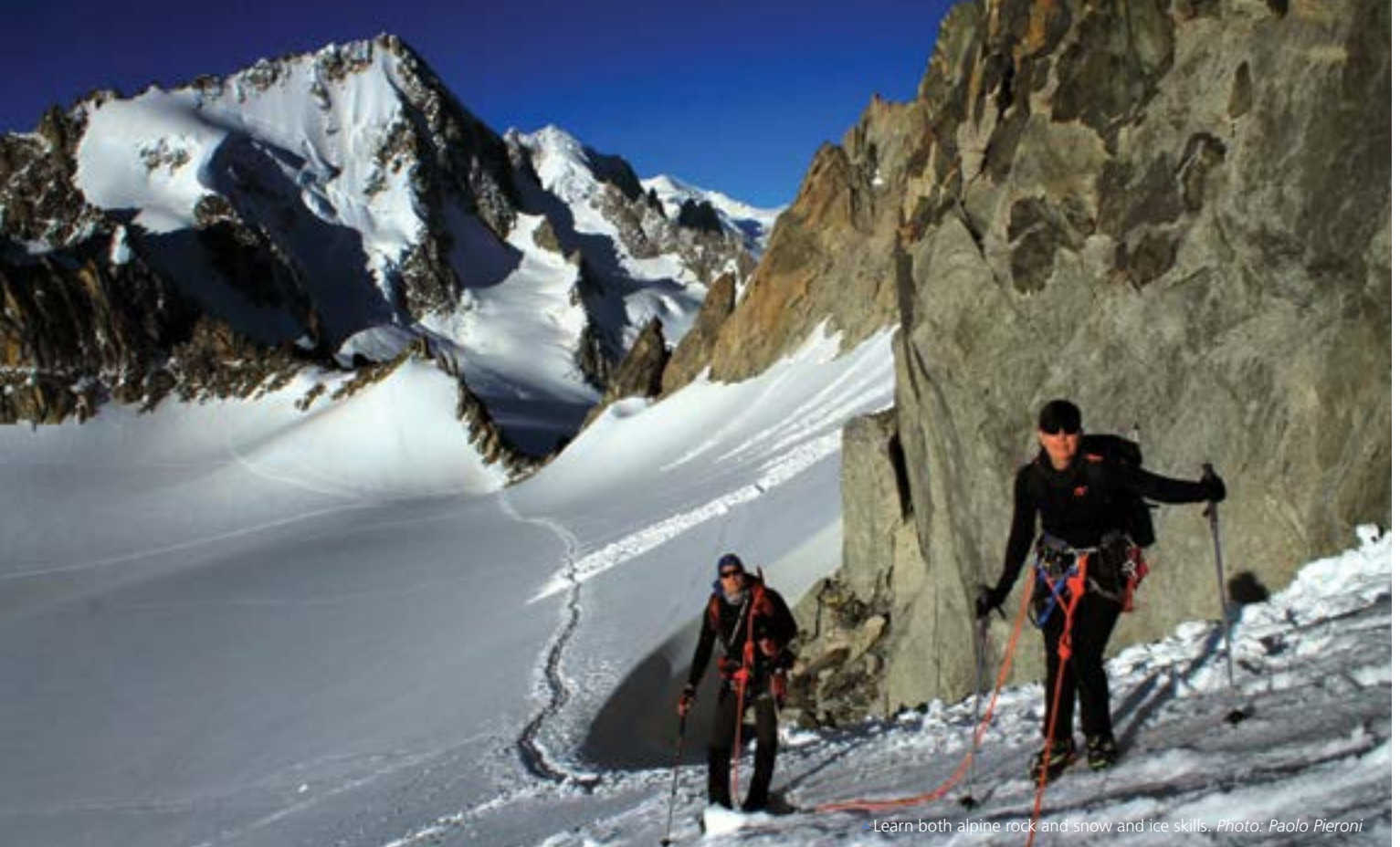
Learn both alpine rock and snow and ice skills.

only certification that is recognised in the French Alps. Guides must undergo rigorous training and assessment on climbing skills, instructional skills, avalanche training and assessment, wilderness first aid, rescue training and much more to gain these qualifications. It takes many years to attain IFMGA status, which ensures you are getting a world-class professional service.