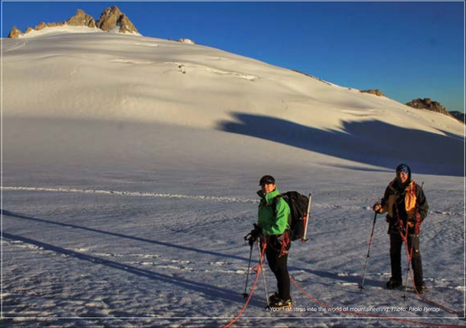
▲ Your first steps into the world of mountaineering.