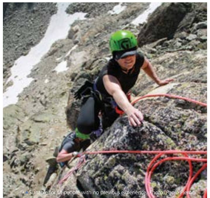
Suitable for fit people with no previous experience.

Our registration form requests that you advise us of any medical problems you may have and any medications you may be taking. Any information you supply will be treated as confidential.