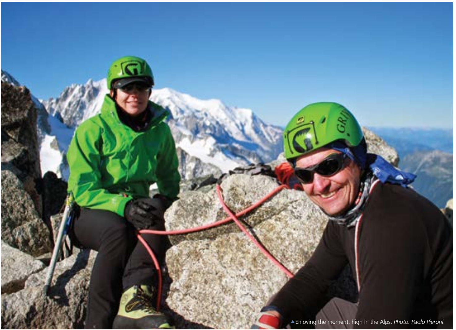
▲Enjoying the moment, high in the Alps.