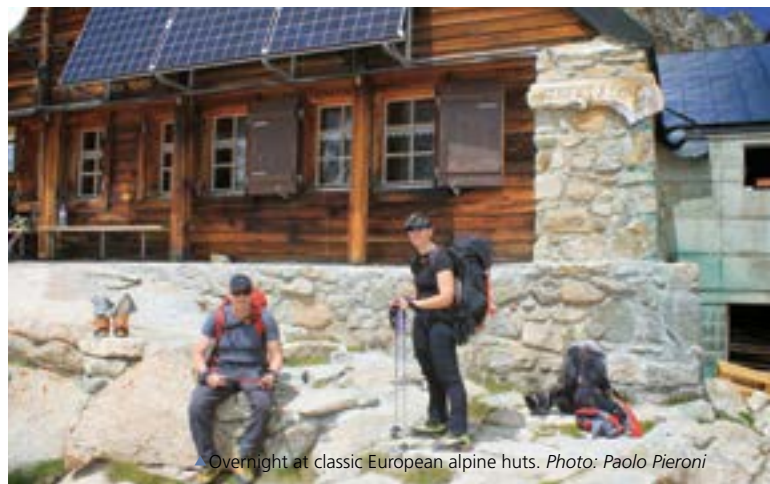
▲ Overnight at classic European alpine huts.