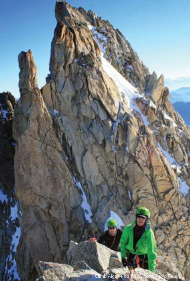
Climb Aiguille du Tour.