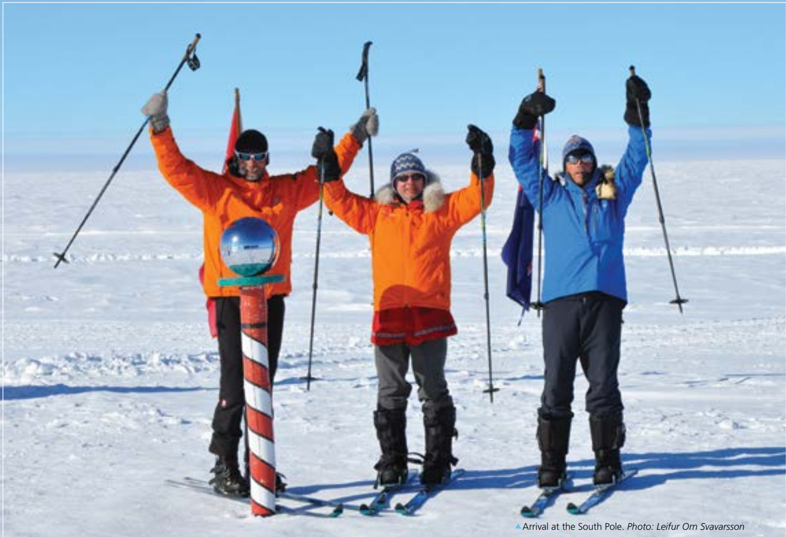
▲ Arrival at the South Pole.