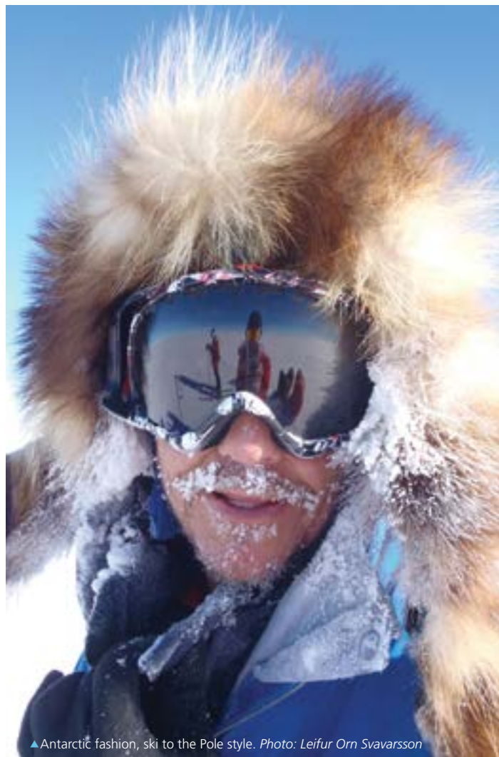
▲ Antarctic fashion, ski to the Pole style.