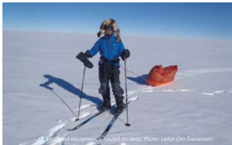
▲ Food and equipment is hauled on sleds.

Every effort will be made to ensure the expedition itinerary is adhered to, but Antarctica is the most remote and isolated continent on earth. The above program is subject to change as it may be affected by weather conditions, aircraft serviceability and other factors are out of the hands of Adventure Consultants, our staff and contractors. While every effort is made to ensure the expedition is run to schedule, acceptance onto the expedition is based on your acceptance of those conditions. Having stated that, our track record in Antarctica is impeccable, but it is a sign of our respect of Antarctica's environmental omnipotence that we alert you to those possibilities.