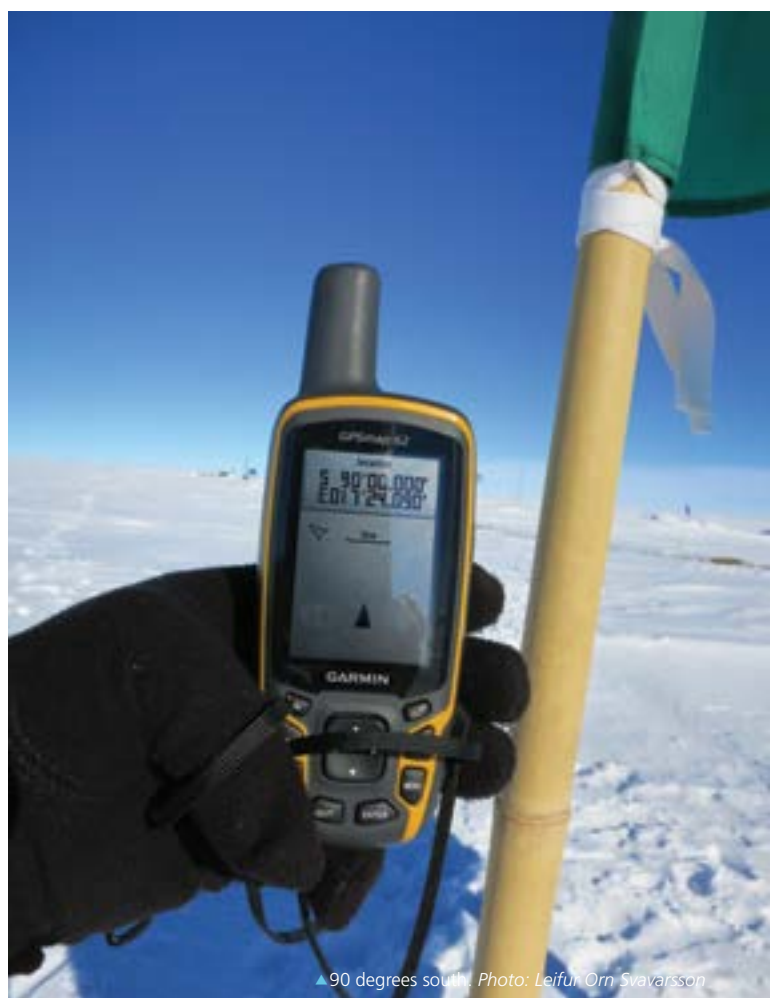
▲ 90 degrees south.