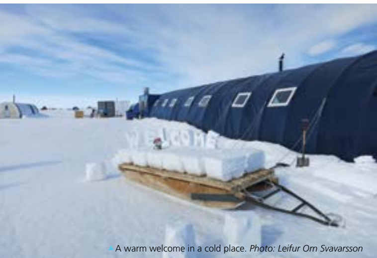
▲ A warm welcome in a cold place.

We employ strong and specialised Expedition leaders and support staff, whom are some of the most pre-eminent in the industry. We pride ourselves on operating with small teams, the best back-up and support available.