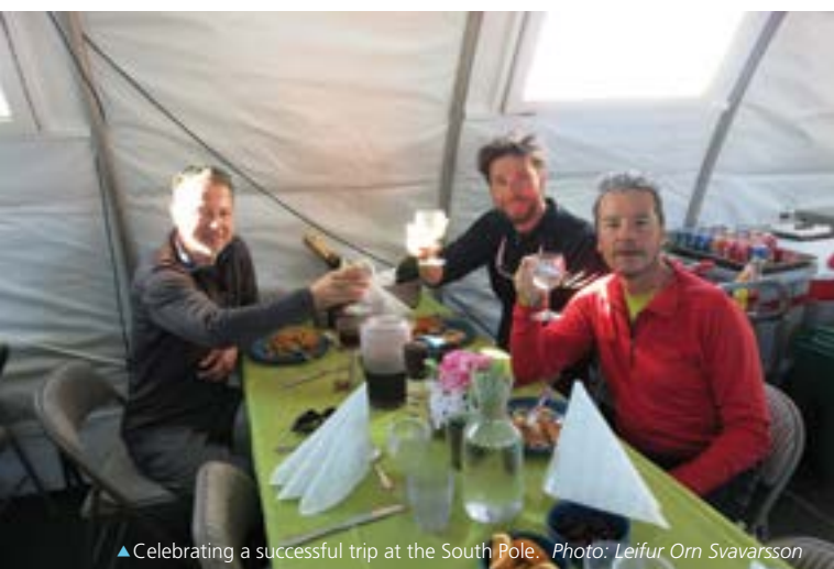
▲ Celebrating a successful trip at the South Pole.