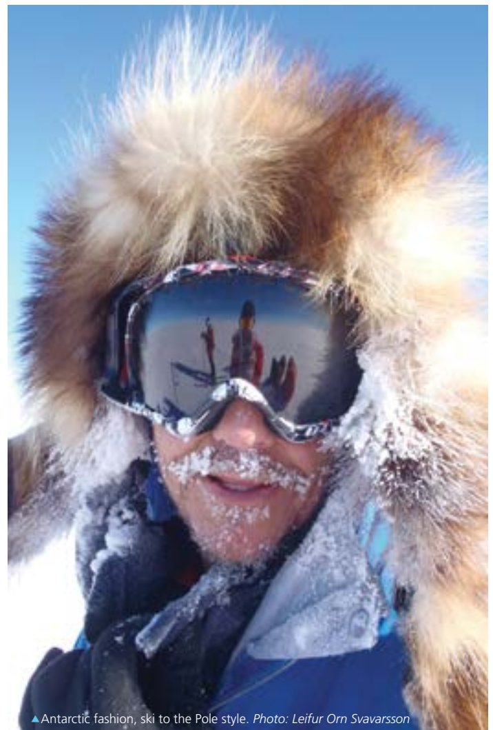
▲ Antarctic fashion, ski to the Pole style.