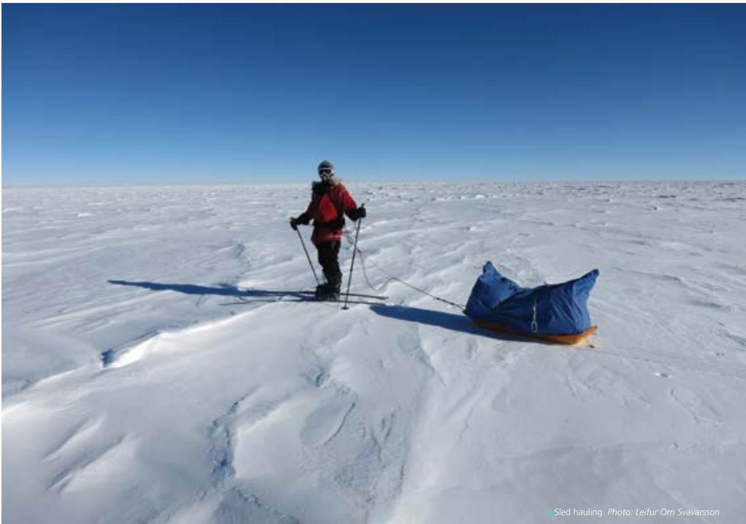
Sled hauling.

Team members will share tents in either 2 or 3 person tents and each tent 'team' will have their own stove for cooking and snow melting. Everyone is involved and working to get the camp ready for habitation. The bonus is that you will stay warm by helping! Once inside your tent you will be sheltered from the wind and the 24-hour daylight will enable clothes to be dried in the midnight sun.