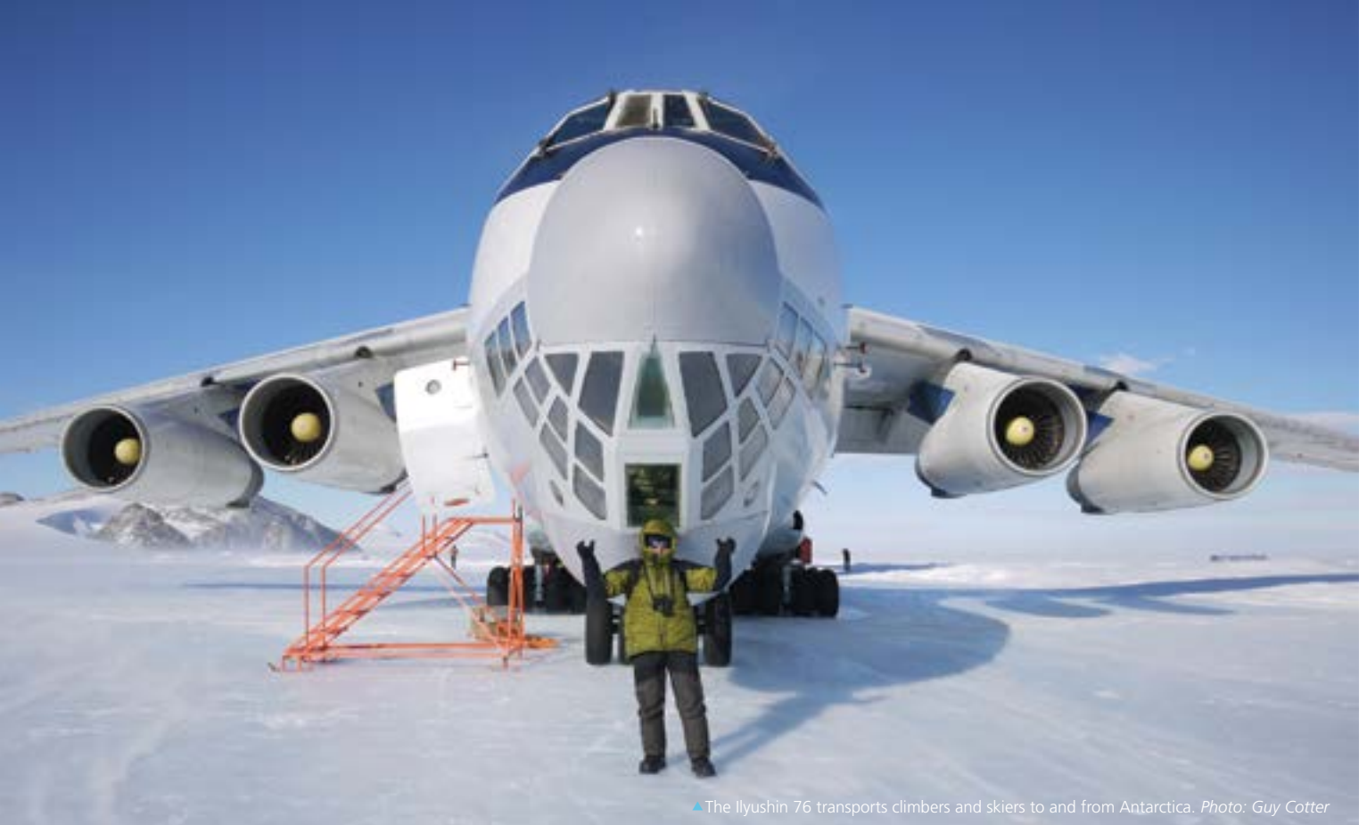
▲ The Ilyushin 76 transports climbers and skiers to and from Antarctica.

The Union Glacier Base Camp is situated at 80° South and is a small collection of tents. The dining and kitchen tent have a wooden floor and is heated with a kerosene stove. We sleep overnight in our own mountain tents but gather for meals in the warmth of the dining tent.