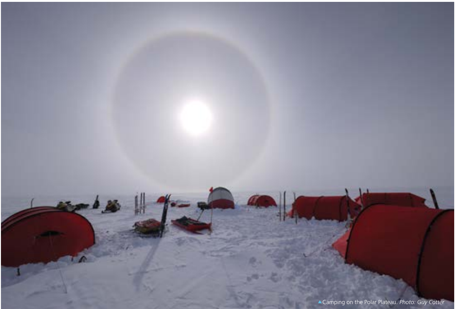
▲ Camping on the Polar Plateau.