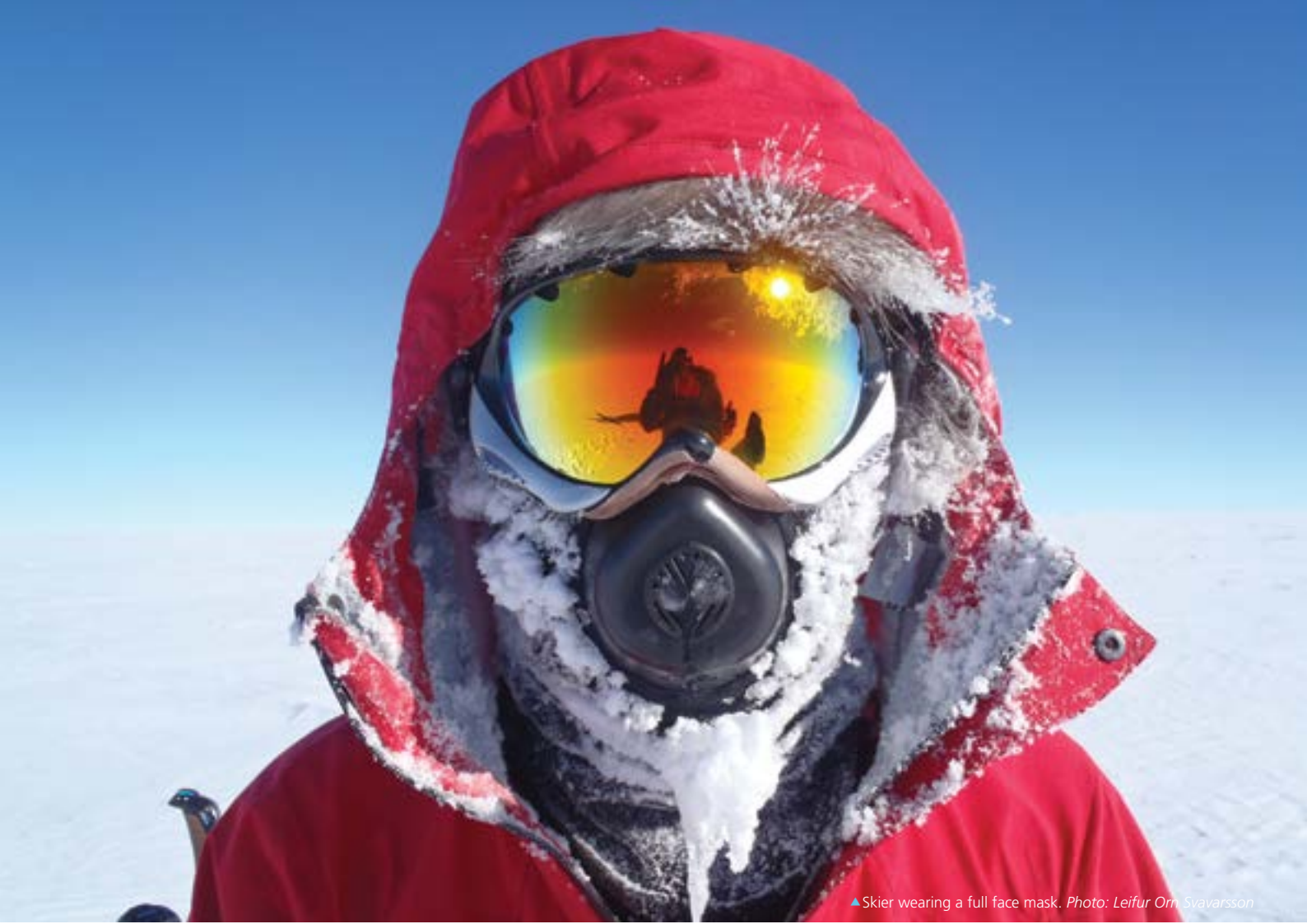
▲ Skier wearing a full face mask.