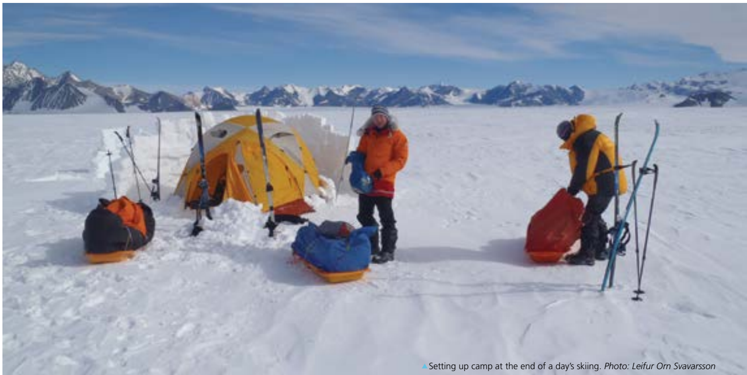
▲ Setting up camp at the end of a day's skiing.

A non-refundable deposit of US$10,000 is payable to secure a place on the expedition.