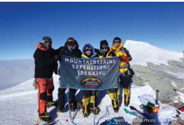
▲ Another successful AC Team summits.

Adventure Consultants can book your hotel in Punta Arenas or you can take care of this yourself. Please advise us at the time of booking.