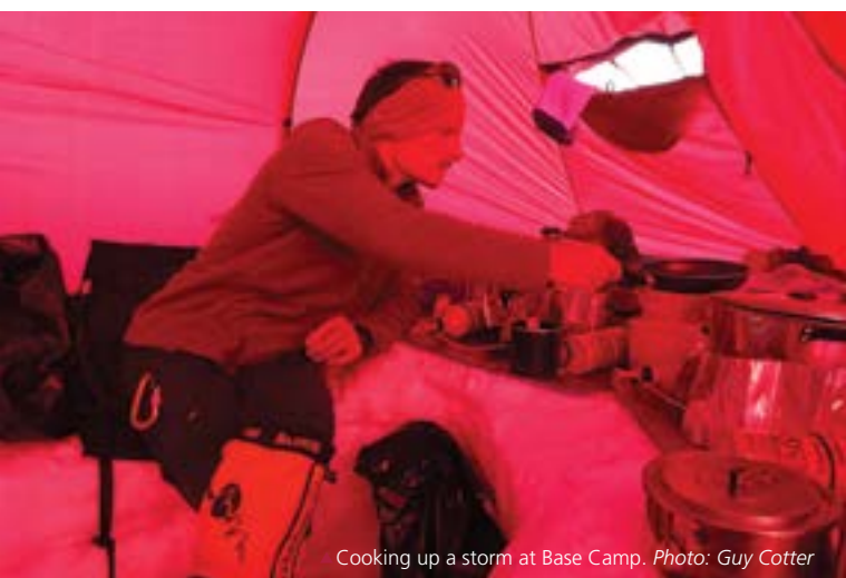
▲ Cooking up a storm at Base Camp.