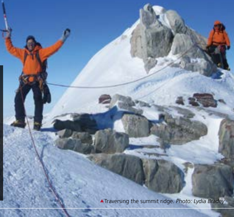
▲ Traversing the summit ridge.

During the southern summer of 2025/2026, Adventure Consultants will operate its twenty-eighth year of expeditions to Mount Vinson, Antarctica's highest summit. If you have a desire to discover the Antarctic interior and stand on the summit of Mount Vinson, then this is an exciting opportunity and very likely your best chance of achieving that goal.