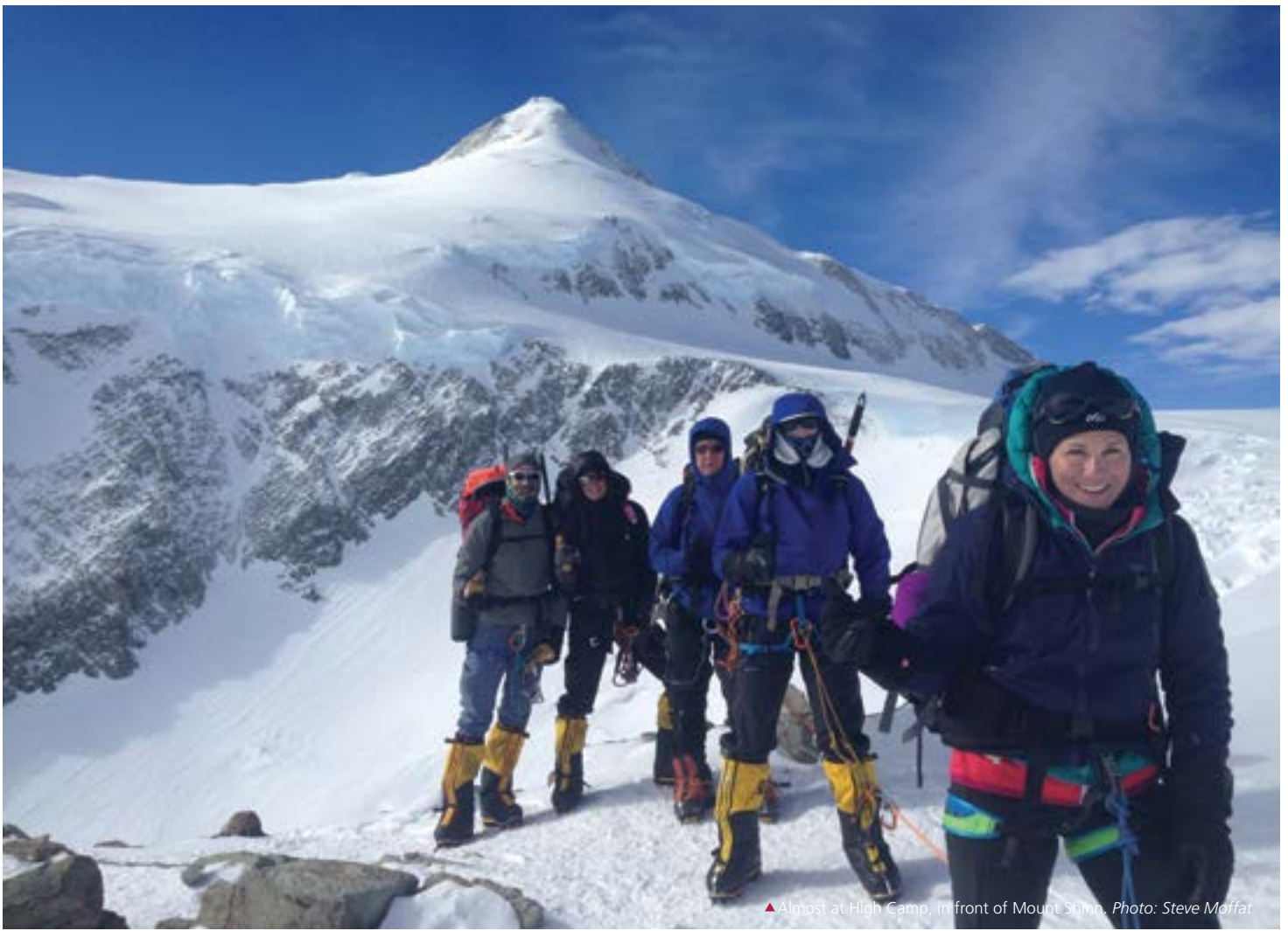
▲ Almost at High Camp, in front of Mount Shinn.