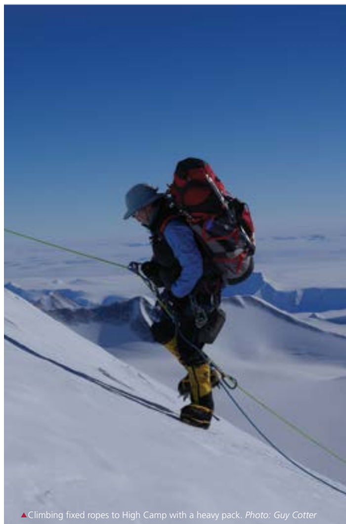
▲ Climbing fixed ropes to High Camp with a heavy pack.