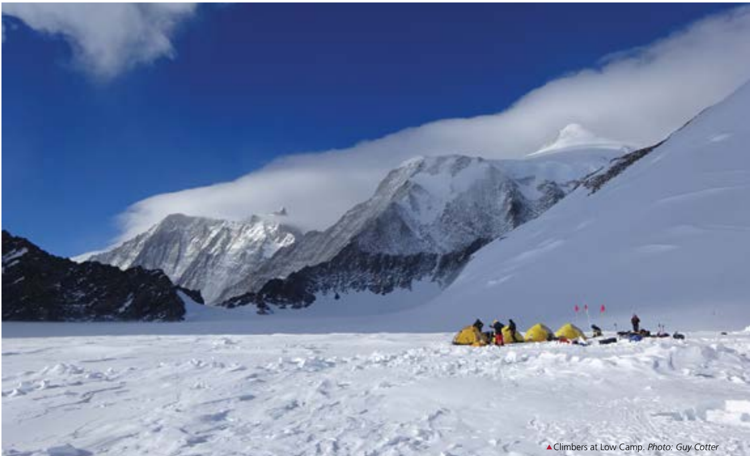
▲ Climbers at Low Camp.