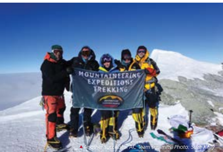
▲ Another successful AC Team summits.

Adventure Consultants can book your hotel in Punta Arenas or you can take care of this yourself. Please advise us at the time of booking.