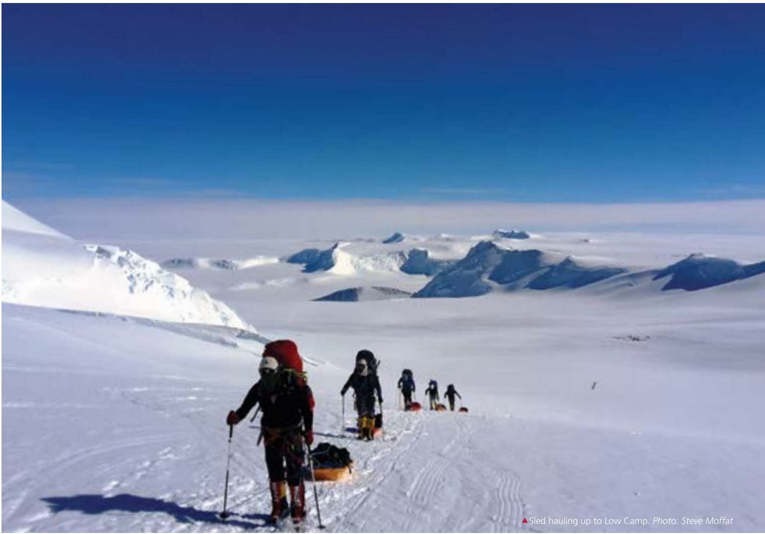
▲ Sled hauling up to Low Camp.