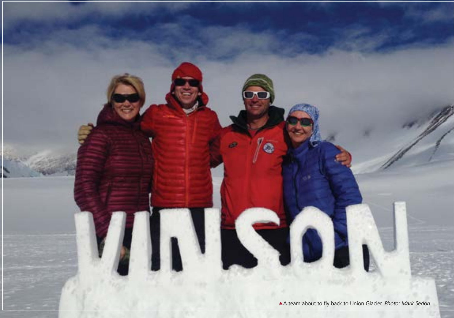
▲ A team about to fly back to Union Glacier.