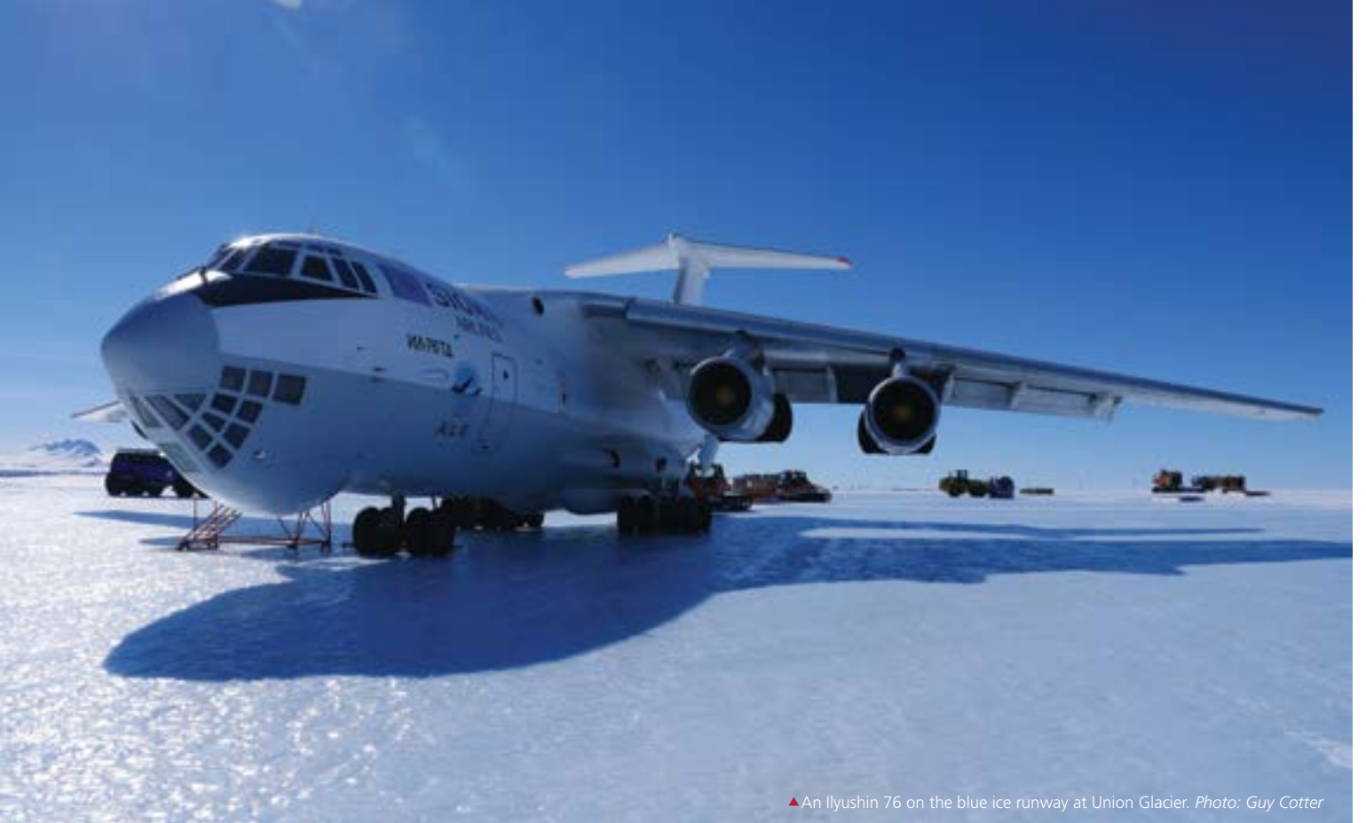
▲ An Ilyushin 76 on the blue ice runway at Union Glacier.