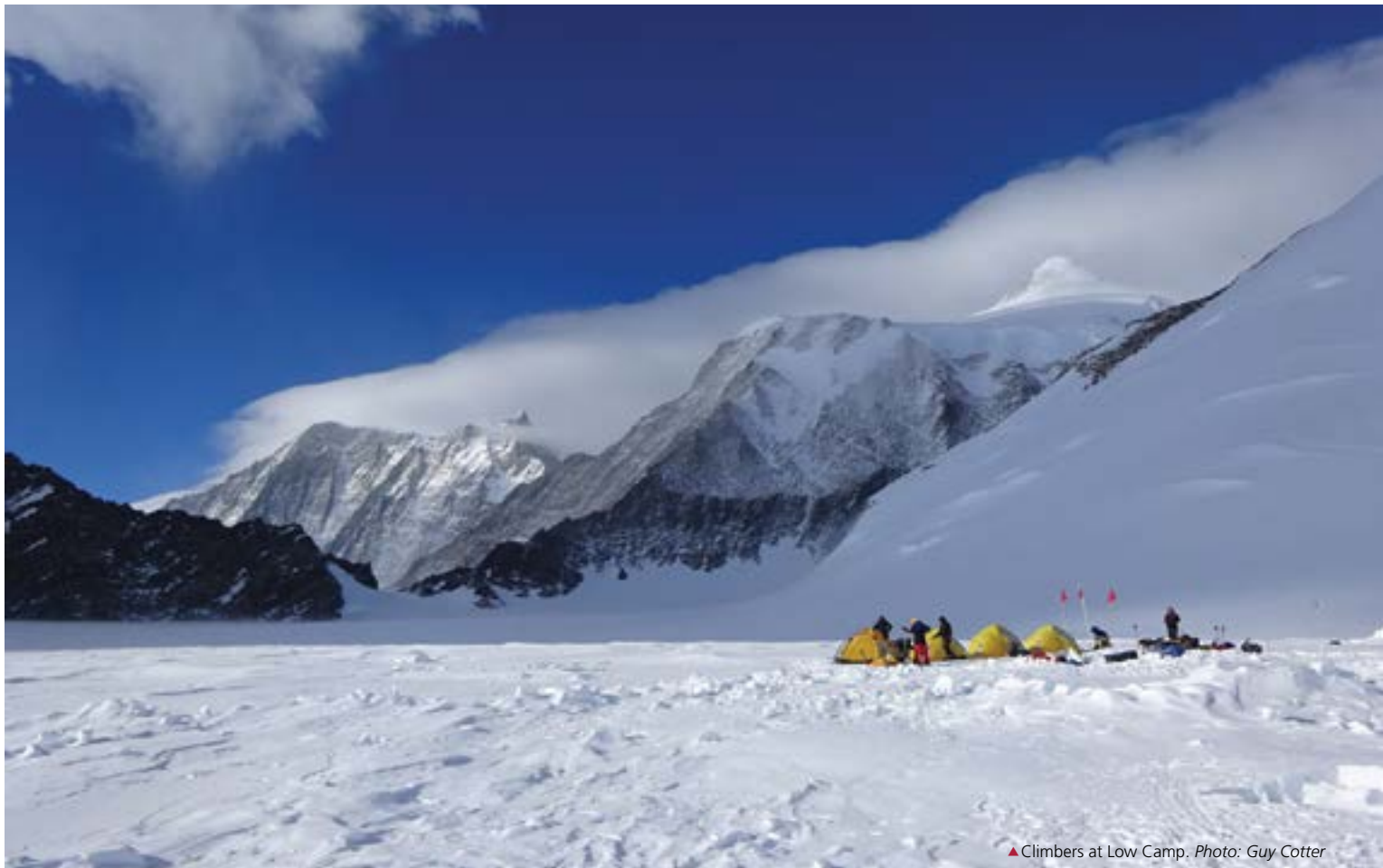
▲ Climbers at Low Camp.