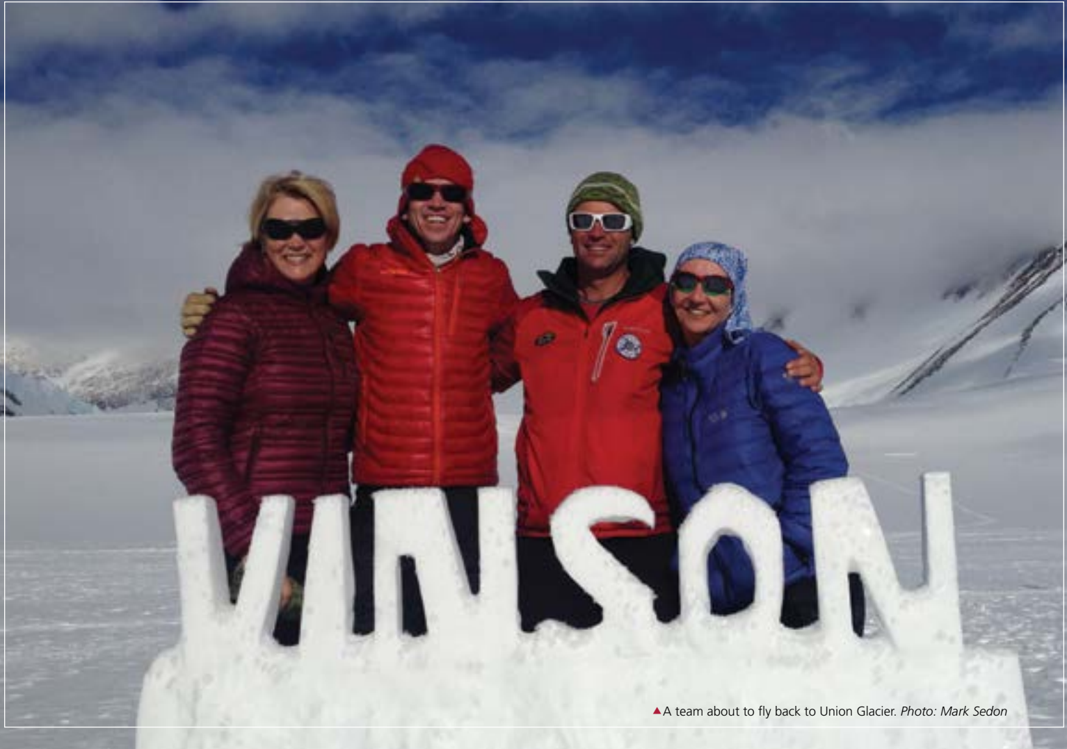
▲ A team about to fly back to Union Glacier.