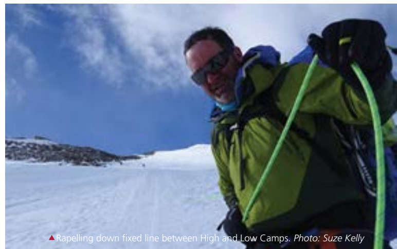
▲ Rapelling down fixed line between High and Low Camps.