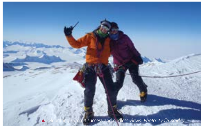
▲ Celebrating summit success and endless views.