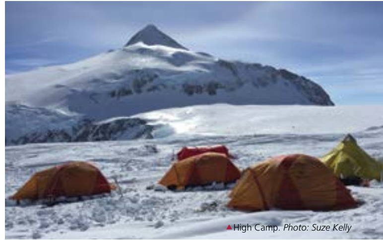
▲ High Camp.