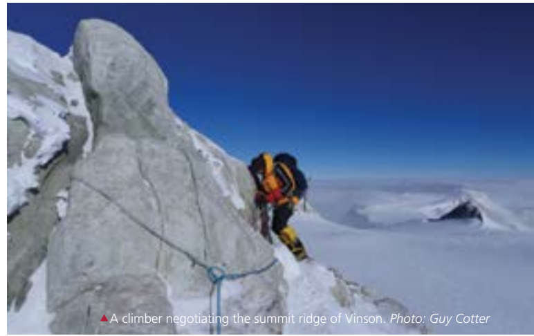
▲ A climber negotiating the summit ridge of Vinson.

Whether your interest is towards the technically challenging or you simply want to see more of Antarctica then contact our office—there is endless scope for adventure!