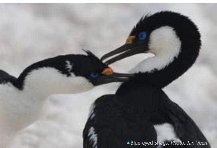
▲ Blue-eyed Shags.