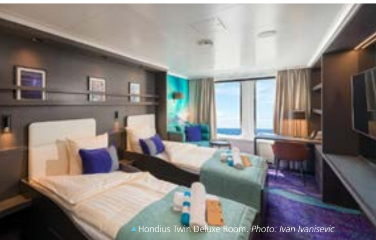
▲ Hondius Twin Deluxe Room.