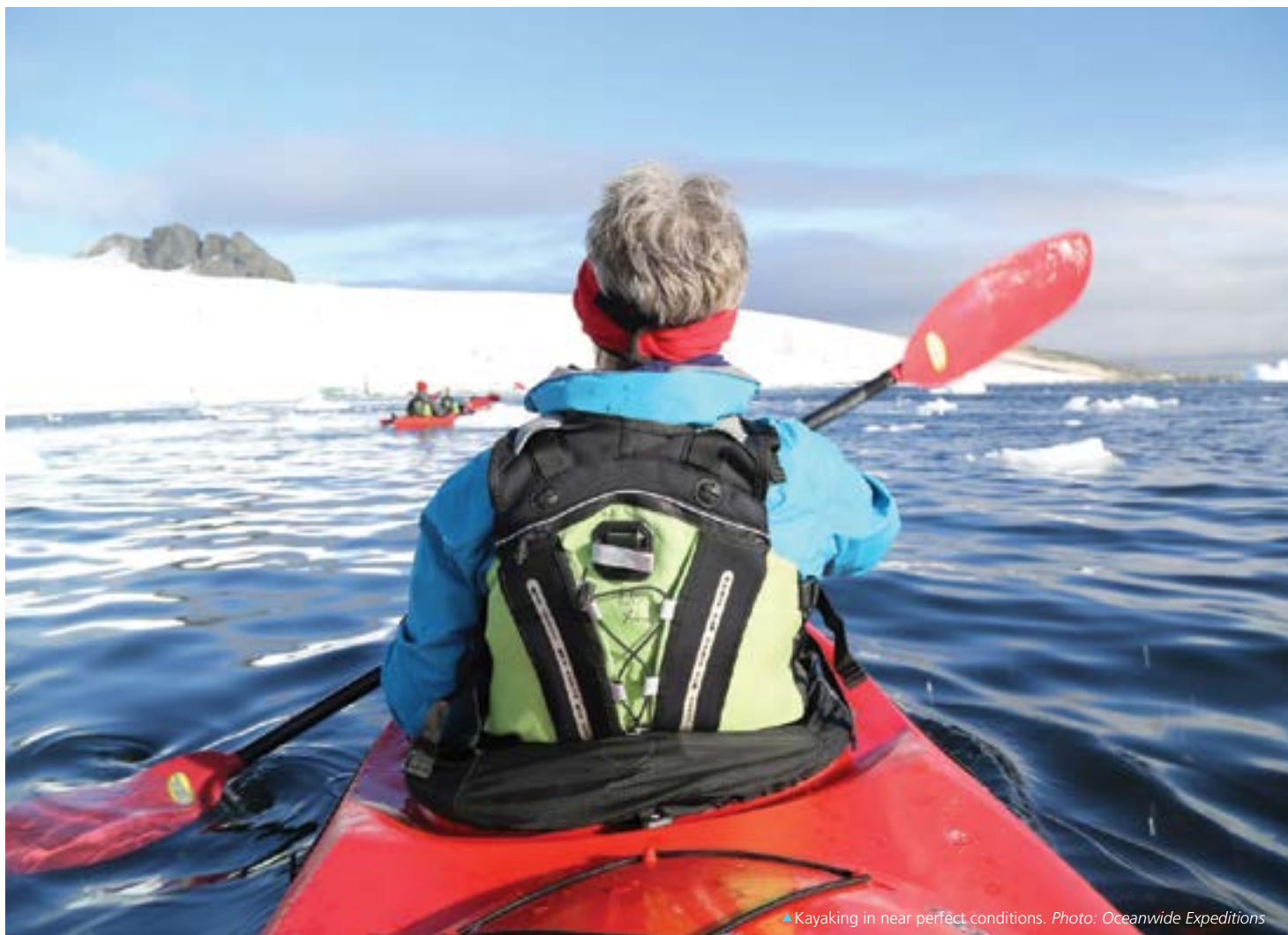
▲ Kayaking in near perfect conditions.