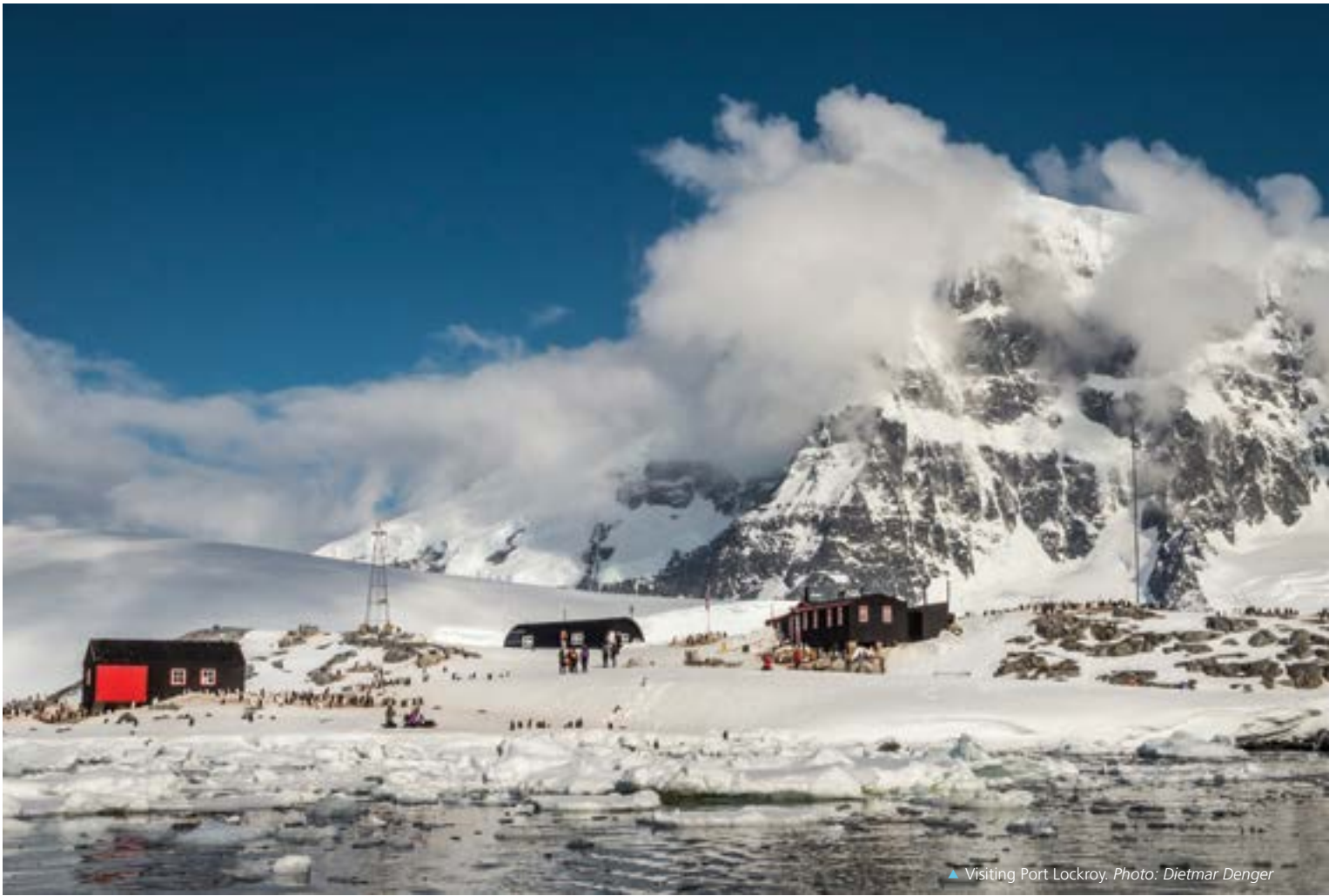
▲ Visiting Port Lockroy.