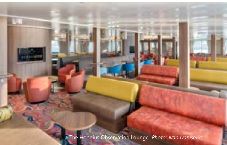
▲ The Hondius Observation Lounge.