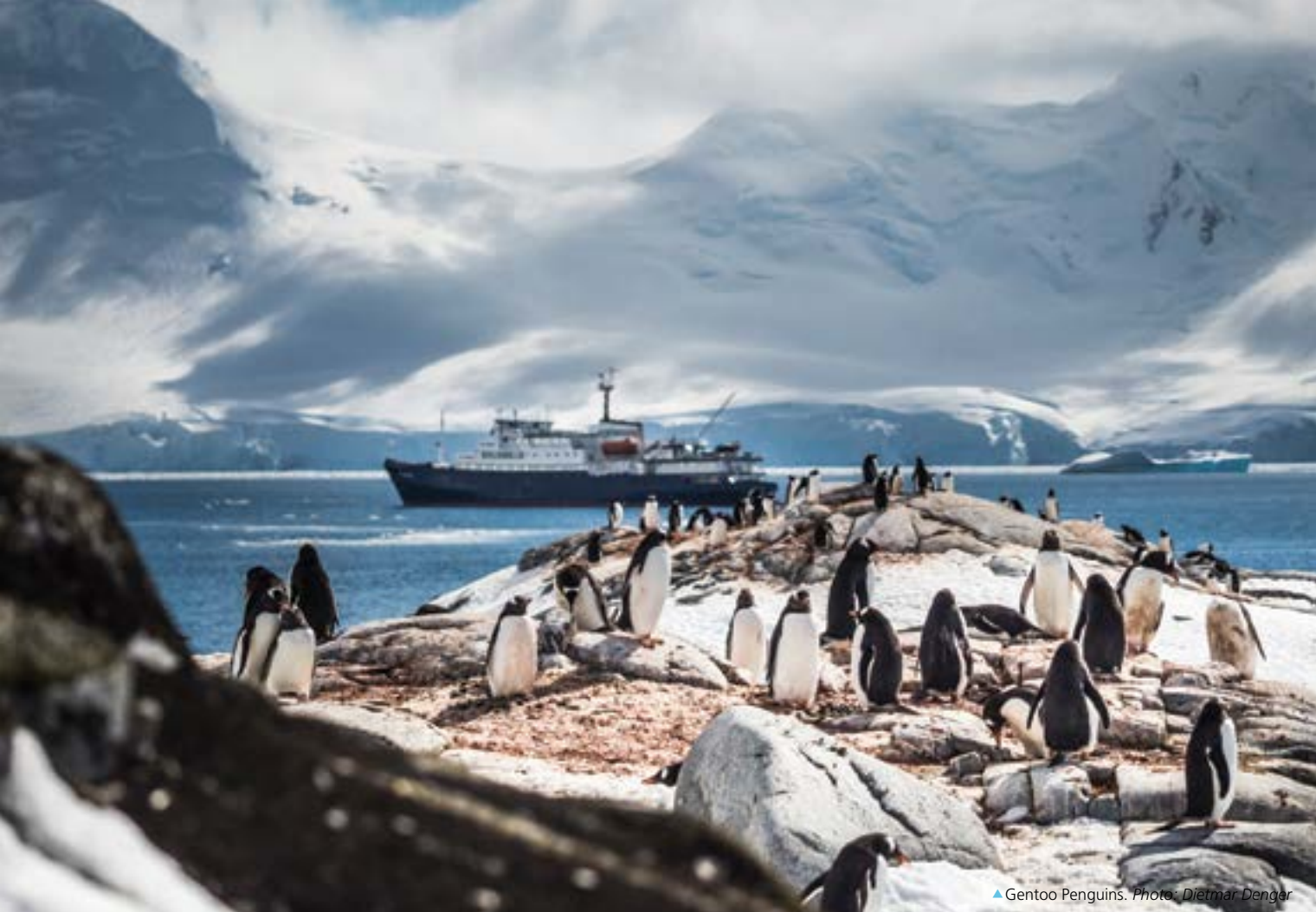
▲ Gentoo Penguins.