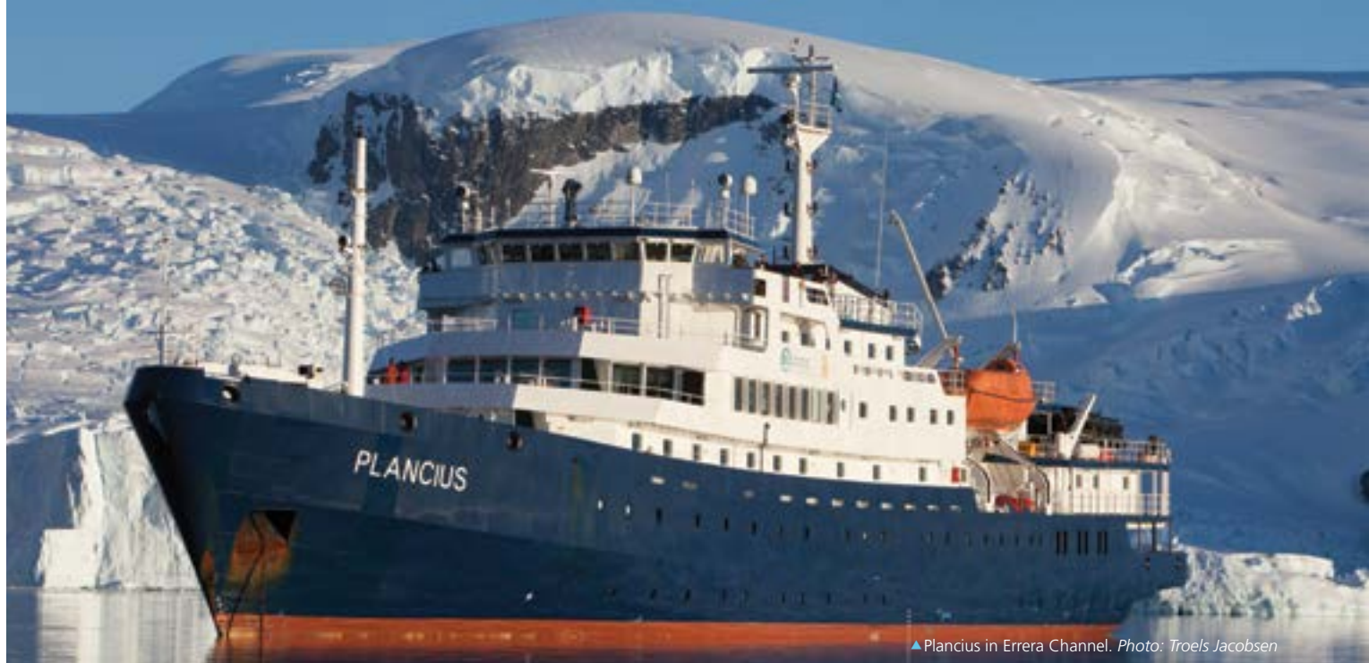
▲ Plancius in Errera Channel.