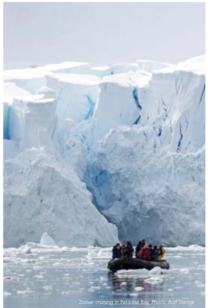
▲ Zodiac cruising in Paradise Bay.