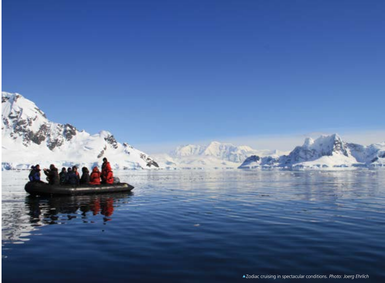
▲ Zodiac cruising in spectacular conditions.