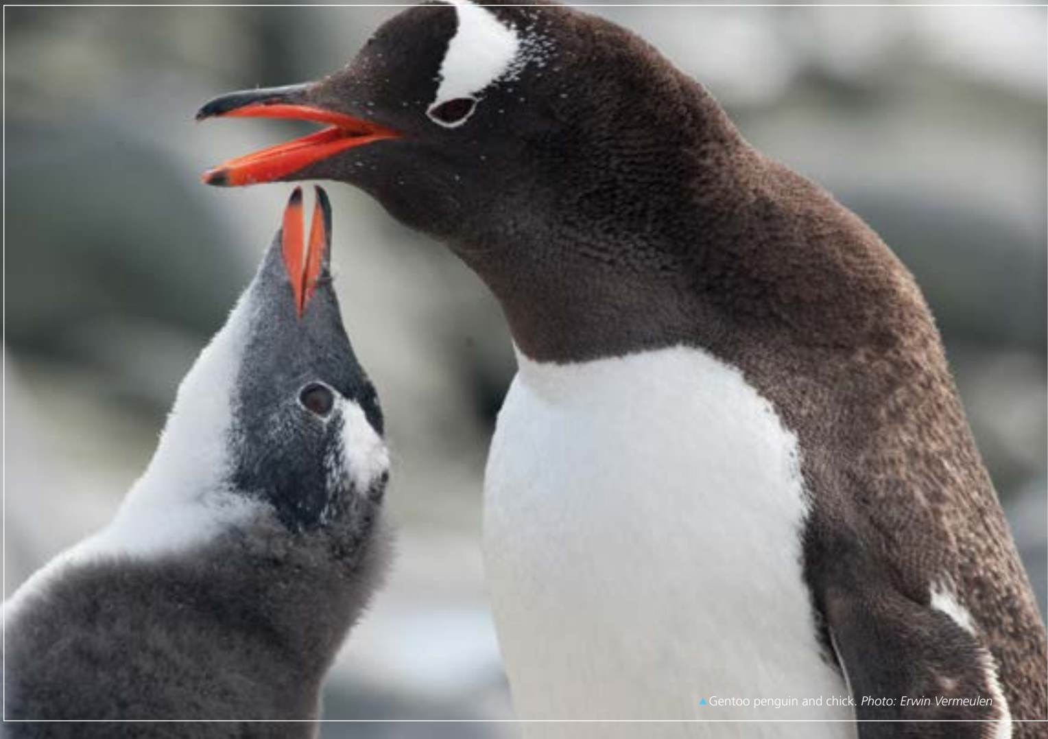
▲ Gentoo penguin and chick.