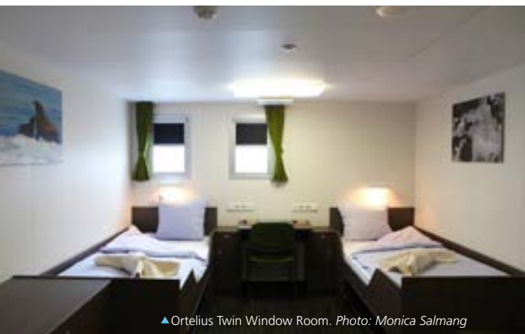
▲ Ortelius Twin Window Room.