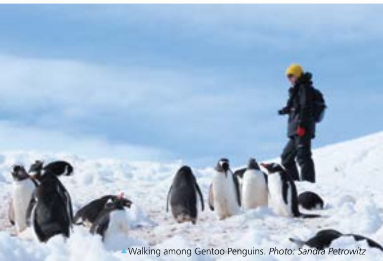
▲ Walking among Gentoo Penguins.

Your return voyage is far from lonely. While crossing the Drake, you're again greeted by the vast array of seabirds remembered from the passage south. But they seem a little more familiar to you now, and you to them.