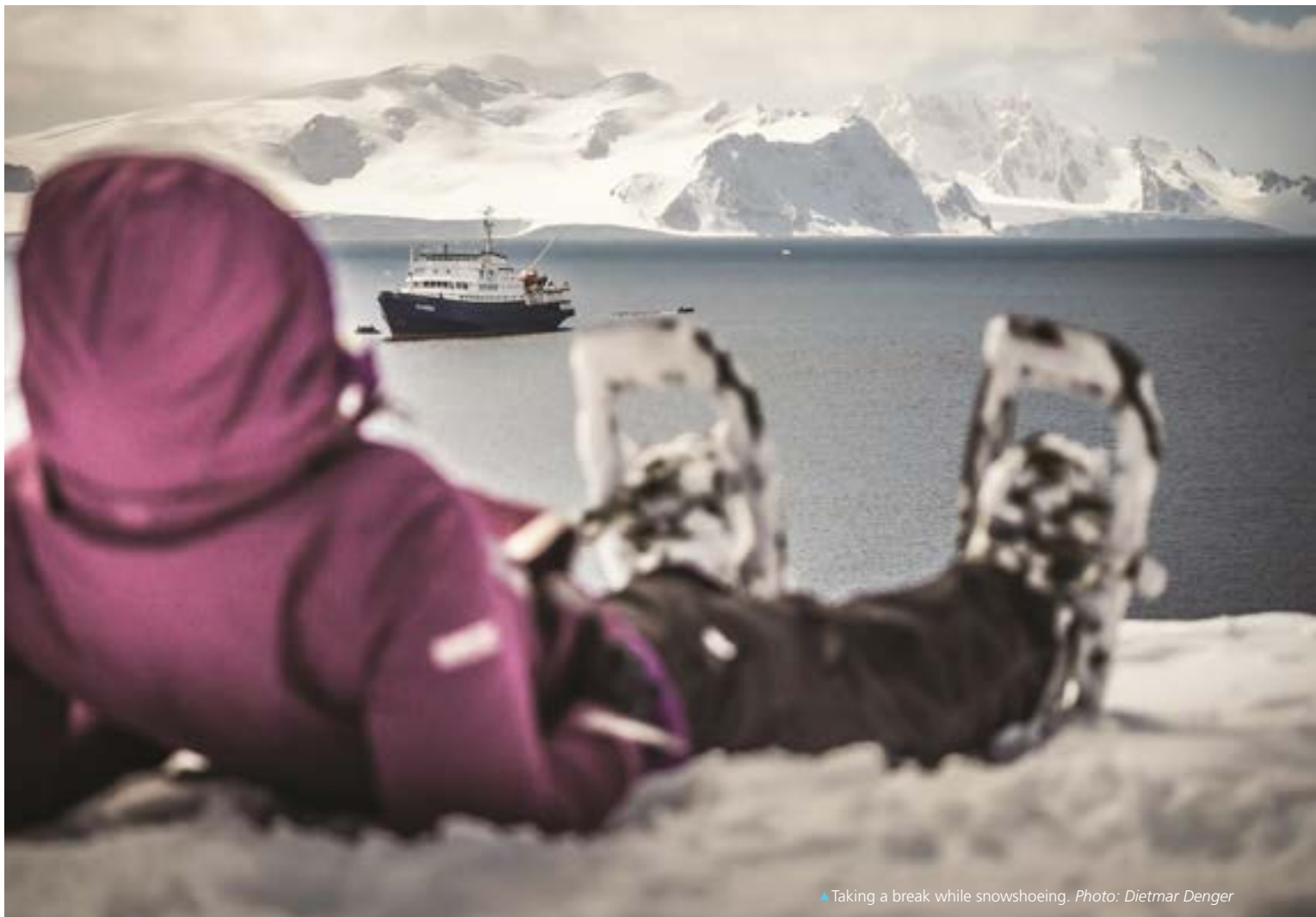
▲ Taking a break while snowshoeing.