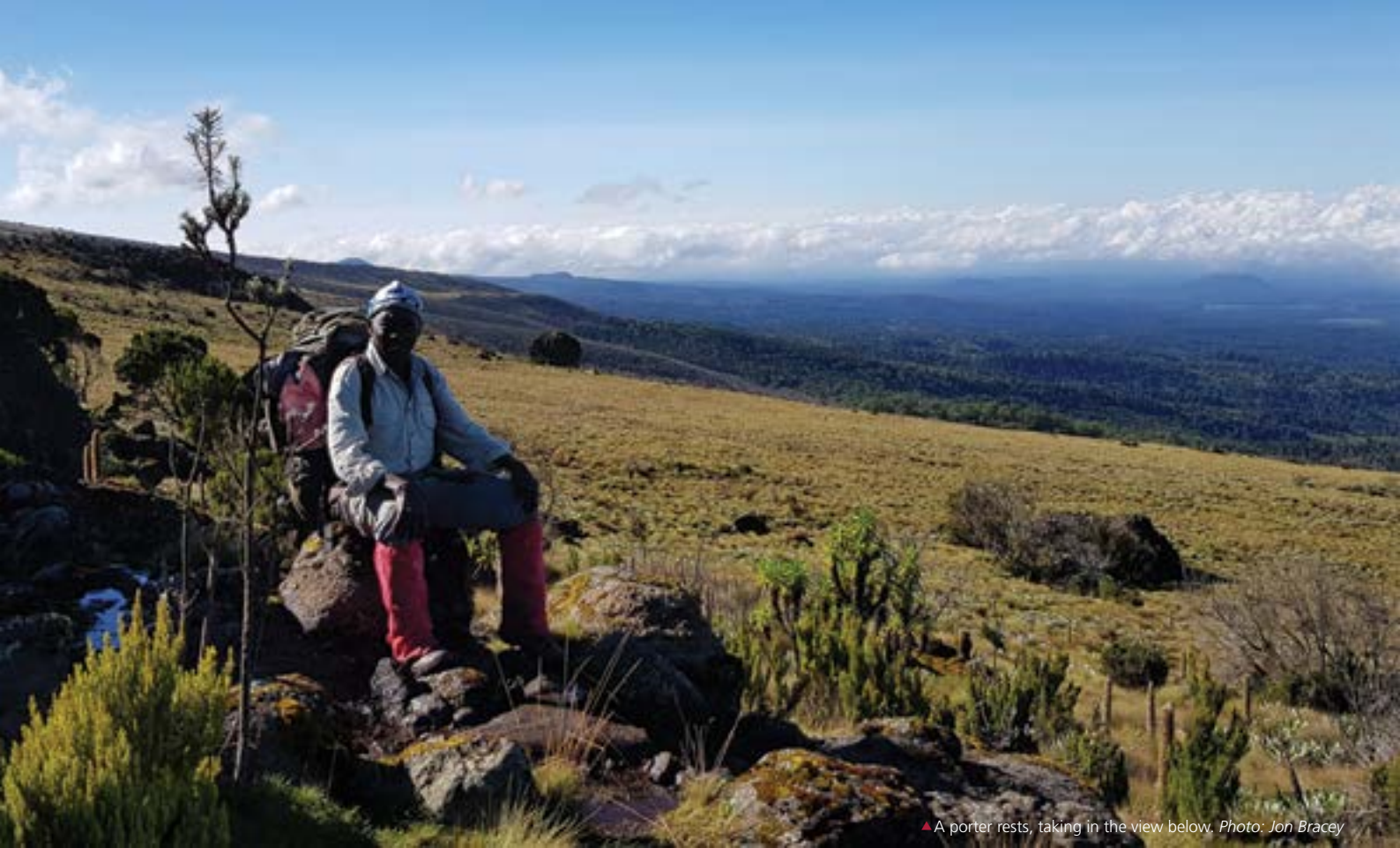
▲ A porter rests, taking in the view below.