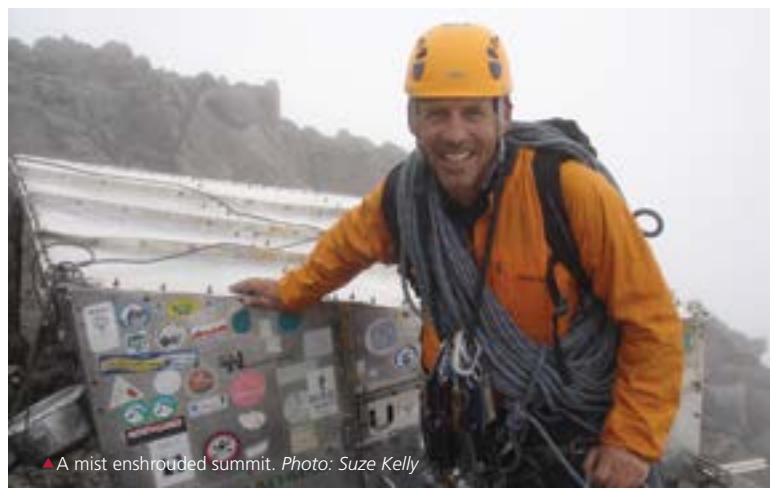
▲ A mist enshrouded summit.

Expedition members will be provided with pre-trip medical advice and a medical questionnaire and will be asked to visit their family physician to receive a full