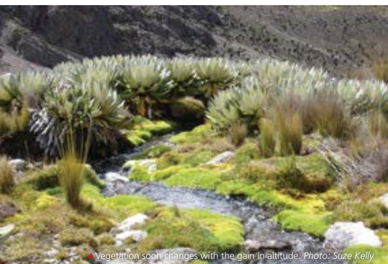
▲ Vegetation soon changes with the gain in altitude.