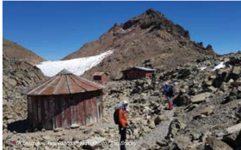
▲ A team reaches Austrian Hut.