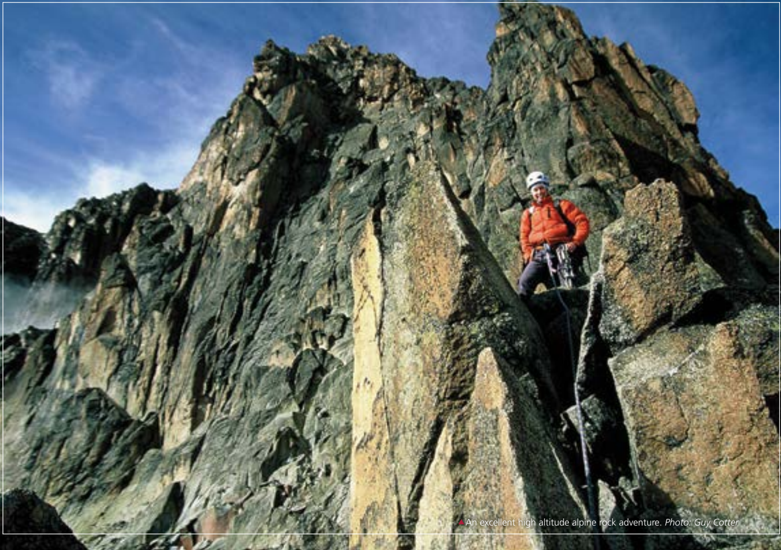
▲ An excellent high altitude alpine rock adventure.