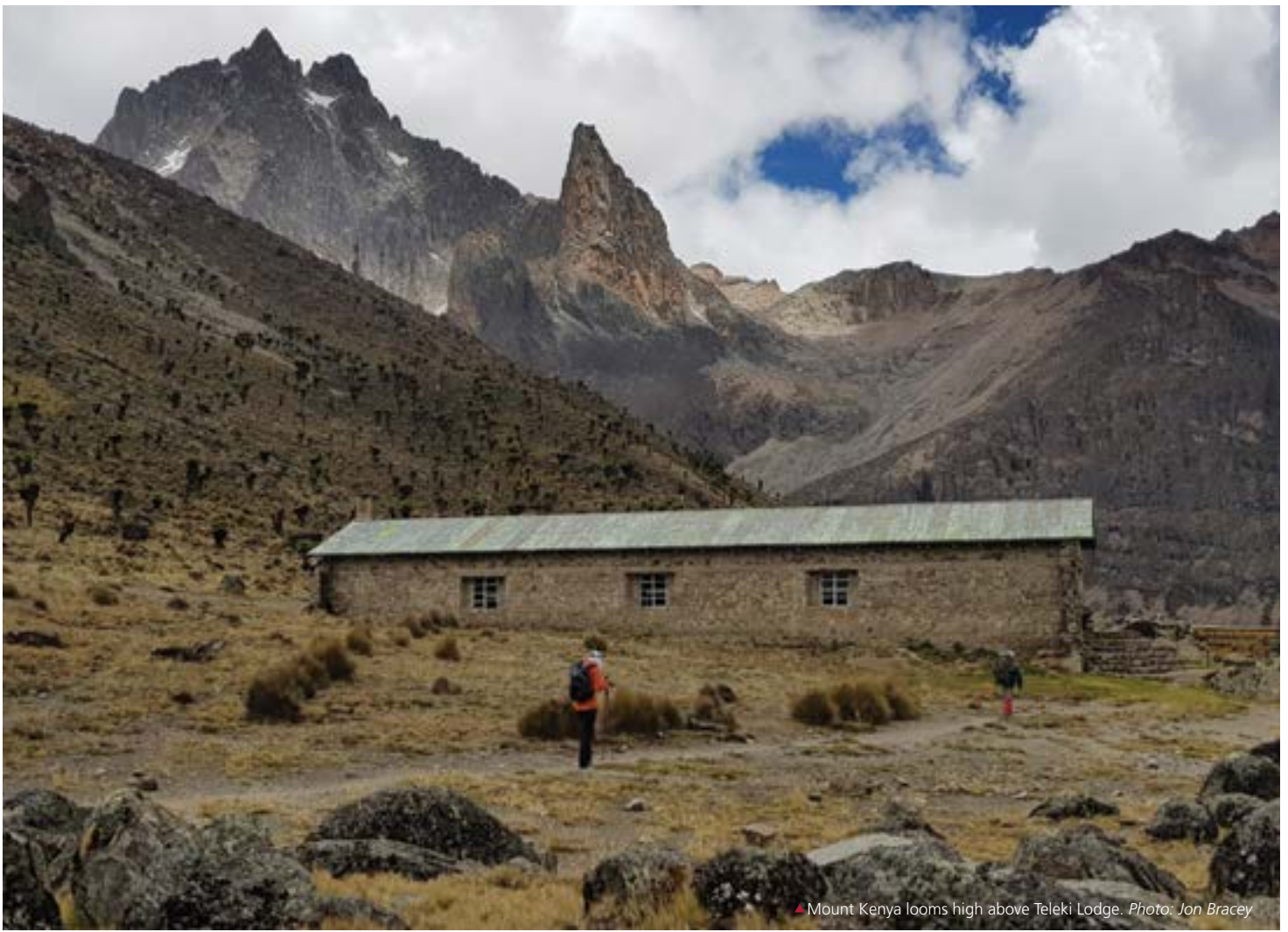
▲ Mount Kenya looms high above Teleki Lodge.

medical examination. This information will be sighted only by the Expedition Leader and our medical adviser and treated with full confidentiality. We also require members to have rescue insurance and we will consult with individual team members as to your insurance needs and solutions for coverage.