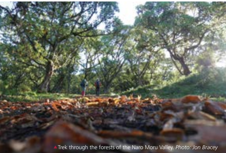
▲ Trek through the forests of the Naro Moru Valley.

We are now on the home stretch, leaving Old Moses Camp and descending through heathland and then forest to the Sirimon Gate park entrance at 2,440m/8,000ft. From here we will connect with our vehicle to transfer back to Nairobi. Depart for home.