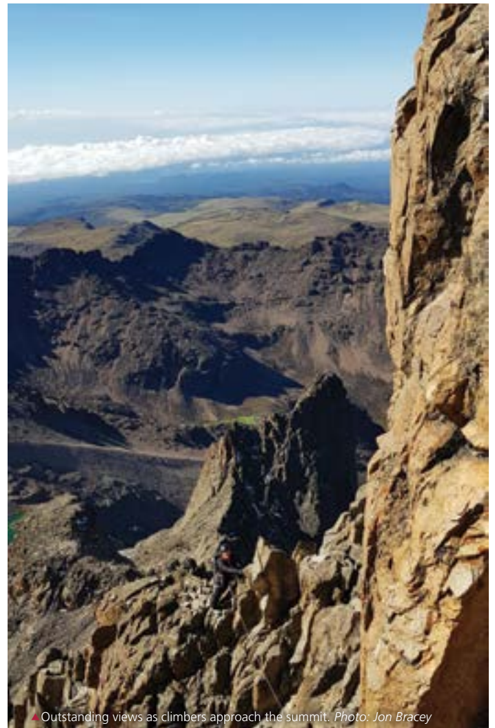
▲ Outstanding views as climbers approach the summit.