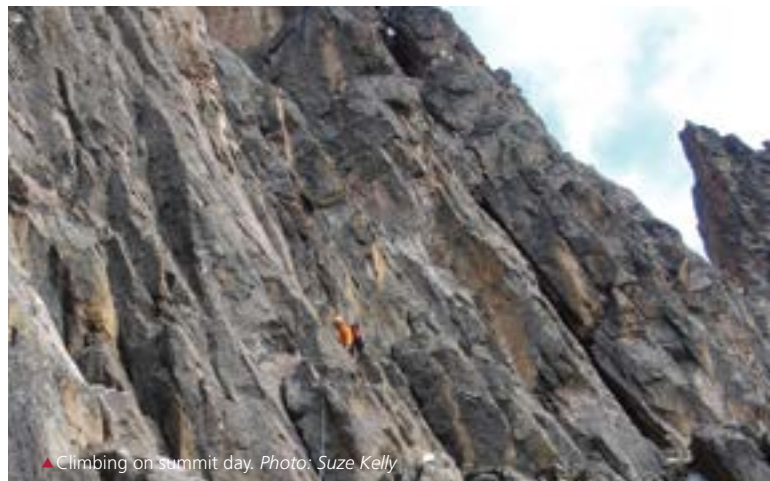
▲ Climbing on summit day.