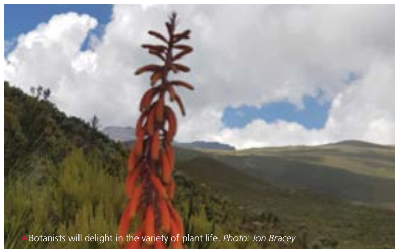
▲ Botanists will delight in the variety of plant life.