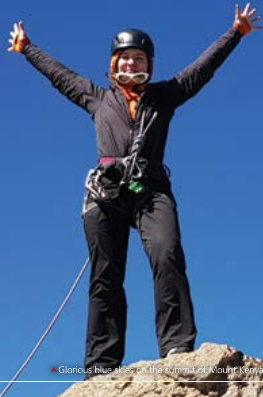
▲ Glorious blue skies on the summit of Mount Kenya.