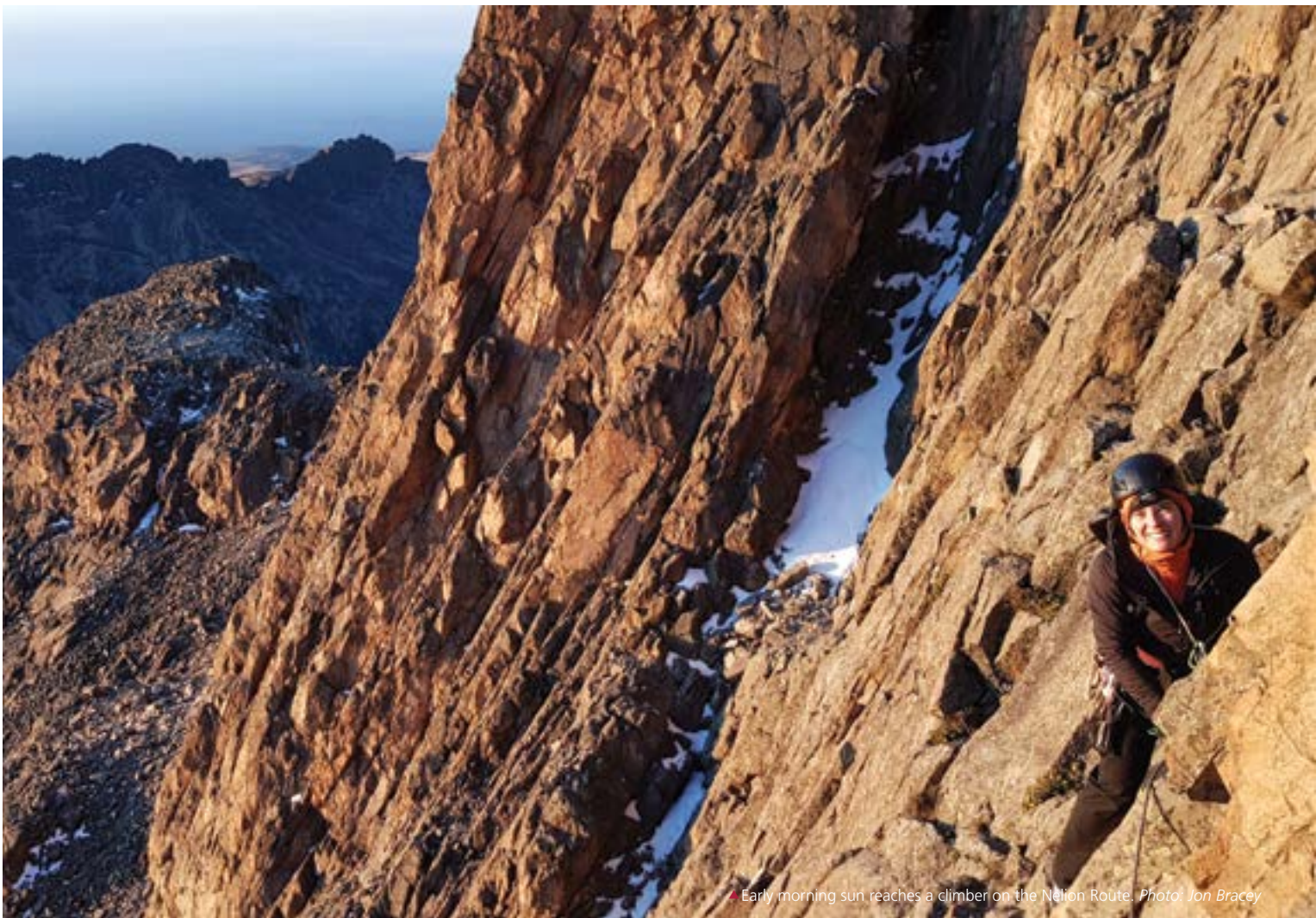
▲ Early morning sun reaches a climber on the Nelson Route.

along a 4WD track through bamboo forest. Leaving the vehicle, we hike the last couple of hours to reach Meru Bandas (2,950m/9,680ft), where we eat dinner and spend our first night on the trail.