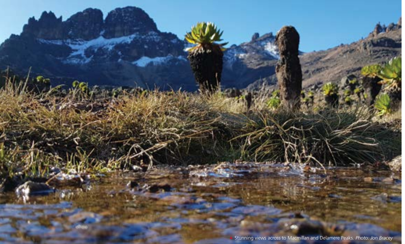
Stunning views across to Macmillan and Delamere Peaks.

The mountain is an important water catchment area and many rivers, such as the Naro Moru, emerge from the melting glaciers.