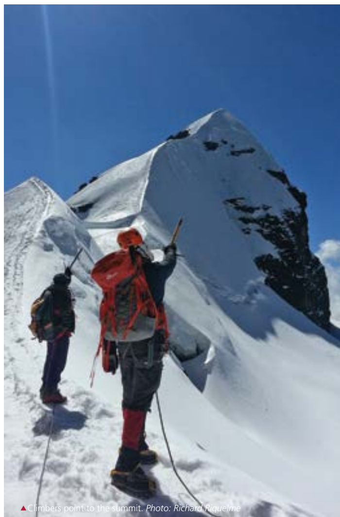
▲ Climbers point to the summit.