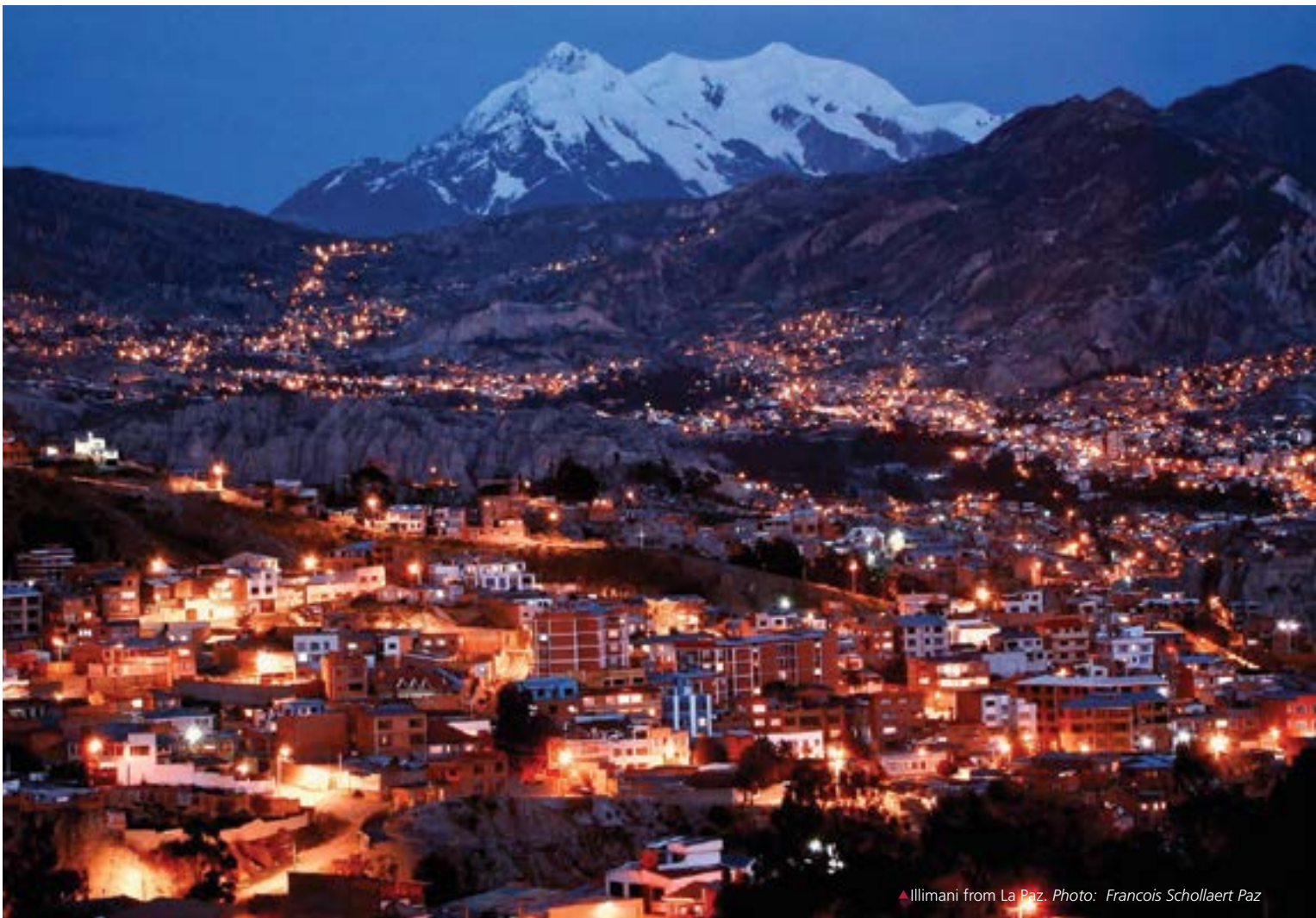
▲ Illimani from La Paz.