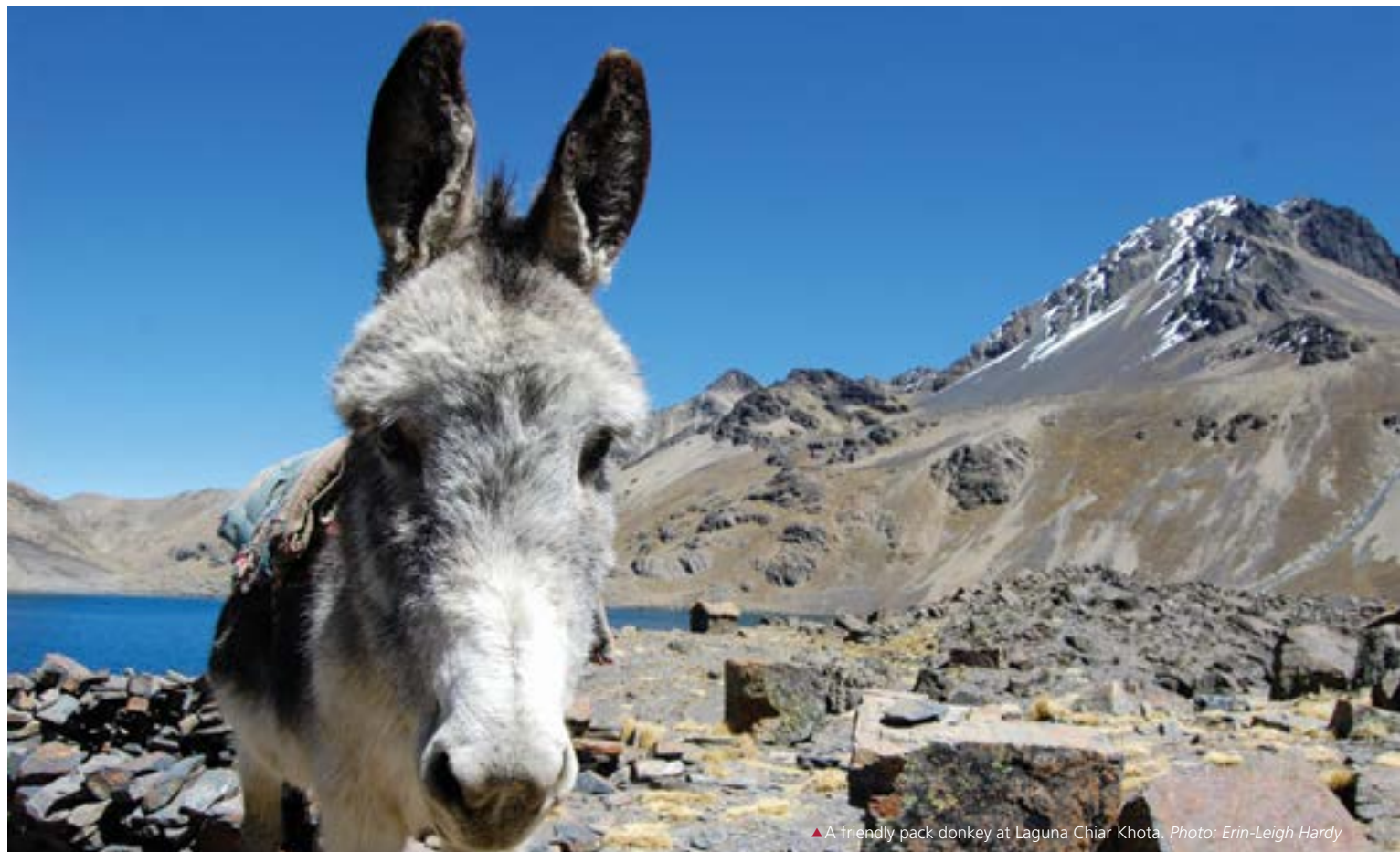
▲ A friendly pack donkey at Laguna Chiar Khota.