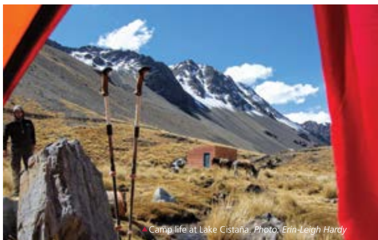
▲Camp life at Lake Cistaña.