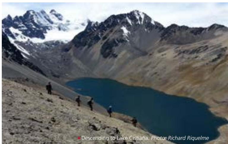
▲Descending to Lake Cistaña.

Expedition members will be sent a list detailing all necessary clothing and equipment to be procured.