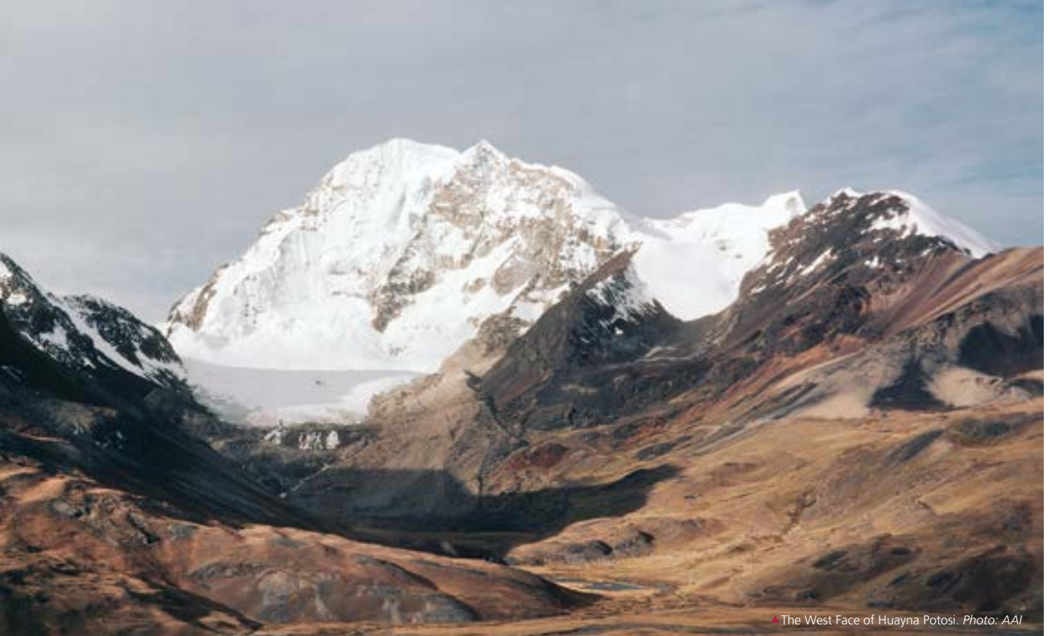
▲ The West Face of Huayna Potosi.

The next day we visit the Tiwanaku Archaeological Site, a ruined ancient city near Lake Titicaca. Dominating the ruins of this UNESCO World Heritage site, once the seat of the pre-Columbian Tiwanaku culture, are the Akapana Pyramid and a semi-subterranean temple with carved images of human heads.