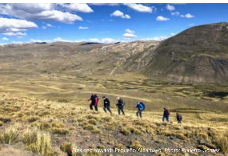
▲ Trekking towards Pequeño Alpamayo.