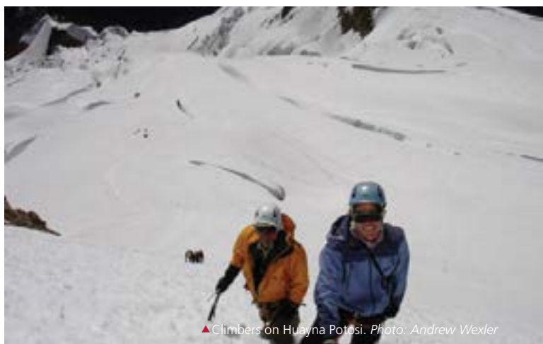
▲Climbers on Huayna Potosí.