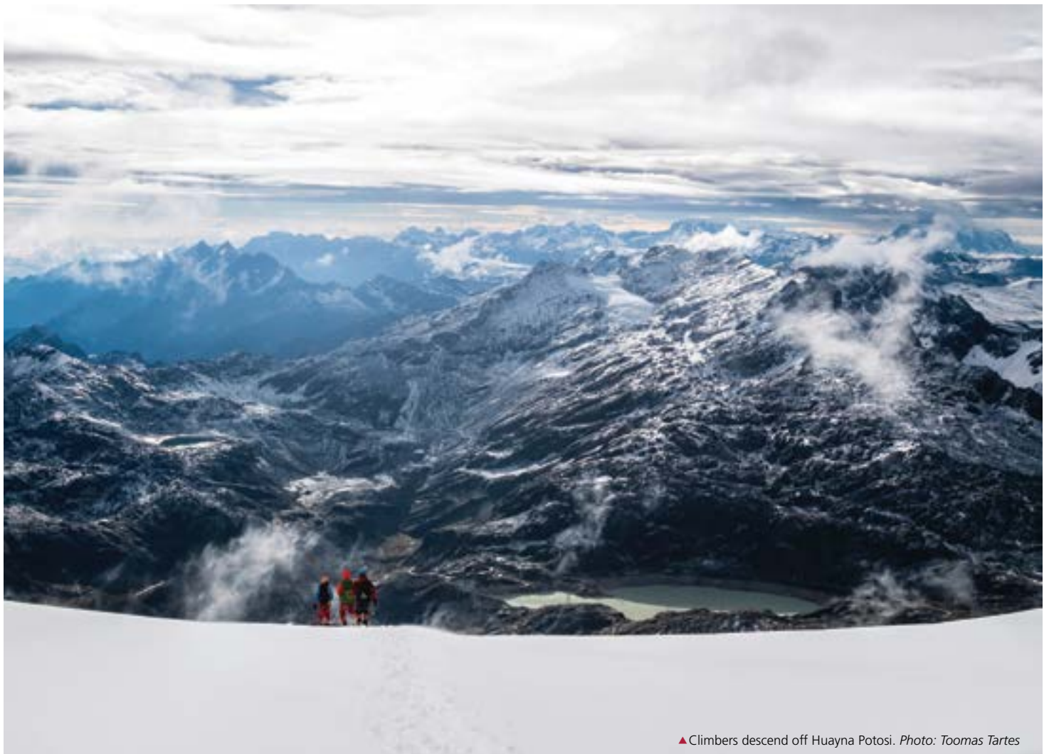
▲ Climbers descend off Huayna Potosi.

We will correspond with you prior to the trip to answer your queries and ensure you have met all the equipment requirements. Having the correct equipment is key to your performance on summit day and to achieving success.