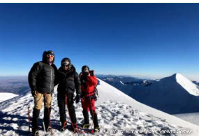
▲ The summit of Illimani.