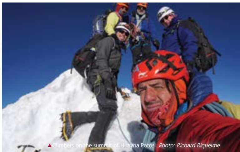
▲Climbers on the summit of Huayna Potosí.