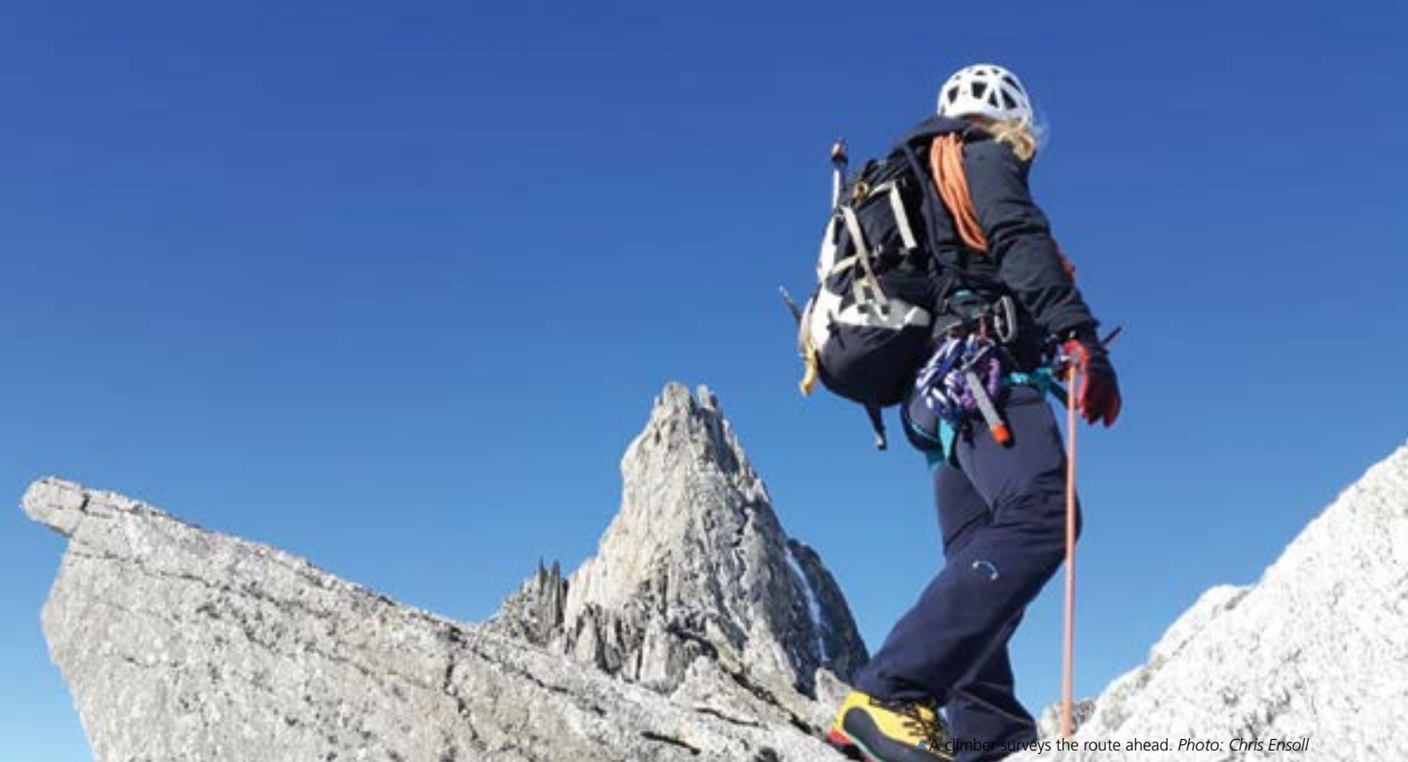
A climber surveys the route ahead.