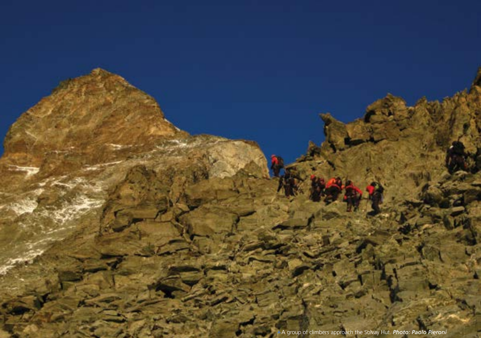
◆ A group of climbers approach the Solvay Hut.

Accommodation in the mountains is in mountain huts in shared bunk rooms or dormitory rooms. Blankets are provided and no sleeping bag will be required, although you will require a 'sleeping sheet' for personal hygiene under the provided blankets. There are no single supplement options or private rooms available in the mountain huts but we can arrange this for you in Zermatt. We can also arrange an upgrade to four or five-star hotel accommodation—ask about the hotel options if interested.