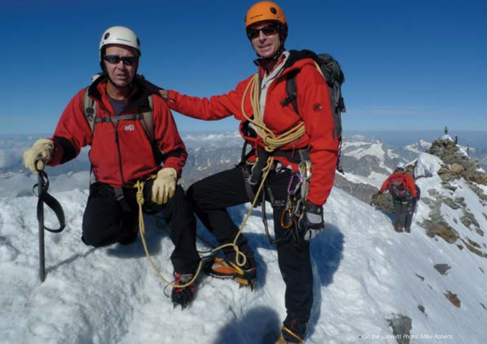
▲ On the summit!