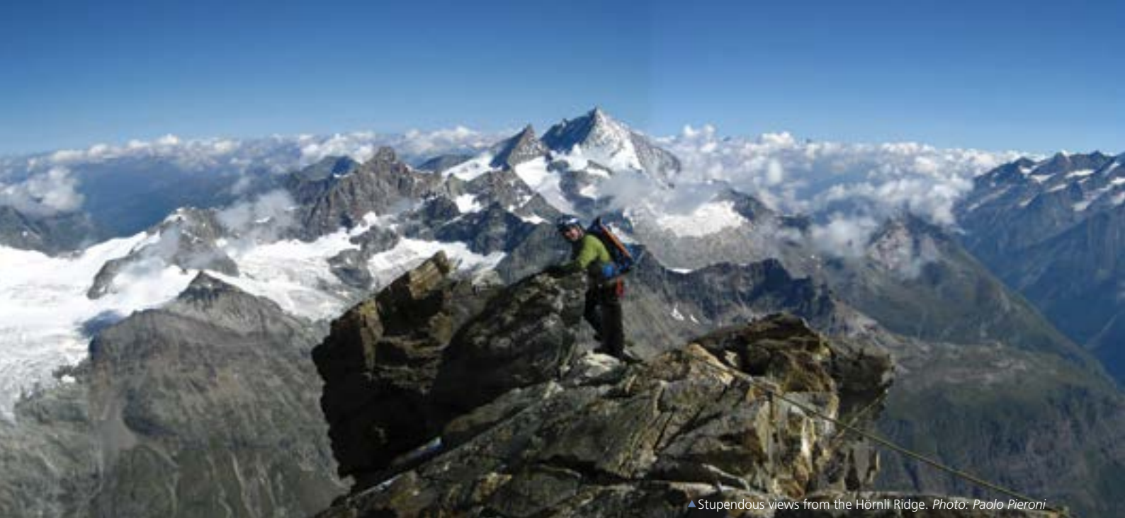
▲ Stupendous views from the Hörnli Ridge.

The ascent is based entirely on a 1:1 guiding ratio. While some operators will clump you together with large groups during the early acclimatisation phase, we feel there is much to be gained on warm-up routes that get you prepared for the upcoming rigours and technical challenges that you will face.