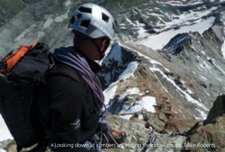
▲ Looking down at climbers ascending the ridge.