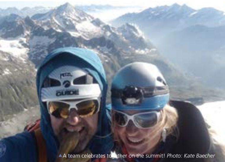
▲ A team celebrates together on the summit!