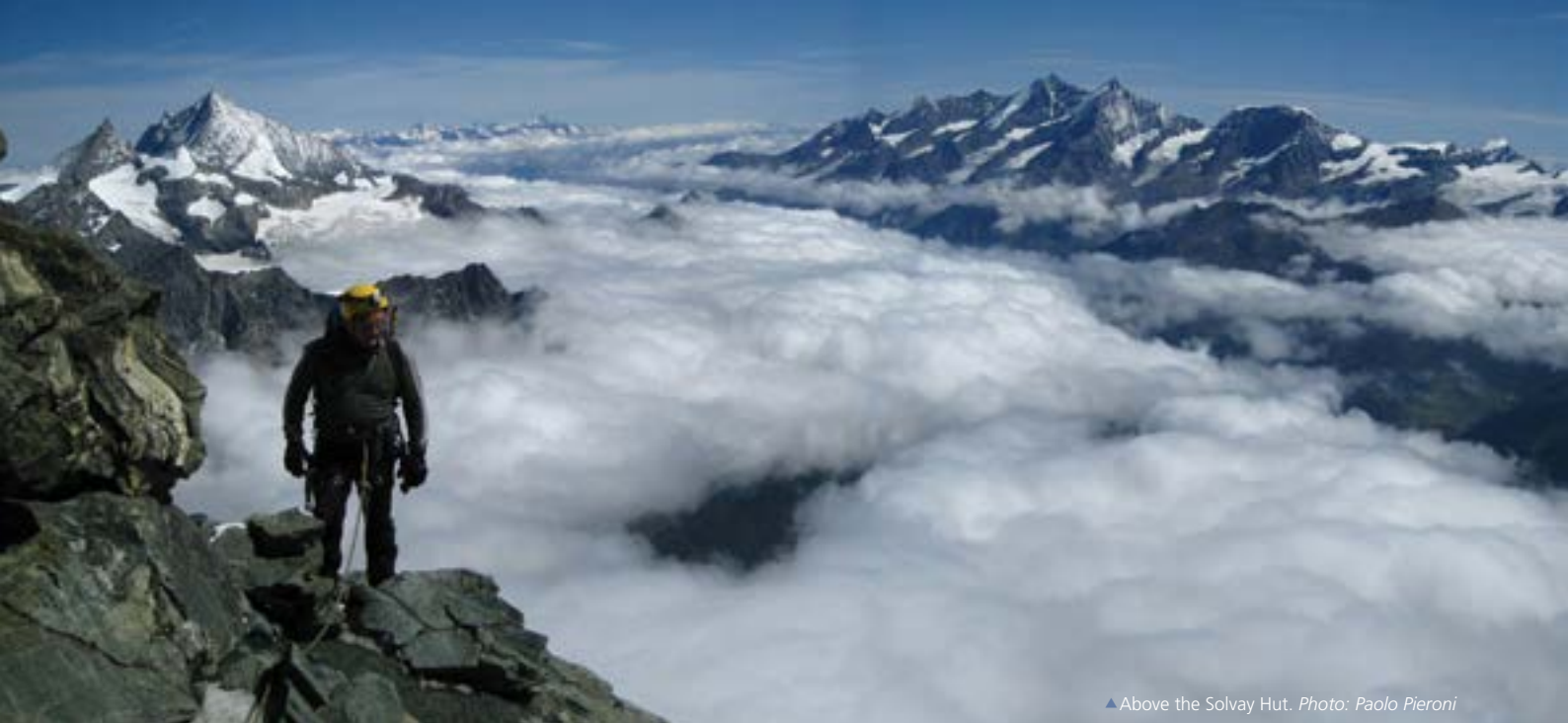
▲ Above the Solvay Hut.

Your own mobile phone should work in the region though you may want to check with your service provider first. Local mobile phones can be rented at international airports.