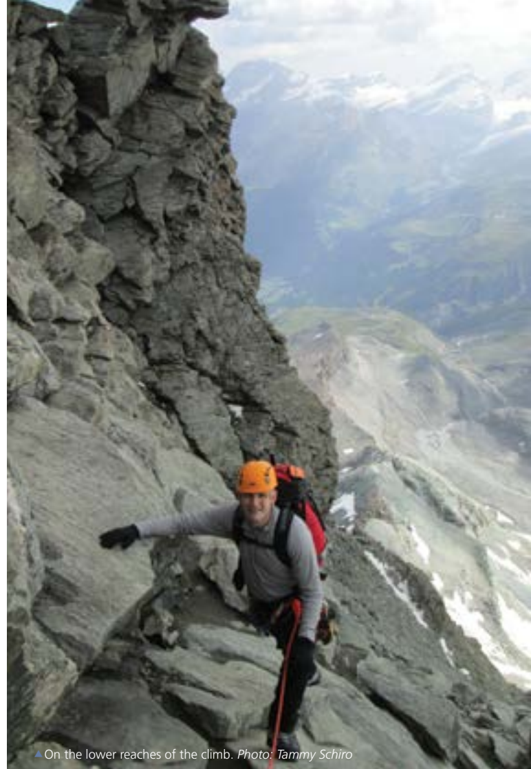
▲ On the lower reaches of the climb.