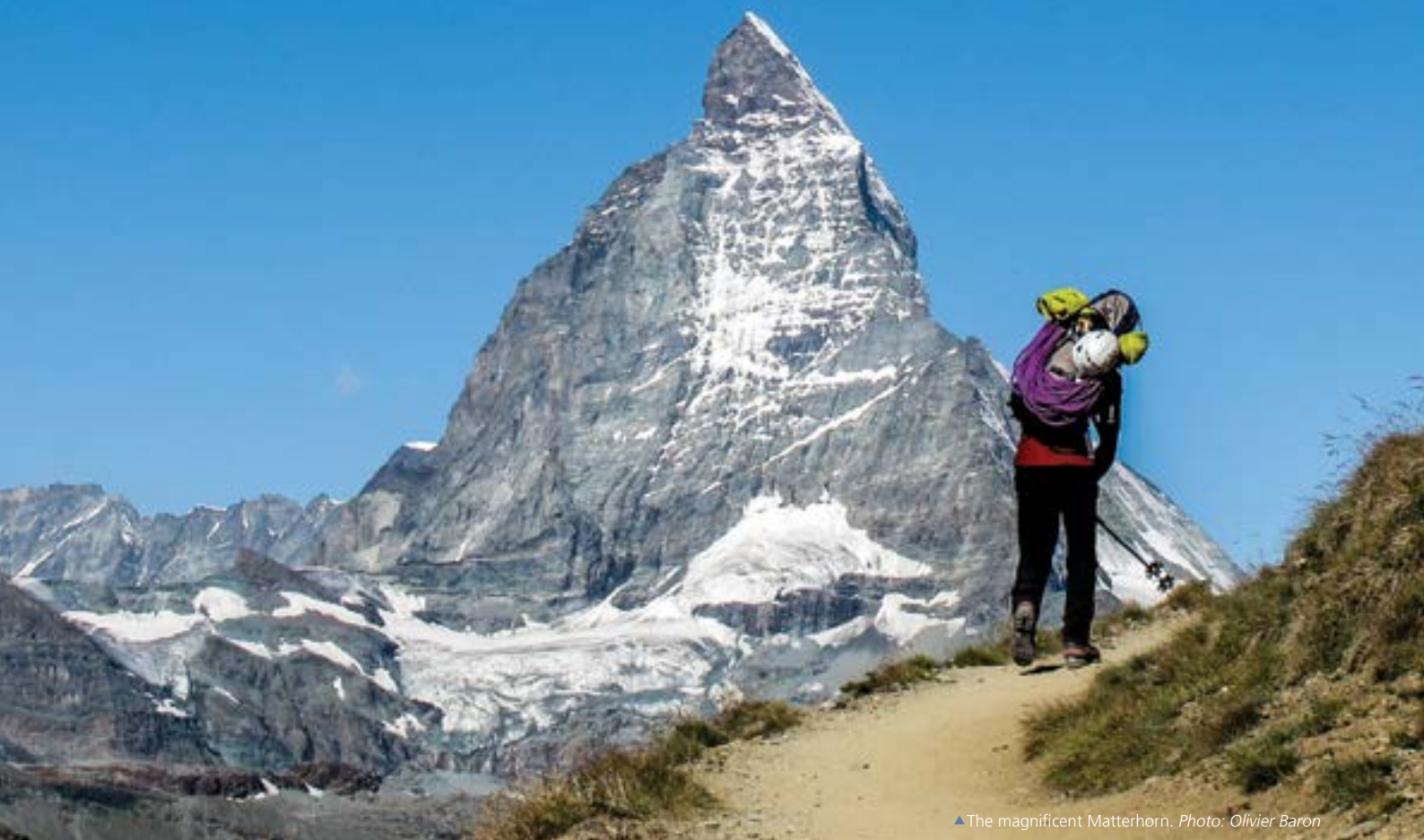
▲The magnificent Matterhorn.