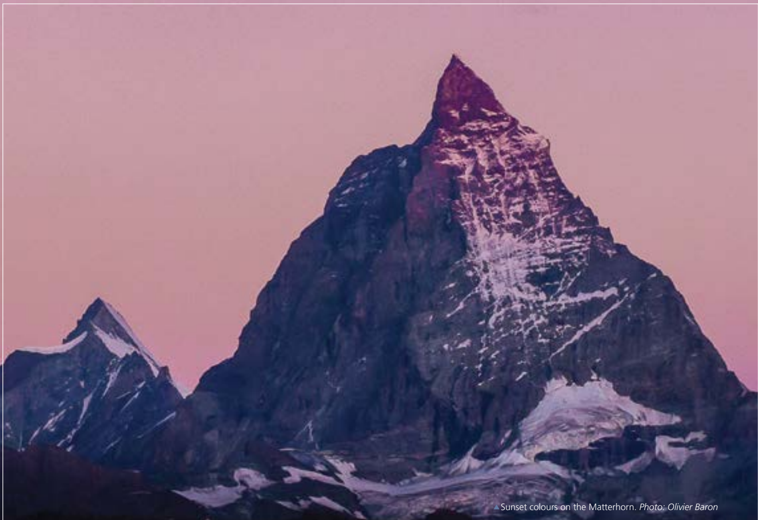
▲ Sunset colours on the Matterhorn.