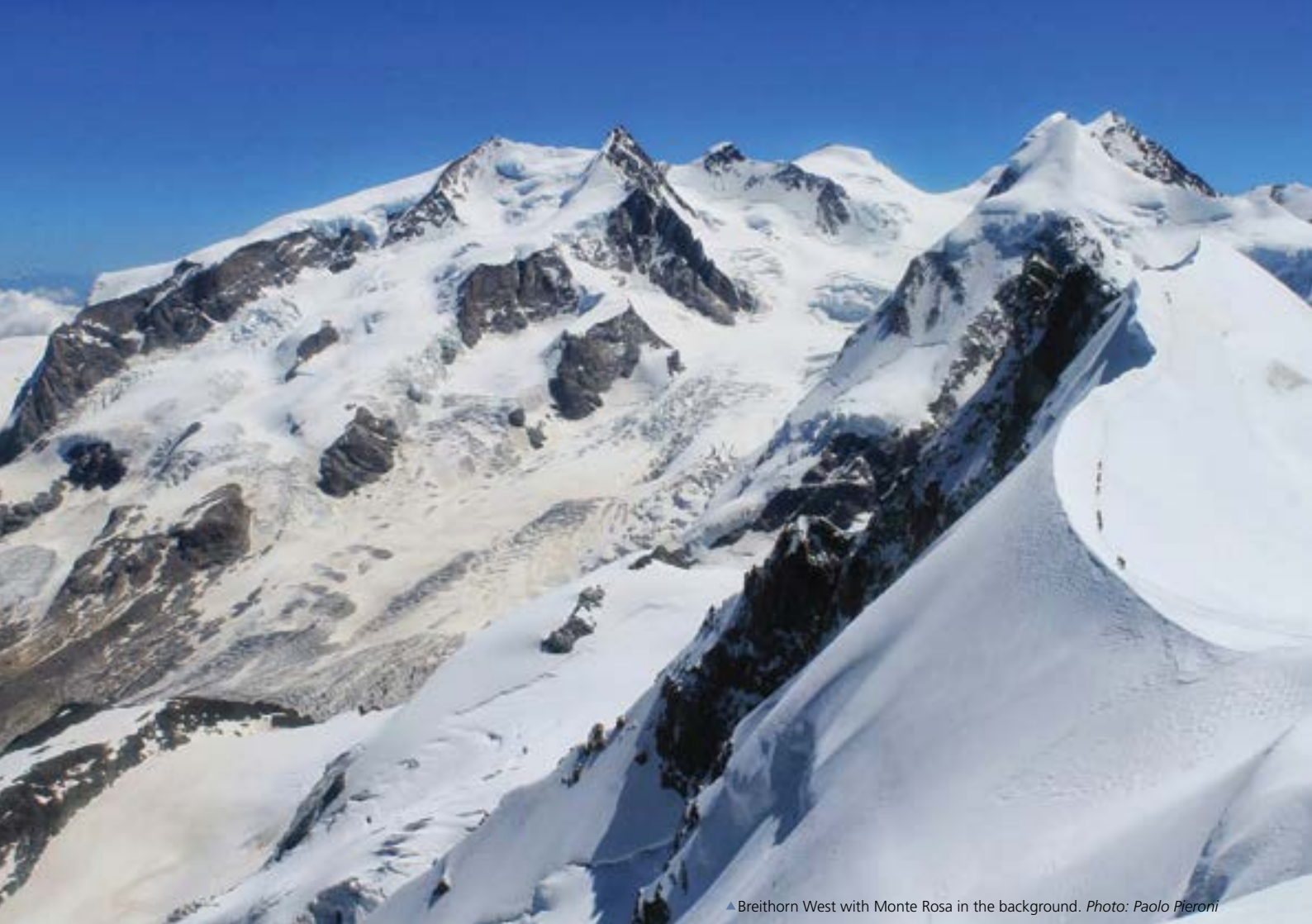
▲ Breithorn West with Monte Rosa in the background.

having the essential clothing and equipment to keep you warm and comfortable while climbing.