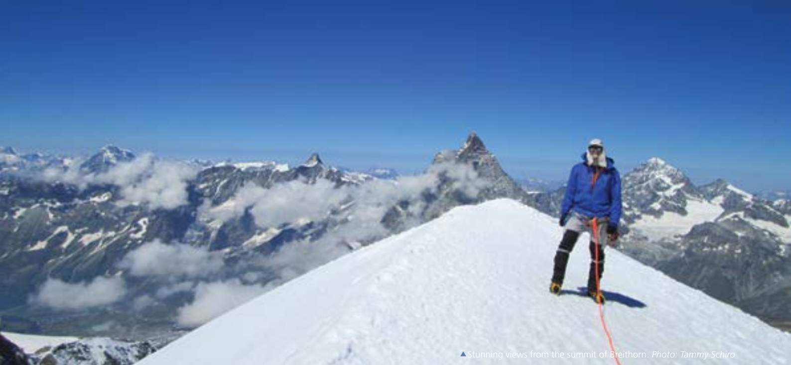
▲Stunning views from the summit of Breithorn.

NOTE: All prices are subject to change without notice.