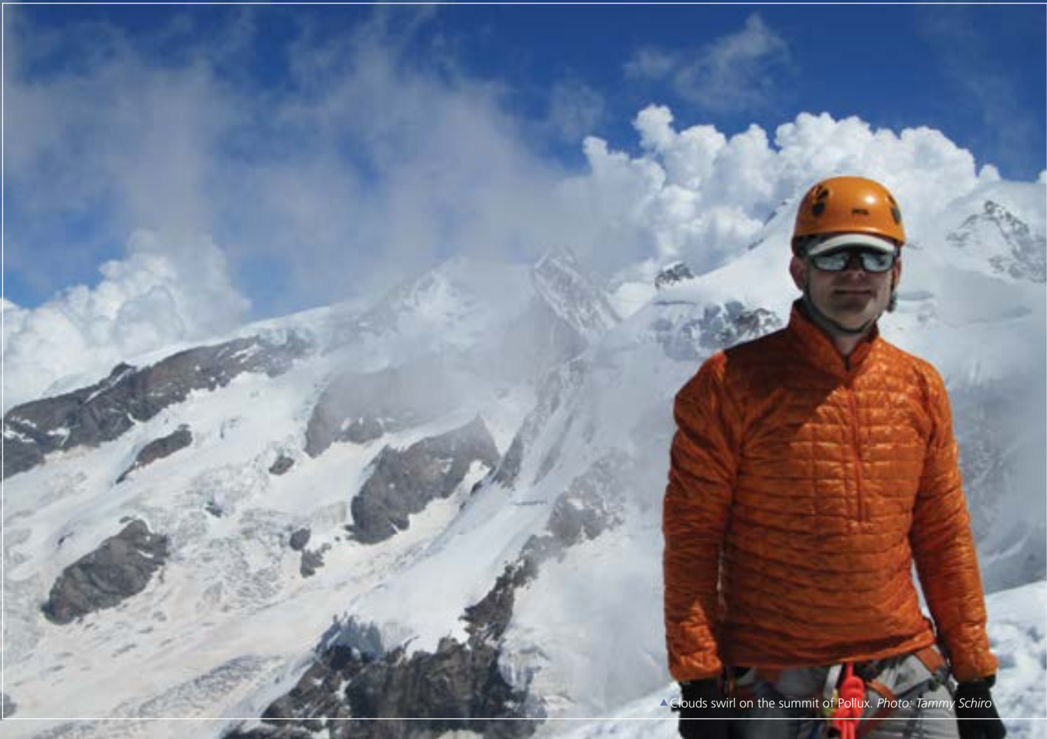
▲ Clouds swirl on the summit of Pollux.