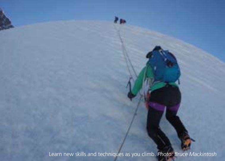
Learn new skills and techniques as you climb.