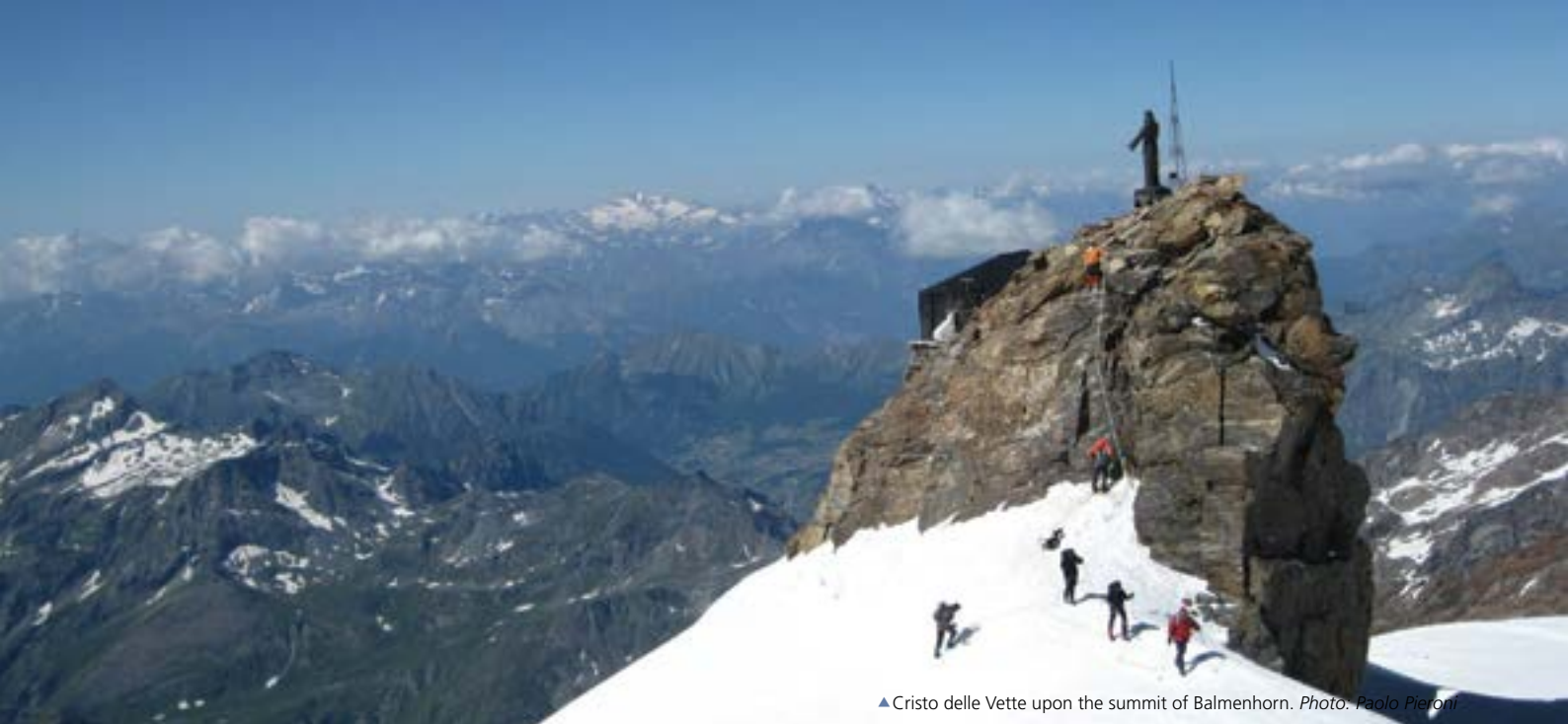
▲Cristo delle Vette upon the summit of Balmenhorn.