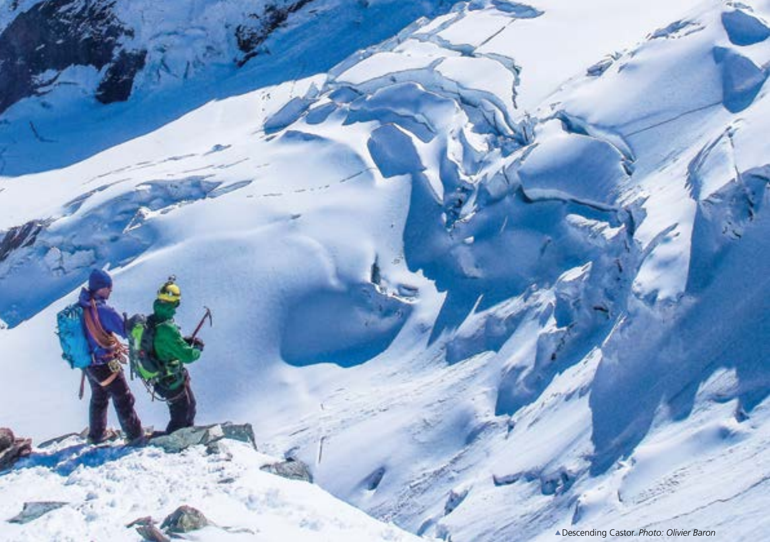
▲ Descending Castor.