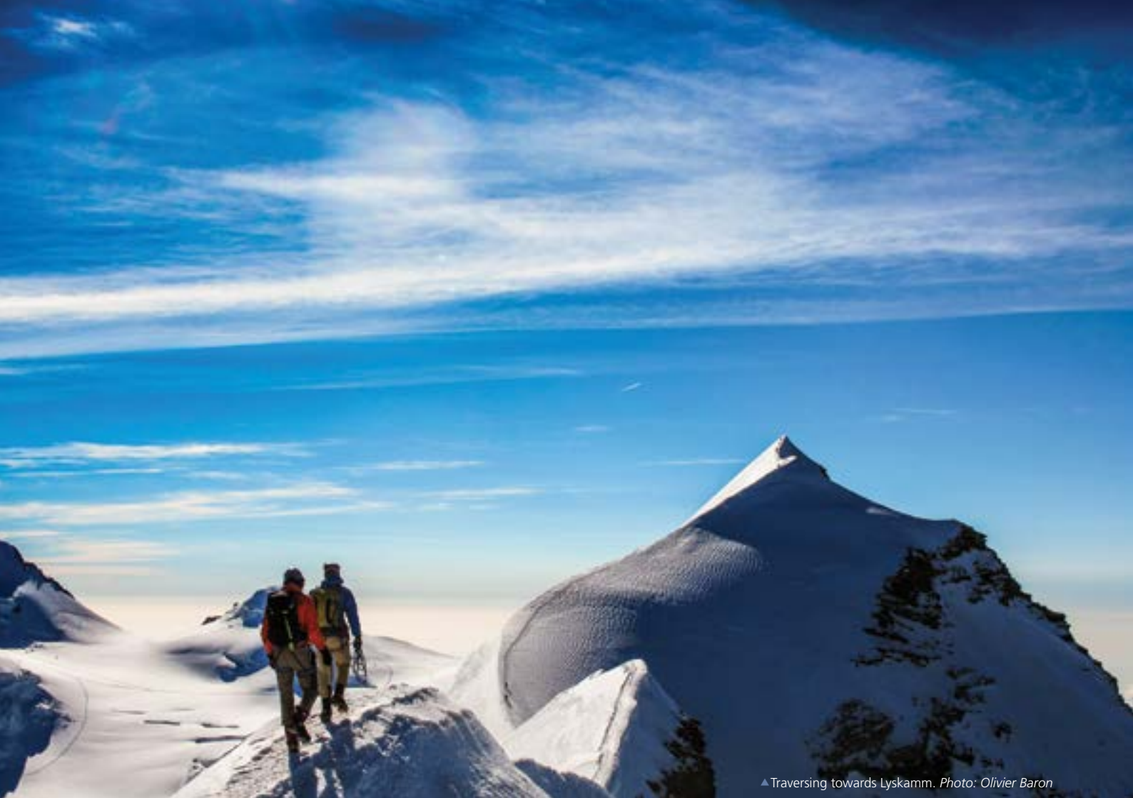
▲ Traversing towards Lyskamm.

pitch climbs to grade 5c. From here we have a panoramic view of all the mountains that we will be climbing over the next few days, serving as a great introduction to the week.