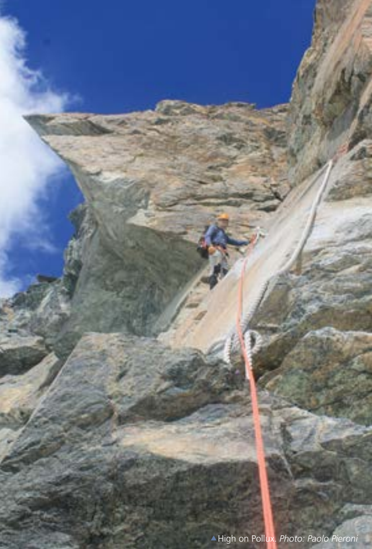
▲ High on Pollux.