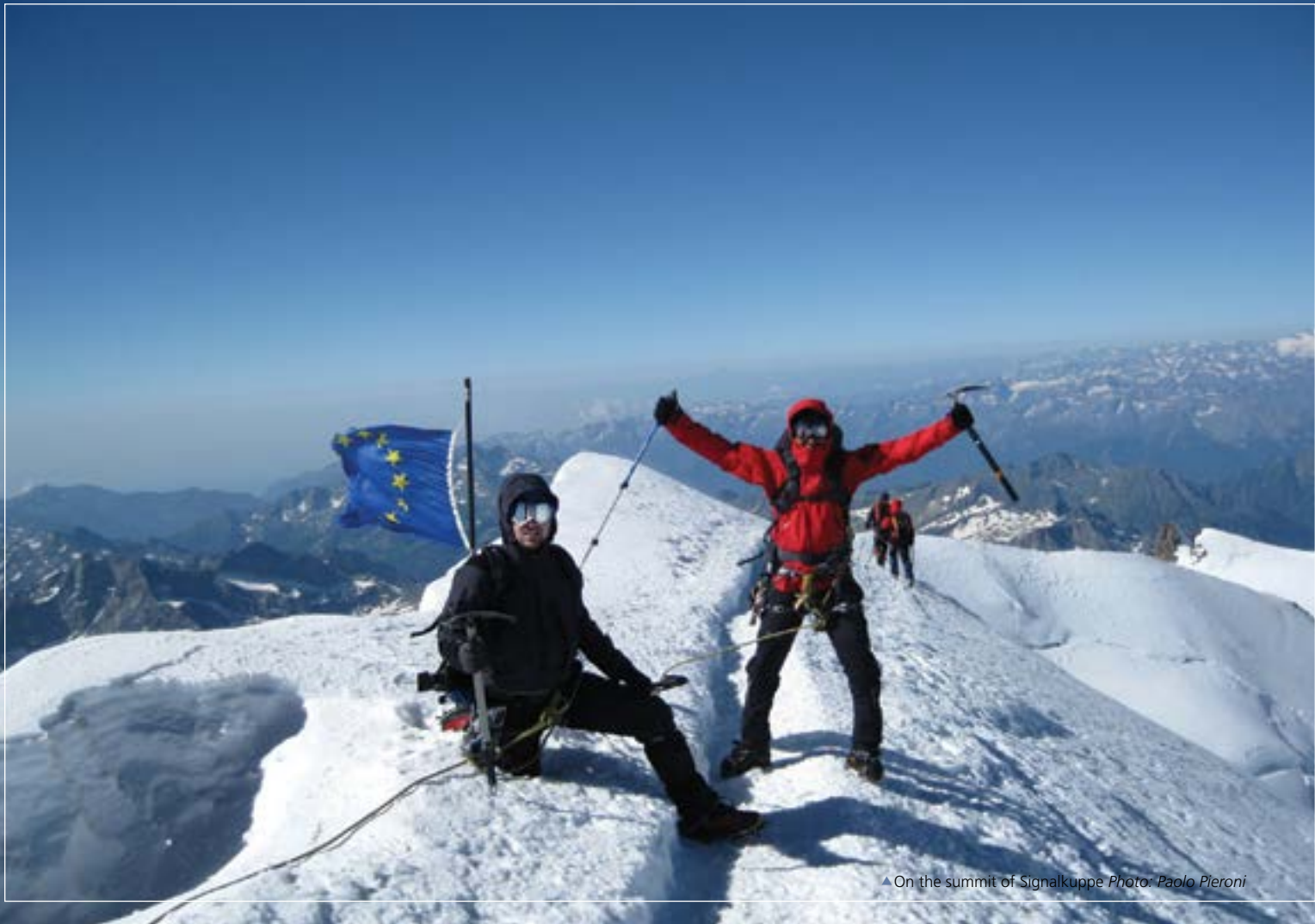
▲ On the summit of Signalkuppe