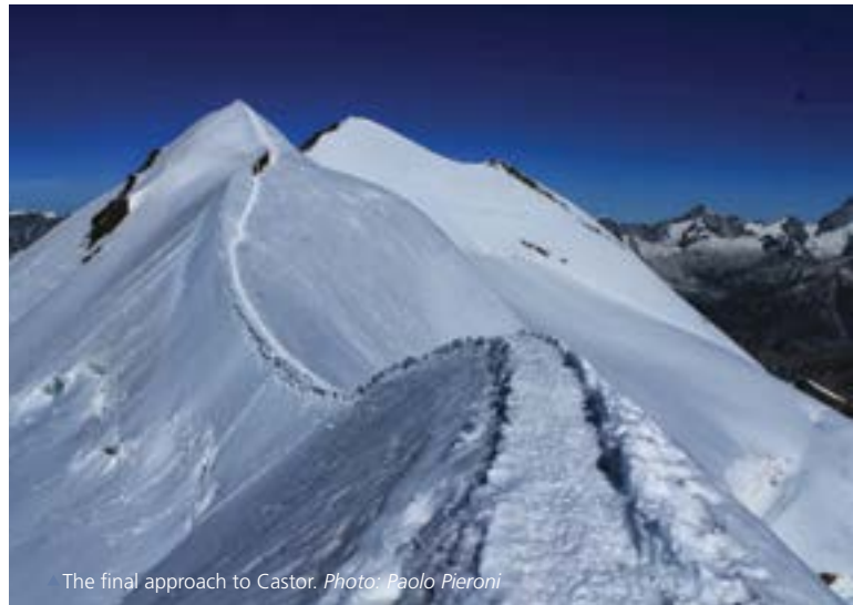
The final approach to Castor.

costs at the time of booking as this option must be reserved in advance.