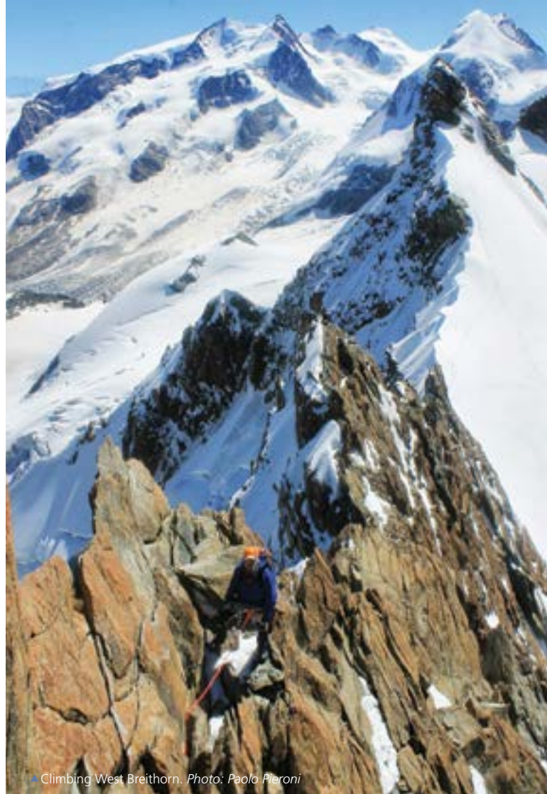
▲ Climbing West Breithorn.

Being a technically proficient climber alone is not enough to work with us; our standards demand that trip leaders are great guides with good people skills as well. You will find your guide friendly, approachable and focused on providing a safe and enjoyable trip in line with your objectives and comfort level. Success with the highest margin of care is always a hallmark of our approach; promoting the realisation that even extreme pursuits such as high-altitude mountaineering can be undertaken safely.