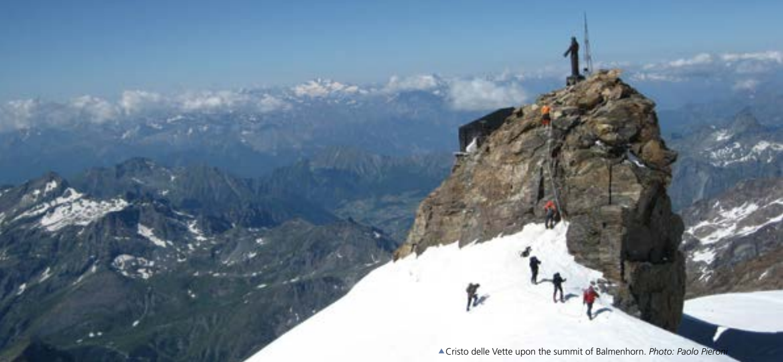
▲Cristo delle Vette upon the summit of Balmenhorn.