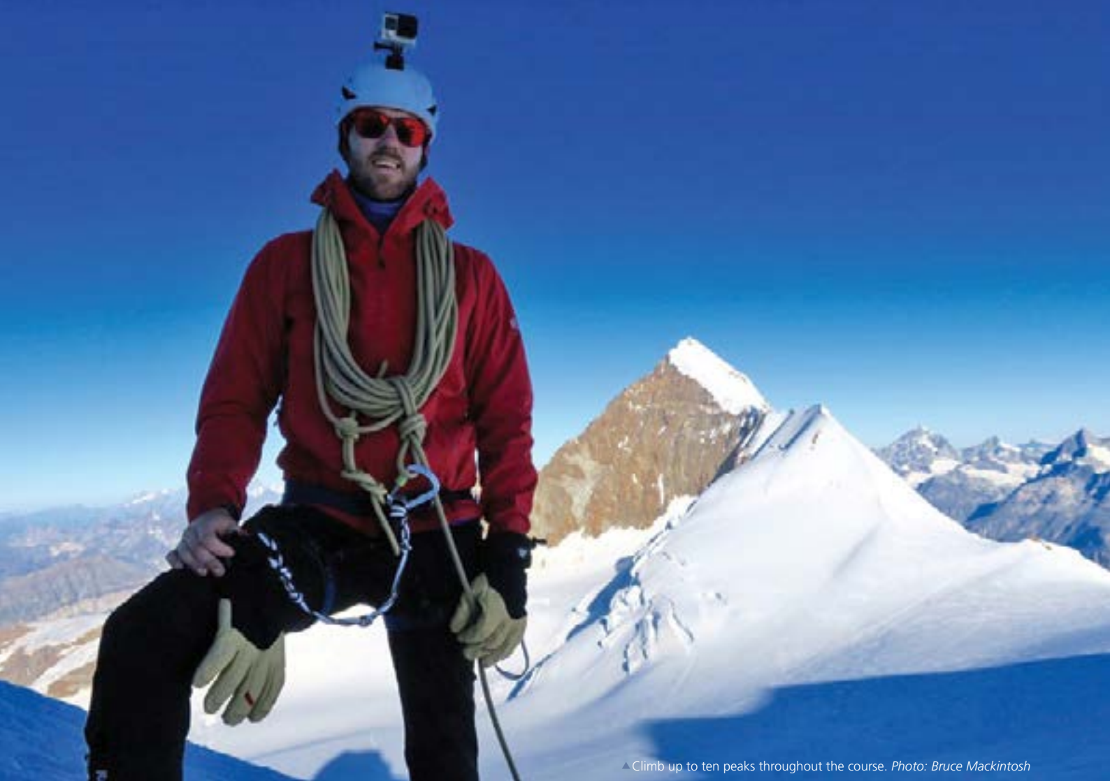
▲Climb up to ten peaks throughout the course.

You should bring a selection of your favourite snack food and hydration drinks with you to ensure you are fuelled for by your preferred brands, as well as money for lunches and snacks whilst in the mountains. Actual amounts depend on your consumption but two per day in addition to your lunch would seem reasonable.