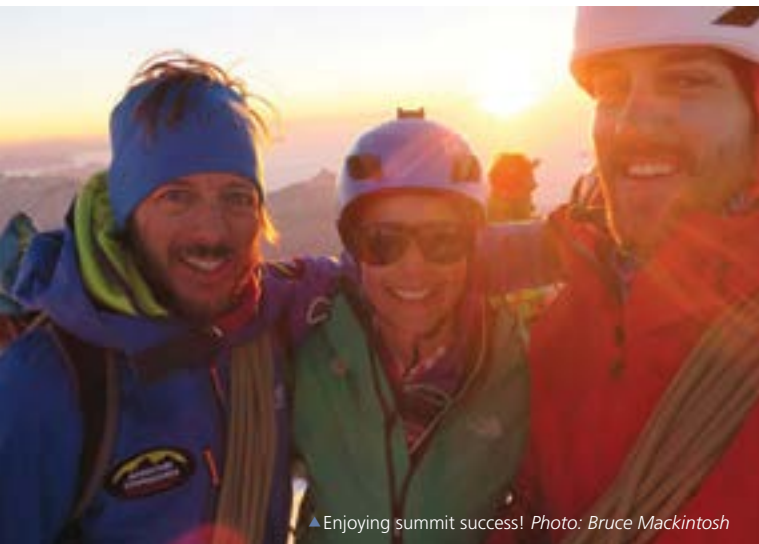
▲ Enjoying summit success!