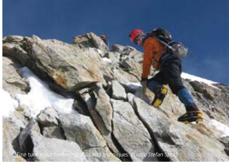
▲ Fine tune mountaineering skills and techniques.