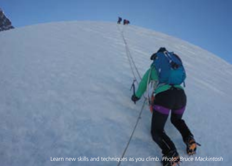
Learn new skills and techniques as you climb.