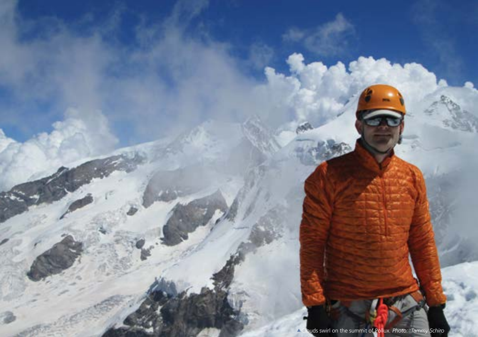
▲ Clouds swirl on the summit of Pollux.