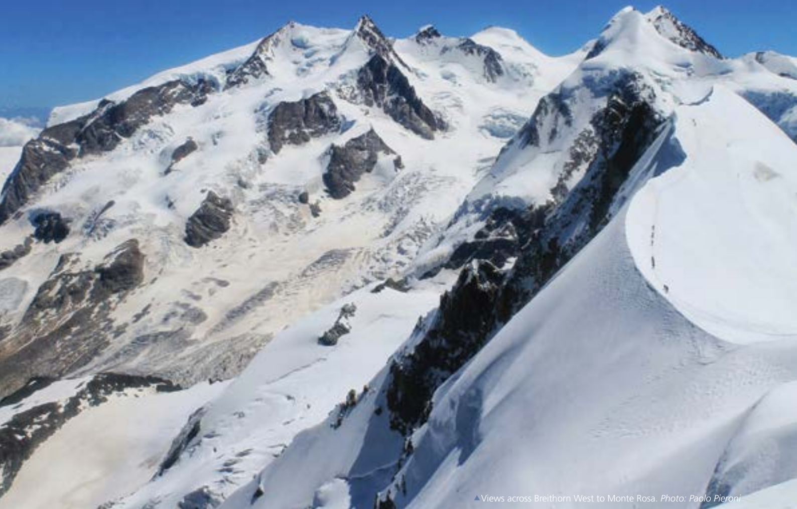
▲ Views across Breithorn West to Monte Rosa.

to Courmayeur, Italy. We take the Monte Bianco Skyway and spend some time learning or refreshing basic mountaineering skills and techniques. We then traverse the Aiguilles Marbrées, the rocky spires that border Italy and France before overnighing at a Courmayeur Hotel.