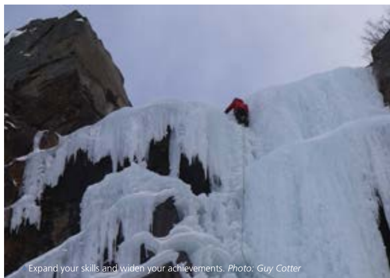
▲ Expand your skills and widen your achievements.