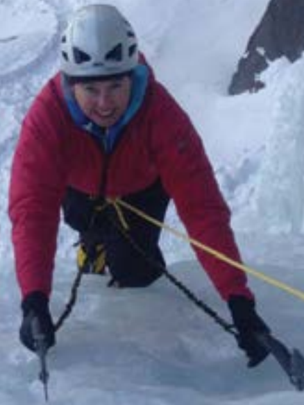
▲ Launch your ice climbing obsession.

Price: €1,890 for 1:1 guide to climber ratio €1,050 each for 1:2 guide to climber ratio