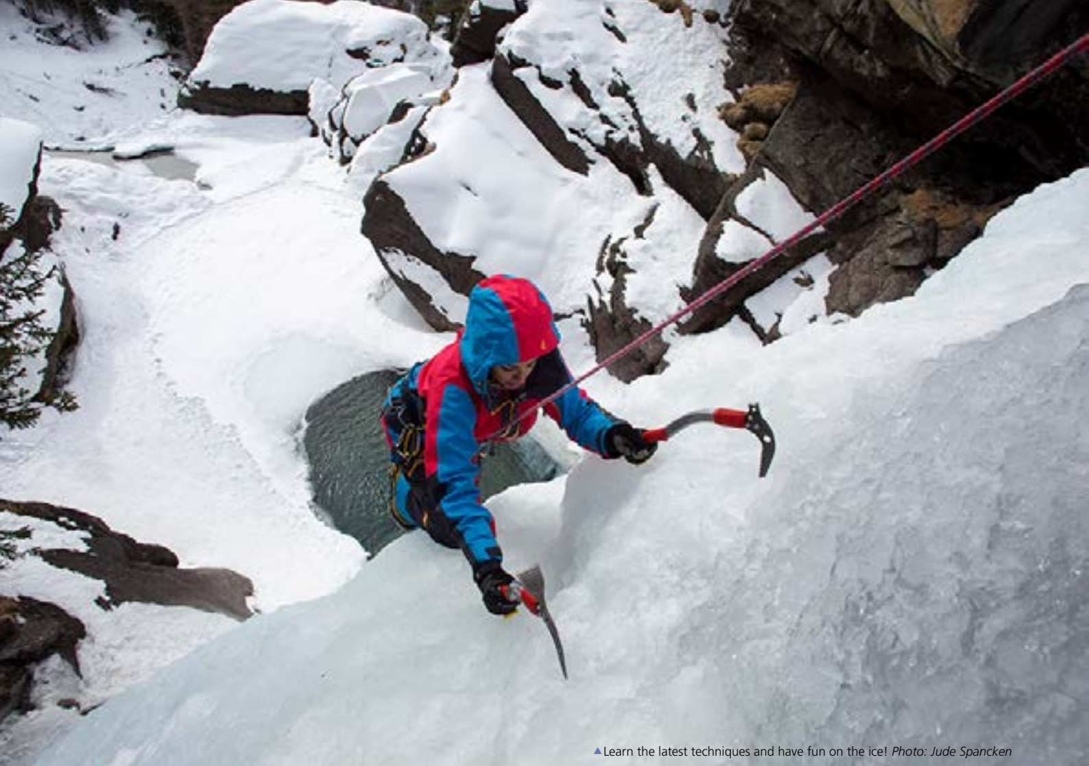
▲ Learn the latest techniques and have fun on the ice!