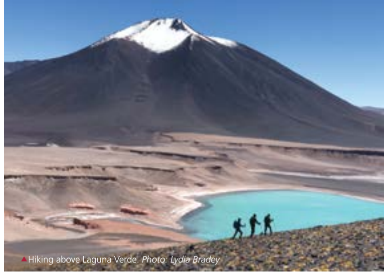
▲ Hiking above Laguna Verde.