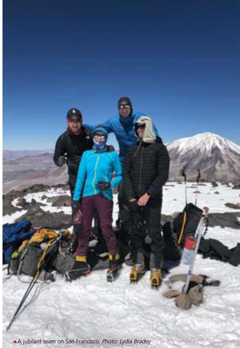
▲ A jubilant team on San Francisco.

your needs and how this will work in the group cooking situation. If your dietary requirements are especially strict, you are advised to bring a sufficient supply of your required food types with you to ensure you are provided for.