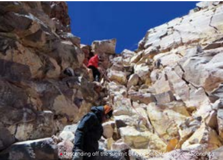
▲ Descending off the summit of Ojos del Salado.