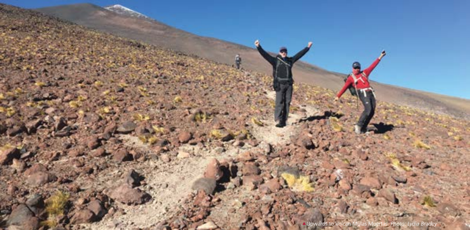
▲ Upwards to Volcan Mulas Muertas.