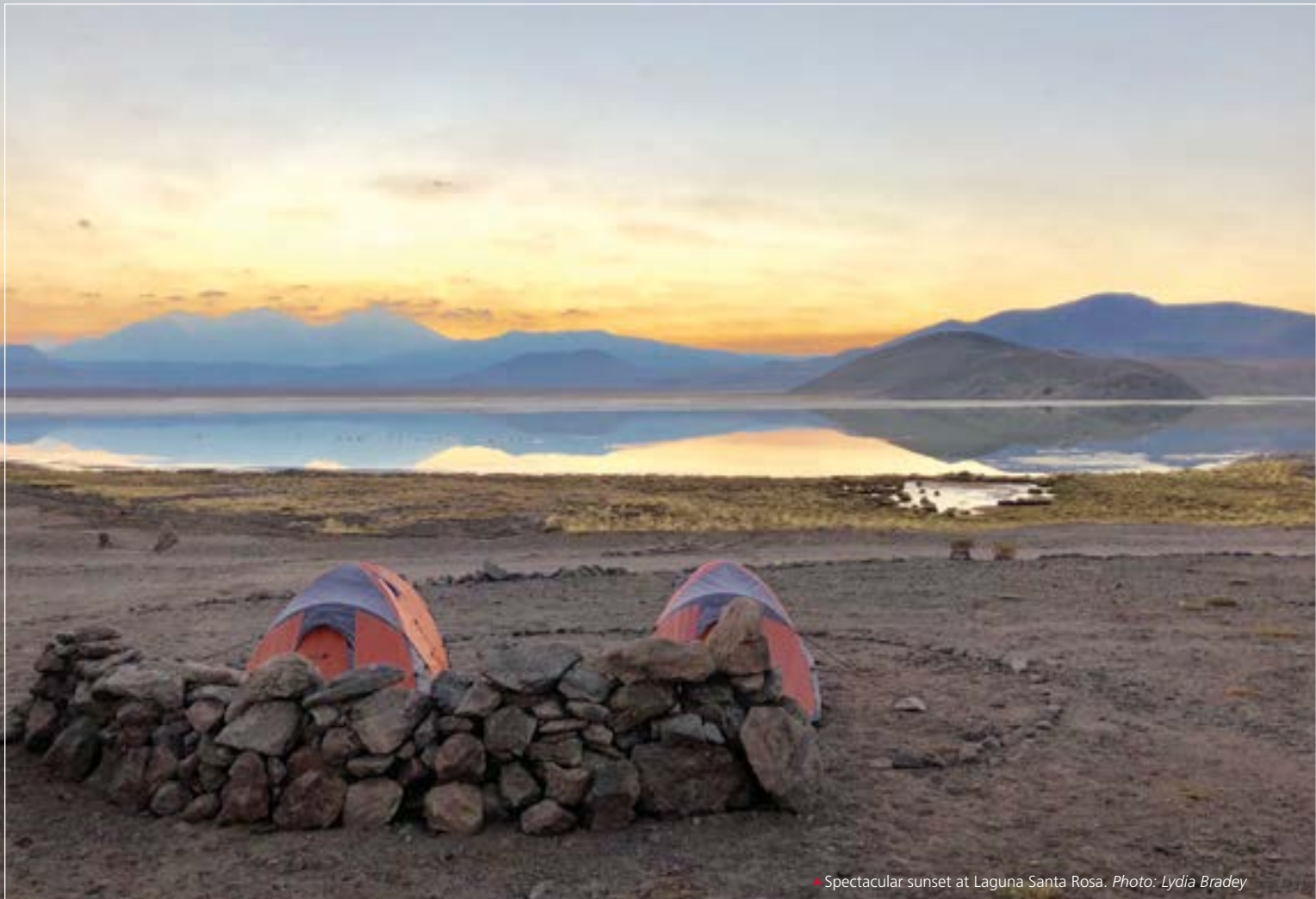
• Spectacular sunset at Laguna Santa Rosa.