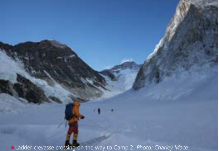
We recognise that no amount of finely tuned organisation will guarantee anyone the summit of Mount Everest. However, we do believe that our experience, combined with your enthusiasm and determination, will provide you with the best possible chance of standing on top of the world. Our track record on Everest is unmatched with 360 summits to date!