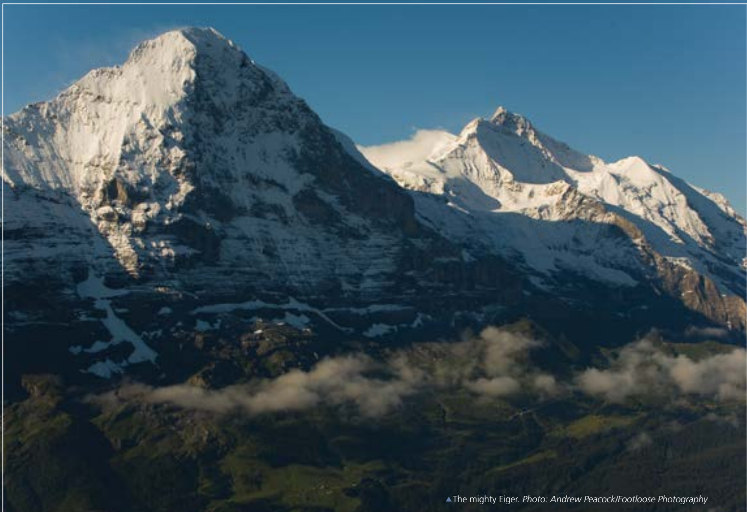
▲ The mighty Eiger.