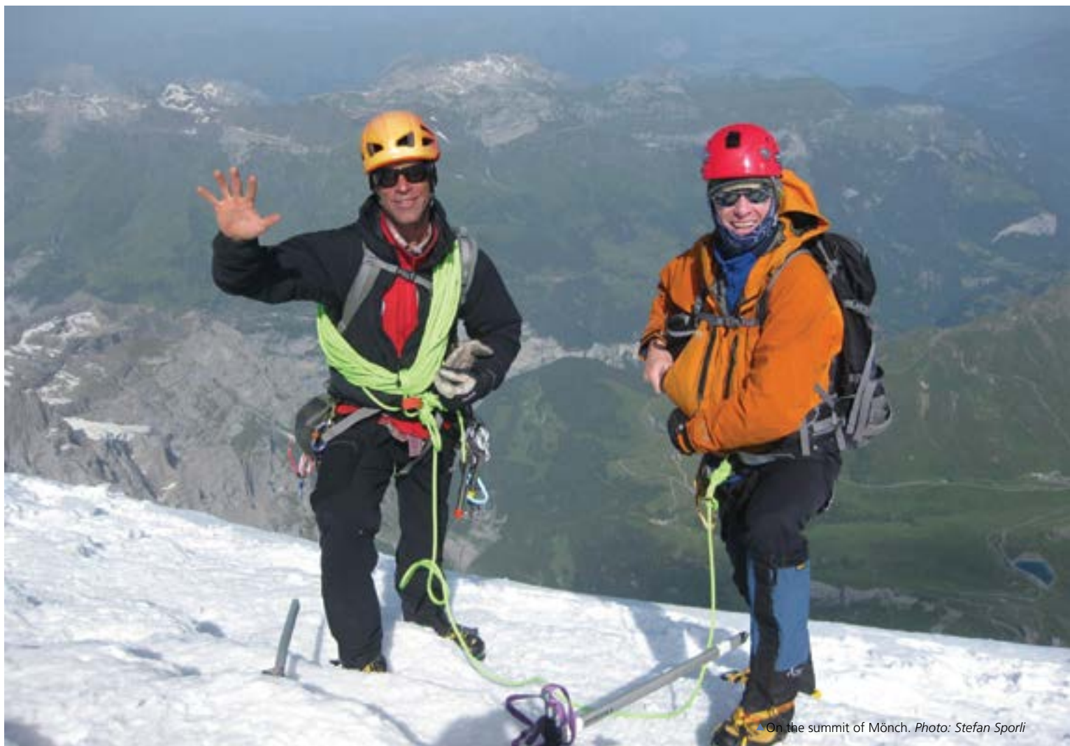
On the summit of Mönch.

We programme the trip to include the necessary acclimatisation before making an ascent at this altitude. We consider it vital that you work closely with your guide throughout the week to develop the appropriate level of communication and trust to collectively make the ascent as a partnership of two people on a rope. Extra days can be added to the programme for additional acclimatisation and preparation by signing up for our 2-Day Europe Pre-Course & Acclimatisation Programme.