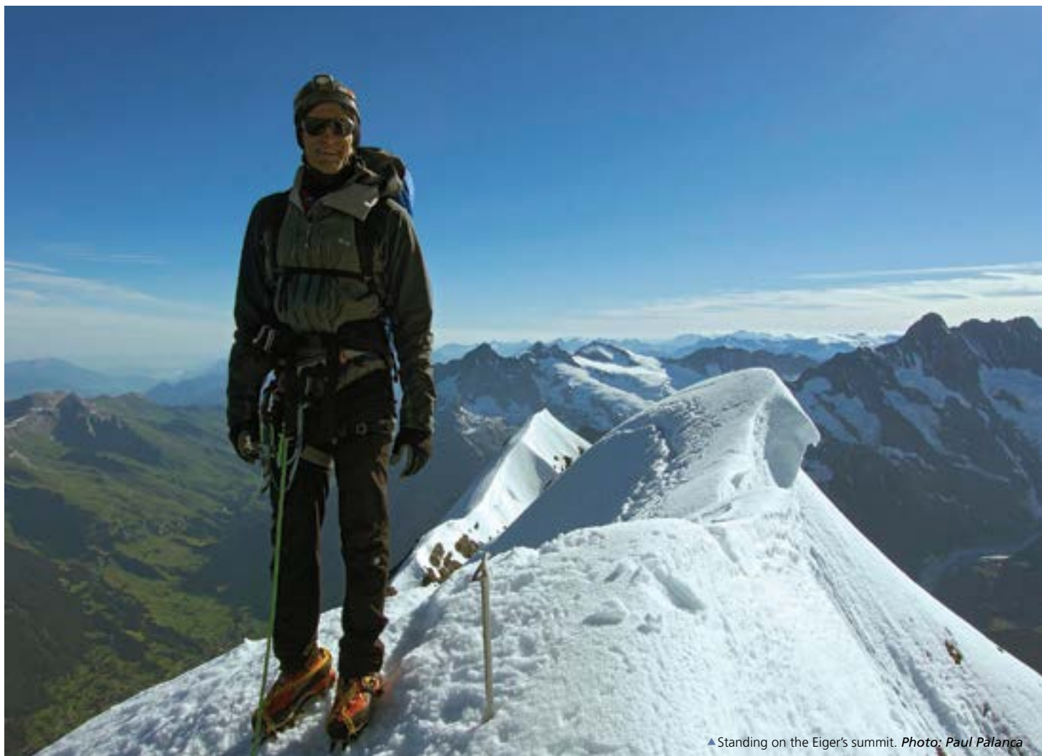
▲ Standing on the Eiger's summit.