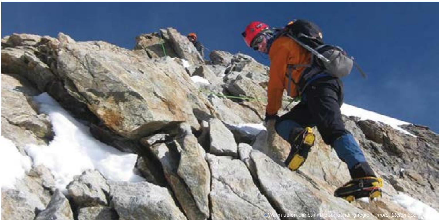
▲ Warm up on climbs in the surrounding region.