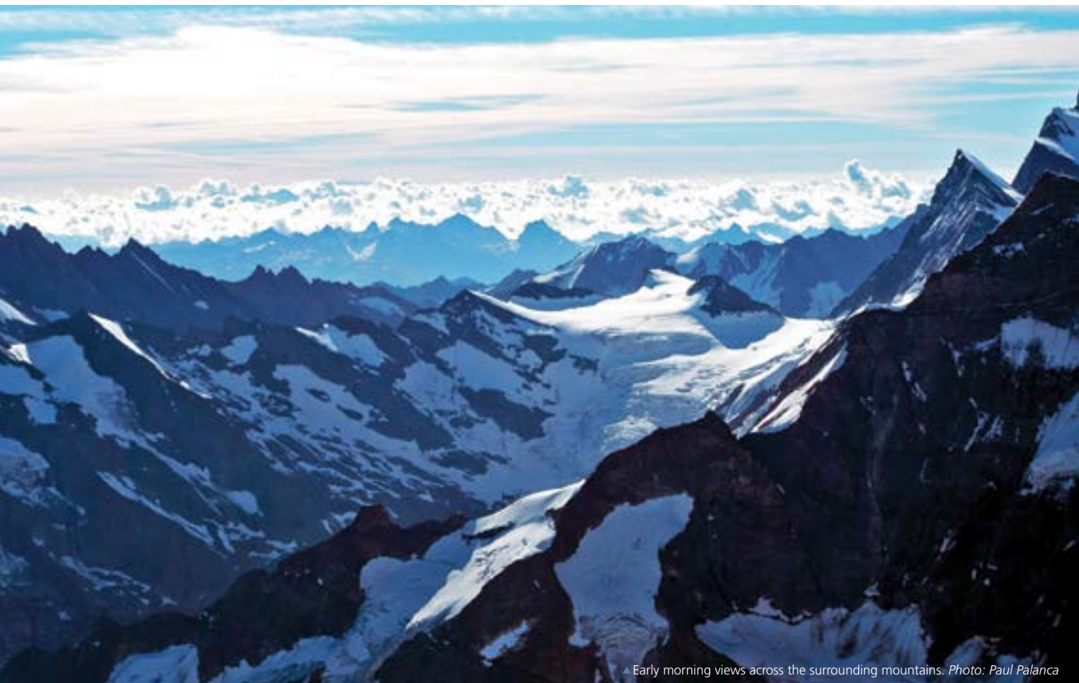
▲ Early morning views across the surrounding mountains.

To confirm your place on one of our Eiger Guided Ascents, we require a completed registration form with a deposit of €500.