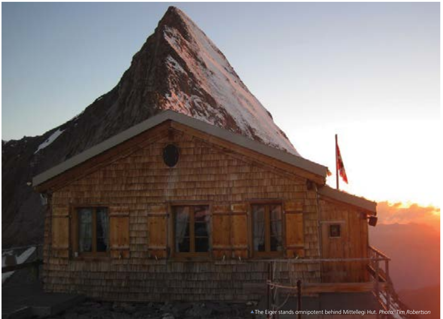
▲ The Eiger stands omnipotent behind Mittellegi Hut.