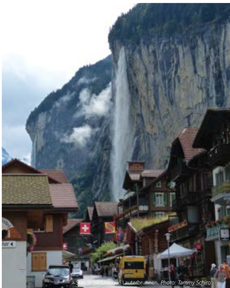
▲ Stay in picturesque Lauterbrunnen.