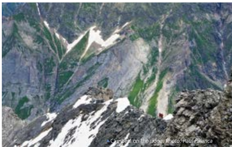
▲ Climbers on the ridge.

You will be sent an equipment checklist on confirmation of your booking. Your guide will go through this with you at the beginning of your trip. You can rent technical equipment for the climb, but you must provide your own mountaineering clothing as per the equipment list. Actual equipment taken may vary subject to seasonal weather and route conditions. Group equipment, including ropes and technical hardware, will be provided by your guide.